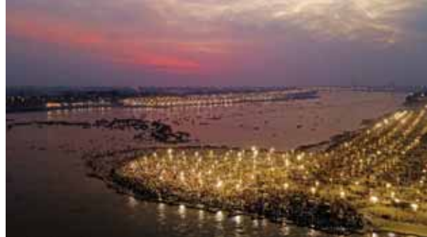
The Sangam area illuminated on the eve of Mahashivratri festival during the ongoing Maha Kumbh Mela 2025 in Prayagraj.

Pilgrims thronging river banks through the clock, vendors selling 'puja' ware and security staff everywhere to manage the crowds converging at confluence point — the Triveni Sangam is where the lines between day and night blur. From morning till dusk and midnight till dawn, the cycle of spiritual bathing at the mega gathering of humanity in this holy city goes on without a break. The religious festival, billed to be the largest gathering of people in the world, ends on Wednesday with the final