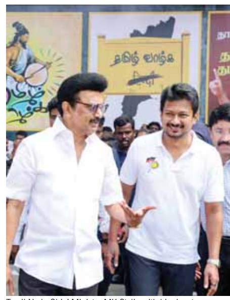
Tamil Nadu Chief Minister MK Stalin with his deputy Udayanithi Stalin and others at the opening of 'Kalaingar Centenary Boxing Academy' in Chennai.

DMK president and Tamil Nadu Chief Minister MK Stalin on Tuesday accused the Centre of 'sowing the seeds of language war' by thrusting Hindi upon the State and said the domination of that language will not be allowed. Addressing media, Stalin said that DMK is ready for another language war. Though the state was not against any language in particular and would not come in the way of anyone desiring to learn any language, it was determined not to allow any other language to dominate and destroy the mother tongue Tamil, he said. "This is the reason why we are adhering to the bilingual policy (of Tamil and English)," said Stalin in a letter addressed to his party workers. Many states in India including the neighbouring states have realised the path laid down by Tamil Nadu on language policy and its firm stance, and they started to express