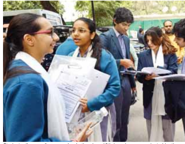
Students discuss after appearing in the class 12th board exam conducted by the CBSE. File Photo

PTI ■ NEW DELHI The Central Board of Secondary Education (CBSE) on Tuesday approved draft norms for conducting Class-10 board exams twice a year from 2026, officials said. The draft norms will now be put in the public domain and the stakeholders can submit their feedback till March 9 following which the policy will be finalised, they said. As per the draft norms, the first phase of the exams will be conducted from February 17 to March 6, while the second phase will be conducted from May 5 to 20. "Both the examinations will be conducted on full syllabus and the candidates will be