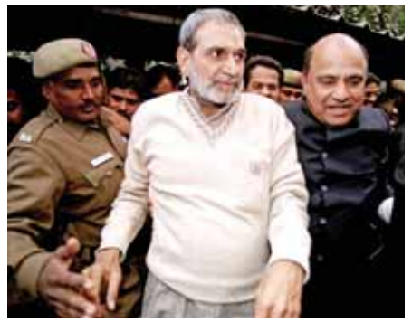
Congress leader Sajjan Kumar.