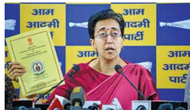
AAP leader Atishi addresses press conference in New Delhi

The Delhi BJP chief said the report has exposed the "loot, corruption, and deception" of the previous AAP government over the past decade. He alleged the Kejriwal administration had been deliberately withholding the report to conceal financial irregularities. But with its release, the truth is now out in the open,