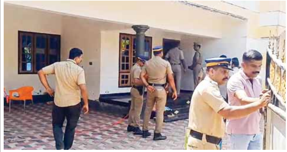
Police investigate the crime scene after a 23-year-old man allegedly killed five people, including four of his close family members in Thiruvananthapuram

contract cannot be read to mean that the MMRDA has a license to act unfairly, arbitrarily or unreasonably in the contractual field without assigning reasons," the court said, asking the MMRDA to take a fresh decision after hearing the company. Sena (UBT) leader and former minister Aadiya Thackeray targeted Deputy Chief Minister Eknath Shinde - who heads the rival Shiv Sena - over the issue. The MMRDA comes under Shinde's Urban Development department. "The mind the regime scams are coming out. We have been raising many since 2022 mid. While India and France get closer diplomatically, the @MMRDAOfficial run by Eknath Shinde's Urban Development department, rubbishes concerns of corruption raised by the French consultant," he said. "I urge @CMOMaharashtra to launch an open, free and fair inquiry into this issue. Find out the source of corruption- which character close to corrupt mantri indulged in this?" Thackeray added.