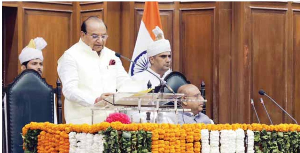
Delhi LG VK Saxena addresses the first session of eighth Legislative Assembly

"In the next five years, my government will give extensive emphasis to the 10 key areas. My government will adopt the Viksit Delhi' resolution as a policy document and will move forward in the direction of fulfilling the promises made to the common people as well as meeting their expectations. This policy document will be the top priority of the present government. In this regard, all the department heads have been instructed to prepare a