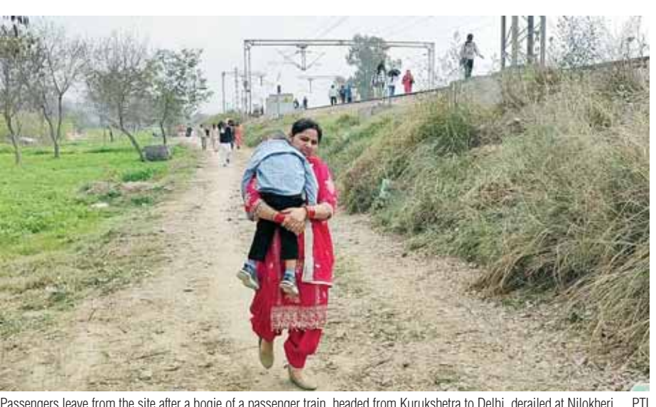
Passengers leave from the site after a bogie of a passenger train, headed from Kurukshetra to Delhi, derailed at Nilokheri.

■ CHANDIGARH The bogie of a passenger train derailed at Nilokheri in Haryana's Karnal district on Tuesday though all the passengers were reported safe, officials said. The passenger train was headed from Kurukshetra to Delhi when the incident took