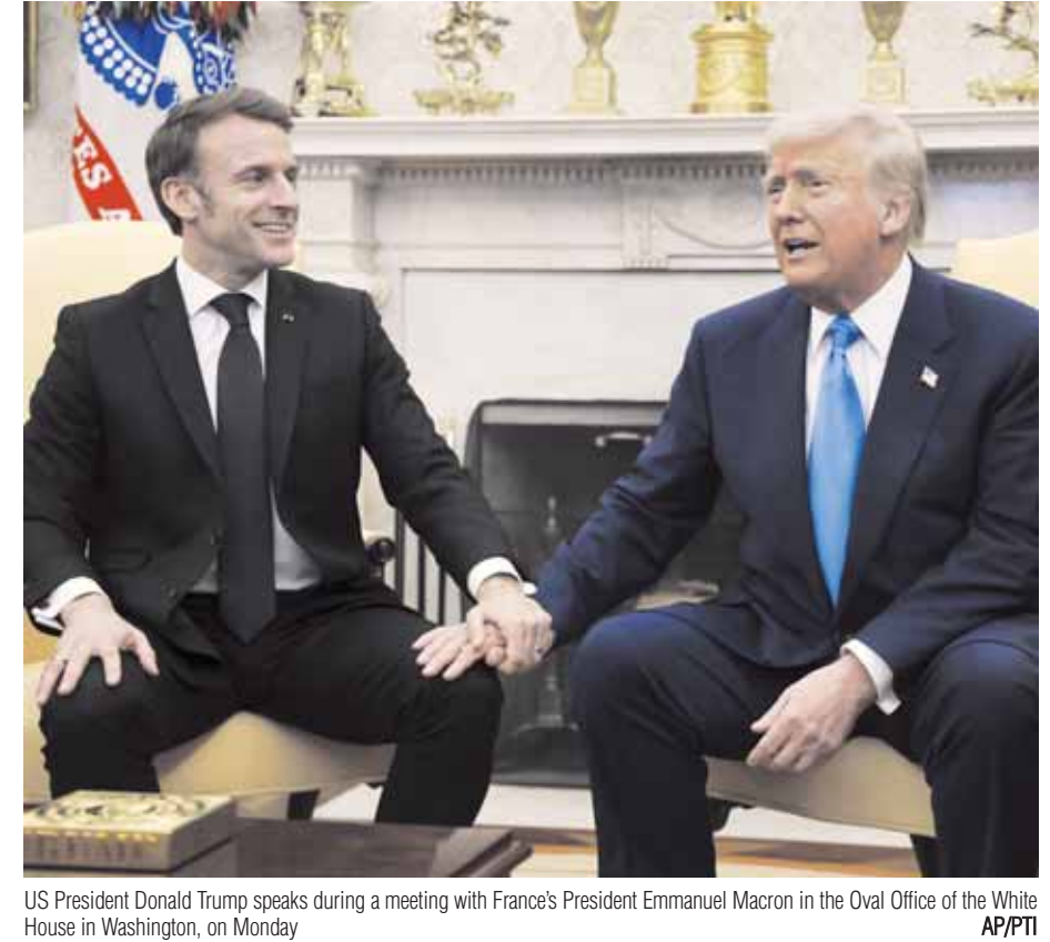
US President Donald Trump speaks during a meeting with France's President Emmanuel Macron in the Oval Office of the White House in Washington, on Monday