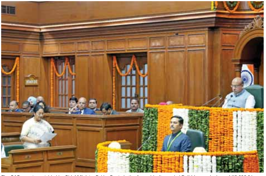
The CAG report was tabled by Chief Minister Rekha Gupta in the Assembly. It revealed Delhi incurred a loss of ₹2,026.91 Crore because of irregularities in the implementation of the now-scrapped excise policy in 2021-22.

Exposing a string of wrong decisions and omissions, a report by the Comptroller and Auditor General (CAG) has revealed the Delhi government incurred a massive loss of ₹2,026.91 Crore because of alleged irregularities in the implementation of the now-scrapped excise policy in 2021-22. Titled 'Performance Audit on Regulation and Supply of Liquor in Delhi', (Audit Report No 1 of the year 2024)", the CAG report is one of 14 on the previous Aam Aadmi Party (AAP) government's performance, which was tabled in the Delhi Assembly by the new Rekha Gupta-led dispensation. The report also flagged violations in the process of issuing licences. AAP leaders, including then chief minister Arvind Kejriwal and former deputy chief minister Manish Sisodia, were arrested in the case lodged by the Central Bureau of Investigation (CBI) and the Enforcement Directorate (ED). The report estimated a revenue loss of ₹941.53 Crore, citing failure to obtain timely permissions for opening liquor vents in non-conforming municipal wards — areas not designated for liquor sales under zoning laws. This led to a significant financial impact on the Delhi government's earnings. Additionally, the Excise Department lost ₹890.15 Crore due to surrender of licences and the department's failure to re-tender liquor zones. The report also flagged an irregular waiver of ₹144