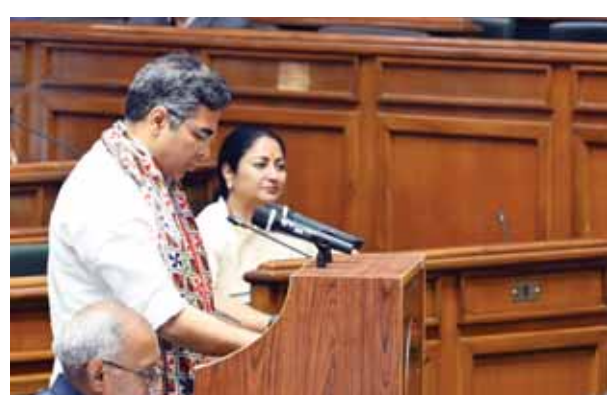
Delhi Deputy Chief Minister Parvesh Verma