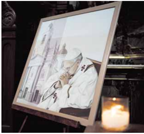
A candle glimmers alongside a painting of Pope Francis at San José de Flores basilica, Buenos Aires, Argentina, where he worshipped as a youth.

PTI ■ ROME Pope Francis woke up and was continuing his therapies on Monday after a quiet night, on the 10th day of his hospitalisation for a complex lung infection that has provoked the early stages of kidney insufficiency, the Vatican said. "The night passed well, the pope slept and is resting," it said. A medical bulletin was expected later Monday. He is continuing to feed himself and is not receiving artificial or liquid nutrition, the Vatican said. Late Sunday, doctors reported that blood tests showed "early, slight kidney insufficiency" that was nevertheless under control. They said Francis, 88, remained in critical condition but that he hadn't experienced any further respiratory crises since Saturday. He was receiving high flows of supplemental oxygen and, on Sunday, was alert, responsive and attended Mass. They said his prognosis was guarded.