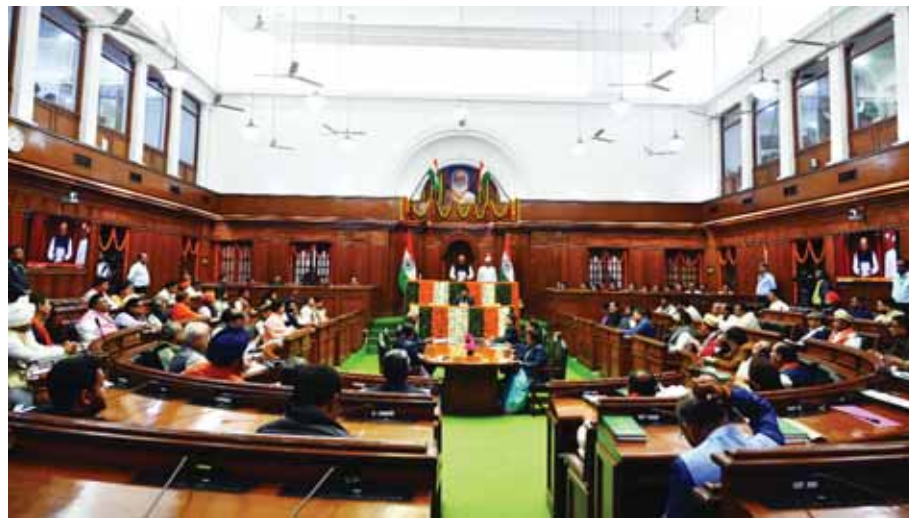
First day of Delhi Legislative Assembly session in New Delhi

Audit Report of the year ended March 31, 2022. A key report under scrutiny pertains to the renovation of the chief minister's official residence at 6, Flag Staff Road, termed as 'Sheesh Mahal' by the BJP. The audit has reportedly uncovered large-scale irregularities in the project's planning, tendering and execution. Initially sanctioned at ₹7.61 Crore in 2020, the cost escalated to ₹33.66 Crore by April 2022 - an increase of 342 per cent. According to preliminary report of the CAG report on the scrapped excise policy pointed out irregularities which resulting in a loss of ₹2,027 Crore to the state exchequer. The evaluation covered the period from 2017-18 to 2020-21 and criticised the functioning of the excise department. The report also found irregularities in the new excise policy for 2021-22, which had been a point of focus in earlier investigations by the Enforcement Directorate (ED) and Central Bureau of Investigation (CBI). The other long-pending CAG