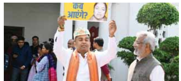
AAP MLAs stages protest outside the office of Delhi Chief Minister Rekha Gupta on Monday

STAFF REPORTER ■ NEW DELHI The Aam Aadmi Party (AAP) MLAs led by Leader of Opposition (LoP) Atishi staged a protest outside the office of Delhi Chief Minister Rekha Gupta in the assembly's premises on Monday, demanding the fulfilment of the BJP's promise to provide ₹2,500 to women in the city after the first Cabinet meeting. During the protest, AAP MLAs raised slogans and waving posters that "When will women get ₹2500?". Atishi also met Chief Minister Rekha Gupta to discuss the issue but received no assurance from her. "We asked for time from the Delhi Chief Minister two days ago. But we were not given time, so we are here outside her office in the assembly. We want to meet her regarding the promise of PM Modi to provide ₹2,500 to women after the first Cabinet," Atishi said after meeting Chief Minister Rekha Gupta. Atishi stated that the BJP and Prime Minister Narendra Modi had guaranteed in their first cabinet meeting that a scheme providing ₹2500 per month to women would be passed. "However, despite the BJP gov-