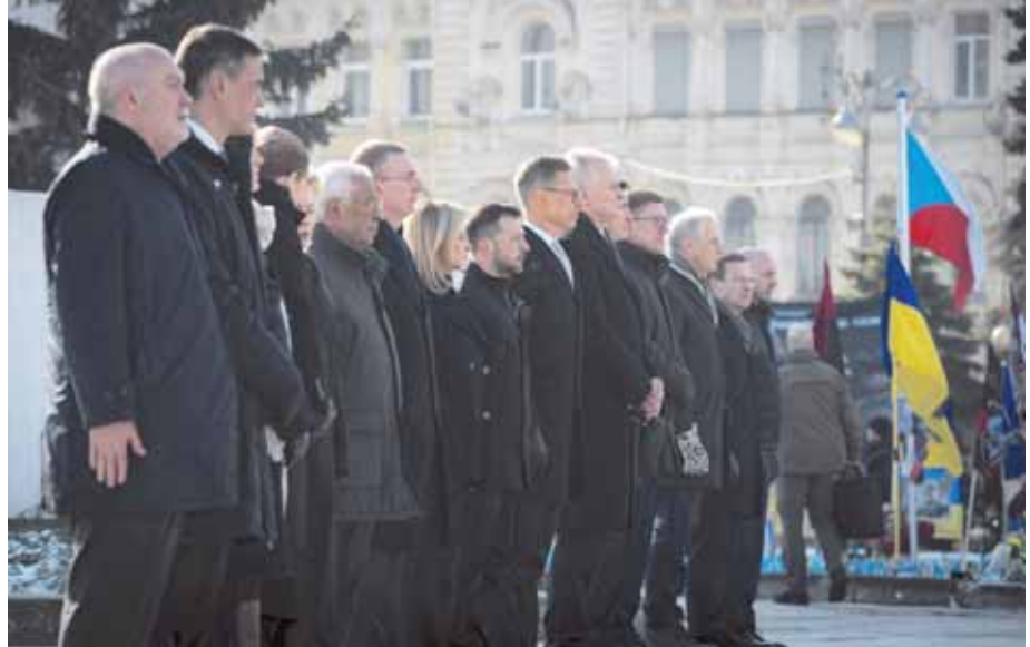
European leaders attending the ceremony at the memorial to the fallen Ukrainian soldiers on Independence Square in Kyiv, Ukraine, on Monday.