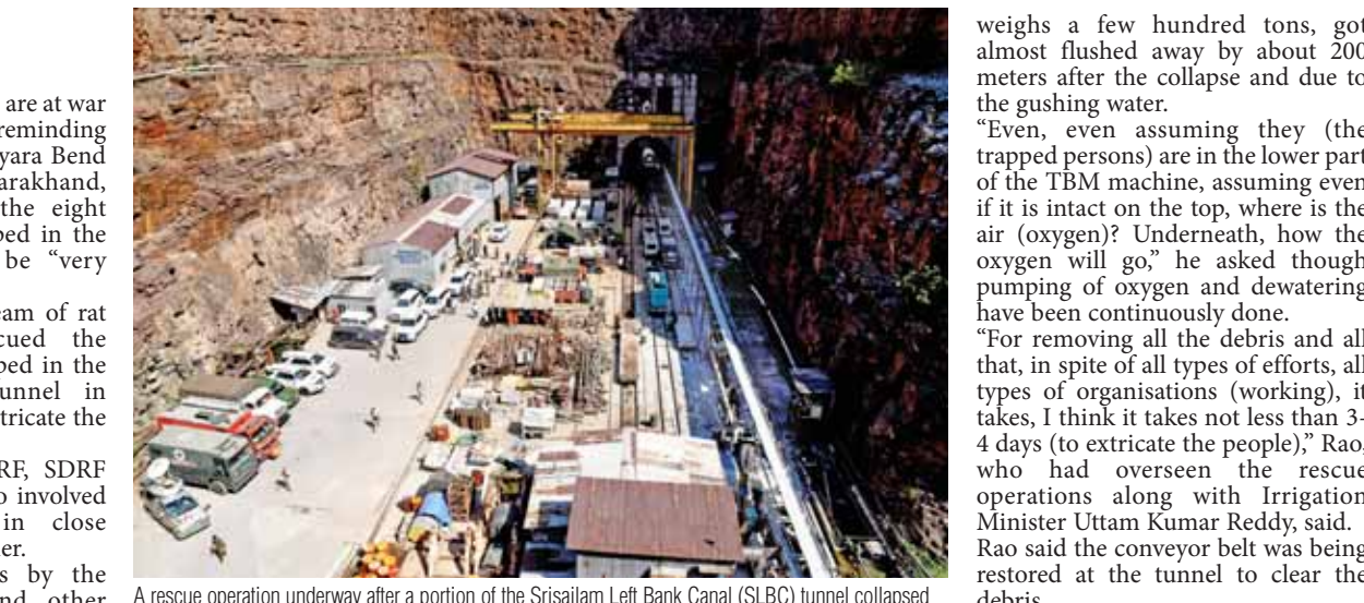
A rescue operation underway after a portion of the Srisailem Left Bank Canal (SLBC) tunnel collapsed in Nagarkurnool district

Even as multiple agencies are at war footing in Telangana reminding their efforts in 17 days Silkyara Bend rescue operation in Uttarakhand, chances of survival of the eight persons who remain trapped in the SLBC tunnel seems to be "very remote". The latest to join are a team of rat miners, who had rescued the construction workers trapped in the Silkyara Bend-Barkot tunnel in Uttarakhand in 2023, to extricate the men. Indian Army, Navy, NDRF, SDRF and other agencies are also involved in rescue operations in close coordination with each other. Despite relentless efforts by the Indian Army, NDRF and other agencies, no breakthrough has been achieved so far in the rescue operations to extricate the eight persons who have remained trapped for over 48 hours inside the tunnel after a section of it collapsed in the Srisailem Left Bank Canal (SLBC) project in Telangana's Nagarkurnool district on Saturday. The persons who have been trapped in the collapsed tunnel for the past over 48 hours have been identified as Manoj Kumar and Sri Niwas from Uttar Pradesh, Sunny Singh (Jammu and Kashmir), Gurpreet Singh (Punjab) and Sandeep Sahu, Jegta