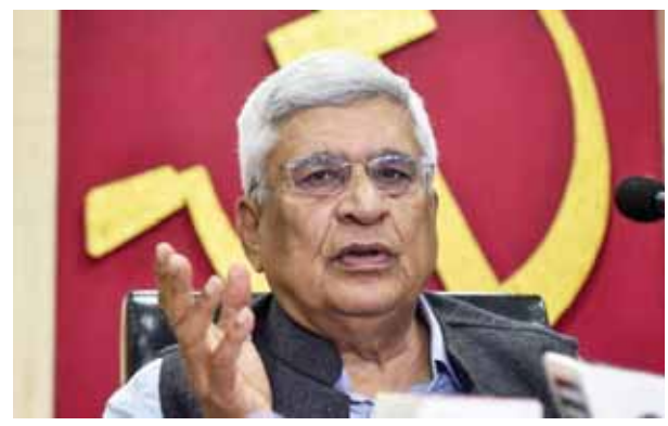
Leader Prakash Karat CPI (M) File photo

Changing its stand, the CPI(M) has issued a note to its State units on the draft political resolution for the upcoming Party Congress. The note says the party does not consider the Narendra Modi Government or the Indian State as "neo-fascist", even as there are manifestations of "neo-fascist characteristics". The note sent to the State units of the Communist Party of India (Marxist) also stresses that the position is different from that of other Left parties, such as the Communist Party of India (CPI) and the Communist Party of India (Marxist-Leninist) Liberation. The CPI has characterised the BJP-led Centre as a fascist government, while the CPI(M) has said an "Indian fascism" has been put in place. The CPI(M)'s note says the political resolution talks about the danger of the Hindutva-corporate authoritarianism going towards neo-fascism, if the BJP-RSS is