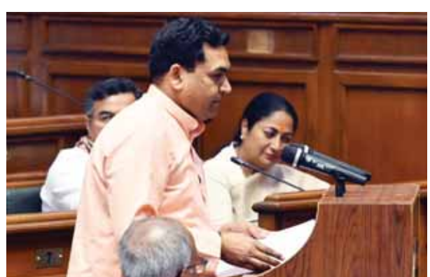
Delhi minister Kapil Mishra