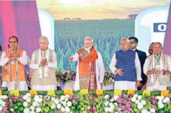
Prime Minister Narendra Modi with Bihar Governor Arif Mohammed Khan, Union Minister Shivraj Singh Chouhan and Chief Minister Nitish Kumar during the release of the 19th installment of the PM Kisan Samman Nidhi (PM-KISAN) scheme and launch of various development projects in Bhagalpur

PUBLISHED FROM: DELHI | LUCKNOW | BHOPAL | BHUBANESWAR | RANCHI | RAIPUR | CHANDIGARH | DEHRADUN | HYDERABAD | VIJAYWADA