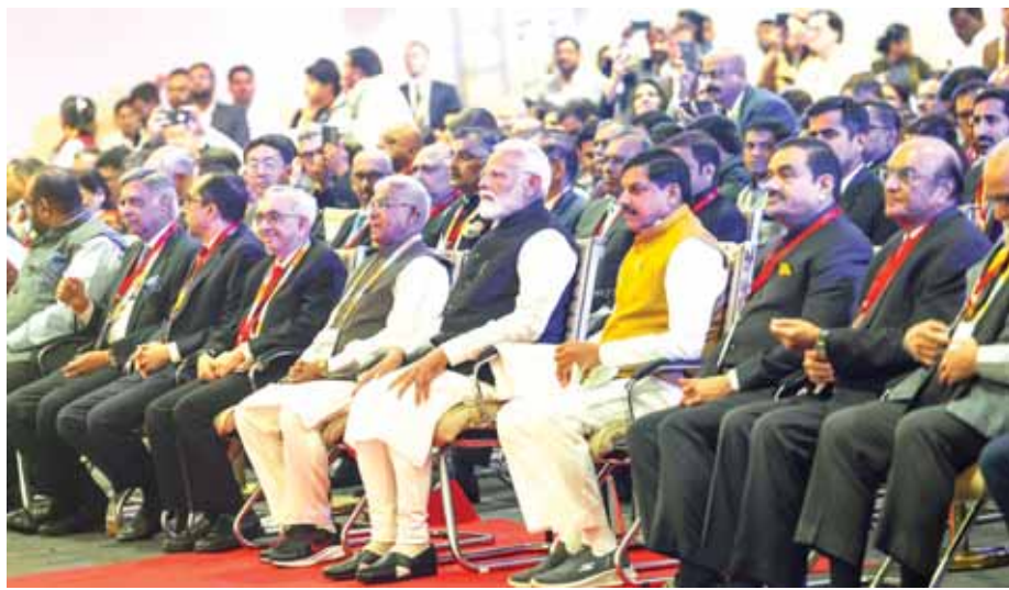
PM Narendra Modi with Madhya Pradesh CM Mohan attends the Global Investors Summit 2025 in Bhopal

Prime Minister Narendra Modi on Monday said with a strong talent pool and thriving industries, Madhya Pradesh is becoming a preferred business destination and that this is the time, and right time, to invest in the state. He was speaking after inaugurating the mega 'Invest Madhya Pradesh - Global Investors Summit-2025' at the Indira Gandhi Rashtriya Manav Sangrahalaya, located near the picturesque Upper Lake in Bhopal, to showcase the state's infinite possibilities for investors and industrialists. Modi said the World Bank has expressed confidence that India will continue to be the world's fastest growing economy in the coming years. The World Bank recently said in its Global Economic Prospects report that India will remain the fastest-growing major economy for next two years. Modi also said the Deregulation Commission will help create investment-friendly regulatory