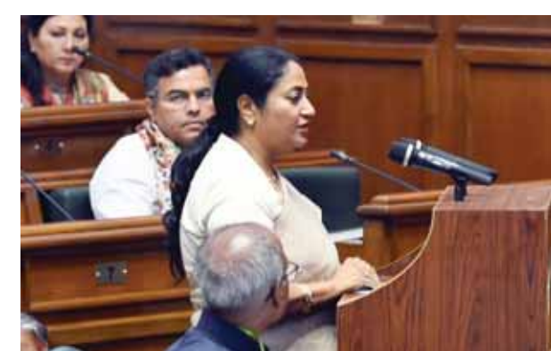
Delhi Chief Minister Rekha Gupta takes oath on the first day of the Assembly session

used these findings to target former Chief Minister Arvind Kejriwal, alleging misuse of public funds. Delhi Lieutenant Governor Vinai Kumar Saxena had previously raised concerns over the non-disclosure of these reports and had urged the legislative assembly to convene a special session in December last year. However, the reports were not presented during the AAP's tenure, leading to growing demands for their release. BJP leader Vijender Gupta, who was a vocal critic of the AAP government's handling of the CAG reports as the Leader of Opposition in the last assembly and had been marshalled out of the Assembly in the past for demanding their tabling, now presides as the Speaker. With Gupta in charge, the reports are expected to be placed before the House without further delay. As the Delhi Assembly session progresses, the findings of these CAG reports are expected to trigger heated political exchanges between the ruling BJP and the AAP, potentially shaping the political discourse in the national capital in the coming months.