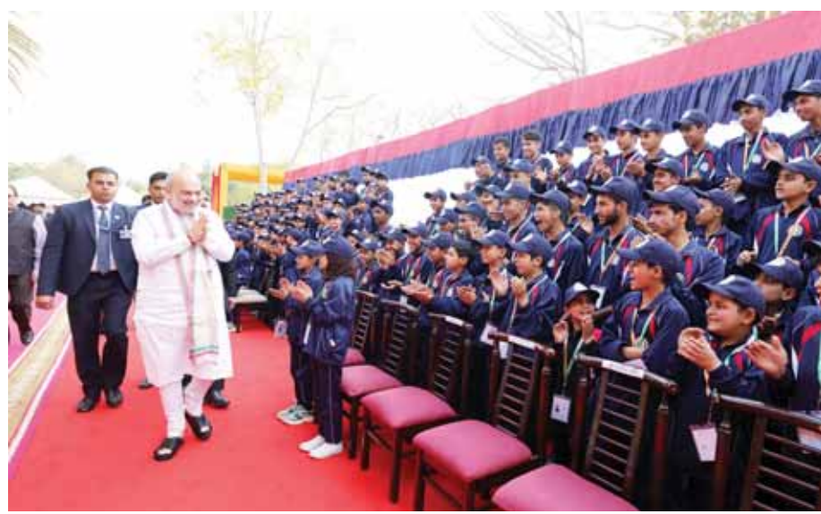
Home Minister Amit Shah interacts with 250 children from weaker sections of Jammu and Kashmir under 'Watan Ko Jano' programme in New Delhi

end, there is no need for the deployment of police and that day is not far, he added. "When there is peace, no police will be required. This message has to be carried by you to your friends, family and villages... when you go home, tell your friends, neighbours that the entire country is living in peace and the people of Jammu and Kashmir should also live in peace," Shah said. There is peace in Jammu and Kashmir and this peace has to be permanent and "our aim is to make a Jammu and Kashmir where no life is lost due to terrorism", he added. "Violence brings nothing. Due to the decades of terrorism in Jammu and Kashmir, 36,000 people lost their lives," the home minister said. Shah said Prime Minister Narendra Modi had made the