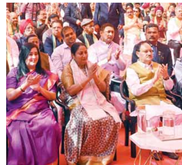
BJP National President JP Nadda Delhi, Delhi CM Rekha Gupta Delhi and others during the PM's Mann Ki Baat