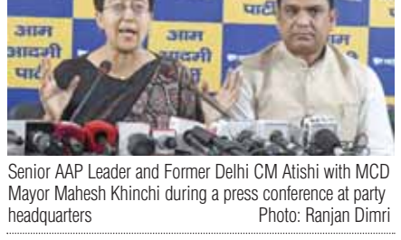
Senior AAP Leader and Former Delhi CM Atishi with MCD Mayor Mahesh Khinchi during a press conference at party headquarters