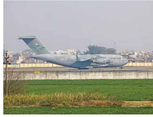
US military aircraft carrying Indian deportees upon its landing at the Shri Guru Ramdas Ji International Airport in Amritsar, on February 5