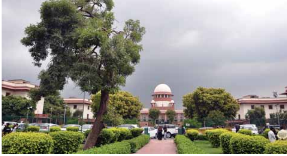
Supreme Court of India