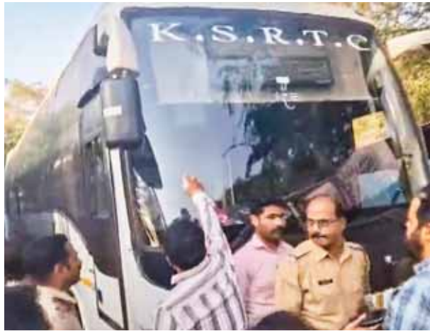
UBT workers stage protest by blackening buses bearing Karnataka number plates after Marathi bus drivers were allegedly assaulted in Karnataka's Belagavi.

Bus services between Karnataka and Maharashtra have been affected due to attack on bus drivers from both sides amid the sudden flare-up of border row in Belagavi in the last two days. The decades-old dispute resurfaced on Friday when a bus driver and a conductor were beaten up for allegedly not speaking in Marathi at Marihal in Belagavi. The bus conductor stated in his police complaint that a girl asked for a ticket in Marathi. When he said he did not know Marathi and asked her to speak in Kannada, she and her male friend attacked him. At Marihal, a group of youths intercepted the bus and beat up the conductor. While police arrested four people for the attack, the conductor has also been booked for 'indecent behaviour' with the minor girl on a