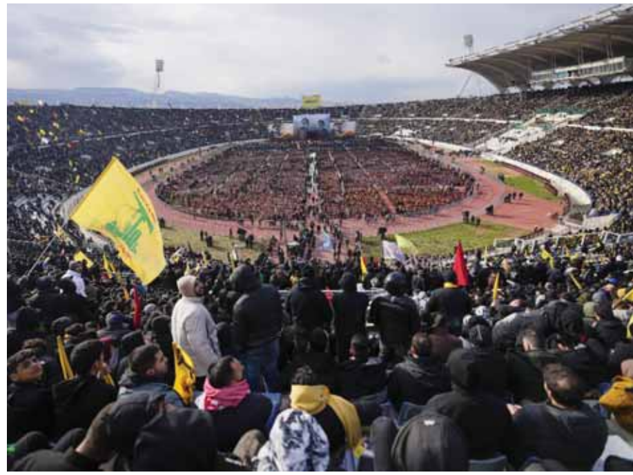
People gather for the funeral ceremony of the Lebanon's late Hezbollah leaders Hassan Nasrallah and Hashem Safieddine at the Sports City Stadium in Beirut, Lebanon, on Sunday