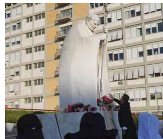
Nuns pray for Pope Francis in front of the Agostino Gemelli Polyclinic, in Rome, on Saturday

platelets, which are needed for clotting, the Vatican said in a late update. The Saturday statement also said that the pontiff "continues to be alert and spent the day in an armchair although in more discomfort than yesterday." Doctors said the prognosis was "reserved." Doctors have said Francis' condition is touch-and-go, given his age, fragility and pre-existing lung disease. His condition has revived speculation about what might happen if he becomes unconscious or otherwise incapacitated, and whether he might resign. Prayers for pope at Vatican: Francis was supposed to have celebrated Mass on Sunday morning in St. Peter's Basilica and ordained deacons as part of the Vatican's yearlong Holy Year commemoration. The organiser of the Holy Year, Archbishop Rino Fisichella, celebrated the Mass in his place and offered a special prayer for Francis from the altar before delivering the homily the pope had prepared. "Even though he is in a hospital bed, we feel Pope Francis close to us, we feel him present among us," Fisichella told the hundreds of white-robed dea-