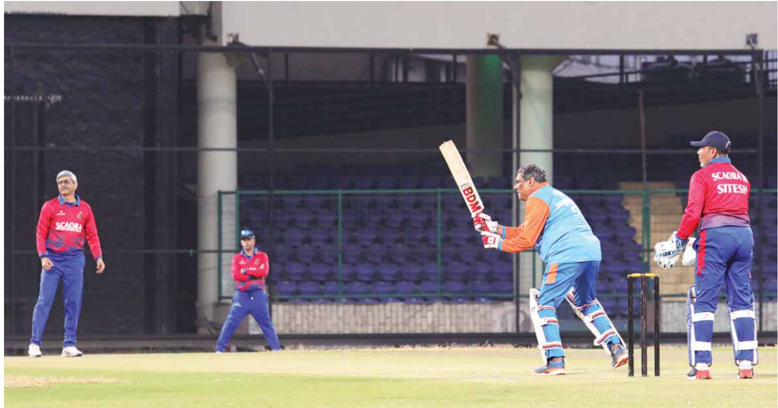
Chief Justice of India Justice Sanjiv Khanna plays a shot during a cricket match of the first SC Advocate On Records Association Vs CJI XI in New Delhi.