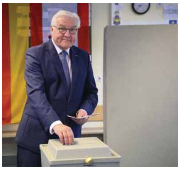
German President Frank-Walter Steinmeier casts his vote at a polling station in Berlin, Germany, on Sunday

What are Germans voting for?: More than 59 million people in the nation of 84 million are eligible to elect the 630 members of the lower house of parliament, and Merz is favoured to replace Scholz. Scholz's Social Democrats have been polling between 14-16 per cent, which would be their worst postwar result in a national parliamentary election. The far-right, anti-immigration Alternative for Germany, or AfD, has been running in second place with around 20 per cent of the vote — well above its previous best of 12.6 per cent in a national election, from 2017 — and has fielded its first candidate for