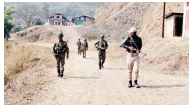
Security personnel during search operations and area domination in Manipur.