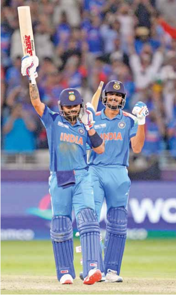
Virat Kohli celebrates his century with Axar Patel after scoring the winning runs during the ICC Champions Trophy between India and Pakistan, at Dubai International Cricket Stadium