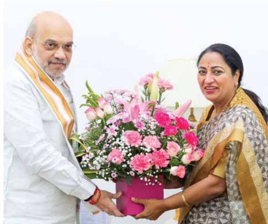
Delhi Chief Minister Rekha Gupta meets Union Home Minister Amit Shah in New Delhi

"Despite receiving no financial support from the central government, we strengthened Delhi's economy. Today, the budget for 2024-25 has reached Rs 77,000 crore, marking a 2.5-time increase in the last decade," she claimed.