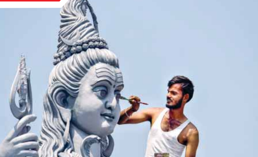
A worker paints the statue of Lord Shiva ahead of the Maha Shivaratri festival, in Chikmagalur