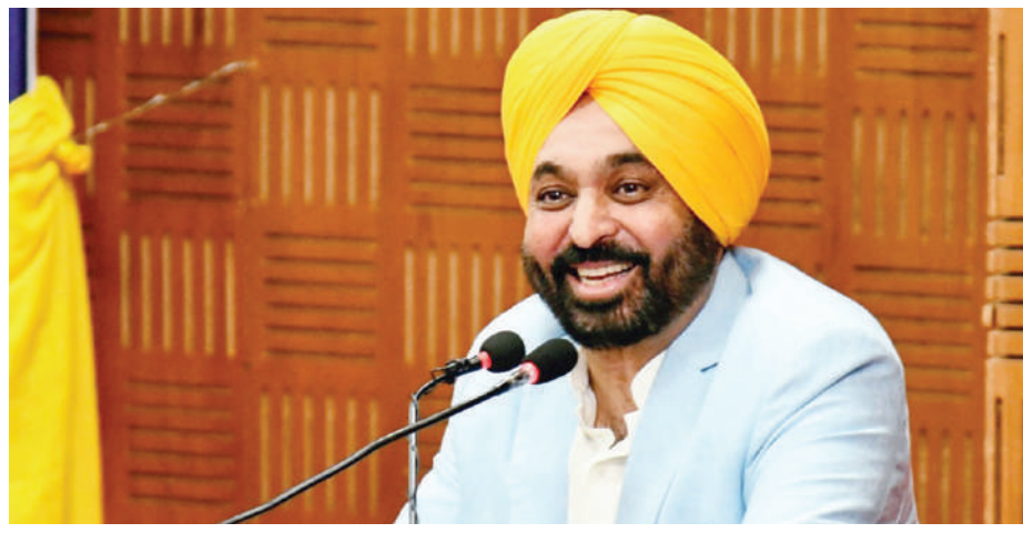
Punjab Chief Minister Bhagwant Mann

With Punjab Chief Minister Bhagwant Mann taking exception to US flights carrying Indian deportees landing in Amritsar, government sources Wednesday defended the move, saying the state makes up for the biggest share of these illegal immigrants. Sharing figures of the three flights that have arrived in India since February five, they said Punjab residents total 126 of the 333 people deported in US military aircraft, followed by 110 from neighbouring Haryana and 74 from Gujarat. Eight of them were from Uttar Pradesh, five from Maharashtra, two each from Himachal Pradesh, Chandigarh, Rajasthan and Goa, and one each from Jammu and Kashmir, and Uttarakhand. Each of the three flights on February 5, 15 and 16 carried over 100 Indians and 333 of them have been deported so far, they added. The total includes 262 men, 42 women and 29 minors, the sources added. As many as 23 flights carrying Indian deportees have arrived in the country since May 2020 and all of them landed in Amritsar, they said. Since Donald Trump's inauguration as US President, whose