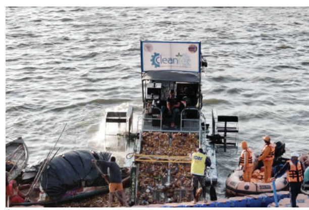
Cleanliness drive at Mahakumbh mela in Prayagraj

With over 55 Crore devotees already taken a dip during two months long congregation of extraordinary proportions at Mahakumbh, the Uttar Pradesh government has taken care of all efforts to ensure the cleanliness of the Sangam in Mahakumbh Nagar. Each day, an average of 10-15 Tonnes of floating waste is collected from the river and sent for recycling, demonstrating a strong commitment to maintaining environmental sustainability during this sacred event. But since this poses a complex array of logistical challenges, especially in managing the immense waste generated by such a gathering, deployment of trash skimmers at Prayagraj by the Urban Development Department as part of Swachh Bharat Mission is being executed by Cleantec Infra, and