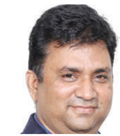
BINOD ANAND ■ NEW DELHI

As India embraces sustainability and innovation, a cooperative economic framework becomes essential to address G-local challenges through responsible Business. This ensures shared growth by fostering collaboration between multinational corporations, small and medium enterprises (SMEs), and government bodies.