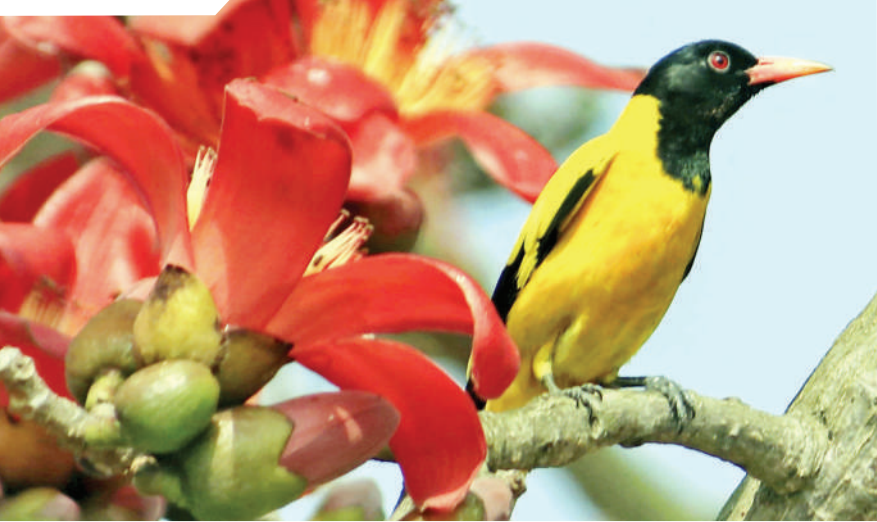
A black-naped oriole bird perches on a bloomed cotton tree, in Birbhum