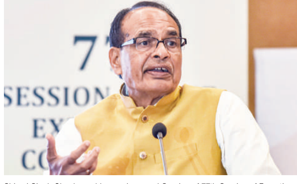
Shivraj Singh Chouhan addresses inaugural Session of 77th Session of Executive Committee of African Asian Rural Development, in New Delhi

India is committed to rural transformation in member nations of the African-Asian Rural Development Organisation (AARDO) and will increase its technical contribution to the forum, Rural Development Minister Shivraj Singh Chouhan said here on Wednesday. He was speaking at the inauguration of the 77th session of the executive committee of the African-Asian Rural Development Organisation (AARDO). "India gives the highest yearly membership contribution to AARDO, which is around USD 1,55,300, and the Indian government has been providing organisation, technical, and financial support to AARDO from time to time," he said. "India will keep playing its role in rural transformation in