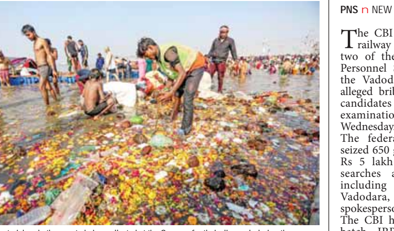
Puja material and other waste being collected at the Sangam for their disposal, during the ongoing Maha Kumbh Mela 2025, in Prayagraj.

BISWAJEET BANERJEE/PNS ■ LUCKNOW/NEW DELHI Amid claims by Central Government pollution body that the present condition of Ganga water in ensuing Maha Kumbh may contain high levels of faecal bacteria, Uttar Pradesh Chief Minister Yogi Adityanath on Wednesday countered by assuring the Sangam water in Prayagraj is safe for bathing and other rituals. A sort of controversy erupted over the claims by Central government pollution body which reported the Ganga water at Triveni Sangam, where lakhs of people are taking a holy dip every day during the ongoing Maha Kumbh, is currently unsafe for bathing. Central Pollution Control Board (CPCB) data informed the National Green Tribunal that Sangam water at Maha Kumbh exceeds the prescribed limit for biological oxygen demand (BOD), a key parameter to determine water quality. BOD refers to the amount of oxygen required by aerobic microorganisms to break down organic material in a water body. A higher BOD level indicates more organic content in the water. River water is considered fit for bathing if the BOD level is less than 3 milligrams per litre. In a report submitted to the NGT the CPCB said the river water quality did not meet bathing standards during monitoring on January 12-13 at most locations in Prayagraj. According to Uttar Pradesh government officials, 10,000 to 11,000 cuces of water is being released into the Ganga to