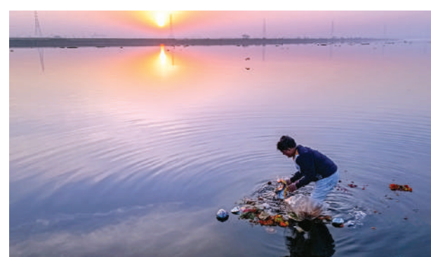
A devotee performs rituals at the Shyam Ghat of the Yamuna river, in New Delhi on Wednesday.

ones. The city's sewage treatment capacity is set to increase from 792 MGD (million gallons per day) in 2023 to 964.5 MGD by December 2026, with a new STP planned at Delhi