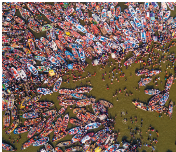
An aerial view of devotees on boats at the Sangam during the ongoing Maha Kumbh Mela, in Prayagraj