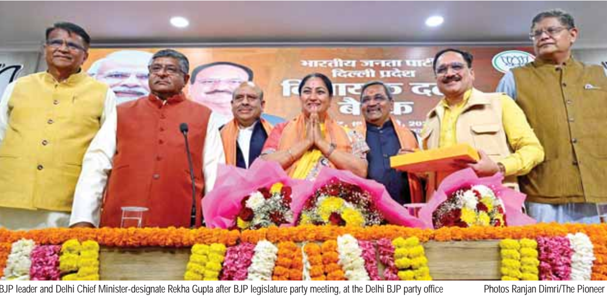
BJP leader and Delhi Chief Minister-designate Rekha Gupta after BJP legislature party meeting, at the Delhi BJP party office.

PUBLISHED FROM: DELHI | LUCKNOW | BHOPAL | BHUBANESWAR | RANCHI | RAIPUR | CHANDIGARH | DEHRADUN | HYDERABAD | VIJAYWADA