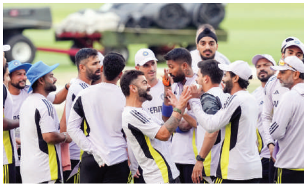
Virat Kohli, Ravindra Jadeja, Hardik Pandya and others during a practice session ahead of the ICC Champions Trophy match between India and Bangladesh

because ODI is the comfort zone of those icons and young tyros in this Indian line-up, and they will be genuinely eyeing a strong outing here. It's imperative that they do so -- from a team and individual perspective. It would not be an exaggeration to say that Kohli, Rohit and even head coach Gautam Gambhir, although only six months into his tenure, are living on borrowed time because the shockwaves created by the setbacks against New Zealand and Australia have not subsided yet. Some bright signs are there though. Skipper Rohit made a century a few days back against England and Kohli a fifty, while Gambhir masterminded the dominant 4-1 and 3-0 victories in T20s and ODIs respectively. Gill was exceptional while emerging as the player of the series, cracking two fifties and a hundred in three ODIs against England. But the challenge India face in the Champions Trophy is vastly different from a rather cosy home series. Bangladesh, Pakistan and New Zealand, their opponents in Group A, are far more motivated than the seemingly disinterested England whom they faced recently, and even one defeat can change the whole league stage equation quite dramatically.