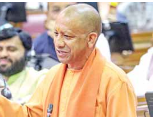
Uttar Pradesh Chief Minister Yogi Adityanath speaks during the Budget session of the state Legislative Assembly, in Lucknow.

exceeding Rs 3 Lakh Crore. Sales are reported to have increased due to meticulous branding. It also proves that India's sanatana economy has deep-rooted strength, playing a significant role in the country's overall economic framework," Khandelwal added. This has provided a significant boost to Uttar Pradesh's economy and created new business opportunities. Before the commencement of the Maha Kumbh, initial estimates was projected the arrival of 40 Crore people and business transactions worth around Rs 2 Lakh Crore. According to the Uttar Pradesh government, over 53 Crore