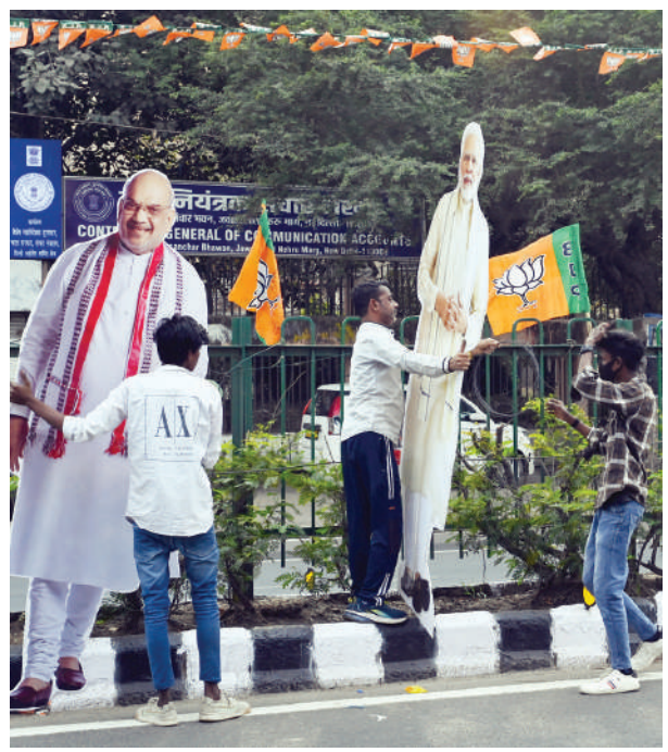
A devotee performs rituals at the Shyam Ghat of the Yamuna river, in New Delhi on Wednesday.