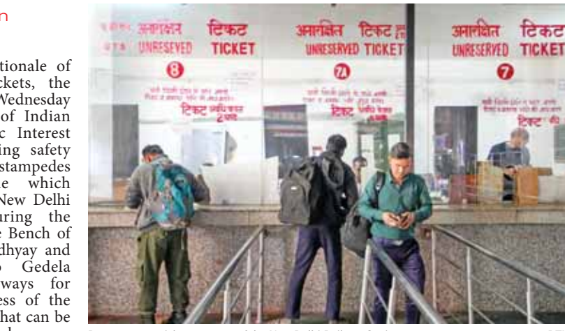
Passengers at ticket counters of the New Delhi Railway Station.

PIONEER NEWS SERVICE ■ NEW DELHI Questioning the rationale of selling excess tickets, the Delhi High Court on Wednesday sought the response of Indian Railways on a Public Interest Litigation (PIL) seeking safety measures to prevent stampedes similar to the one which happened recently at New Delhi Railway Station. During the hearing of the PIL, the Bench of Chief Justice DK Upadhyay and Justice Tushar Rao Gedela questioned the Railways for selling tickets in excess of the number of passengers that can be accommodated in a coach. "If you fix the number of passengers to be accommodated in a coach then why do you sell, why the number of tickets sold exceed that number? That is a problem," the Court said. The judges also referred to Section 57 of the Railways Act which mandates that the administration shall fix the maximum number of passengers which may be carried in a compartment. "If you implement a simple thing in a positive manner in letter and spirit, such situation can be avoided. On rush days you may increase that number to accommodate the rush depending on exigencies which keep on arriving from time to time. But not fixing the strength to be accommodated in a coach, this provision appears to have been neglected all along," observed the Court. The Court was hearing a petition moved by Arth Vidhi, an organisation of a group of lawyers, entrepreneurs and others professionals, in the backdrop of