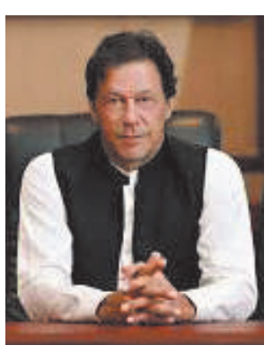
House but no progress was made due to his insistence on the release of all detained workers before his transfer.

process and views Gandapur as the central figure who could make it happen. So far, there is no indication that the other side is willing to engage.