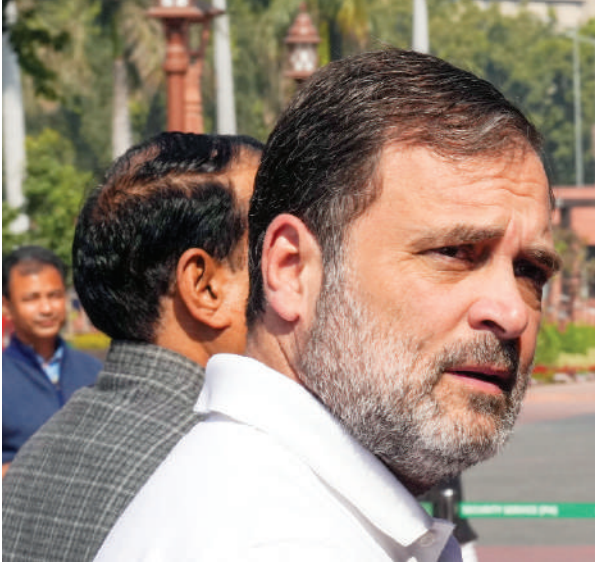
Rahul Gandhi in the Lok Sabha arrives for a meeting of party's general secretaries and state in-charges, in New Delhi