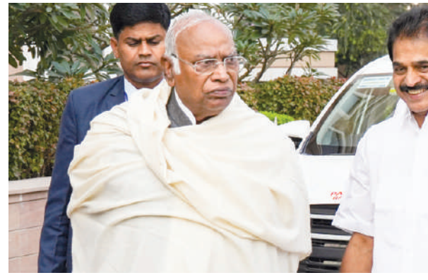
Congress President Mallikarjun Kharge in the Lok Sabha arrives for a meeting of party's general secretaries and state in-charges, in New Delhi

Days after a major organisational rejig in the party, Congress President Mallikarjun Kharge on Wednesday stressed that the top workers will be held accountable for future election results in States under their charge and asking them to be wary of ideologically weak turncoats. Addressing general secretaries and in-charges, including those appointed last week, at a meeting held at the party's new headquarters at Indira Bhawan, Kharge emphasised the importance of promoting those people who are committed to the ideology of the Congress and stand with us like a rock even in adverse circumstances. Kharge also hinted at some more changes in the organisation, saying some changes have already taken place and some more are in the offing. "I want to talk to you about the most important thing of accountability. You all will be held accountable for revamping the organisations in states and for all future election results," he told the office-bearers. The party recently brought in new office bearers in the revamped organisation. Among those who attended the meeting