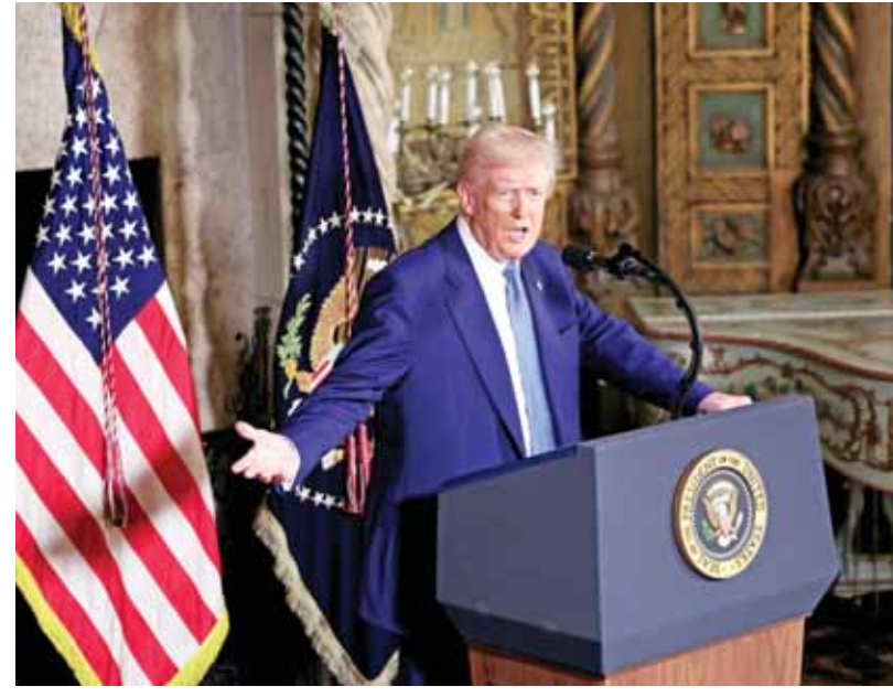
President Donald Trump speaks at Mar-a-Lago in Palm Beach, Fla.

■ WASHINGTON US President Donald Trump has said that he made it clear to Prime Minister Narendra Modi that India will not be spared from Washington's reciprocal tariffs, emphasising that "nobody can argue with me" on tariff structure. Trump made these remarks during an interview with Fox News' Sean Hannity recently. Fox News aired a joint television interview with President Trump and billionaire Elon Musk on Tuesday night. On February 13, hours before Prime Minister Modi's bilateral meeting with Trump in the White House, the US President announced reciprocal tariffs. Under the plan, the Trump administration "will work strenuously to counter non-reciprocal trading arrangements with trading partners by determining the equivalent of a reciprocal tariff with respect to each foreign trading partner." During the interview with Hannity