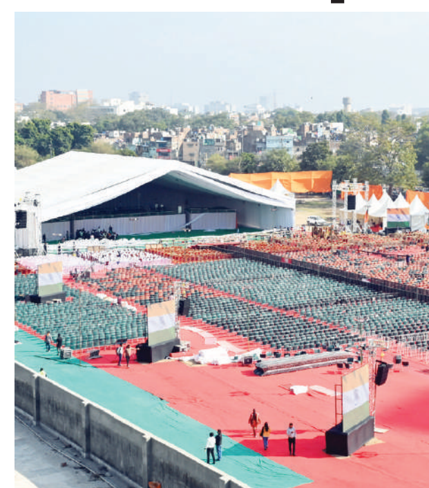
Preparations underway for the oath ceremony at Ramlila Maidan in New Delhi on Wednesday.