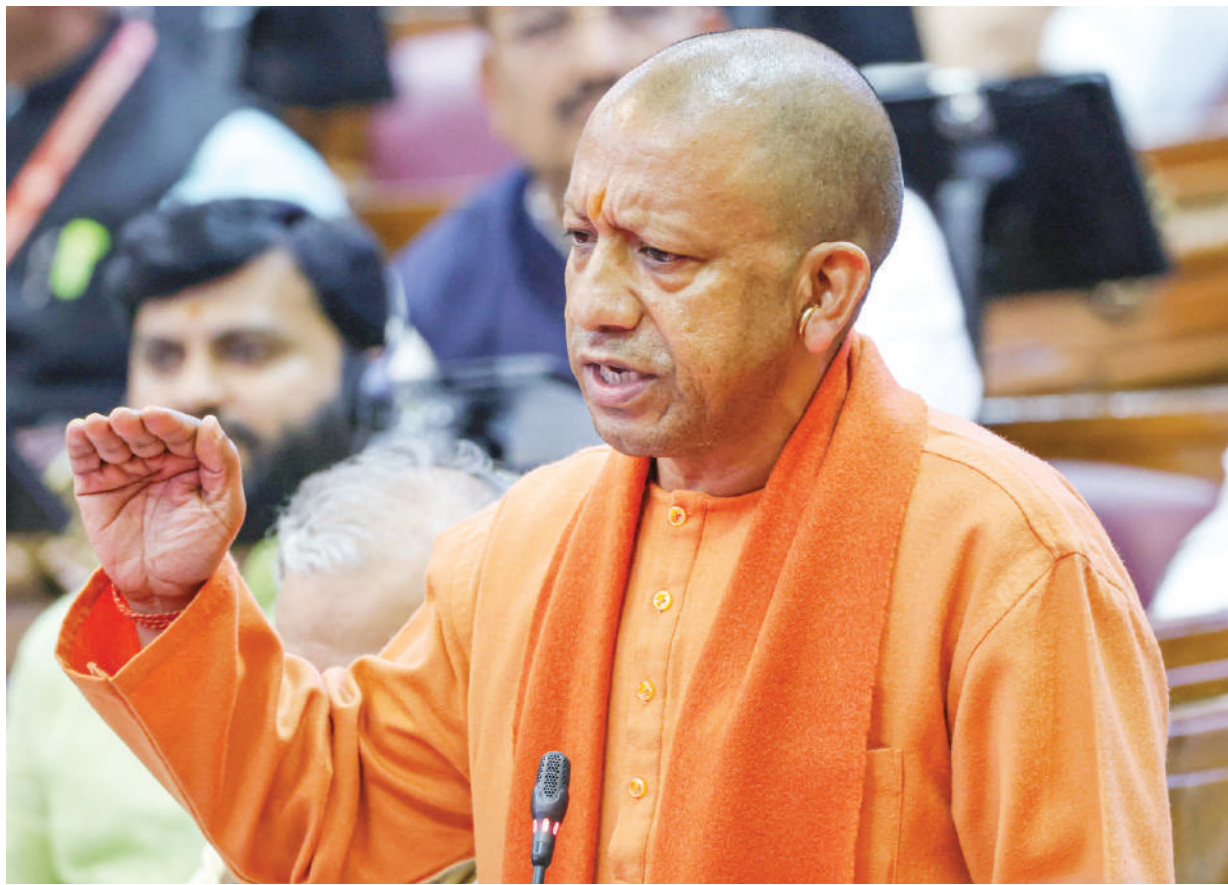
Uttar Pradesh Chief Minister Yogi Adityanath speaks during the Budget session of the state Legislative Assembly, in Lucknow

during the festival had resulted in thousands of deaths. "If following Sanatan traditions is a crime, then I will commit this crime a thousand times," Yogi asserted. Taking a dig at SP, he said, "A sick person can be treated, but not a sick mentality." He further mocked SP chief Akhilesh Yadav, claiming that despite his party's criticism, he secretly took a dip in the holy waters. Opposition demands halt to power privatisation, Government stresses reforms The opposition also raised concerns over privatisation of electricity, warning that it would increase tariffs and adversely impact consumers. They argued that the state electricity board has more experience than private firms, and called for an immediate rollback of privatization plans. Energy Minister A.K. Sharma defended the move, stating that privatisation is necessary for improving the power sector. "When BJP came to power in 2017, UP's electricity board was running a deficit of ₹1.42 Lakh Crore. Despite reforms, issues persist, and further improvements are needed," he explained. He