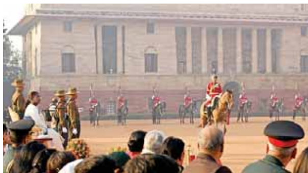
President Droupadi Murmu witnesses the inaugural show of the Change of Guard Ceremony in a new format at the Forecourt of Rashtrapati Bhavan, in New Delhi

The change of guard ceremony at Rashtrapati Bhavan will now be held in a new format, featuring an elaborate visual and musical performance against the backdrop of the presidential palace, an official statement said on Sunday. The new format includes military drills by troops and horses of the President's Bodyguard, along with personnel from the Ceremonial Guard Battalion and the Ceremonial Military Brass Band. The display will be spread over a larger area, the statement added. President Droupadi Murmu witnessed the inaugural ceremony in its new format on Sunday at the forecourt of Rashtrapati Bhavan, according to the statement issued by her office.