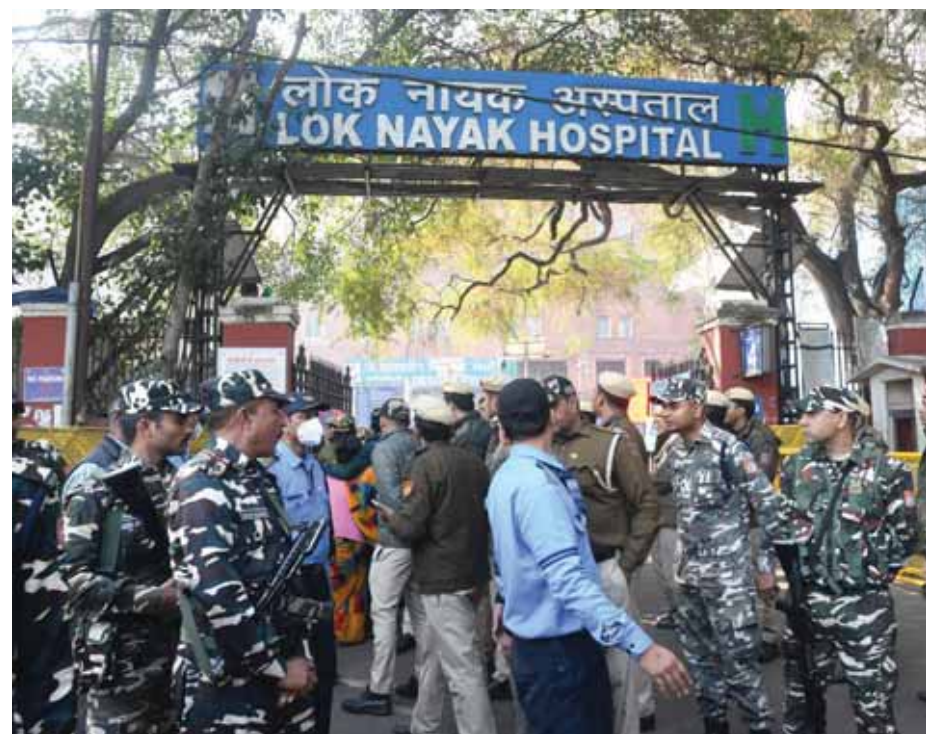
Security personnel stand guard outside the LNJP hospital

movement within the hospital premises. Some distraught family members were not allowed to enter the casualty and orthopaedic departments, where the injured were being treated. Desperate to locate their missing loved ones among the admitted patients, they were turned away after officials merely checked the lists in their possession. Many of them complained that none of the hospitals, where the victims were taken, allowed them to search for their relatives and denied them the opportunity to file missing complaints. At the LNJP Hospital, which received the highest number of victims, the atmosphere was tense. A walk through the campus revealed an unusually low number of people compared to a normal day. Security checks were being conducted at every ward, allowing only one person to enter at a time. Inside, everyone was being questioned and no one was allowed near the ward where the stampede victims were admitted. Each injured patient was