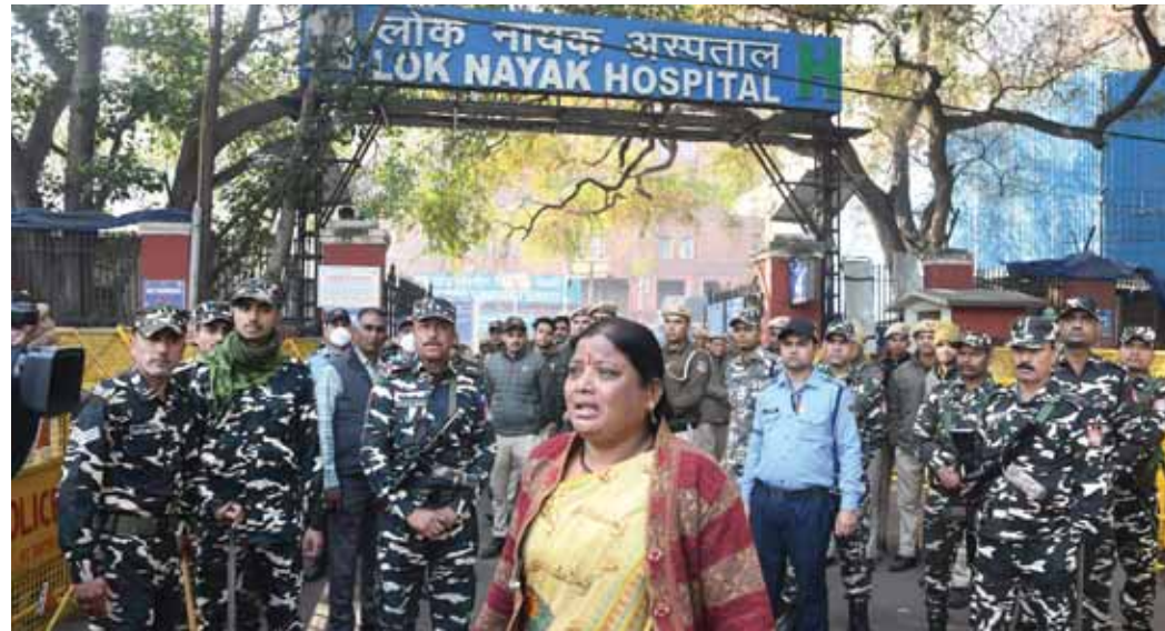
Relatives of stampede victims outside the the LNJP Hospital