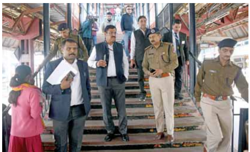
Officials at the incident spot on Platform number 14 at the New Delhi Railway Station on Sunday