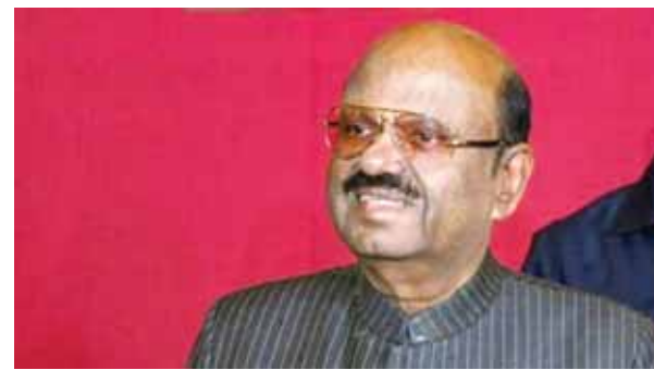
West Bengal Governor C V Ananda Bose

West Bengal Governor C V Ananda Bose on Sunday dismissed criticism over his speech in the assembly on the first day of the budget session, asserting that his address was a reflection of the state's government's policies and not a Raj Bhavan policy statement. Soon after Bose's address on February 10, Leader of Opposition in the assembly Suvendu Adhikari had said the speech was a revised version of what the state government had initially provided to him. "The governor's address is not the governor's policy statement, but that of the state government. As such the government's policy statement is to be delivered based on the advice of the council of