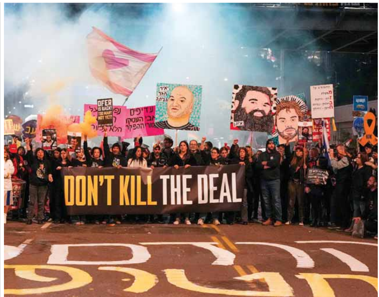
Protesters demanding the immediate release of hostages held by Hamas in the Gaza Strip, in Tel Aviv, Israel, on Saturday