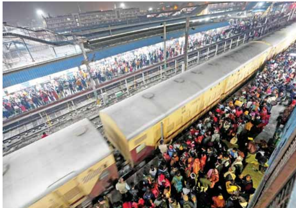
Heavy rush of passengers to catch a train for Mahakumbh, at the New Delhi railway station on Saturday, February 15. A stampede occurred at the station killing 18 and injuring many others

As the mega congregation at Maha Kumbh is on its last leg, yet another tragedy on Saturday night stuck the pilgrims at New Delhi Railway Station, where 18 people bound for the holy dip at Triveni Sangam lost their lives in a horrific manner. Amidst the religious fervour lasting almost two months, the loss of lives has touched almost 100 including 39 dead (official toll) during stampede at Maha Kumbh Nagar and about 40 lives fatality on the roads bound to Prayagraj. President Droupadi Murmu, Prime Minister Narendra Modi and Union ministers condoled the loss of lives in the stampede. "Deeply anguished to know about the loss of lives in a stampede at New Delhi railway station. I extend my heartfelt condolences to the bereaved families and pray for speedy recovery of those injured," President Murmu said in a social media post. The prime minister said he was distressed by the stampede at New Delhi Railway Station.