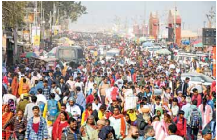
Devotees in a large number during the ongoing Maha Kumbh Mela, in Prayagraj