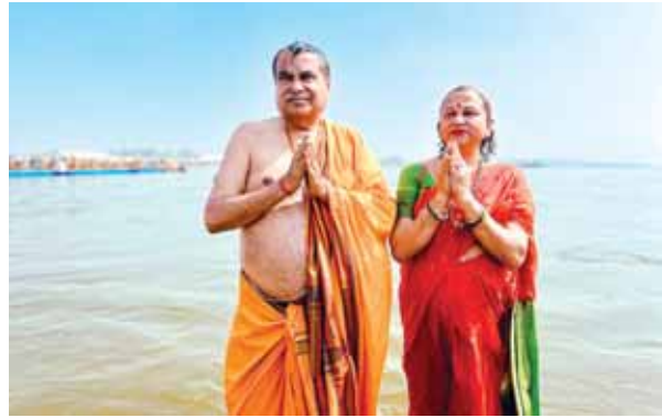
Union minister Nitin Gadkari takes a holy dip at Sangam

The spiritual grandeur of Mahakumbh 2025 in Teerthraj Prayagraj continues to draw dignitaries from across the nation, with many considering it a divine blessing to bathe in the sacred waters of the Triveni Sangam. On Sunday, Union Minister for Road Transport and Highways, Nitin Gadkari, joined the revered tradition, expressing his deep sense of fulfillment after taking a ritual dip alongside his wife and family. Upon his arrival at Prayagraj Airport, Uttar Pradesh Chief Minister Yogi Adityanath extended a warm welcome, presenting him with a shawl as a mark of respect. Gadkari then proceeded to the Sangam, where he performed the holy bath and offered prayers. His joy was evident, as he described the experience as spiritually uplifting. Impressed by the