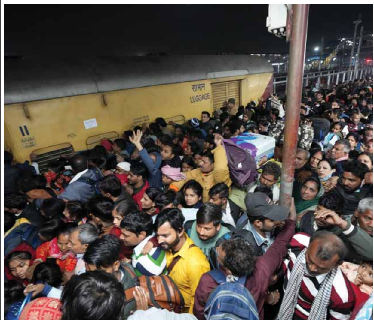
Heavy rush of passengers to catch a train for Mahakumbh, at the New Delhi railway station Saturday