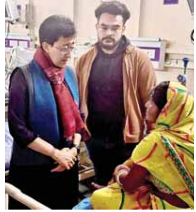
Acting Chief Minister of Delhi, Atishi visits injured victims of the New Delhi Railway Station stampede at the LNJP Hospital in New Delhi

Opposition parties on Sunday blamed the government for "gross mismanagement" at New Delhi railway station that led to a stampede in which 18 people died and demanded Railway Minister Ashwini Vaishnaw resign taking moral responsibility. Several opposition parties, including the Congress, the Left, Trinamool Congress and the Rashtriya Janata Dal, accused the government of failing to make elaborate arrangements and "covering up" the actual number of deaths. The BJP leaders, however, sought to defend the government by posting pictures on social media that showed the situation at the New Delhi railway station had turned normal. Congress president Mallikarjun Kharge said it was extremely shameful and condemnable that the Narendra Modi government was attempting to "hide the truth" about the deaths. In a social media post, the party said, "The railway minister should resign, apologise to the country." Former Congress chief Rahul Gandhi said better arrangements should have been made at the station in view of the large number of devotees going to Prayagraj for the Maha Kumbh. "This incident once again highlights the failure of the Railways and the insensitivity of the government," he said in a social media post. Former Railway minister and senior Congress leader Pawan Kumar Bansal said the ultimate responsibility of the tragedy lies with the minister and he cannot escape it.