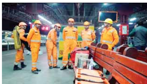
NDRF personnel deployed at the New Delhi Railway Station

Hours after a stampede at the New Delhi Railway Station claimed at least 18 lives, railway staff worked through the night to clear the horrific remains of the tragic incident. Shoes, torn bags, scattered clothes, and abandoned food lay across platforms 14 and 15 -- serving as grim reminder of the chaos that unfolded just hours earlier.