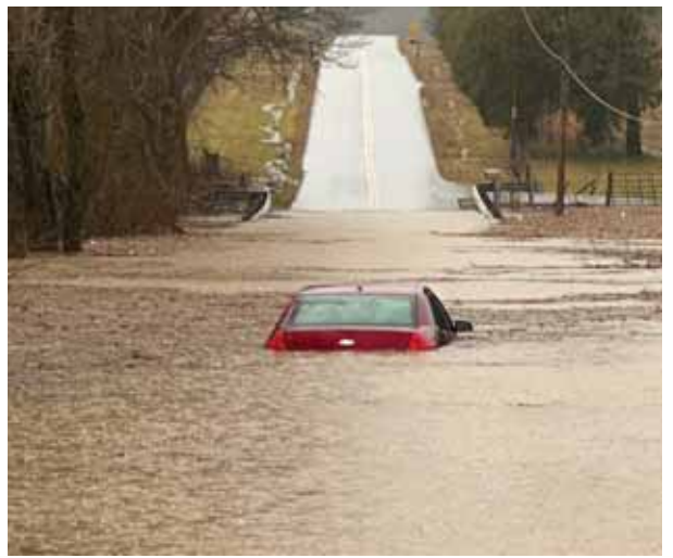
This photo provided by the Warren County, Kentucky, Sheriff's Office shows a partially submerged car outside of Bowling Green, Kentucky, on Saturday

Heavy rains and dangerous flooding struck the Southeast US as much of the East endured a renewed round of harsh, soggy weather on Saturday, with at least one fatality reported in Kentucky. A man was found dead in floodwaters in Clay County, Kentucky, WKYT-TV reported. Clay County Emergency Management officials did not immediately respond to a message from The Associated Press seeking additional information.