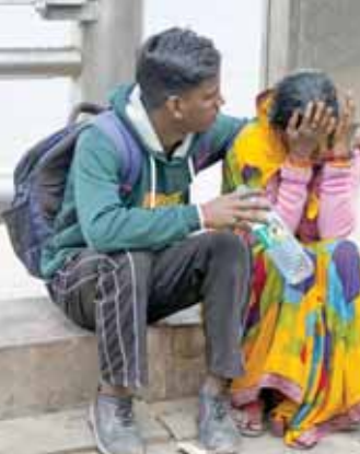
Relatives of victims wait outside the mortuary at the LNJP Hospital in New Delhi