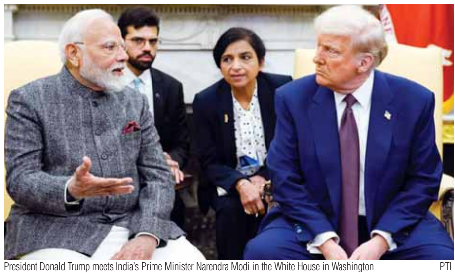
President Donald Trump meets India's Prime Minister Narendra Modi in the White House in Washington

India-United States (US) Transforming Relationship Utilising Strategic Technology (TRUST) will pave the way for economic and technological cooperation between the two countries, while focus on the IMEC framework will deepen collaboration in infrastructure and economic corridors, according to industry experts. Prime Minister Narendra Modi and US President Donald Trump have agreed on the TRUST initiative, to emphasise on creating strong supply chains of critical minerals, advanced materials, and pharmaceuticals. As per a joint statement issued after the Trump-Modi meeting in Washington, both countries have decided to launch a recovery and processing initiative for strategic minerals such as lithium and rare earth. The two sides will also work together on economic corridors and connectivity infrastructure under the India-Middle East-Europe Economic Corridor (IMEC) and I2U2 frameworks. "TRUST initiative on critical minerals and advanced materials marks a significant