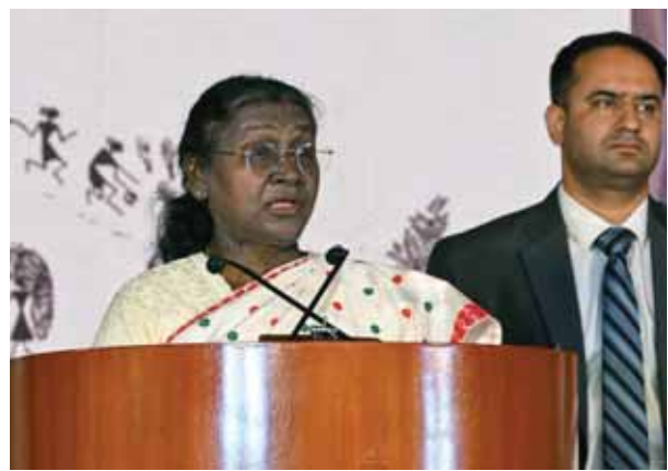
President Droupadi Murmu addresses during the inauguration of the National Tribal Festival 'Aadi Mahotsav', in New Delhi

Bangladesh", as well as USD 20 million for "fiscal federalism" in Nepal and USD 19 million for "biodiversity conversation" in the Himalayan nation. It also announced cutting a USD 10 million grant for "Mozambique voluntary medical male circumcision", USD 2.3 million for "strengthening independent voices in Cambodia", USD 32 million to the Prague Civil Society Centre, USD 40 million for "gender equality and women empowerment hub" and USD 14 million for "improving public procurement" in Serbia, among other expenditure cuts. It also included USD 47 million for "improving learning outcomes in Asia". The DOGE has been put in charge of overseeing workforce reduction across the government, and as part of that, Musk announced that he would shut down USAID, which is responsible for humanitarian efforts around the globe.