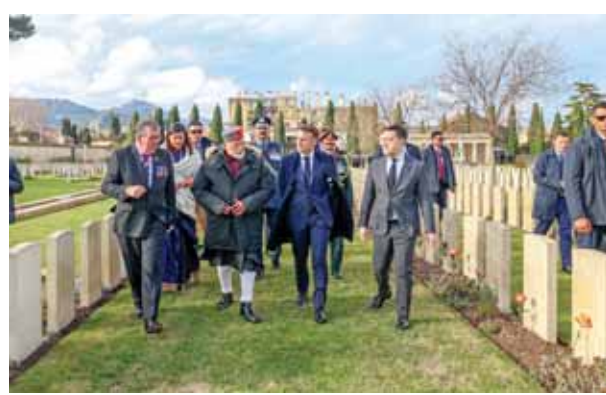
Prime Minister Narendra Modi and French President Emmanuel Macron at the Mazargues Cemetery to pay their respects to the fallen heroes, in Marseille