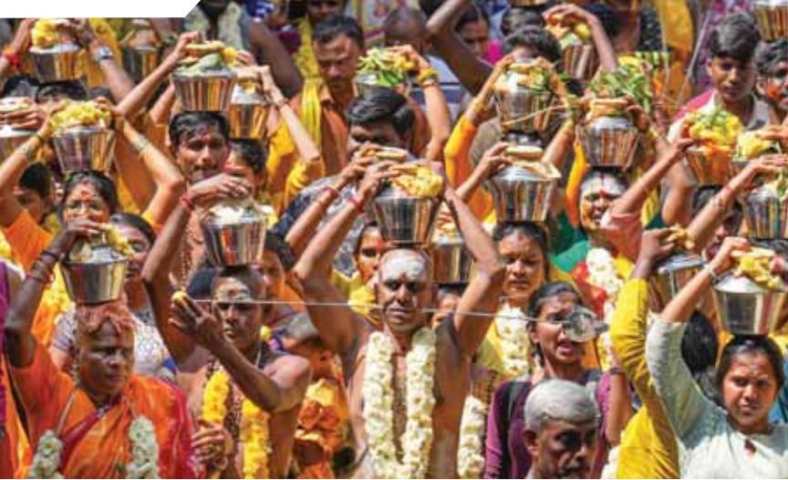
Devotees perform rituals during the Thaipusam festival at Vadapalani Murugan temple, in Chennai