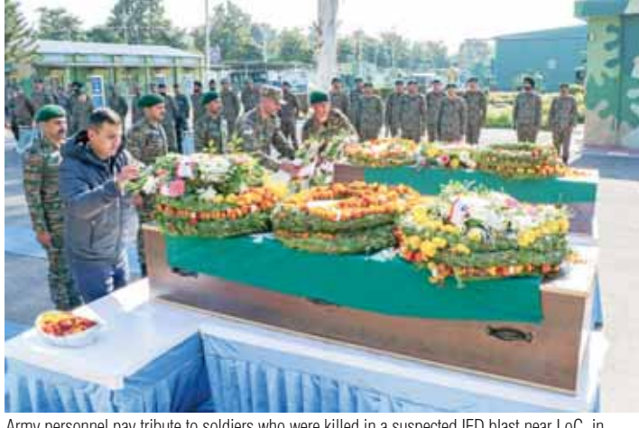
Army personnel pay tribute to soldiers who were killed in a suspected IED blast near LoC, in Jammu's Akhnoor