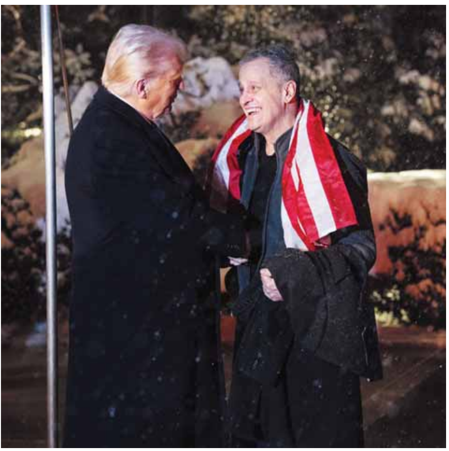
President Donald Trump, greets Marc Fogel at the White House, Tuesday.

Indonesia's state-run arms producer Pindad and Turkiye's FNSS jointly developed a new model of medium tank. In 2023, the two countries inked a plan of action for joint military exercises and defence industry cooperation. In addition to Indonesia, Turkiye has HILSCC cooperation forums with 21 other countries, including Pakistan. Turkiye and Indonesia plan to sign agreements on trade, investment, education and technology during Erdogan's visit. Erdogan will head on to Pakistan on Wednesday, where he and Prime Minister Shehbaz Sharif will address the Pakistan-Turkiye Business and Investment Forum and attend another HILSCC meeting.