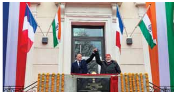
Prime Minister Narendra Modi and French President Emmanuel Macron during the inauguration of the Indian Consulate, in Marseille, France

The two leaders also acknowledged the strong civil nuclear ties between India and France and efforts in cooperation on the peaceful uses of nuclear energy,