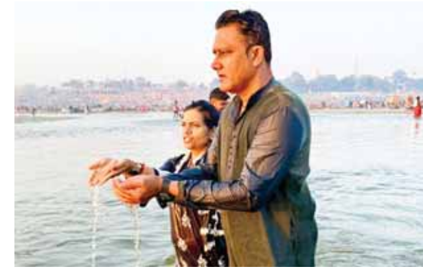
Former Indian cricket captain Anil Kumble prays after taking holy dip at the Sangam on Maghi Purnima, during the ongoing Maha Kumbh Mela 2025