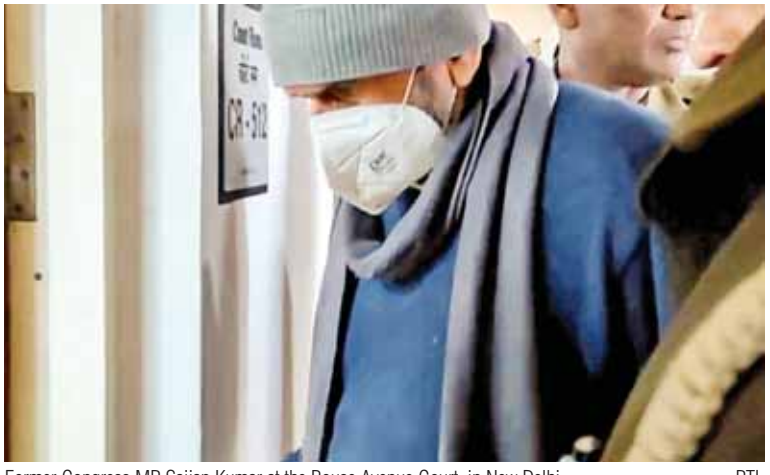
Former Congress MP Sajjan Kumar at the Rouse Avenue Court, in New Delhi