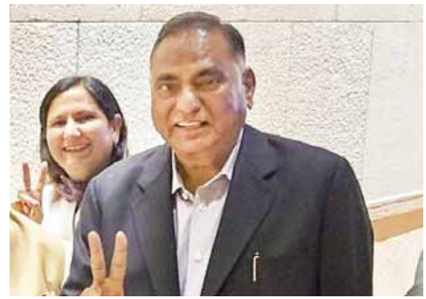
BJP MP from South Delhi Ramvir Singh Bidhuri

BJP MP from South Delhi Ramvir Singh Bidhuri on Tuesday raised the demand in the Lok Sabha to regularize 69 colonies like Sainik Farm and provide all civic amenities in them. He also said just as a decision has been taken to regularize 1,700 unauthorized colonies, in the same way these colonies should also be regularized. The matter of these colonies is stuck for a long time. Bidhuri said in the House that Prime Minister Narendra Modi's government has regularized more than 1,700 colonies of the capital. The work of giving ownership rights and providing civic amenities in these colonies is going on at a fast pace, but a decision has not been taken about 69 colonies like Sainik Farm. He said the announcement of giving ownership rights and providing civic amenities to these colonies should also be made soon. Permission should also be given to make layout plans of these colonies and to build houses in them as per building bylaws. Bidhuri said he has also raised this matter before Union Housing and Urban