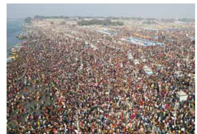
Devotees perform rituals at Sangam after taking a holy dip on the eve of 'Maghi Purnima' bath festival during ongoing Maha Kumbh Mela, in Prayagraj

The massive congestion left locals and pilgrims with mixed reactions. Residents expressed frustration over the traffic mismanagement, with many struggling to carry out their daily activities. Commuters were stranded for hours, and businesses faced disruptions due to supply delays. Pilgrims, however, viewed the overwhelming crowd as a testament to Kashi's spiritual significance. Despite the inconveniences, many devotees remained determined to complete their religious journey, expressing awe at the city's vibrancy and devotion.