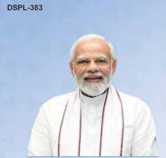
Shri Narendra Modi Prime Minister