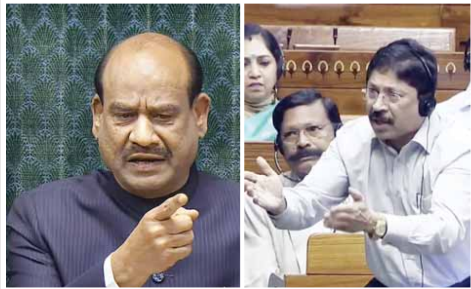
Lok Sabha Speaker Om Birla and DMK MP Dayanidhi Maran during the Budget session of Parliament, in New Delhi