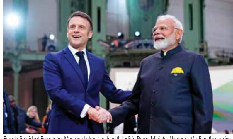
French President Emmanuel Macron shakes hands with India's Prime Minister Narendra Modi as they arrive at the Artificial Intelligence Action Summit at the Grand Palais in Paris, France

Prime Minister Narendra Modi on Tuesday made a strong case for collective efforts to establish a global framework for artificial intelligence (AI) based on open source which enhances trust, transparency and is free from biases. Co-chairing the AI Action Summit along with French President Emmanuel Macron here, Modi said that AI is changing the polity, economy, security and society, and is writing the code for humanity in this century. Modi also offered to host the next AI Action Summit in India, supporting the decision taken at the first summit hosted by France to set up the 'AI Foundation' and the 'Council for Sustainable AI'. "There is a need for collective global efforts to establish governance and standards that uphold our shared values, address risks and build trust," Modi said, adding that governance is not just about managing risks and rivalries but is also about promoting innovations and