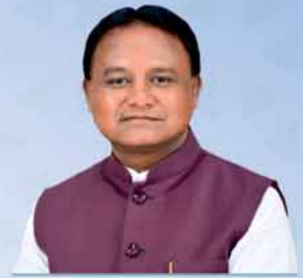
Shri Mohan Charan Majhi Chief Minister, Odisha

A Stadium in Every Block, A Champion in Every Home