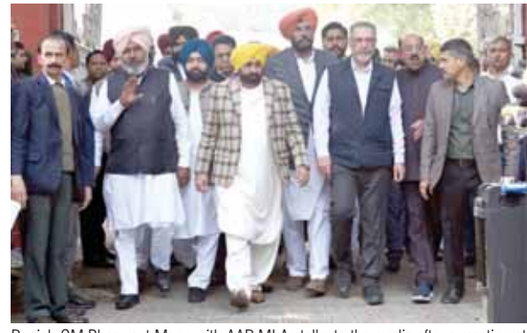
Punjab CM Bhagwant Mann with AAP MLAs talks to the media after a meeting at the Kapurthala House

Amidst reports of exodus of MLAs, Aam Aadmi Party (AAP) convener Arvind Kejriwal met Punjab chief minister Bhagwant Mann and 91 state MLAs in Delhi on Tuesday and dismissed speculation of internal discord within the party stating that "all is well" in the party. After the meeting, which lasted for about an hour, Mann and other leaders outright rejected the possibility of Kejriwal becoming the Chief Minister of Punjab and about 35 MLAs in Punjab breaking away and joining the Congress.