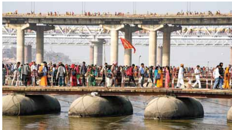
Rush of devotees on pontoon bridge on the eve of 'Magh Purnima' during the ongoing Mahakumbh Mela, in Prayagraj

Stressing the importance of seamless traffic and crowd management, he instructed authorities to fully utilise parking facilities capable of accom-