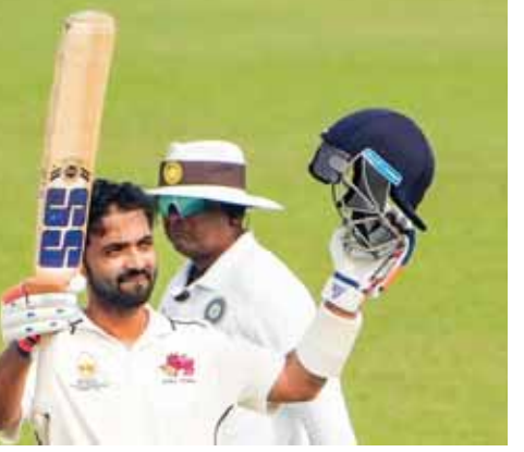
partnership worth 90 runs, Haryana's chase never gathered momentum, as they folded in 57.3 overs on a day when the play was agreed