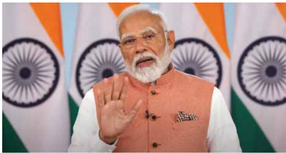
Prime Minister Narendra Modi delivers his remarks via video conferencing during inauguration of India Energy Week

important part of India's energy ambitions," Modi told investors. He further said, "All experts are saying that 21st century is India's century. Bharat is not only driving it is own growth but driving global growth." India's energy ambitions, he said, are based on five pillars. "We have resources, which we are harnessing. We are encouraging our brilliant minds to innovate. Thirdly, we have economic strength and political stability," he said. Also, he said, India has strategic geography, which makes energy trade easier and more attractive. Besides, India is committed towards global sustainability and this is aiding new possibilities in the country's energy sector, the prime minister said. For Viksit Bharat, the next two decades are very crucial, he said, adding that in the next five years we will cross many