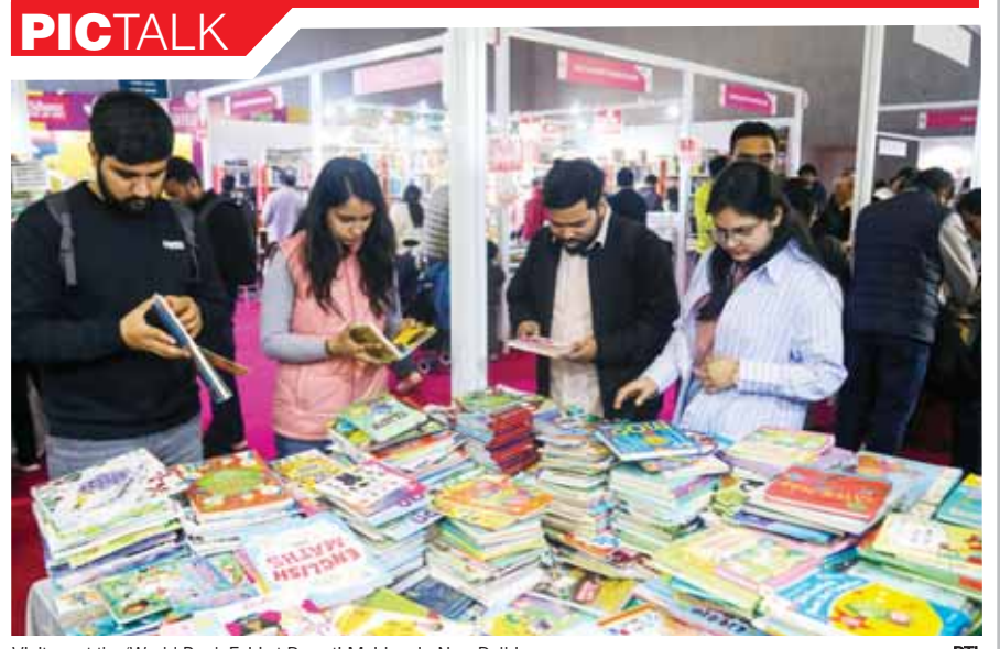
Visitors at the 'World Book Fair' at Pragati Maidan, in New Delh

to healthcare and welfare schemes. An allocation of Rs 11.21 lakh crore was made for capital expenditure, reflecting a modest increase from the previous year. This investment is intended to stimulate infrastructure development and economic growth. Some analysts, including Moody's Ratings, have expressed concerns that the tax relief measures for the middle class may have a limited effect on overall economic growth. The effectiveness of these measures in significantly boosting consumption and investment remains uncertain. The budget's capital expenditure increase was modest, which may not be sufficient to drive the desired level of infrastructure development and economic expansion. While the budget outlines ambitious programmes, the success of these initiatives will depend on effective implementation at the ground level. Past challenges in executing government schemes could pose hurdles to achieving the desired outcomes. The Union Budget 2025-26 introduces notable measures to support the middle class and agriculture, but its potential impact on broader economic growth and the effectiveness of implementation remain areas to watch. While the budget's initiatives are promising, concerns linger about their impact on economic growth and the effectiveness of their implementation.