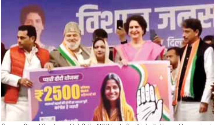
Congress General Secretary and Lok Sabha MP Priyanka Gandhi at a Delhi assembly campaign in national Capital on Sunday. Delhi goes to polls on Wednesday

routed completely. Members of Opposition parties under the INDIA bloc has claim that about 63 election petitions have been filed across various benches of the Bombay High Court