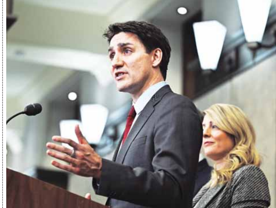
Canada's Prime Minister Justin Trudeau addresses media following the imposition of a raft of tariffs by US President Donald Trump against Canada, Mexico and China, in Ottawa on Saturday.

'You're worried about grocery prices. Don's raising prices with his tariffs," Senate Democratic Leader Chuck Schumer of New York posted on X. "You're worried about tomato prices. Wait till Trump's Mexico tariffs raise your tomato prices. ... You're worried about car prices. Wait till Trump's Canada tariffs raise your car prices," he wrote in a series of posts.