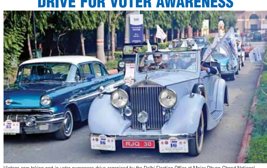
Vintage cars taking part in voter awareness drive organised by the Delhi Election Office at Major Dhyan Chand National

- are closed for the The portals reopen in April-May the following year. During the six-month-long pilgrimage Lakhs of devotees from across the country and abroad visit the Char Dhams.