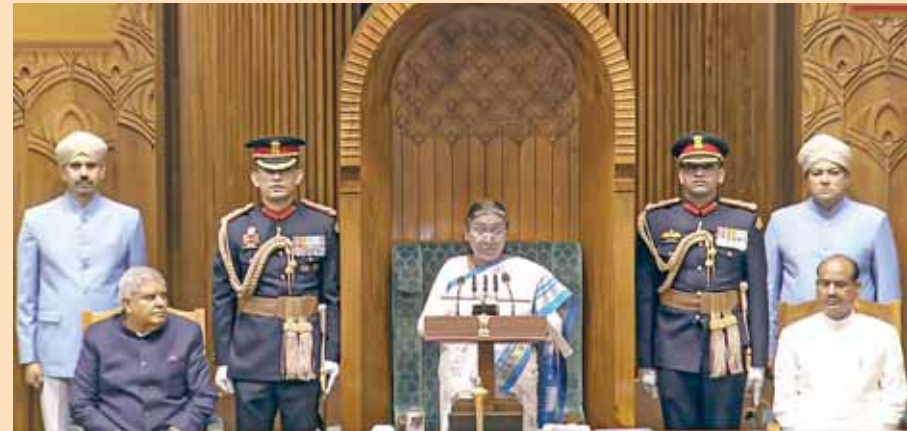
President Droupadi Murmu addresses the joint sitting of both Houses of Parliament on the first day of the Budget Session in New Delhi.