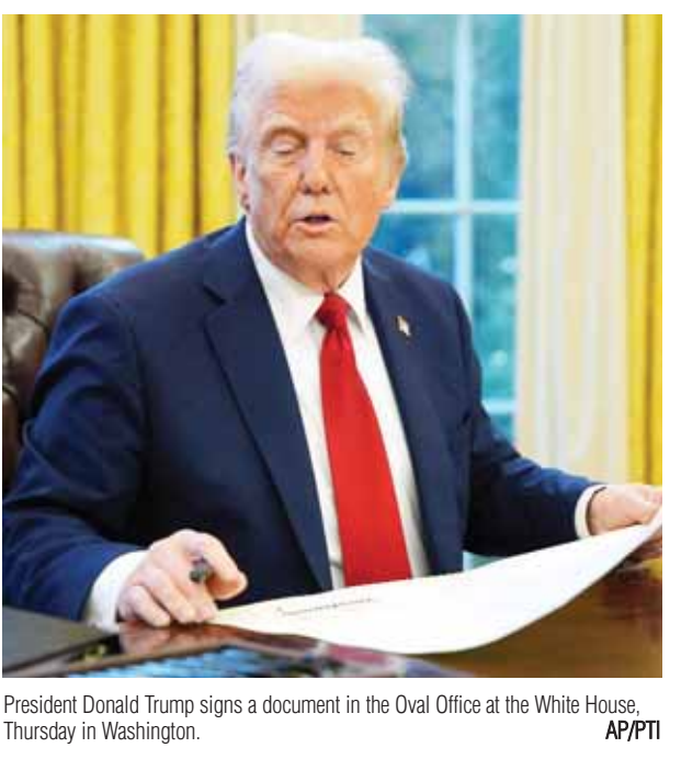
President Donald Trump signs a document in the Oval Office at the White House, Thursday in Washington.

PTI ■ WASHINGTON President Donald Trump has once again warned that he will impose 100 per cent tariffs against BRICS nations if they attempt to replace the US dollar in international trade, telling them to go and find "another sucker nation." BRICS is an intergovernmental organisation of ten countries — Russia, India, China, South Africa, Egypt, Ethiopia, Indonesia, Iran and the United Arab Emirates. "The idea that the BRICS countries are trying to move away from the dollar, while we stand by and watch, is OVER," Trump said on Thursday in a post on Truth Social, a social media platform owned by him. Trump said he wanted a commitment from these "seemingly hostile" coun-