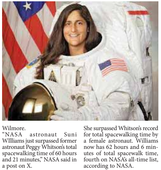
Williams. "NASA astronaut Sunita Williams just surpassed former astronaut Peggy Whitson's total spacewalking time of 60 hours and 21 minutes," NASA said in a post on X. She surpassed Whitson's record for total spacewalking time by a female astronaut. Williams now has 62 hours and 6 minutes of total spacewalk time, fourth on NASA's all-time list, according to NASA.

PTI ■ WASHINGTON Indian-origin astronaut Sunita Williams has broken the record for total spacewalking time by a woman by logging 62 hours and 6 minutes of spacewalk. Williams and her colleague Butch Wilmore, who have been stranded on the International Space Station (ISS) since June 2024, conducted a spacewalk on Thursday. The duo ventured outside the ISS to remove degraded radio communications hardware and collect samples that may show whether microorganisms exist on the exterior of the orbiting laboratory. The spacewalk began at 7:43 am Eastern Time (ET) and concluded at 1:09 pm ET, lasting 5 hours and 26 minutes. It was the ninth spacewalk for Williams and the fifth for