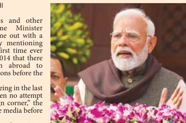
Prime Minister Narendra Modi addresses the media on the first day of the Budget Session of Parliament.

In a jibe at the Congress and other Opposition parties, Prime Minister Narendra Modi on Friday came out with a tongue-in-cheek comment by mentioning that it could be perhaps the first time ever since he took over as PM in 2014 that there has been no attempt from abroad to destabilise our legislative functions before the start of a Parliament session.