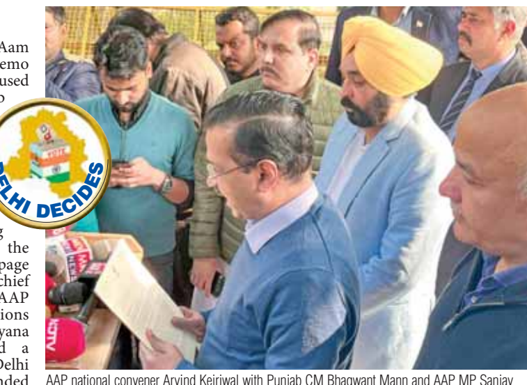
AAP national convener Arvind Kejriwal with Punjab CM Bhagwant Mann and AAP MP Sanjay Singh before leaving to meet Election Commissioners, in New Delhi.

In a startling revelation, Aam Aadmi Party (AAP) supremo Arvind Kejriwal on Friday accused Haryana Chief Minister Nayab Singh Saini of hatching a "conspiracy" to "influence" and force half of Delhi's population to thirst due to the "poisonous" Yamuna water to defame his party ahead of the Assembly polls on February 5 by sending highly-polluted waters to the national Capital. In his six-page written reply addressed to the chief election commissioner (CEC), AAP chief raised serious allegations against Saini and said the Haryana Chief Minister orchestrated a "conspiracy" to influence the Delhi assembly election. He demanded that a criminal case should be filed against Saini regarding the 'poisonous' Yamuna issue.