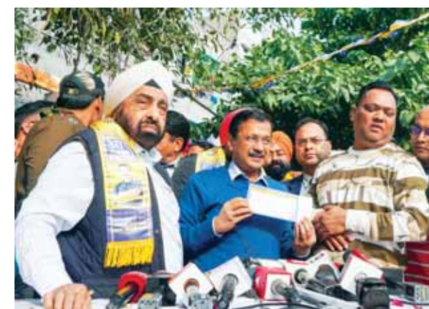
NEW DELHI

In a major announcement ahead of the upcoming elections, Aam Aadmi Party (AAP) National Convenor Arvind Kejriwal on Friday launched the 'Aam Aadmi Bachat Patra' (Savings Certificate), campaign highlighting the substantial financial relief that AAP's governance provides to Delhi's families. According to Kejriwal, every household in Delhi saves an average of Rs 25,000 a month due to the AAP government's welfare schemes and if the party returns to power, its new initiatives will add another Rs