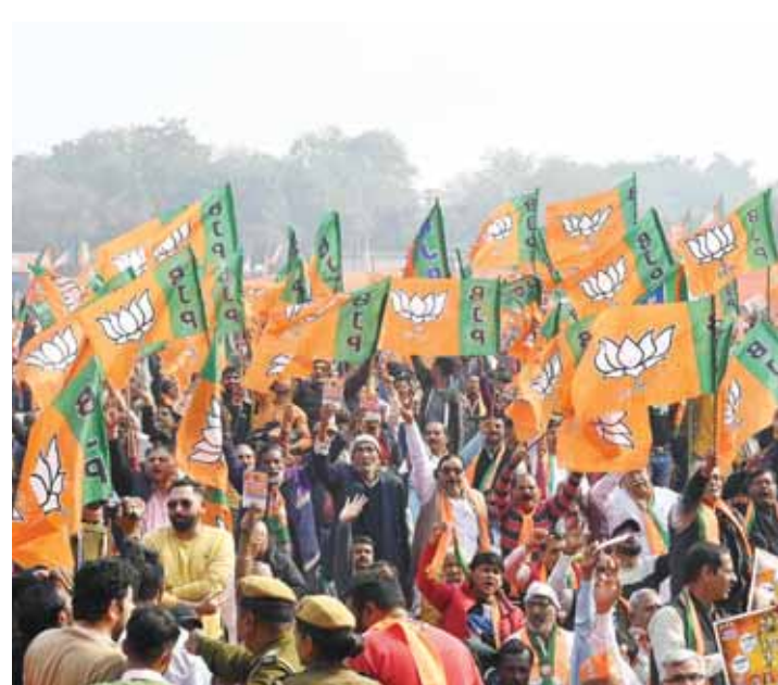
Prime Minister Narendra Modi during a public meeting for Delhi Assembly elections, at Dwarka, in New Delhi on Friday.

pockets of Delhi." "As soon as we form the government, we will hit harder on AAP's corruption. Those who have looted Delhi will have to pay back. In the first session of assembly, we will table the CAG report which has accounts of 'AAP-da' government's corruption," he claimed. Scores of party workers and supporters gathered to listen to Modi while waving party flags and wearing saffron turbans and caps. The crowd frequently broke out in a clamour, shouting 'Jai Shree Ram' and 'Modi, Modi'. He alleged that in the fear of defeat, AAP can go to any lengths to win the elections while stating that people are questioning them on water wherever they are going to seek votes. Accusing the AAP of lying to the people because of their anger, he said, "The AAP has made a disgusting allegation against the people of the land which preaches Geeta to the people. They do not have shame or hesitation. Please be warned they will go to any lengths to prove they are right before elections." Calling Yamuna River a symbol of 'spiritual' and 'economic' power is not just a river, he put the blame of it being in danger because of AAP. He mentioned that as a Chief Minister of Gujarat he made a world class riverfront in Ahmedabad. "I have experience of working and I will personally give time to the