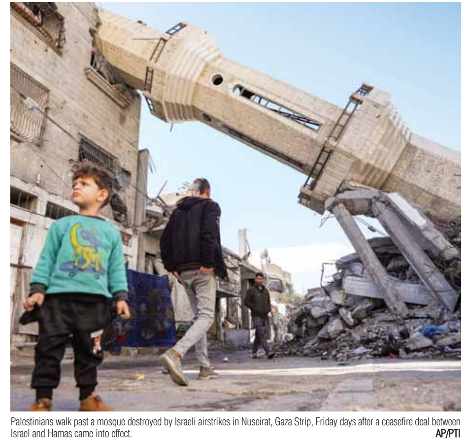
Palestinians walk past a mosque destroyed by Israeli airstrikes in Nuseirat, Gaza Strip, Friday days after a ceasefire deal between Israel and Hamas came into effect.

against such a move. BRICS is an intergovernmental organisation of ten countries — Russia, India, China, South Africa, Egypt, Ethiopia, Indonesia, Iran and the United Arab Emirates. BRICS, formed in 2009, is the only major international group of which the US is not a part. Over the past few years, a few of its member countries, in particular Russia and China, are seeking to have an alternative to the US dollar or create BRICS currency. India, an important pillar of BRICS, has said it was against de-dollarisation. External Affairs Minister S Jaishankar in December said India had never been for de-dollarisation and there was no proposal to have a BRICS currency.