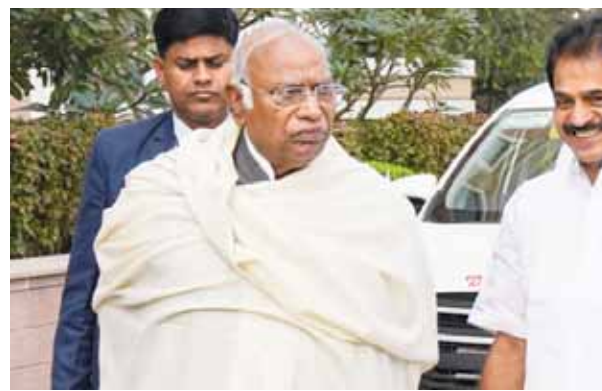
Congress President Mallikarjun Kharge in the Lok Sabha arrives for a meeting of party's general secretaries and state in-charges, in New Delhi

Days after a major organisational rejig in the party, Congress President Mallikarjun Kharge on Wednesday stressed that the top workers will be held accountable for future election results in States under their charge and asking them to be wary of ideologically weak turncoats. Addressing general secretaries and in-charges, including those appointed last week, at a meeting held at the party's new headquarters at Indira Bhawan, Kharge emphasised the importance of promoting those people who are committed to the ideology of the Congress and stand with us like a rock even in adverse circumstances. Kharge also hinted at some more changes in the organisation, saying some changes have already taken place and some more are in the offing. "I want to talk to you about the most important thing of accountability. You all will be held accountable for revamping the organisations in states and for all future election results," he told the office-bearers. The party recently brought in new office bearers in the revamped organisation. Among those who attended the meeting