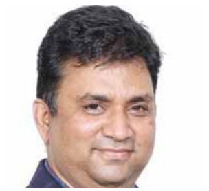
BINOD ANAND ■ NEW DELHI

As India embraces sustainability and innovation, a cooperative economic framework becomes essential to address G-local challenges through responsible Business. This ensures shared growth by fostering collaboration between multinational corporations, small and medium enterprises (SMEs), and government bodies.