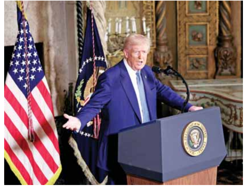
President Donald Trump speaks at Mar-a-Lago in Palm Beach, Fla.

■ WASHINGTON US President Donald Trump has said that he made it clear to Prime Minister Narendra Modi that India will not be spared from Washington's reciprocal tariffs, emphasising that "nobody can argue with me" on tariff structure. Trump made these remarks during an interview with Fox News' Sean Hannity recently. Fox News aired a joint television interview with President Trump and billionaire Elon Musk on Tuesday night. On February 13, hours before Prime Minister Modi's bilateral meeting with Trump in the White House, the US President announced reciprocal tariffs. Under the plan, the Trump administration "will work strenuously to counter non-reciprocal trading arrangements with trading partners by determining the equivalent of a reciprocal tariff with respect to each foreign trading partner." During the interview with Hannity