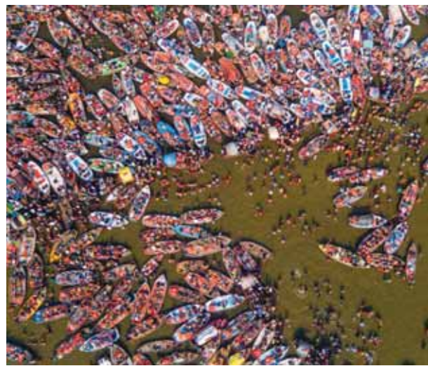
An aerial view of devotees on boats at the Sangam during the ongoing Maha Kumbh Mela, in Prayagraj