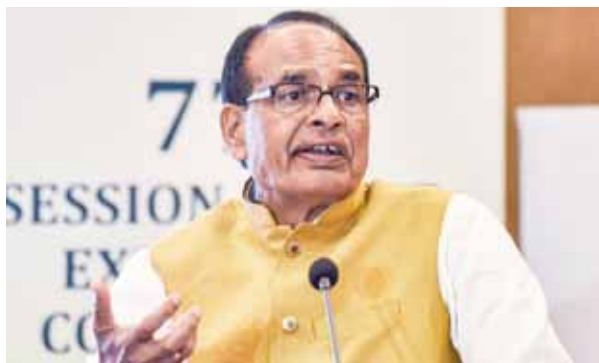
Shivraj Singh Chouhan addresses inaugural Session of 77th Session of Executive Committee of African Asian Rural Development, in New Delhi

India is committed to rural transformation in member nations of the African-Asian Rural Development Organisation (AARDO) and will increase its technical contribution to the forum, Rural Development Minister Shivraj Singh Chouhan said here on Wednesday. He was speaking at the inauguration of the 77th session of the executive committee of the African-Asian Rural Development Organisation (AARDO). "India gives the highest yearly membership contribution to AARDO, which is around USD 1,55,300, and the Indian government has been providing organisation, technical, and financial support to AARDO from time to time," he said. "India will keep playing its role in rural transformation in