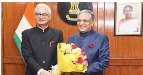
New Chief Election Commissioner Gyanesh Kumar is greeted by Election Commissioner Vivek Joshi

Gyanesh Kumar on Wednesday took over as the 26th Chief Election Commissioner (CEC) while Vivek Joshi assumed charge as an Election Commissioner. An Election Commissioner since March 2024, Kumar was elevated as the CEC on Monday. Gyanesh Kumar replaced Rajiv Kumar, who demitted office on Tuesday, as head of the poll panel. Sukhbir Singh Sandhu is the other election commissioner. Joshi, a former Haryana cadre IAS officer, was appointed as an Election Commissioner on Monday. In his message to voters after assuming charge, Kumar said,