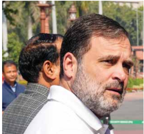
Rahul Gandhi in the Lok Sabha arrives for a meeting of party's general secretaries and state in-charges, in New Delhi