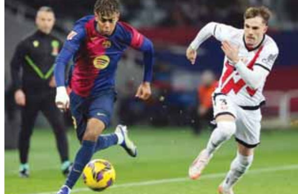
score after that. Augusto Batalla saved well from Lamine Yamal, who was playing the 100th game of his career, while at the other end Jorge De Frutos had the ball in the net for Rayo only to see it ruled out for offside. De Frutos was always dangerous for Rayo but as the game went on the home side took control as it extended its unbeaten run to 12 matches. The defeat ended Rayo nine-game unbeaten streak that stretched back to December 7.

PTI ■ BARCELONA Barcelona returned to the top of the Spanish league on goal difference after Robert Lewandowski's first-half penalty secured a 1-0 win over Rayo Vallecano. The Catalan club on Monday took advantage of weekend slip-ups by Real Madrid and Atlético Madrid to move onto 51 points, the same as Madrid and a point clear of Atlético. Madrid drew 1-1 at Osasuna on Saturday and Atletico was held by the same score at home by Celta Vigo. Barcelona took the lead after 27 minutes when Pathe Ciss brought down Inigo Martinez in the box, and a penalty was awarded after a video review. Lewandowski sent the keeper the wrong way from the spot. Both sides had chances to