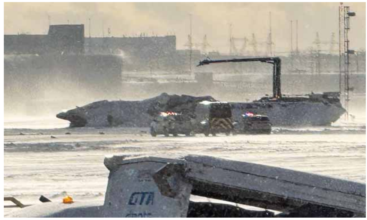
A Delta Air Lines plane heading from Minneapolis to Toronto crashed at Toronto's Pearson Airport.