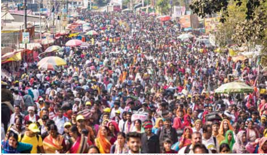
Devotees arrive at Sangam amid a rush during the ongoing Mahakumbh Mela 2025, in Prayagraj

The spike in air traffic is attributed to the massive influx of pilgrims arriving for the grand religious gathering. Official data reveals that on February 16, 10,152 passengers arrived on 60 flights, while 10,145 departed on another 60 flights. On February 15, 10,300 passengers landed, and 9,522 passengers took off.