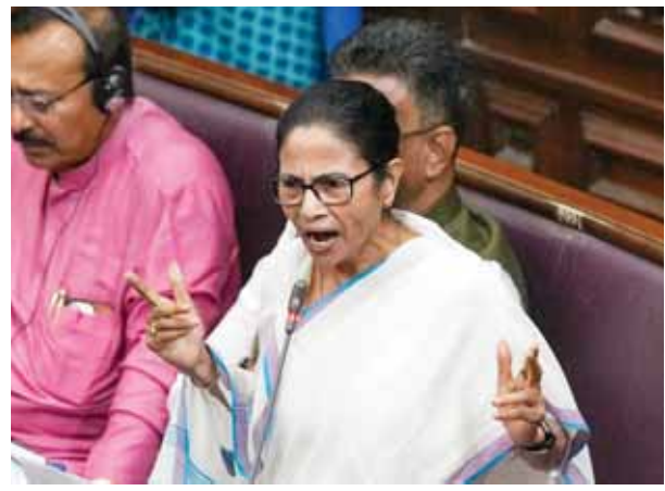
West Bengal Chief Minister Mamata Banerjee speaks during session of the state Legislative Assembly, in Kolkata

Speaking in the State Assembly Banerjee alleged how the BJP's efforts to use religion to earn money had backfired. Banerjee said, "Incidents like stampedes may happen in such big events but the question is whether the deaths could have been avoided with better planning. They only went about blindly publicising the event without caring for the common people. Only VVIPs' interests were taken care of. Maha Kumbh has turned into Mrityu Kumbh." Alleging that the Uttar Pradesh Government hid facts about the actual number of deaths she said "thousands of dead