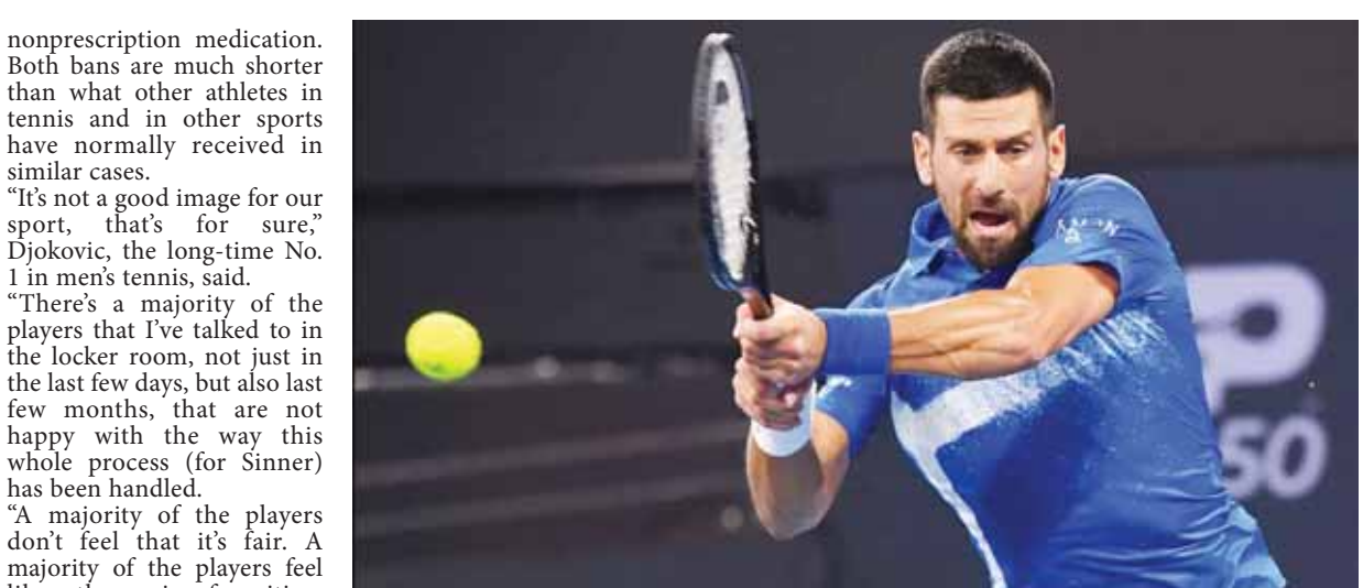
Open. Top-ranked Sinner reached a deal with WADA on Saturday to accept a ban that will have him back playing in time for the French Open in May without having to miss a single Grand Slam tournament. That came after the International Tennis Integrity Agency had decided not to suspend Sinner for what it judged was accidental contamination by a banned anabolic steroid last March. The short ban for Sinner came after five-time Grand Slam champion Iga Swiatek accepted a one-month suspension in November after testing positive for a banned substance that she said was accidentally consumed because of a contaminated nonprescription medication. Both bans are much shorter than what other athletes in tennis and in other sports have normally received in similar cases. "It's not a good image for our sport, that's for sure," Djokovic, the long-time No. 1 in men's tennis, said. "There's a majority of the players that I've talked to in the locker room, not just in the last few days, but also last few months, that are not happy with the way this whole process (for Sinner) has been handled. "A majority of the players don't feel that it's fair. A majority of the players feel like there is favoritism happening. It appears that you can almost affect the outcome if you are a top player, if you have access to

PTI ■ DOHA Novak Djokovic says a majority of tennis players have lost faith in the anti-doping authorities following Jannik Sinner's three-month ban, and there's a widespread feeling that "favoritism" is being shown to the sport's biggest stars. The 24-time major winner called on the World Anti-Doping Agency and the International Tennis Integrity Agency to overhaul their processes for dealing with doping cases "because the system and the structure obviously doesn't work." "Right now there is a lack of trust generally from the tennis players, both male and female, toward WADA and ITIA and the whole process," Djokovic said at the Qatar