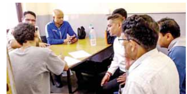
Family members of a Nepal's girl student who died by suicide reach the Kalinga Institute of Industrial Technology (KIIT), in Bhubaneswar

PIONEER NEWS SERVICE ■ BHUBANESWAR/NEW DELHI