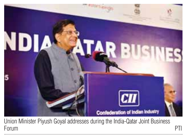
Union Minister Piyush Goyal addresses during the India-Qatar Joint Business Forum

India and the United States (US) are committed to increasing bilateral trade to $500 Billion and negotiating a "strong" trade agreement within the next six-eight months, Commerce and Industry Minister Piyush Goyal said on Tuesday. During the recent visit of Prime Minister Narendra Modi to Washington, India and the US announced to more than double the two-way commerce to $500 Billion by 2030 and negotiate the first tranche of a mutually beneficial, multi-sector bilateral trade agreement (BTA) by fall of 2025. Goyal said once his US counterpart takes charge, both countries will discuss the contours of the pact. "In the next six-eight months, by establishing a strong trade agreement, we are committed to increasing trade to $500 Billion," Goyal said on the sidelines of CII's India-Qatar Business Forum meet. He added businesses of both the countries are excited about the