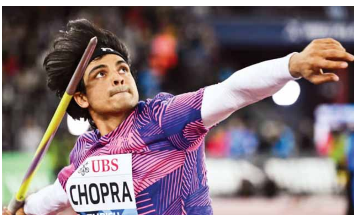
Chopra has been trying hard to hit the 90m mark. His personal best stands at 89.94m which was achieved in 2022. His season begins in May with the Diamond League and would mark the competitive start of his partnership with Zelezny, a former Olympic and world champion who also holds the