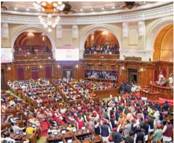
Samajwadi Party leaders protest during the UP Assembly budget session, in Lucknow

Opposition Disrupts Governor's Address The first day of the budget session saw heated exchanges,