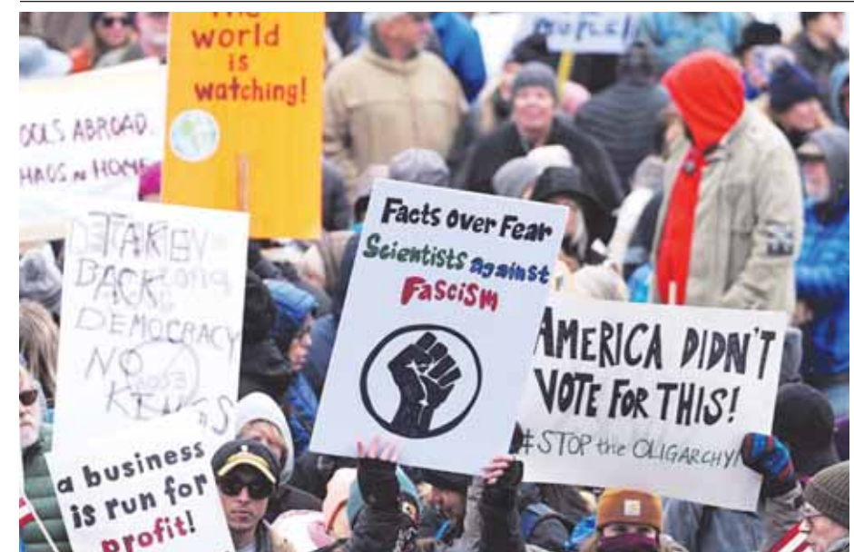
People take part in the 'No Kings Day' protest on Presidents Day in Washington, in support of federal workers and against recent actions by President Donald Trump and Elon Musk, by the Capitol in Washington. The protest was organised by the 50501 Movement, which stands for 50 Protests 50 States 1 Movement.