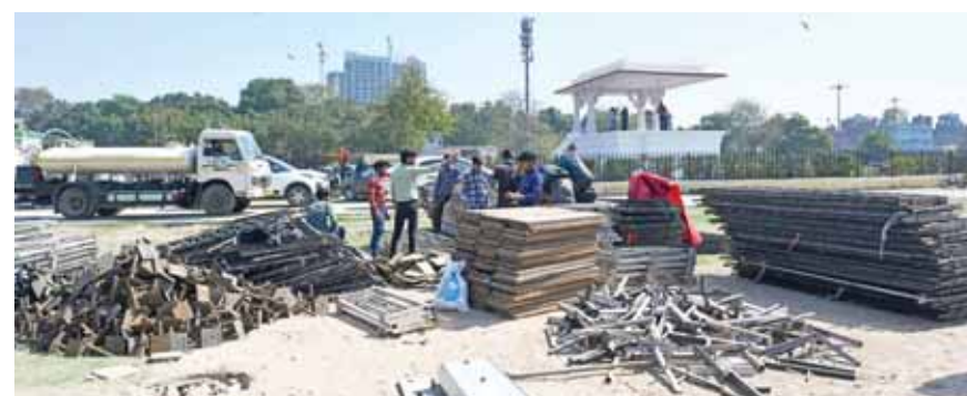
Preparations underway for the oath ceremony of the new Delhi Government, at the Ramlila Maidan