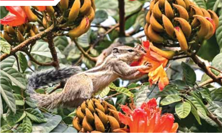
A squirrel enjoys palash flowers, in Nadia