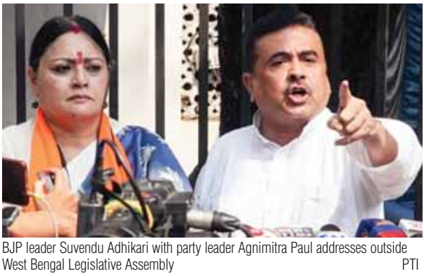
BJP leader Suwendu Adhikari with party leader Agnimitra Paul addresses outside West Bengal Legislative Assembly

Alleging that he and four other MLAs were suspended from the Assembly for raising the issue of disruption of Saraswati Puja in Bengal early this month Adhikari