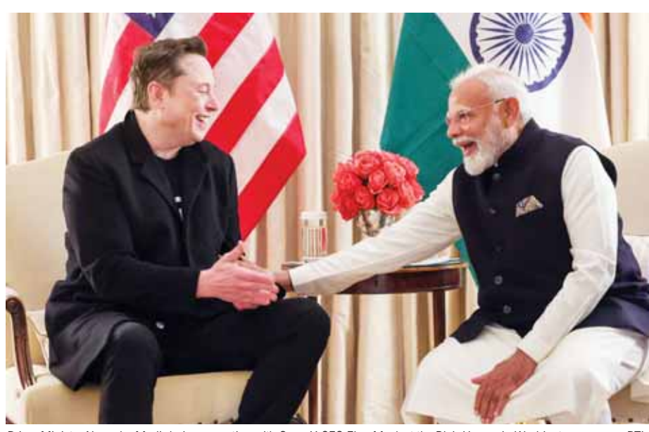
Prime Minister Narendra Modi during a meeting with SpaceX CEO Elon Musk at the Blair House, in Washington

American electric carmaker Tesla has opened recruitments for various roles in India, including business operations analyst and customer support specialist, in what could be a precursor for the company's entry into the country. As per the job postings on the company's website, the posts are for the 'Mumbai Suburban' area. These roles include service advisor, parts advisor, service technician, service manager, sales and customer support, store manager, sales and customer support, business operations analyst, customer support supervisor, customer support specialist, delivery operations specialist, order operations specialist, inside sales advisor, and consumer engagement manager. A mailed query to confirm if the recruitments are part of the company's plans to enter the Indian market and the possible timeline for starting sales in India remained