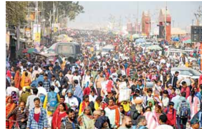
Devotees in a large number during the ongoing Maha Kumbh Mela, in Prayagraj

the chaos subsided, 18 people including 11 women and five children, had lost their lives. More than a dozen people were also injured in the stampede on Saturday night at the railway station which witnessed a surge of passengers waiting to board trains for Prayagraj - where the Maha Kumbh is underway - on platform number 14 and 15 of the station.