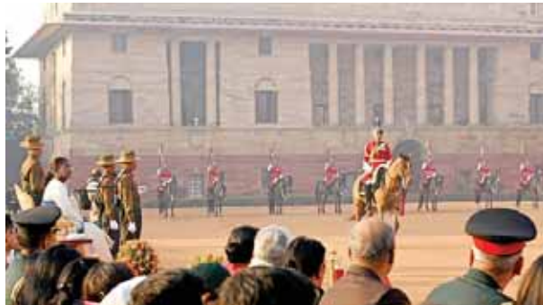
President Droupadi Murmu witnesses the inaugural show of the Change of Guard Ceremony in a new format at the Forecourt of Rashtrapati Bhavan, in New Delhi

The change of guard ceremony at Rashtrapati Bhavan will now be held in a new format, featuring an elaborate visual and musical performance against the backdrop of the presidential palace, an official statement said on Sunday. The new format includes military drills by troops and horses of the President's Bodyguard, along with personnel from the Ceremonial Guard Battalion and the Ceremonial Military Brass Band. The display will be spread over a larger area, the statement added. President Droupadi Murmu witnessed the inaugural ceremony in its new format on Sunday at the forecourt of Rashtrapati Bhavan, according to the statement issued by her office.