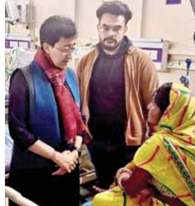
Acting Chief Minister of Delhi, Atishi visits injured victims of the New Delhi Railway Station stampede at the LNJP Hospital in New Delhi

Opposition parties on Sunday blamed the government for "gross mismanagement" at New Delhi railway station that led to a stampede in which 18 people died and demanded Railway Minister Ashwini Vaishnaw resign taking moral responsibility. Several opposition parties, including the Congress, the Left, Trinamool Congress and the Rashtriya Janata Dal, accused the government of failing to make elaborate arrangements and "covering up" the actual number of deaths. The BJP leaders, however, sought to defend the government by posting pictures on social media that showed the situation at the New Delhi railway station had turned normal. Congress president Mallikarjun Kharge said it was extremely shameful and condemnable that the Narendra Modi government was attempting to "hide the truth" about the deaths. In a social media post, the party said, "The railway minister should resign, apologise to the country." Former Congress chief Rahul Gandhi said better arrangements should have been made at the station in view of the large number of devotees going to Prayagraj for the Maha Kumbh. "This incident once again highlights the failure of the Railways and the insensitivity of the government," he said in a social media post. Former Railway minister and senior Congress leader Pawan Kumar Bansal said the ultimate responsibility of the tragedy lies with the minister and he cannot escape it.