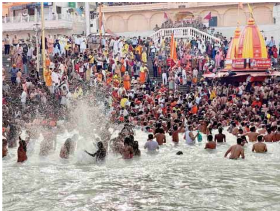
Sadhus bathing at Har Ki Paidi in Haridwar during the 2021 Kumbh

(The author is a writer, traveler and anthropologist; views expressed are personal)