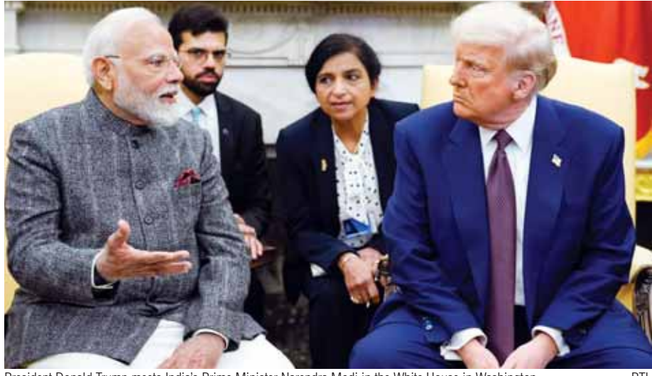
President Donald Trump meets India's Prime Minister Narendra Modi in the White House in Washington

"TRUST initiative on critical minerals and advanced materials marks a significant