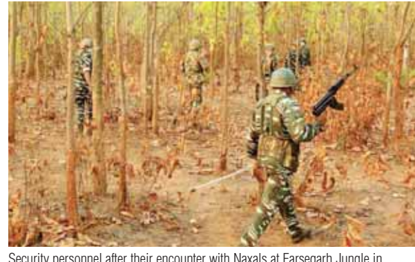
Security personnel after their encounter with Naxals at Farsagarh Jungle in Bijapur, Chhattisgarh

The CRPF has opened a new operations base in the heart of a strong Maoist corridor in Chhattisgarh's south Bastar region as part of its expanding footprint into core Left Wing Extremism-affected areas of the state. The forward operating base at 'Pujari Kanker' in the Bijapur district was established on February 13 by the 196th and 205th CoBRA battalion of the force along with assistance from various other units of the paramilitary force deployed in and around the area, officials said. The remote area where the forward operating base (FOB) has been established is surrounded by hills and houses training camps, weapons and ammunition dump and rations units of the Maoists from the south and west Bastar divisions, the officials said.