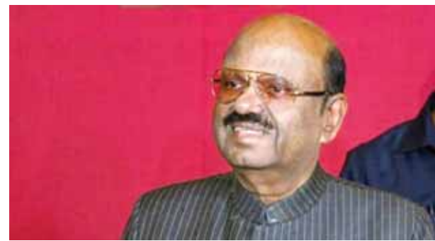
West Bengal Governor C V Ananda Bose

West Bengal Governor C V Ananda Bose on Sunday dismissed criticism over his speech in the assembly on the first day of the budget session, asserting that his address was a reflection of the state's government's policies and not a Raj Bhavan policy statement. Soon after Bose's address on February 10, Leader of Opposition in the assembly Suvendu Adhikari had said the speech was a revised version of what the state government had initially provided to him. "The governor's address is not the governor's policy statement, but that of the state government. As such the government's policy statement is to be delivered based on the advice of the council of