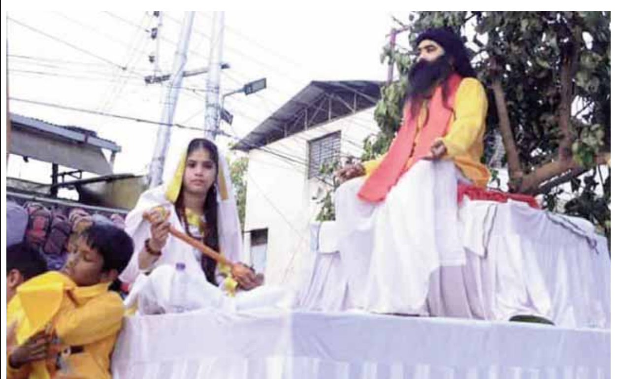
Artists atop a tableau during a procession on the occasion of Sant Ravidas Jayanti in Dehradun on Tuesday