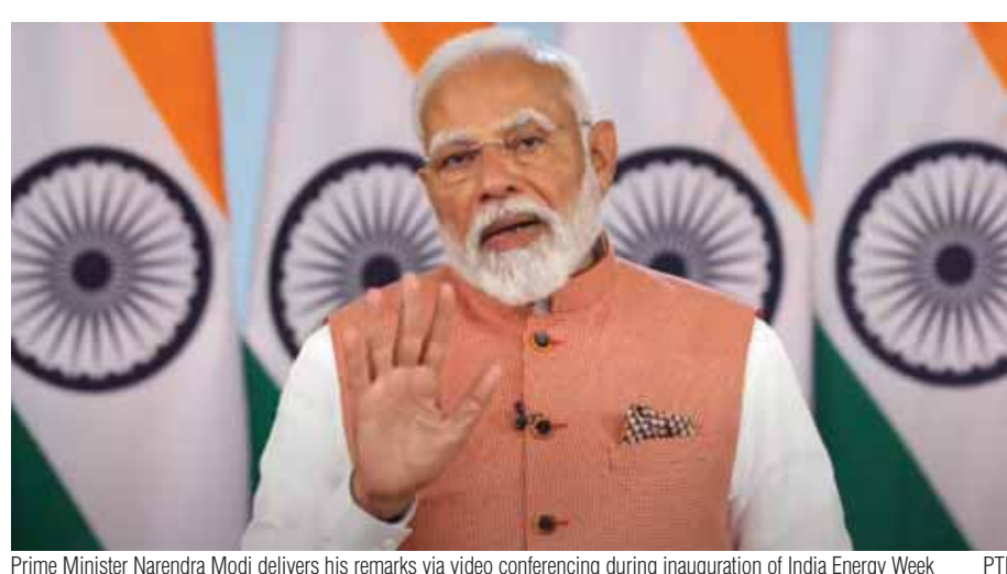
Prime Minister Narendra Modi delivers his remarks via video conferencing during inauguration of India Energy Week

important part of India's energy ambitions," Modi told investors. He further said, "All experts are saying that 21st century is India's century. Bharat is not only driving it is own growth but driving global growth." India's energy ambitions, he said, are based on five pillars. "We have resources, which we are harnessing. We are encouraging our brilliant minds to innovate. Thirdly, we have economic strength and political stability," he said. Also, he said, India has strategic geography, which makes energy trade easier and more attractive. Besides, India is committed towards global sustainability and this is aiding new possibilities in the country's energy sector, the prime minister said. For Viksit Bharat, the next two decades are very crucial, he said, adding that in the next five years we will cross many