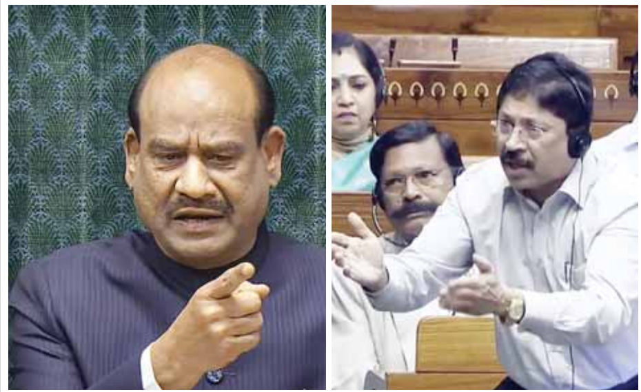
Lok Sabha Speaker Om Birla and DMK MP Dayanidhi Maran during the Budget session of Parliament, in New Delhi