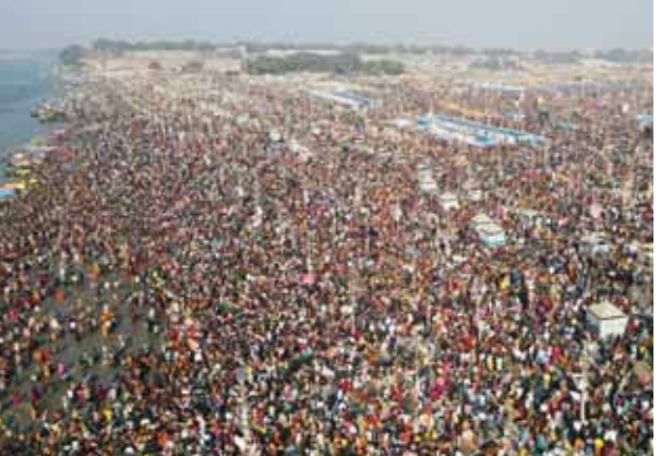
Devotees perform rituals at Sangam after taking a holy dip on the eve of Maghi Purnima bath festival during ongoing Maha Kumbh Mela, in Prayagraj

approach emphasises mutual capacity building, prosperity and security for the sovereignty of our partner nations,” he said. “We do not believe in transactional relationships or imposing solutions. Indian solutions are not prescriptive. Instead, we aim to empower our partners to chart their own paths, through support that aligns with their national priorities,” he added. India's position as a preferred partner for defence exports is reinforced by adherence to quality, reliability and commitment to the specific needs of partners, the defence minister said. “Our defence industry is well-equipped to meet diverse requirements, from cutting-edge technology to cost-effective solutions,” he added. The challenges like terrorism, cyber-crime, humanitarian crises and climate-induced disasters, transcend borders, and they demand a united response, he said. “The BRIDGE initiative represents our commitment to transforming dialogue into actionable outcomes, fostering partnerships that are resilient, adaptable and forward-looking,” he said. “India stands ready to work with all nations in crafting solutions that are innovative, equitable and sustainable. Together, we can build a future where security and prosperity go hand in hand, ensuring peace and stability for generations to come,” he added.