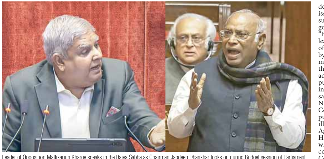
Leader of Opposition Mallikarjun Kharge speaks in the Rajya Sabha as Chairman Jagdeep Dhankhar looks on during Budget session of Parliament, in New Delhi, Tuesday

categorical, the Constitution signed by the founding fathers of the Constitution, carrying 22 miniatures, is the only authentic one and it can include amendments by the Parliament. If there is any change effected by judiciary or any institution, it is not acceptable to this House. "I will appeal to the Leader of the House to ensure that in the country only the authentic version of the Indian Constitution be promulgated. Any violation of this should be taken quite seriously by the government and severe action taken," the Chairman said in the House. Kharge was first given the floor to speak on the issue, who alleged that the BJP was unnecessarily raising the issue to create a controversy. "They are unnecessarily raising the issue and want to create a controversy on Ambedkar's Constitution. They never raised this issue when Ambedkar, Patel, others were alive...Now they are bringing new