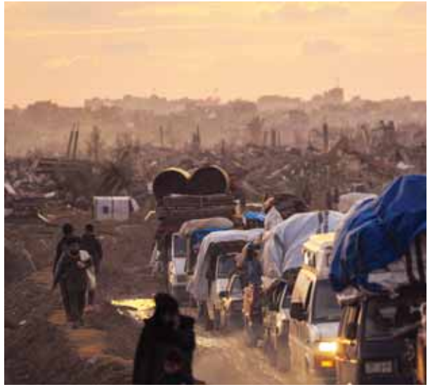
Displaced Palestinians, travelling in vehicles, wait in line to pass through a security checkpoint at the Netzarim corridor as they make their way from central Gaza to their homes in the northern Gaza Strip, on Monday

Hamas has brushed off President Donald Trump’s threat that “all hell” will break out if it does not release the remaining Israeli hostages held in the Gaza Strip by Saturday. Hamas spokesman Sami Abu Zuhri said Tuesday that the dozens of hostages would only be returned if all parties remain committed to a ceasefire deal reached last month. “Trump must remember there is an agreement that must be respected by both parties,” he said, adding that threatening language only complicates matters. Hamas has threatened to delay the next release of three Israeli hostages, due Saturday, accusing Israel of violating the ceasefire agreement, including by not allowing a surge of tents and shelters into the devastated territory. While Trump said the ceasefire should be cancelled if Hamas doesn’t release all the remaining hostages Saturday, he also said such a decision would be up to Israel. During the first phase of the ceasefire, Hamas has com-