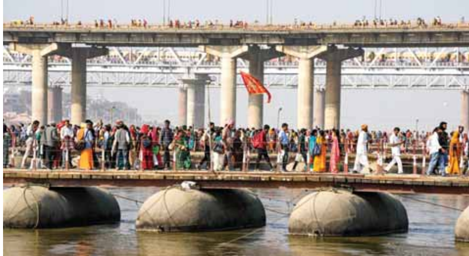
Rush of devotees on pontoon bridge on the eve of 'Magh Purnima' during the ongoing Mahakumbh Mela, in Prayagraj

citywide starting at 5 pm, with designated parking zones arranged for incoming pilgrims. These traffic controls will remain in force until Wednesday to facilitate an orderly dispersal of devotees. However, emergency and essential services will not be affected by the curbs. Additionally, the restrictions will extend to Kalpvasi-pilgrims who observe extended stays near the Sangam as part of their religious practice. On Monday night, Uttar Pradesh Chief Minister Yogi Adityanath convened a high-level meeting with police and civic officials to assess readiness for Maghi Purnima. Stressing the importance of seamless traffic and crowd management, he instructed authorities to fully utilise parking facilities capable of accom-