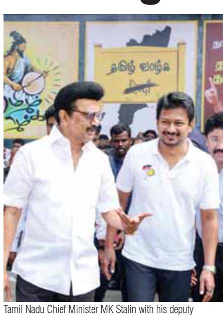
Udayanithi Stalin and others at the opening of 'Kalaignar Centenary Boxing Academy' in Chennai