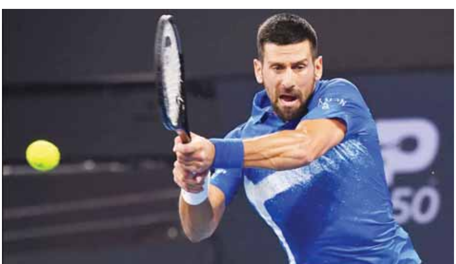
Novak Djokovic says a majority of tennis players have lost faith in the anti-doping authorities following Jannik Sinner's three-month ban, and there's a widespread feeling that "favoritism" is being shown to the sport's biggest stars. The 24-time major winner called on the World Anti-Doping Agency and the International Tennis Integrity Agency to overhaul their processes for dealing with doping cases "because the system and the structure obviously doesn't work." "Right now there is a lack of trust generally from the tennis players, both male and female, toward WADA and ITIA and the whole process," Djokovic said at the Qatar Open. Top-ranked Sinner reached a deal with WADA on Saturday to accept a ban that will have him back playing in time for the French Open in May without having to miss a single Grand Slam tournament. That came after the International Tennis Integrity Agency had decided not to suspend Sinner for what it judged was accidental contamination by a banned anabolic steroid last March. The short ban for Sinner came after five-time Grand Slam champion Iga Swiatek accepted a one-month suspension in November after testing positive for a banned substance that she said was accidentally consumed because of a contaminated nonprescription medication. Both bans are much shorter than what other athletes in tennis and in other sports have normally received in similar cases. "It's not a good image for our sport, that's for sure," Djokovic, the long-time No. 1 in men's tennis, said. "There's a majority of the players that I've talked to in the locker room, not just in the last few days, but also last few months, that are not happy with the way this whole process (for Sinner) has been handled. "A majority of the players don't feel that it's fair. A majority of the players feel like there is favoritism happening. It appears that you can almost affect the outcome if you are a top player, if you have access to the top lawyers and whatnot." Sinner had been scheduled to play in Qatar before accepting the ban. The handling of Sinner's case had already raised questions about double standards, and when the ban was announced it was widely criticized by other players. The positive tests weren't publicly revealed until

nonprescription medication. Both bans are much shorter than what other athletes in tennis and in other sports have normally received in similar cases. "It's not a good image for our sport, that's for sure," Djokovic, the long-time No. 1 in men's tennis, said. "There's a majority of the players that I've talked to in the locker room, not just in the last few days, but also last few months, that are not happy with the way this whole process (for Sinner) has been handled. "A majority of the players don't feel that it's fair. A majority of the players feel like there is favoritism happening. It appears that you can almost affect the outcome if you are a top player, if you have access to