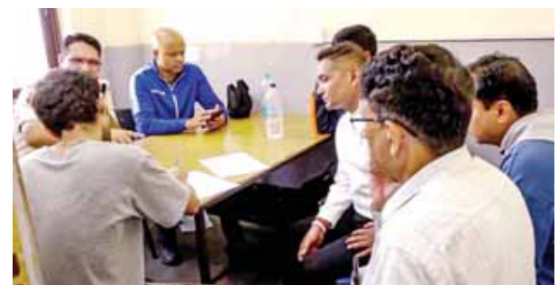
Family members of a Nepal's girl student who died by suicide reach the Kalinga Institute of Industrial Technology (KIIT), in Bhubaneswar

PIONEER NEWS SERVICE ■ BHUBANESWAR/NEW DELHI