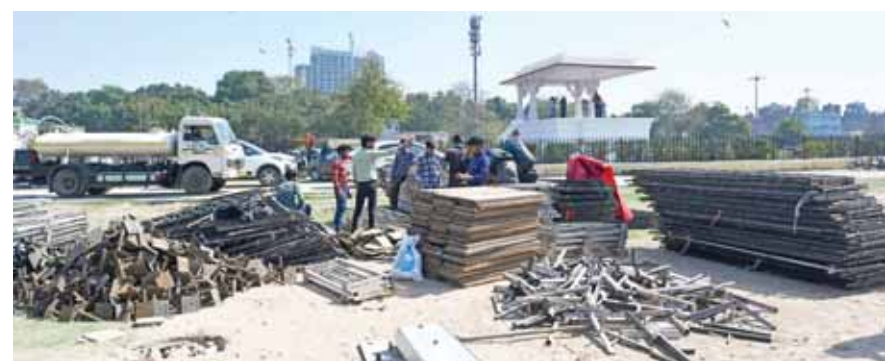
Preparations underway for the oath ceremony of the new Delhi Government, at the Ramlila Maidan

threats," the bench said. The bench directed that no further FIRs shall be lodged against him for his comments during the YouTube show, "India's Got Latent". The top court also restrained Allahbadia and his associate influencers on the controversial YouTube show from airing any other episode till further orders. It directed Allahbadia to deposit his passport at the Thane police station and said he shall not leave the country without the prior permission of the court. The bench directed Allahbadia to cooperate in the probe of the FIRs lodged at Maharashtra and Assam.