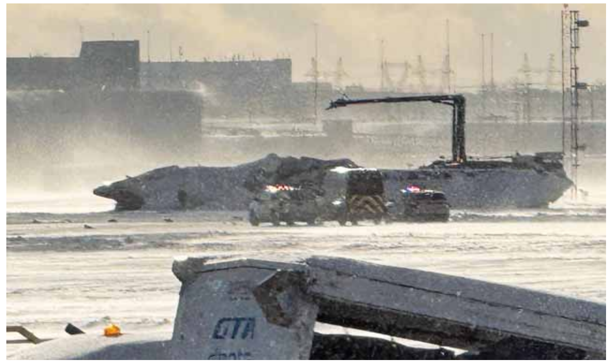
A Delta Air Lines plane heading from Minneapolis to Toronto crashed at Toronto's Pearson Airport.