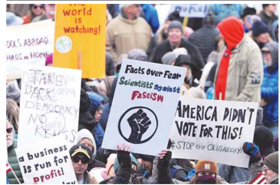
People take part in the 'No Kings Day' protest on Presidents Day in Washington, in support of federal workers and against recent actions by President Donald Trump and Elon Musk, by the Capitol in Washington. The protest was organised by the 50501 Movement, which stands for 50 Protests 50 States 1 Movement.