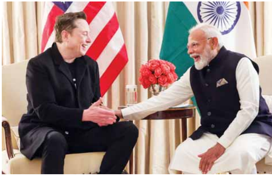
Prime Minister Narendra Modi during a meeting with SpaceX CEO Elon Musk at the Blair House, in Washington

A mailed query to confirm if the recruitments are part of the company's plans to enter the Indian market and the possible timeline for starting sales in India remained