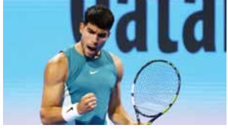
Alcaraz overcame Croatian veteran Marin Cilic 6-4, 6-4 to reach the round of 16 at the Qatar Open. The 36-year-old Cilic, the 2014 U.S. Open champion who has fallen to No. 192 in the rankings, was on Monday playing his first match of the season after recovering from a long-term knee injury. The Croatian led 4-3 and 0-40 on Alcaraz's serve in the second set, but the Spanish four-time major winner managed to recover and then broke in the next game. "I am just really happy that I stayed calm at that moment, breathing, going through my routines, making good points," Alcaraz said. "That's why I was able to win in two sets." Alcaraz will play either Zhang Zhizhen of China or Italy's Luca Nardi next. Earlier, seventh-seeded Grigor Dimitrov lost 6-4, 6-4 to Jiri Lehecka. Also on Monday, eighth-seeded Jack Draper beat Alexei Popyrin 6-2, 7-6 (4) to set up a meeting with another Australian, Christopher O'Connell. Several other top players will play their first matches on Tuesday. Second-seeded Alex de Minaur will face Roman Safiullin. Novak Djokovic, who had to pull out of his Australian Open semifinal with a hamstring injury, will take on Matteo Berrettini.

PTI ■ DOHA Top-seeded Carlos Alcaraz overcame Croatian veteran Marin Cilic 6-4, 6-4 to reach the round of 16 at the Qatar Open. The 36-year-old Cilic, the 2014 U.S. Open champion who has fallen to No. 192 in the rankings, was on Monday playing his first match of the season after recovering from a long-term knee injury. The Croatian led 4-3 and 0-40 on Alcaraz's serve in the second set, but the Spanish four-time major winner managed to recover and then broke in the next game. "I am just really happy that I stayed calm at that moment, breathing, going through my routines, making good points," Alcaraz said. "That's why I was able to win in two sets." Alcaraz will play either Zhang Zhizhen of China or Italy's Luca Nardi next. Earlier, seventh-seeded Grigor Dimitrov lost 6-4, 6-4 to Jiri Lehecka. Also on Monday, eighth-seeded Jack Draper beat Alexei Popyrin 6-2, 7-6 (4) to set up a meeting with another Australian, Christopher O'Connell. Several other top players will play their first matches on Tuesday. Second-seeded Alex de Minaur will face Roman Safiullin. Novak Djokovic, who had to pull out of his Australian Open semifinal with a hamstring injury, will take on Matteo Berrettini.