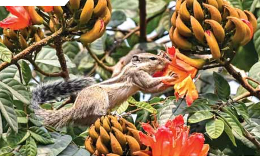
A squirrel enjoys palash flowers, in Nadia