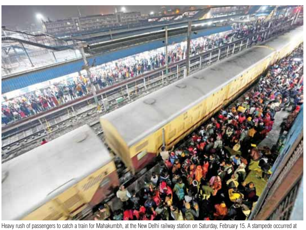
the station killing 18 and injuring many others

authorities' Some blamed mismanagement and a sudden change in platform, while many