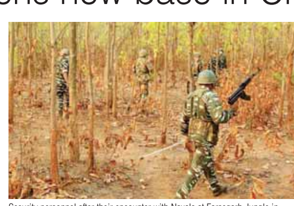
Security personnel after their encounter with Naxals at Farsegarh Jungle in Bijapur, Chhattisgarh

officials said. The remote area where the forward operating base (FOB) has been established is surrounded by hills and houses training camps, weapons and ammunition dump and rations units of the Maoists from the south and west Bastar divisions, the officials said.