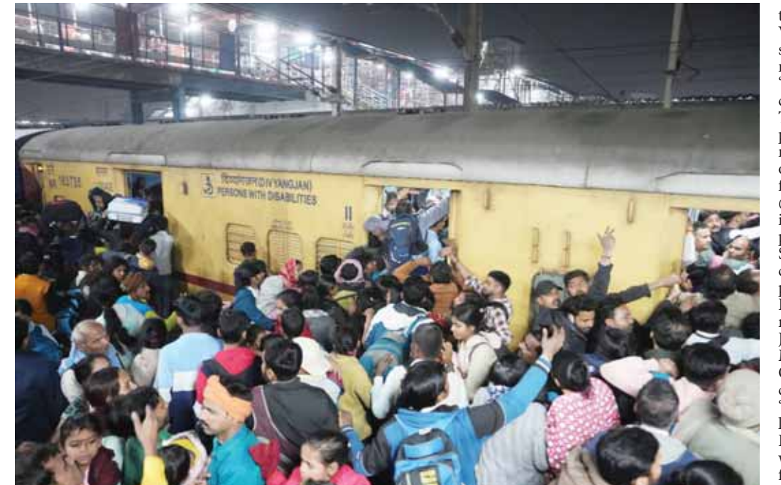
Heavy rush of passengers to catch a train for Mahakumbh, at the New Delhi railway station

"I am extremely anguished by the injured and give a place to the virtuous souls in his feet. Om Shanti," he said in his social media