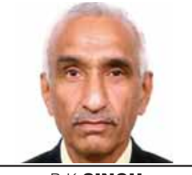
B K SINGH

As Donald Trump embarks on his second term as the US President, the nation faces a turbulent landscape of climate disasters and economic uncertainty