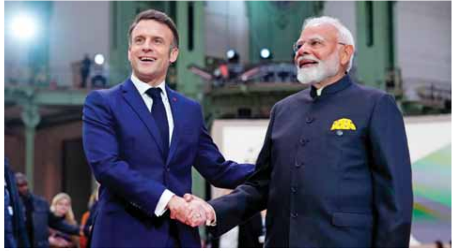
French President Emmanuel Macron shakes hands with India's Prime Minister Narendra Modi as they arrive to the Artificial Intelligence Action Summit at the Grand Palais in Paris, France

Prime Minister Narendra Modi on Tuesday made a strong case for collective efforts to establish a global framework for artificial intelligence (AI) based on open source which enhances trust, transparency and is free from biases. Co-chairing the AI Action Summit along with French President Emmanuel Macron here, Modi said that AI is changing the polity, economy, security and society, and is writing the code for humanity in this century. Modi also offered to host the next AI Action Summit in India, supporting the decision taken at the first summit hosted by France to set up the 'AI Foundation' and the 'Council for Sustainable AI'. "There is a need for collective global efforts to establish governance and standards that uphold our shared values, address risks and build trust," Modi said, adding that governance is not just about managing risks and rivalries but is also about promoting innovations and deploying them for global good. "We must democratise technology and create people-centric applications. We must address concerns related to cyber security, disinformation and deep fakes," the Prime Minister said. Stressing on the need to develop quality data sets free from biases, the Prime Minister said there is a need to develop open-source AI ecosystems that enhance trust and transparency. He said the technology should be rooted in the local ecosystem for it to be effective and useful. Modi started his address with