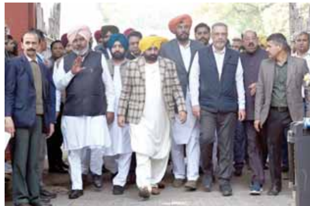
Punjab CM Bhagwant Mann with AAP MLAs talks to the media after a meeting at the Kapurthala House

Amidst reports of exodus of MLAs, Aam Aadmi Party (AAP) convener Arvind Kejriwal met Punjab chief minister Bhagwant Mann and 91 state MLAs in Delhi on Tuesday and dismissed speculation of internal discord within the party stating that "all is well" in the party. After the meeting, which lasted for about an hour, Mann and other leaders outright rejected the possibility of Kejriwal becoming the Chief Minister of Punjab and about 35 MLAs in Punjab breaking away and joining the Congress. "Our MLAs arrived here for a meeting with party national convener Arvind Kejriwal, who expressed his gratitude for their efforts in campaigning during the Delhi Assembly elections," the chief minister said. He said the party accepts the verdict of the people in the Delhi Assembly elections while praising the AAP's 'Delhi model' of governance. The meeting sent out a strong signal about there being no threat to the party's government in Punjab amid claims by the rival Congress about a brewing discontent