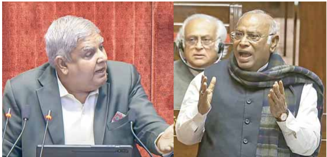
Leader of Opposition Mallikarjun Kharge speaks in the Rajya Sabha as Chairman Jagdeep Dhankhar looks on during Budget session of Parliament, in New Delhi, Tuesday

categorical, the Constitution signed by the founding fathers of the Constitution, carrying 22 miniatures, is the only authentic one and it can include amendments by the Parliament. If there is any change effected by judiciary or any institution, it is not acceptable to this House. "I will appeal to the Leader of the House to ensure that in the country only the authentic version of the Indian Constitution be promulgated. Any violation of this should be taken quite seriously by the government and severe action taken," the Chairman said in the House. Kharge was first given the floor to speak on the issue, who alleged that the BJP was unnecessarily raising the issue to create a controversy. "They are unnecessarily raising the issue and want to create a controversy on Ambedkar's Constitution. They never raised this issue when Ambedkar, Patel, others were alive...Now they are bringing new