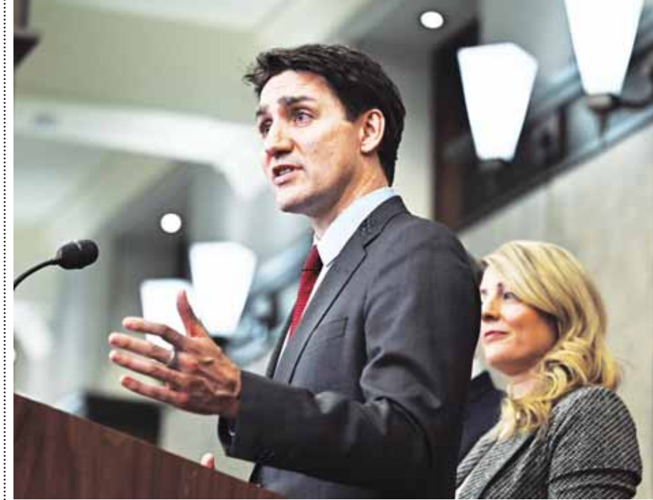
Canada's Prime Minister Justin Trudeau addresses media following the imposition of a raft of tariffs by US President Donald Trump against Canada, Mexico and China, in Ottawa on Saturday.

'You're worried about grocery prices. Don's raising prices with his tariffs," Senate Democratic Leader Chuck Schumer of New York posted on X. "You're worried about tomato prices. Wait till Trump's Mexico tariffs raise your tomato prices. ... You're worried about car prices. Wait till Trump's Canada tariffs raise your car prices," he wrote in a series of posts.