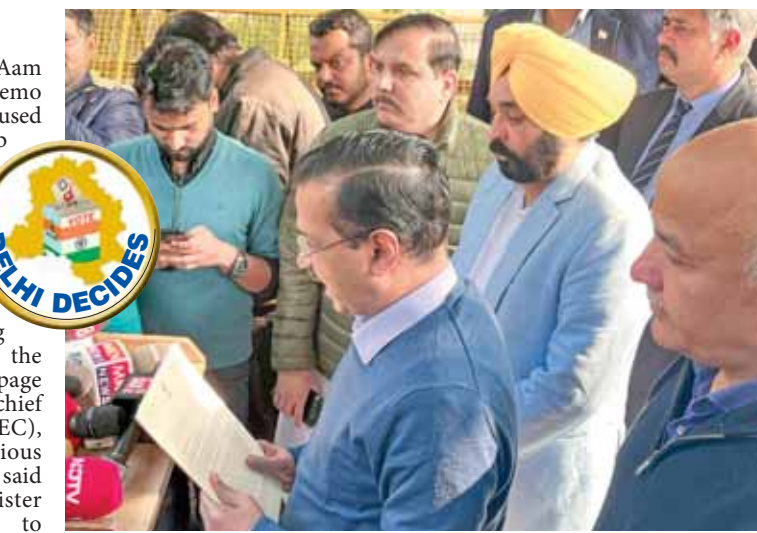
AAP national convener Arvind Kejriwal with Punjab CM Bhagwant Mann and AAP MP Sanjay Singh before leaving to meet Election Commissioners, in New Delhi.

In a startling revelation, Aam Aadmi Party (AAP) supremo Arvind Kejriwal on Friday accused Haryana Chief Minister Nayab Singh Saini of hatching a "conspiracy" to "influence" and force half of Delhi's population to thirst due to the "poisonous" Yamuna water to defame his party ahead of the Assembly polls on February 5 by sending highly-polluted waters to the national Capital. In his six-page written reply addressed to the chief election commissioner (CEC), AAP chief raised serious allegations against Saini and said the Haryana Chief Minister orchestrated a "conspiracy" to influence the Delhi assembly election. He demanded that a criminal case should be filed against Saini regarding the 'poisonous' Yamuna issue. In the response to the Commission's second notice, Kejriwal clarified that his earlier statements, which referenced the Yamuna being "poisoned," were made in the context of the rising ammonia levels in the water and were not intended to suggest any malicious intent outside of this environmental crisis. Warning that water could be used as a weapon to win elections if the EC fails to act, he said he was shocked that the poll body did not pass any order for the Haryana Chief Minister but chose to "hound" him.