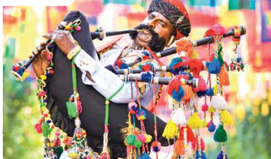
A folk artist at the 'Jaipur Literature Festival' (JLF), in Jaipur