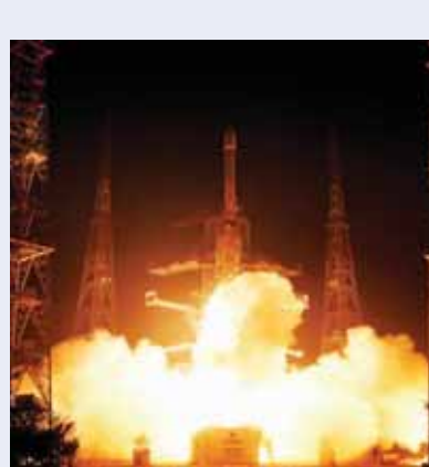
ISRO has added yet another feather to its cap with its 100th launch of GSLV, its most trusted workhorse rocket, from Sriharikota in 46 years and is planning to launch another hun-

dred of them in the next five years. GSLV is capable of launching satellites for both geosynchronous orbit (when it appears motionless from a point on the equator—primarily used for weather and communication and is placed at a very high altitude of about 42,000 km) and sun-synchronous orbit (when the satellite is passing over the same location at the same local time—used for imaging, weather forecasting, spying, and global observation at low altitudes of about 700 km, capable of capturing high-resolution images as a result). This launch has put India in a much better situation to be self-reliant in its technology, giving a boost to its economy, defence, and spatial dominance in the near future. The ISRO scientists need to be applauded for their time-bound achievements and speed through their hard work and dedication.