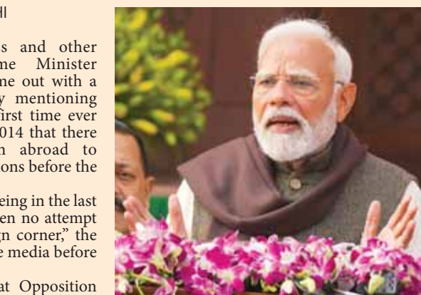
Prime Minister Narendra Modi addresses the media on the first day of the Budget Session of Parliament.

priceless opportunity for the young MPs," Modi said. Ahead of the tabling of the Economic Survey, the PM said his government has been working in mission mode in its third term for an all-round development and asserted that innovation, inclusion and investment have shaped its economic agenda. Modi also shared that several historic bills will be taken up during the Session and will become laws after comprehensive debate to strengthen the country. "Particularly, important decisions will be taken during the Session to empower women to ensure they get equal rights and any sectarian or faith-based discrimination is removed," he said. Modi also expressed confidence that every MP, especially the young ones, will contribute to the agenda of 'Viksit Bharat' during the session. Stressing on the mantra of 'Reform, Perform and Transform', Modi said fast-paced development has to be achieved and the maximum emphasis is on reform. He said the state and Central governments have to perform together and one can see transformation through public participation.