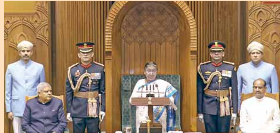
President Droupadi Murmu addresses the joint sitting of both Houses of Parliament on the first day of the Budget Session in New Delhi.