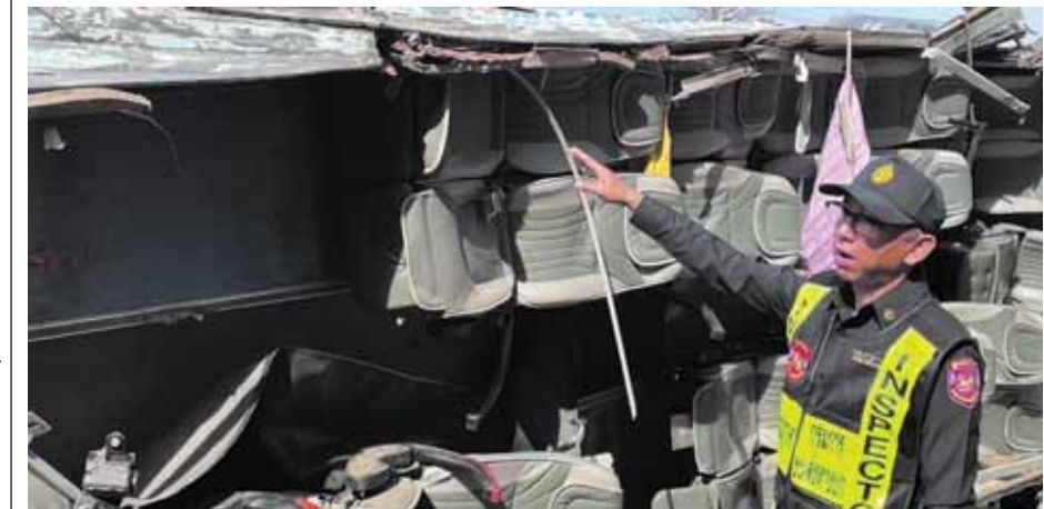
An investigator inspects the accident site where a bus travelling from northern Thailand overturned in eastern Prachinbur province, killing multiple people on Wednesday.

This number increased to seven upon the establishment of the permanent Supreme Court in 2010. The count was reduced back to five in 2014 under former President Abdulla Yameen's administration, only to be increased to seven again during former President Ibrahim Mohamed Solih's tenure," the PSM News added.