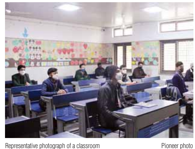
Representative photograph of a classroom