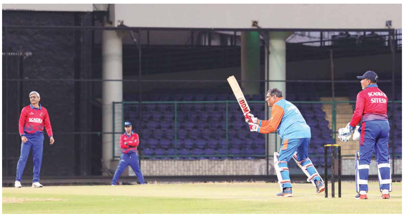
Chief Justice of India Justice Sanjiv Khanna plays a shot during a cricket match of the first SC Advocate On Records Association Vs CJI XI in New Delhi.