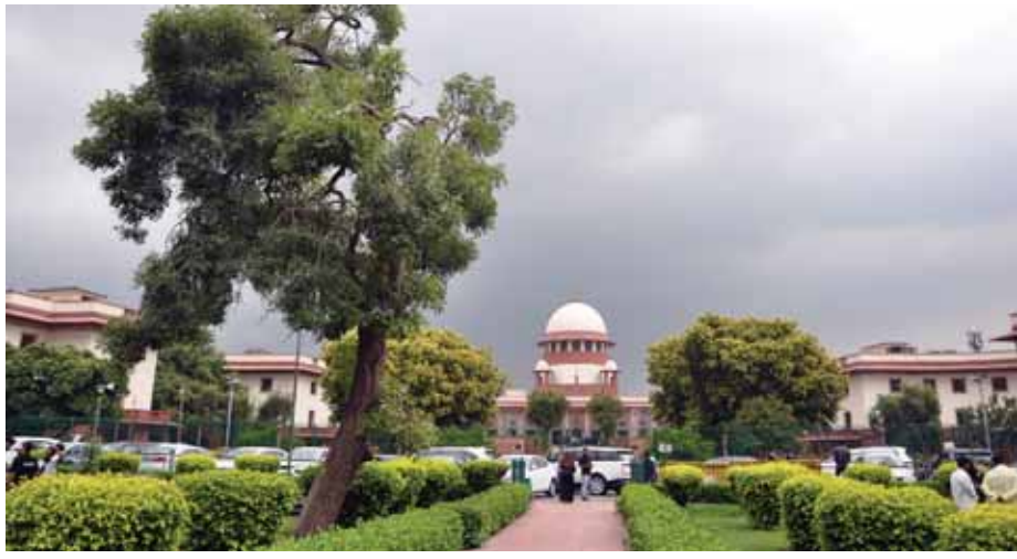
Supreme Court of India