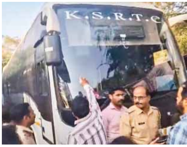
UBT workers stage protest by blackening buses bearing Karnataka number plates after Marathi bus drivers were allegedly assaulted in Karnataka's Belagavi.

Bus services between Karnataka and Maharashtra have been affected due to attack on bus drivers from both sides amid the sudden flare-up of border row in Belagavi in the last two days. The decades-old dispute resurfaced on Friday when a bus driver and a conductor were beaten up for allegedly not speaking in Marathi at Marihal in Belagavi. The bus conductor stated in his police complaint that a girl asked for a ticket in Marathi. When he said he did not know Marathi and asked her to speak in Kannada, she and her male friend attacked him. At Marihal, a group of youths intercepted the bus and beat up the conductor. While police arrested four people for the attack, the conductor has also been booked for 'indecent behaviour' with the minor girl on a