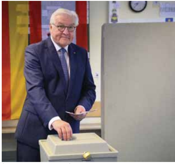
German President Frank-Walter Steinmeier casts his vote at a polling station in Berlin, Germany, on Sunday.

Germany's electoral system rarely produces absolute majorities, and no party looks anywhere near one this time. It's expected that two or more parties will form a coalition, following potentially difficult negotiations that will take weeks or even months before the Bundestag elects the next chancellor.