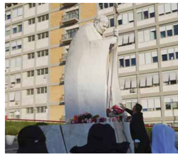
Nuns pray for Pope Francis in front of the Agostino Gemelli Polyclinic, in Rome, on Saturday