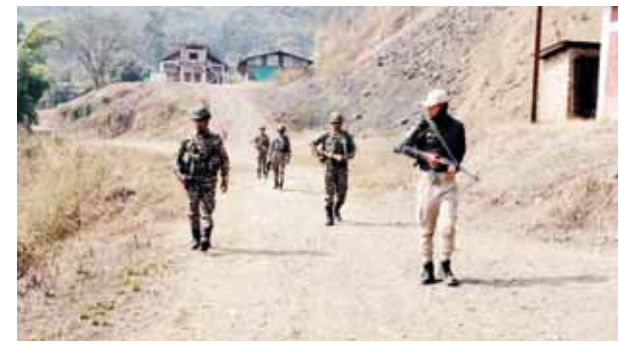
Security personnel during search operations and area domination in Manipur.