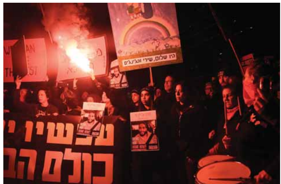
Demonstrators light a flare during a protest demanding the immediate release of hostages held by Hamas in the Gaza Strip, in Tel Aviv, Israel, on Saturday

sent tanks to the territory since 2002, in response to a deadly Palestinian uprising. The refugee camps are home to descendants of Palestinians who fled or were forced to flee during wars with Israel decades ago. Netanyahu under pressure to crack down on the West Bank: Under interim peace agreements from the early 1990s, Israel maintains control over large parts of the West Bank while the Palestinian Authority administers other areas. Israel regularly sends troops into Palestinian zones but it typically withdraws them once forces complete their missions. The UN says the current operation is the longest since the Palestinian uprising of the early 2000s. Violence has surged in the West Bank throughout the Israel-Hamas war. Israel has carried out repeated raids dur-