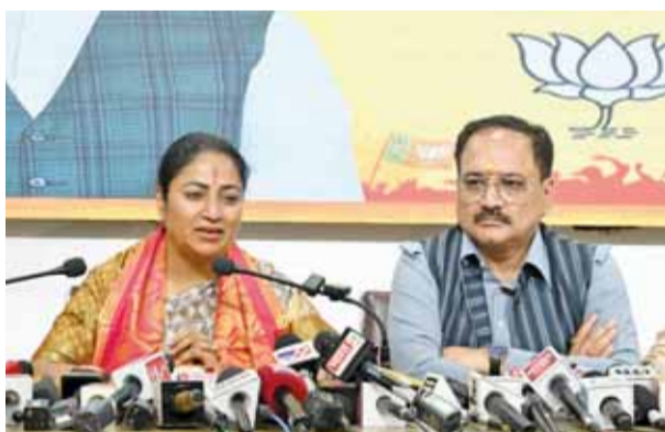
Delhi CM Rekha Gupta and Delhi BJP President Virendra Sachdeva address a press conference