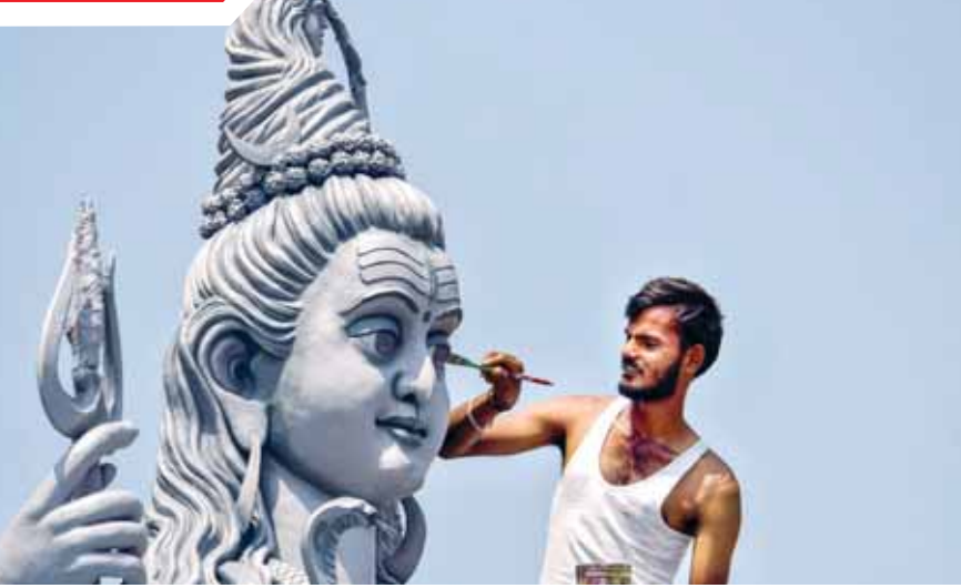
A worker paints the statue of Lord Shiva ahead of the Maha Shivaratri festival, in Chikmagalur