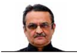
B K JHA

(The writer is a senior journalist; views are personal)