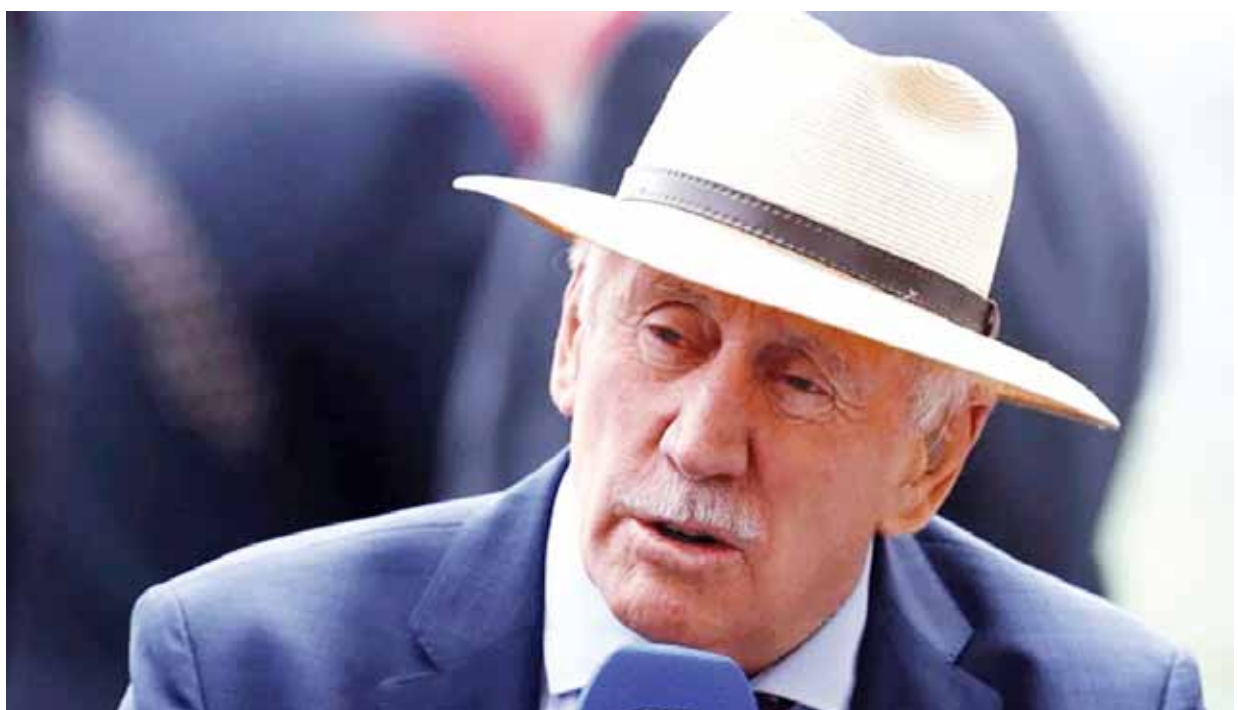
example as a test case. Chappell added his columns has a "substantial influence" of American sports writer Walter Wellesley "Red" Smith. "The influence of Pulitzer-winning writer 'Red' Smith

Ponting's aggression, and VVS Laxman's classic 281 in Kolkata," Chappell wrote. However, he felt the time was right for him to "put down the pen and pack away the computer", adding that retirement from journalism was as emotional as stepping away from cricket. "I have been writing for more than 50 years, but the time has come and this will be my last column. Retirement from journalism is similar to cricket - I knew the time was right," said the former top-order batter, who played 75 Tests, scoring 5,345 runs. "In my playing days I asked former Australia captain Richie Benaud if retirement was a difficult decision. 'No Ian,' Benaud replied wisely, 'It's easy. You'll know the right time.'" Chappell said he would miss writing columns and shared an anecdote about how alcohol cannot enhance the quality of a piece, giving his