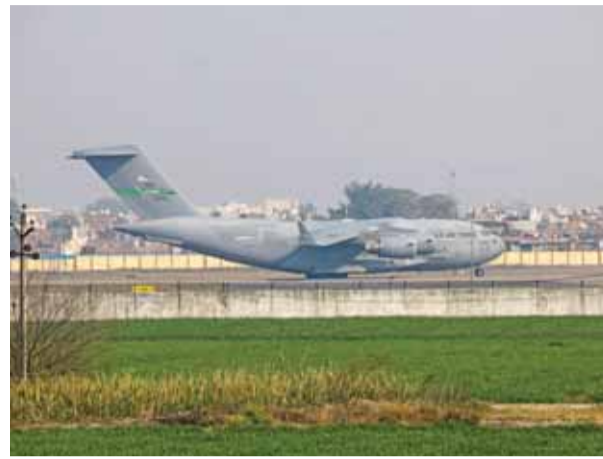
US military aircraft carrying Indian deportees upon its landing at the Shri Guru Ramdas Ji International Airport in Amritsar, on February 5

Azam looked million dollars while playing those trademark cover drives for a few boundaries off Harshit Rana and Hardik Pandya.