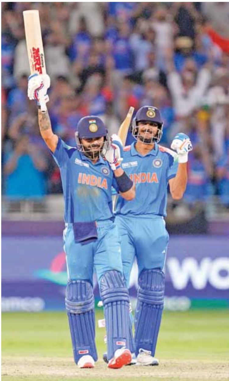
Virat Kohli celebrates his century with Axar Patel after scoring the winning runs during the ICC Champions Trophy between India and Pakistan, at Dubai International Cricket Stadium

Perhaps, the biggest hope Pakistan harboured against Kohli would have been leg-spinner Abrar Ahmed, considering the Indian's recent