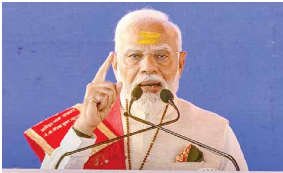
Prime Minister Narendra Modi addresses during the foundation stone laying of Bageshwar Dham Medical and Science Research Institute in Madhya Pradesh.

Prime Minister Narendra Modi on Sunday slammed the Opposition for allegedly mocking religious traditions and attempting to divide society and said they have a "slave mentality." His remarks came amid the ongoing criticism from several opposition leaders regarding the Maha Kumbh, currently taking place in Prayagraj. Addressing a gathering in Madhya Pradesh's Chhattarpur, the Prime Minister criticised politicians who, he claimed, ridicule faith and cultural practices, describing them as people with a "slave mentality" who undermine India's religious heritage. "Nowadays, we see that there is a group of leaders who mock religion, ridicule it, are engaged in dividing people and many times foreign powers also try to weaken the country and religion by supporting these people. People who have the Hindu faith have been living in some phase or the other for centuries," Modi said without taking any names. Furthermore, the Prime Minister also slammed those targeting temples, traditions and festivals, emphasising that