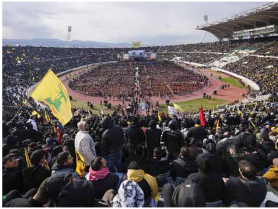
People gather for the funeral ceremony of the Lebanon's late Hezbollah leaders Hassan Nasrallah and Hashem Safieddine at the Sports City Stadium in Beirut, Lebanon, on Sunday