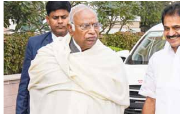
Congress President Mallikarjun Kharge in the Lok Sabha arrives for a meeting of party's general secretaries and state in-charges, in New Delhi

Days after a major organisational rejig in the party, Congress President Mallikarjun Kharge on Wednesday stressed that the top workers will be held accountable for future election results in States under their charge and asking them to be wary of ideologically weak turncoats. Addressing general secretaries and in-charges, including those appointed last week, at a meeting held at the party's new headquarters at Indira Bhawan, Kharge emphasised the importance of promoting those people who are committed to the ideology of the Congress and stand with us like a rock even in adverse circumstances. Kharge also hinted at some more changes in the organisation, saying some changes have already taken place and some more are in the offing. "I want to talk to you about the most important thing of accountability. You all will be held accountable for revamping the organisations in states and for all future election results," he told the office-bearers. The party recently brought in new office bearers in the revamped organisation. Among those who attended the meeting