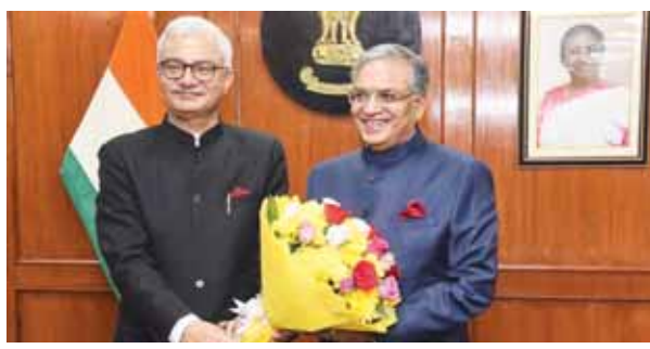
New Chief Election Commissioner Gyanesh Kumar is greeted by Election Commissioner Vivek Joshi

Gyanesh Kumar on Wednesday took over as the 26th Chief Election Commissioner (CEC) while Vivek Joshi assumed charge as an Election Commissioner. An Election Commissioner since March 2024, Kumar was elevated as the CEC on Monday. Gyanesh Kumar replaced Rajiv Kumar, who demitted office on Tuesday, as head of the poll panel. Sukhbir Singh Sandhu is the other election commissioner. Joshi, a former Haryana cadre IAS officer, was appointed as an Election Commissioner on Monday. In his message to voters after assuming charge, Kumar said,