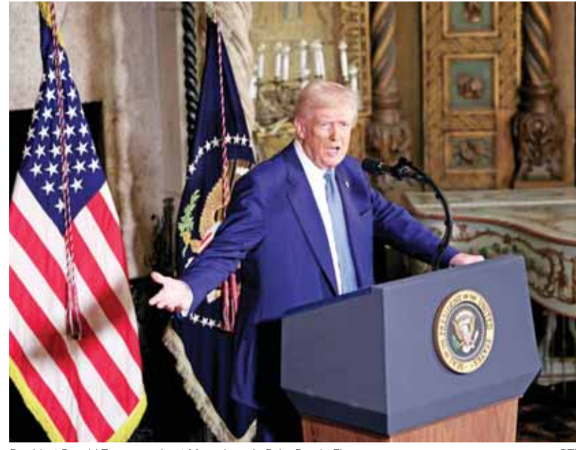
President Donald Trump speaks at Mar-a-Lago in Palm Beach, Fla.