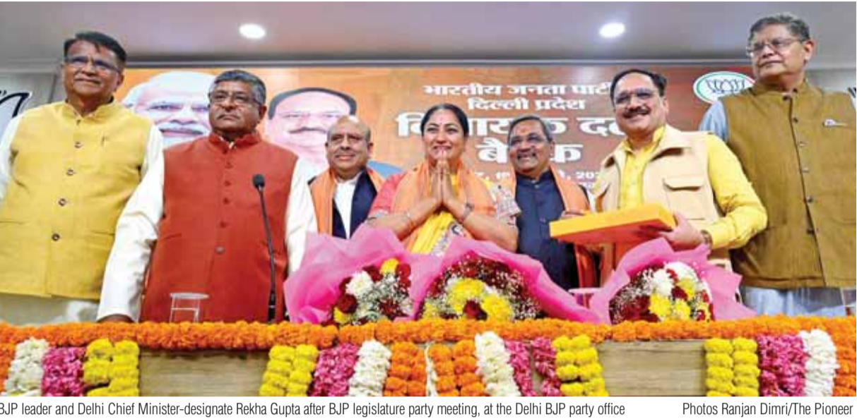
BJP leader and Delhi Chief Minister-designate Rekha Gupta after BJP legislature party meeting, at the Delhi BJP party office.

PUBLISHED FROM: DELHI | LUCKNOW | BHOPAL | BHUBANESWAR | RANCHI | RAIPUR | CHANDIGARH | DEHRADUN | HYDERABAD | VIJAYWADA