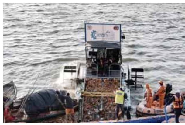
Cleanliness drive at Mahakumbh mela in Prayagraj

But since this poses a complex array of logistical challenges, especially in managing the immense waste generated by such a gathering, deployment of trash skimmers at Prayagraj by the Urban Development Department as part of Swachh Bharat Mission is being executed by Cleantec Infra, and