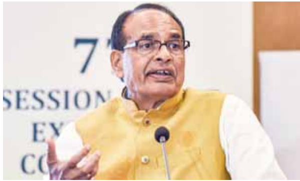
Shivraj Singh Chouhan addresses inaugural Session of 77th Session of Executive Committee of African Asian Rural Development, in New Delhi

India is committed to rural transformation in member nations of the African-Asian Rural Development Organisation (AARDO) and will increase its technical contribution to the forum, Rural Development Minister Shivraj Singh Chouhan said here on Wednesday. He was speaking at the inauguration of the 77th session of the executive committee of the African-Asian Rural Development Organisation (AARDO). "India gives the highest yearly membership contribution to AARDO, which is around USD 1,55,300, and the Indian government has been providing organisation, technical, and financial support to AARDO from time to time," he said. "India will keep playing its role in rural transformation in