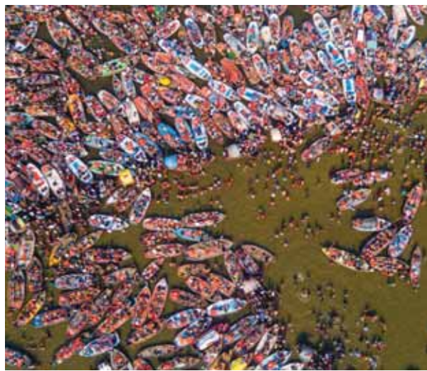
An aerial view of devotees on boats at the Sangam during the ongoing Maha Kumbh Mela, in Prayagraj