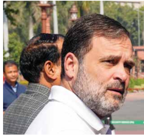
Rahul Gandhi in the Lok Sabha arrives for a meeting of party's general secretaries and state in-charges, in New Delhi