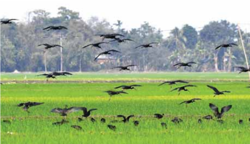
A flock of ibis flying over a paddy field, in Nagaon