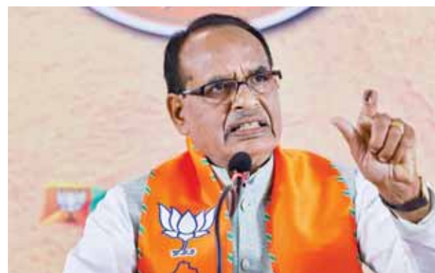
Union Rural Development Minister Shivraj Singh Chauhan

Union Rural Development Minister Shivraj Singh Chauhan on Tuesday will inaugurate the National Geospatial Knowledge-based Land Survey of Urban Habitations (NAKSHA) to create and update land records in urban areas in 152 Urban Local Bodies (ULBs) across 26 states and three Union Territories (UTs). The event will take place in Raisen, Madhya Pradesh, the ministry said in a statement. The Department of Land Resources, Ministry of Rural Development, Government of India, has initiated this pilot program. The NAKSHA program aims to create and update land records in the urban areas to ensure accurate and reliable docu-