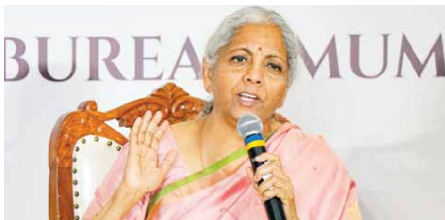
Union Finance Minister Nirmala Sitharaman addresses a press conference, in Mumbai

Seeking to assuage concerns over Foreign Institutional Investors (FII) selling Indian equities lately, Finance Minister Nirmala Sitharaman on Monday attributed the action to profit booking. Speaking to reporters in the financial capital, Sitharaman said the Indian economy is one where the investors are bagging better returns which leads to profit booking. "FIIs also go out when they are able to or in a position to book profits. Indian market today, Indian economy today, has an environment in which investments are also yielding good returns and profit booking is also happening," she said. It can be noted that FIIs have sold over ₹1.56 Lakh Crore of stocks since October last year, including nearly ₹1 Lakh Crore