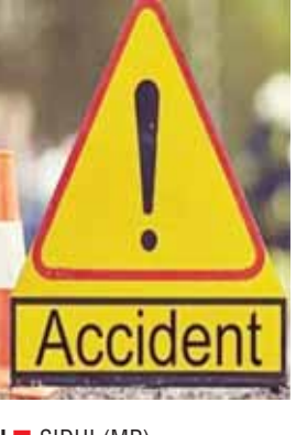
PTI ■ SIDHI (MP)

Four persons were killed, and as many others sustained injuries after an SUV heading for the Maha Kumbh in Prayagraj overturned in Madhya