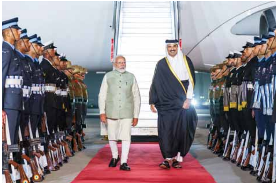
Prime Minister Narendra Modi receives the Amir of the State of Qatar Sheikh Tamim Bin Hamad Al-Thani upon his arrival in India, in New Delhi.

Amir of Qatar Sheikh Tamim Bin Hamad Al-Thani, who is scheduled to pay a state visit to India on February 17-18, will meet President Droupadi Murmu and hold talks with Prime Minister Narendra Modi on Tuesday. According to a media advisory issued by Ministry of External Affairs (MEA) on Monday, he is expected to arrive in New Delhi later this evening. His visit will provide "further momentum to our growing multifaceted partnership", the MEA had said in a statement on Saturday. He will be accompanied by a high-level delegation, including ministers, senior officials and a business delegation, it said. According to the media advisory, External Affairs Minister S Jaishankar will call on him on Monday evening after his arrival.