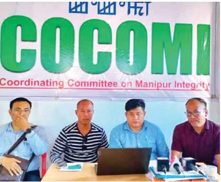
The members of the Coordinating Committee on Manipur Integrity

The Coordinating Committee on Manipur Integrity (CCOMI), an umbrella body of several Imphal-based civil society organisations of the Meiteis, on Monday urged Manipur Governor Ajay Kumar Bhalla to help establish a "duly elected government within this month" in the state which is under President's Rule. In a memorandum to the governor, the CCOMI sought his immediate intervention to address the ongoing crisis that has severely impacted the political, social and economic stability of the state. President's rule was imposed in Manipur and the assembly put under suspended animation on the evening of February 13, days after Chief Minister N Biren Singh resigned from his post. Biren Singh, who was heading the BJP-led government in Manipur since 2017, resigned as chief minister after nearly 21 months of ethnic violence that has claimed over 250 lives so far since May 2023. "The people of Manipur are in dire need of clarity and assurance from the highest consti-