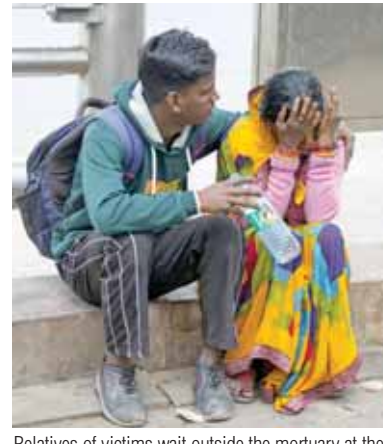
Relatives of victims wait outside the mortuary at the LNJP Hospital in New Delhi