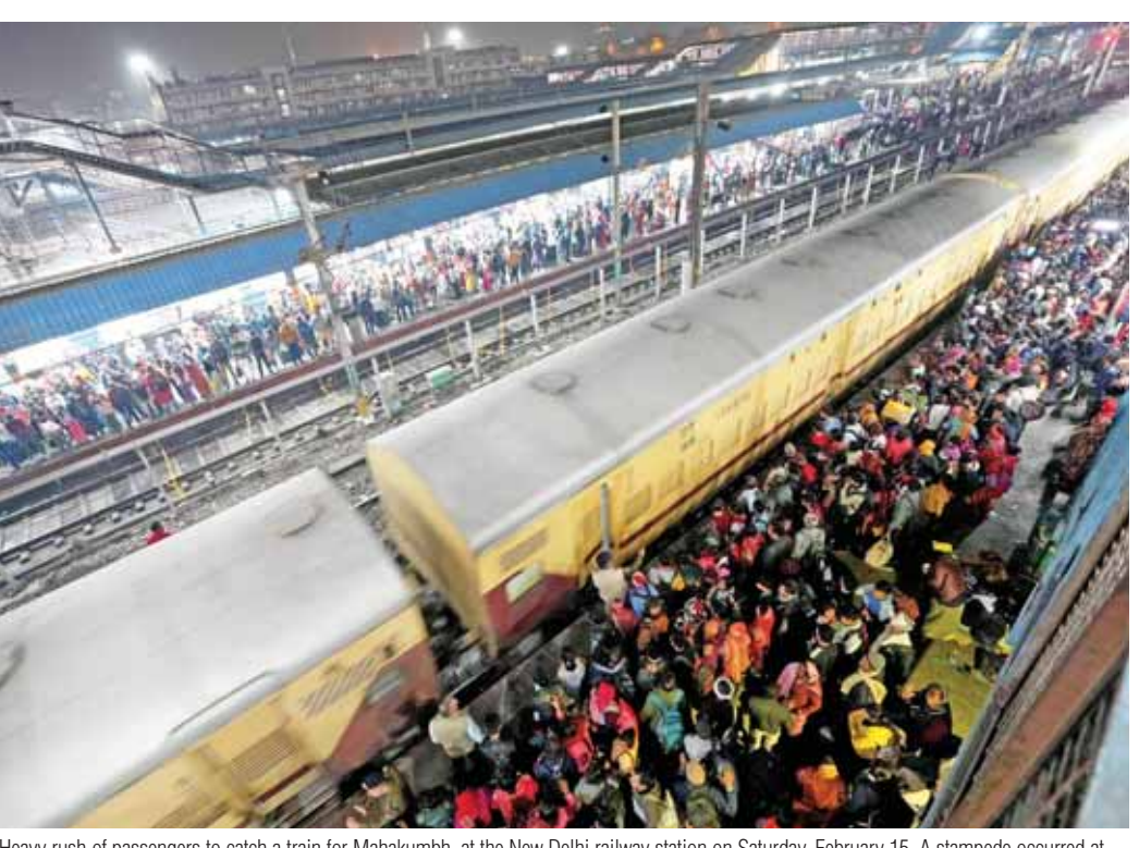
Heavy rush of passengers to catch a train for Mahakumbh, at the New Delhi railway station on Saturday, February 15. A stampede occurred at the station killing 18 and injuring many others

mismanagement and a sudden change in platform, while many