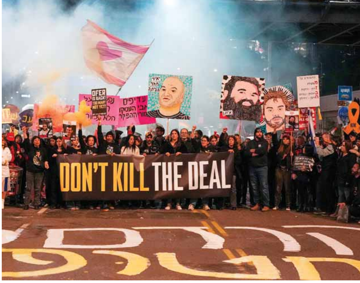
Protesters demanding the immediate release of hostages held by Hamas in the Gaza Strip, in Tel Aviv, Israel, on Saturday

Zelenskyy, in a Telegram post on Sunday, said Russia "confirms its desire to continue fighting by striking Ukraine daily", adding that this week, "almost 1,200 aerial bombs, over 850 strike drones, and more than 40 missiles of various types were launched by the Russians against our people". The three-day Munich conference was a hub of crisscrossing economics, and defense and security, with top envoys on hand from places as diverse as Syria and Saudi Arabia, and Japan and South Korea, as well as many European