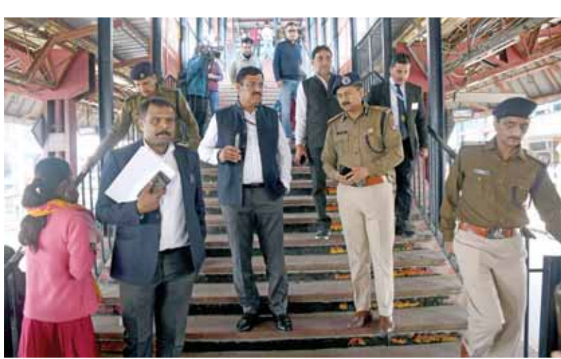
Officials at the incident spot on Platform number 14 at the New Delhi Railway Station on Sunday