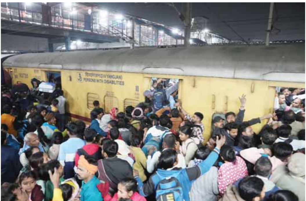
Heavy rush of passengers to catch a train for Mahakumbh, at the New Delhi railway station

"I am extremely anguished by the injured and give a place to the virtuous souls in his feet. Om Shanti," he said in his social media terrible news coming in from New Delhi Railway Station. On behalf of the people of Assam, we offer our