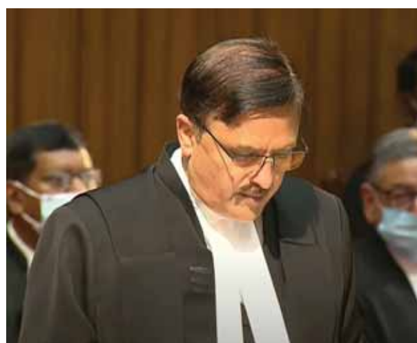
Supreme Court Justice Abhay Oka File Photo

rule and jail the exception. Referring to Section 41 of Code of Criminal Procedure (CrPC), he said it was not necessary or mandatory for the police to arrest each and every accused even in cases where the offence is punishable with a jail term of more than seven years. "Presence of accused for investigation can be secured by issuing summons. But the ground level reality is very different. There is lot of pressure exerted on police machinery by citizens, NGOs, political leaders and media. Political leaders make statements that they will ensure the accused is arrested and put behind bars," the apex court judge said. "This is the sad reflection of the retributive tendency which still exists in our society. People still believe that once a person is arrested he is guilty," he said while criticising the ongoing trend of trial on social media. "Every citizen has right to criticise judgements. But it has to be constructive criticism. But this media trial or trial on social media platforms is not correct. People lack basic elementary knowledge of our criminal justice system. They do not know the difference between bail and acquittal. As judges we