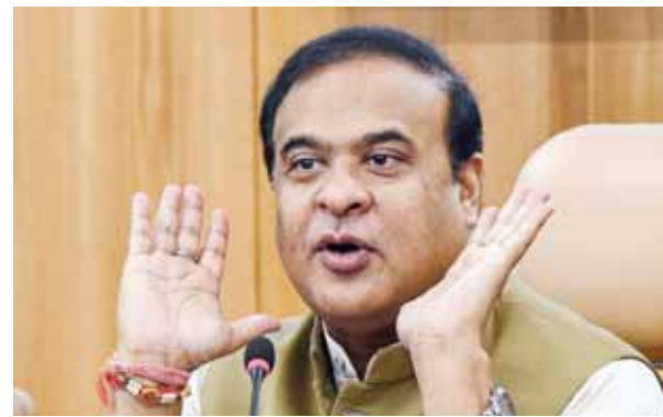
Assam Chief Minister Himanta Biswa Sarma File Photo

Assam Chief Minister Himanta Biswa Sarma on Saturday said that travel advisory against the northeastern region by several countries is a major challenge in attracting investments, even as the state gears up for a mega business summit here later this month. Sarma said he has requested the countries to view Assam in isolation and not club all the North Eastern states together. He said talks are already underway with Japan, Australia and other nations to persuade them to withdraw the adverse advisory as the local government is pushing for viewing Assam "in isolation" from the other states of the region. Addressing a press conference in the run-up to Advantage Assam 2.0 Investment and Infrastructure Summit, Sarma said, "Most embassies have marked Assam in