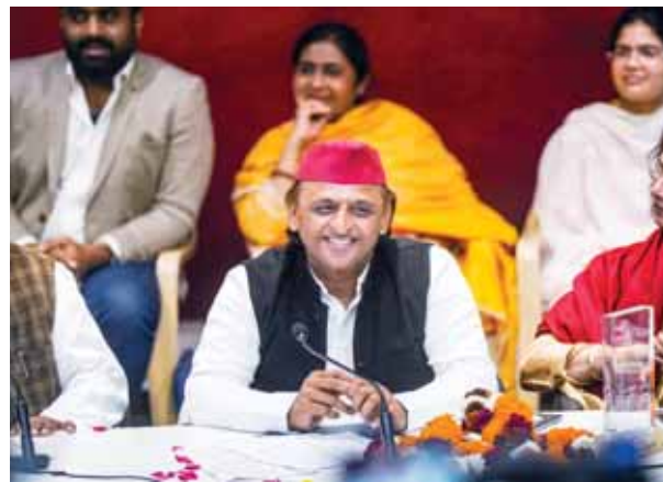
SP President Akhilesh Yadav during a press conference in Lucknow

Samajwadi Party (SP) chief Akhilesh Yadav has urged the Uttar Pradesh government to extend the duration of the ongoing Maha Kumbh, citing the overwhelming influx of devotees still hoping to participate. Yadav claimed that in previous years, the Maha Kumbh and Kumbh Mela spanned 75 days, whereas the current schedule is significantly shorter. "Even now, many people wish to visit the Maha Kumbh but are unable to do so. In such a situation, the government should extend its duration," Yadav said. Visuals circulating on social media depict overcrowded trains, congested roads, and massive crowds making their way to the pilgrimage site. Earlier this week, roads leading to the Maha Kumbh Mela witnessed severe traffic congestion stretching for kilometers, while the Prayagraj Sangam railway station was temporarily shut down due to the overwhelming rush of pilgrims. Yadav also accused the state