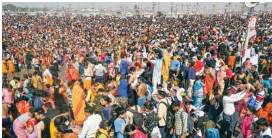
Rush of devotees to take a holy dip at the Sangam during the Mahakumbh Mela in Prayagraj

Mahakumbh 2025 has set a historic milestone with its grandeur and an unprecedented gathering of over 50 crore devotees. To ensure the safety and smooth management of this massive event, the Yogi government has introduced several groundbreaking initiatives. One of the most impactful measures has been the establishment of digital lost and found centers, designed to quickly reunite lost devotees with their families. This initiative has already helped reconnect over 20,000 missing individuals with their loved ones, proving to be a crucial support system for the event. Notably, the government has successfully reunited 20,144 people who had been separated from their families in this year's Mahakumbh. A large number of those reunited were women. The police also played a key role by helping devotees from various states and even from Nepal