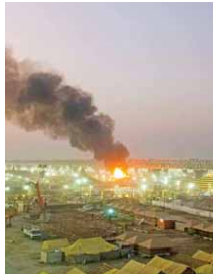
Smoke billows out after a fire broke out at the Maha Kumbh Mela, in Prayagraj

A devastating road accident in Prayagraj on Friday and a fire in the mela grounds on Saturday marred the festivities in Kumbh as the week came to a close. A fire broke out at the storeroom of a camp in the Maha Kumbh Mela area on Saturday evening, gutting seven tents and destroying some items, including blankets and foodgrains, officials said. No person was injured, they said. Meanwhile late evening heavy rush led to chaos at New Delhi Railway Station on platform no 14 and 15 from where Prayagraj Express was scheduled to depart. Sources said that passengers forced themselves in all the coaches of train including air conditioned coaches. Several passengers fainted due to heavy rush and Mahakumbh bound passengers barging into coaches. Delhi police and Delhi Fire Service rushed to the spot and along with the RPF tried to control the chaos and prevented a major stampede at the national Capital station. Some of the passengers including female were rushed to hospital for first aid. Northern Railway officials said that