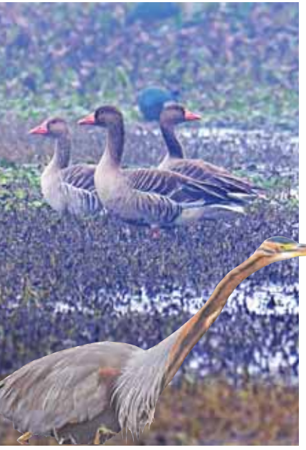
Recognised as an Important Bird Area (IBA) by BirdLife International and extensively studied by the Bombay Natural History Society (BNHS), Dhanauri plays a pivotal role in global bird conservation. Each year, between November and March, the wetland transforms into a sanctuary for over 50,000 migratory waterfowl, reinforcing its importance as a breeding and nesting ground

The Dhanauri Wetlands are at risk, once a sanctuary for birds like the Sarus Crane and Painted Stork , now threatened by encroachment and neglect. With land repurposed for construction, the ecosystem is shrinking and disrupting its delicate balance. Water pollution and disappearing green buffers worsen the crisis. Without urgent protection, this vital habitat, which supports biodiversity, flood control and climate regulation, may soon be lost, leaving behind only memories of its once-thriving wildlife.