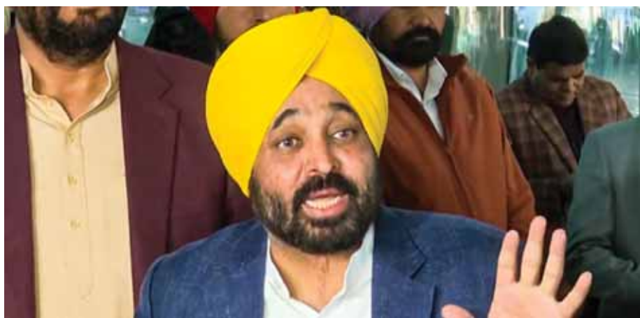
Punjab Chief Minister Bhagwant Mann during a press conference in Amritsar

Punjab Congress leader Partap Singh Bajwa on Saturday alleged that the Bhagwant Mann government in the state has 'failed' in curbing human trafficking. His remarks came on a day when a second plane carrying 119 Indian deportees from the US will land at Amritsar airport. Bajwa, Leader of the Opposition in the Punjab Assembly, asked CM Mann how many travel agents were booked for human trafficking in the last three years. He said the Punjab Prevention of Human Smuggling Act 2012 regulates the profession of travel agents to check and curb illegal activities. "Can CM Bhagwant Mann, who also holds the Home portfolio, let the Punjabis know how many travel agents have been booked under the same law in the last three years," Bajwa asked. "Mann said that illegal immigra-