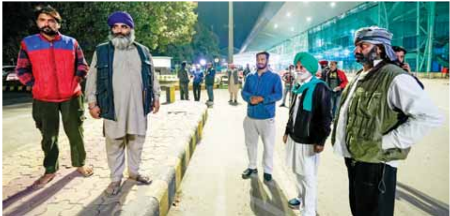
Relatives wait outside the airport in Amritsar ahead of the second batch of the immigrants' arrival from the US

A plane carrying 119 illegal immigrants from the US landed at the Amritsar airport on Saturday night, the second such batch of Indians to be deported by the Donald Trump administration as part of its promised crackdown on illegal migration. Before the arrival and another scheduled deportee flight for Sunday created a lot of furore and controversy across the country with political parties crossing swords. Punjab Chief Minister Bhagwant Mann questioned the move to land another plane at the Amritsar airport, as he accused the Centre of trying to defame Punjab as part of a conspiracy and sought to know under which criteria the Amritsar airport was chosen to land the second aircraft, BJP hit back accusing the AAP leader of playing politics over the matter. Among the 119 deportees, 100 are from Punjab and Haryana alone. While 67 are from Punjab, 33 are from Haryana, eight from Gujarat, three from Uttar Pradesh, two each from Goa, Maharashtra and Rajasthan, and one each from Himachal Pradesh and Jammu and Kashmir. The second batch of illegal Indian immigrants includes four women and two minors, including a six-year-old girl. Most of the deportees are in the age group of 18 to 30, sources said. A third plane carrying 157 deportees is also expected to land on February 16. On February 5, a US military aircraft carrying 104 illegal Indian immigrants landed at the Amritsar airport.