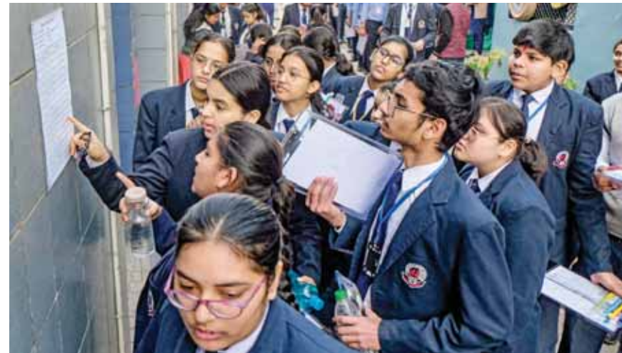
Students check their allocated seats at an examination center before appearing for the CBSE class 10 board exam 2025, in Gurugram