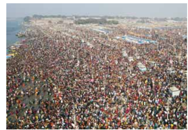
Devotees perform rituals at Sangam after taking a holy dip on the eve of 'Maghi Purnima' bath festival during ongoing Maha Kumbh Mela, in Prayagraj

The massive congestion left locals and pilgrims with mixed reactions. Residents expressed frustration over the traffic mismanagement, with many struggling to carry out their daily activities. Commuters were stranded for hours, and businesses faced disruptions due to supply delays. Pilgrims, however, viewed the overwhelming crowd as a testament to Kashi's spiritual significance. Despite the inconveniences, many devotees remained determined to complete their religious journey, expressing awe at the city's vibrancy and devotion.