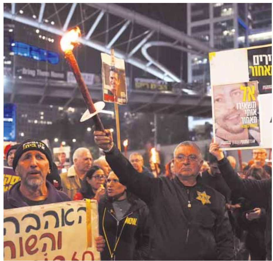
Relatives of hostages, held by Hamas in the Gaza Strip, protest outside of Israel's Ministry of Defense in Tel Aviv, Israel, on Monday after the militant group announced it would delay hostage releases in the Gaza Strip after accusing Israel of violating a fragile ceasefire