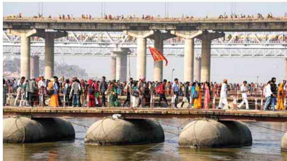
Rush of devotees on pontoon bridge on the eve of 'Magh Purnima' during the ongoing Mahakumbh Mela, in Prayagraj

Stressing the importance of seamless traffic and crowd management, he instructed authorities to fully utilise parking facilities capable of accom-