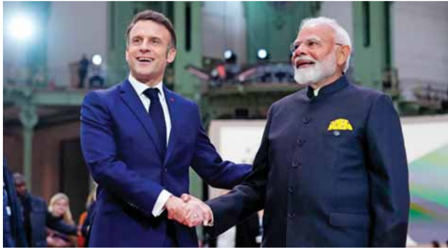
French President Emmanuel Macron shakes hands with India's Prime Minister Narendra Modi as they arrive to the Artificial Intelligence Action Summit at the Grand Palais in Paris, France

Prime Minister Narendra Modi on Tuesday made a strong case for collective efforts to establish a global framework for artificial intelligence (AI) based on open source which enhances trust, transparency and is free from biases. Co-chairing the AI Action Summit along with French President Emmanuel Macron here, Modi said that AI is changing the polity, economy, security and society, and is writing the code for humanity in this century. Modi also offered to host the next AI Action Summit in India, supporting the decision taken at the first summit hosted by France to set up the 'AI Foundation' and the 'Council for Sustainable AI'. "There is a need for collective global efforts to establish governance and standards that uphold our shared values, address risks and build trust," Modi said, adding that governance is not just about managing risks and rivalries but is also about promoting innovations and deploying them for global good. "We must democratise technology and create people-centric applications. We must address concerns related to cyber security, disinformation and deep fakes," the Prime Minister said. Stressing on the need to develop quality data sets free from biases, the Prime Minister said there is a need to develop open-source AI ecosystems that enhance trust and transparency. He said the technology should be rooted in the local ecosystem for it to be effective and useful. Modi started his address with