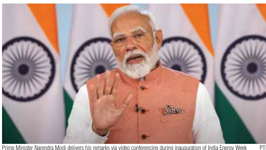
Prime Minister Narendra Modi delivers his remarks via video conferencing during inauguration of India Energy Week

important part of India's energy ambitions," Modi told investors. He further said, "All experts are saying that 21st century is India's century. Bharat is not only driving it its own growth but driving global growth." India's energy ambitions, he said, are based on five pillars. "We have resources, which we are harnessing. We are encouraging our brilliant minds to innovate. Thirdly, we have economic strength and political stability," he said. Also, he said, India has strategic geography, which makes energy trade easier and more attractive. Besides, India is committed towards global sustainability and this is aiding new possibilities in the country's energy sector, the prime minister said. For Viksit Bharat, the next two decades are very crucial, he said, adding that in the next five years we will cross many