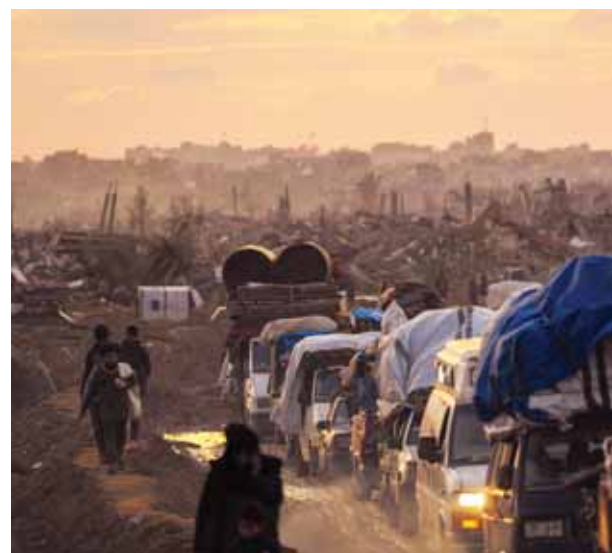
Displaced Palestinians, travelling in vehicles, wait in line to pass through a security checkpoint at the Netzarim corridor as they make their way from central Gaza to their homes in the northern Gaza Strip, on Monday

Hamas has brushed off President Donald Trump's threat that "all hell" will break out if it does not release the remaining Israeli hostages held in the Gaza Strip by Saturday. Hamas spokesman Sami Abu Zuhri said Tuesday that the dozens of hostages would only be returned if all parties remain committed to a ceasefire deal reached last month. "Trump must remember there is an agreement that must be respected by both parties," he said, adding that threatening language only complicates matters. Hamas has threatened to delay the next release of three Israeli hostages, due Saturday, accusing Israel of violating the ceasefire agreement, including by not allowing a surge of tents and shelters into the devastated territory. While Trump said the ceasefire should be cancelled if Hamas doesn't release all the remaining hostages Saturday, he also said such a decision would be up to Israel. During the first phase of the ceasefire, Hamas has com-