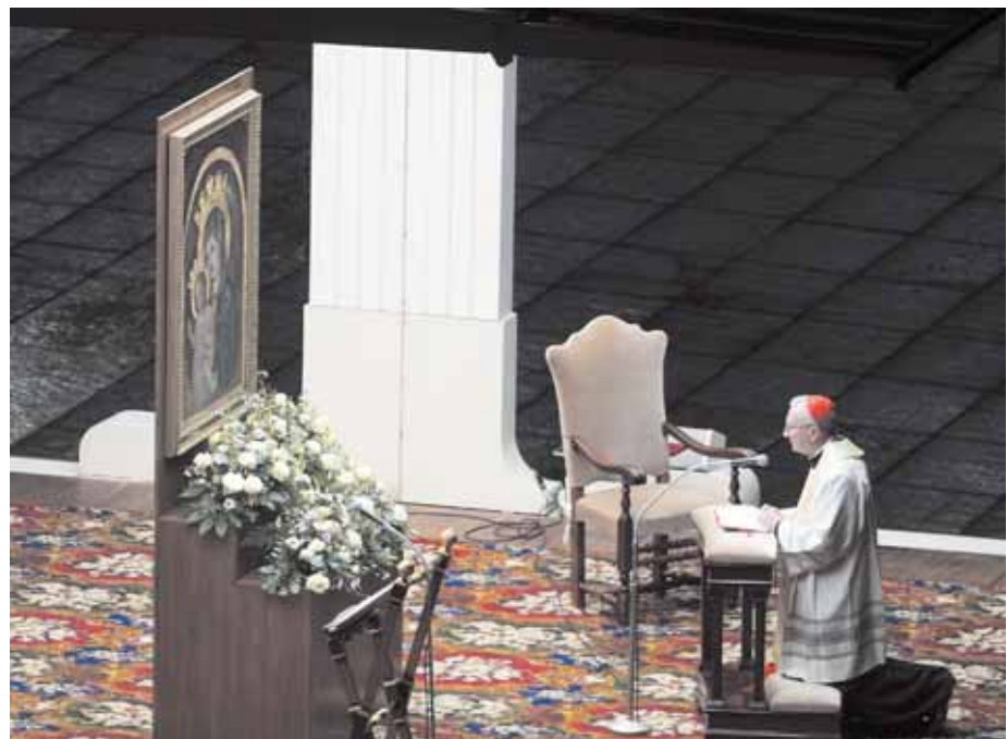
Cardinal Pietro Parolin, Vatican Secretary of State during a rosary prayer service held for the health of Pope Francis in St Peter's Square at The Vatican, on Monday

Pope slept well: On Tuesday morning, the Vatican's typically brief morning update said: "The pope slept well, all night." The previous evening, doctors had said he remained in critical condition with double pneumonia but reported a "slight improvement" in some laboratory results. In the most upbeat bulletin in days, the Vatican said Francis had resumed work from his hospital room, calling a parish in Gaza City that he has kept in touch with since the war there began. The Argentine pope, who had part of one lung removed as a young man, has been hospitalised since February 14 at Rome's Gemelli hospital and doctors have said his condition is touch-and-go, given his age, fragility and pre-existing lung disease before the pneumonia set in. But in Monday's update, they said he hadn't had any more respiratory crises since Saturday, and the flow and concentration of supplemental oxygen has been slightly