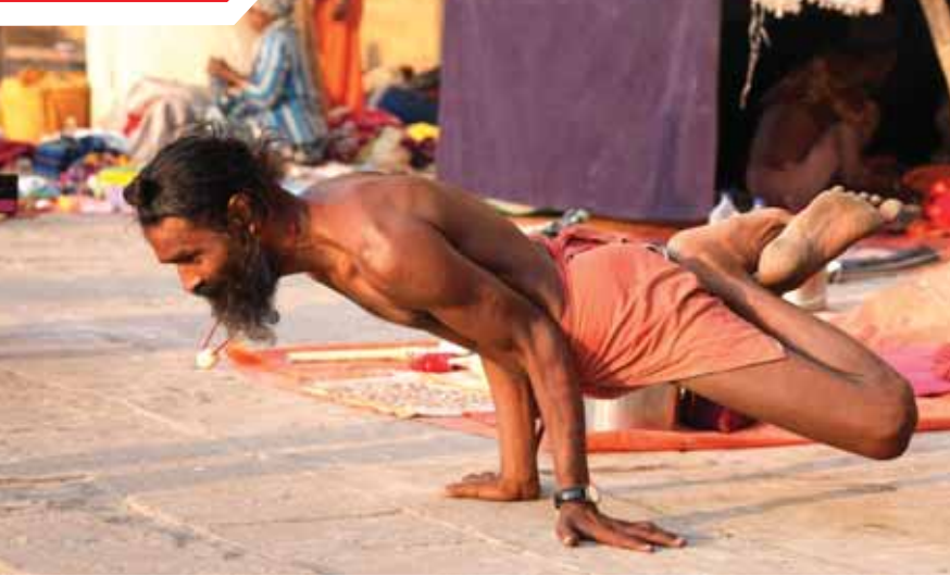
A sadhu performs a yogasana at a Ganga ghat, in Varanasi