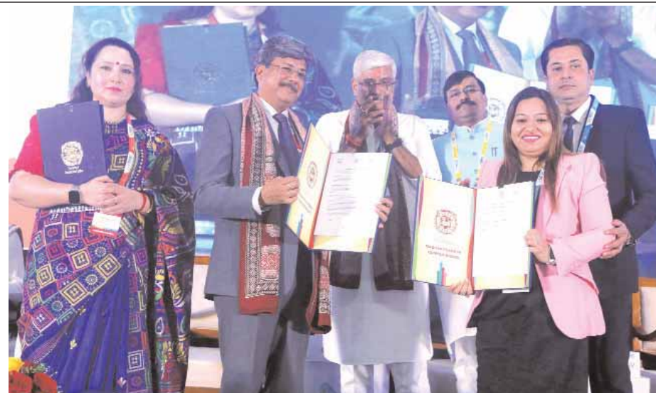
Union Minister for Culture and Tourism Gajendra Singh Shekhawat and Madhya Pradesh Minister for Culture and Tourism Dharmendra Singh Lodhi witness a MoU in a Tourism and Culture session during the Global Investors Summit-2025, at Indira Gandhi Rashtriya Manav Sangrahalaya in Bhopal on Tuesday.