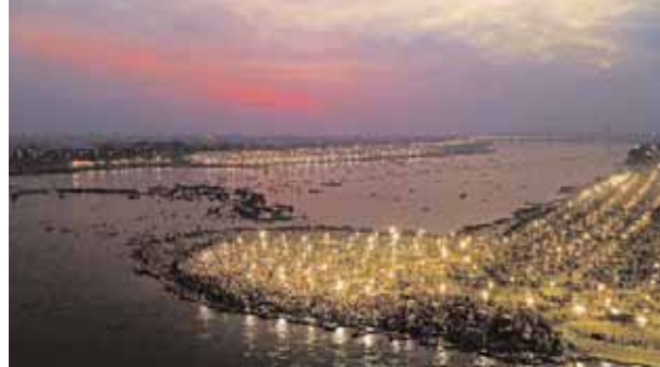
The Sangam area illuminated on the eve of Mahashivratri festival during the ongoing Maha Kumbh Mela 2025 in Prayagraj.

Around 1.30 am on Tuesday, when much of the country was sleeping, the ghats facing the Sangam nose, where the Yamuna, Ganga and the mythical Saraswati meet, and near the spot were buzzing with life with a surge of humanity rushing in with just one purpose — 'Kumbh Snan'. The crowd swelled hour after hour. Pilgrims jostled with each other to reach the river bank, and those having taken the holy dip struggled to find a spot to change their clothes. The banks were literally choked with devotees, young and old, rural and urban, men and women.