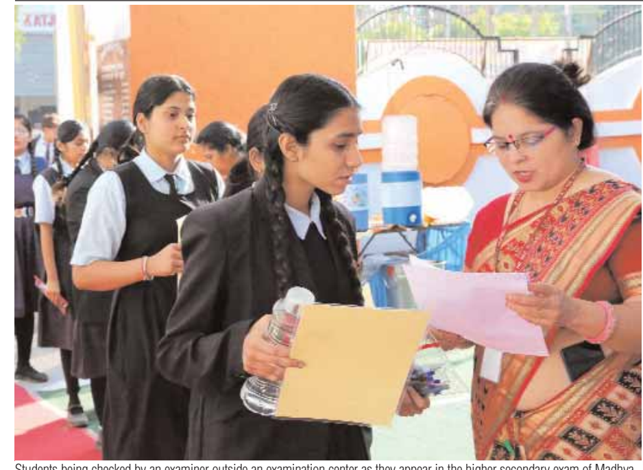
Students being checked by an examiner outside an examination center as they appear in the higher secondary exam of Madhya Pradesh Board of Secondary Education in Bhopal on Tuesday.