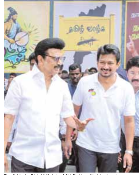
Tamil Nadu Chief Minister MK Stalin with his deputy Udayanithi Stalin and others at the opening of 'Kalaigarr Centenary Boxing Academy' in Chennai.

DMK president and Tamil Nadu Chief Minister MK Stalin on Tuesday accused the Centre of 'sowing the seeds of language war' by thrusting Hindi upon the State and said the domination of that language will not be allowed. Addressing media, Stalin said that DMK is ready for another language war. Though the state was not against any language in particular and would not come in the way of anyone desiring to learn any language, it was determined not to allow any other language to dominate and destroy the mother tongue Tamil, he said. "This is the reason why we are adhering to the bilingual policy (of Tamil and English)," said Stalin in a letter addressed to his party workers. Many states in India including the neighbouring states have realised the path laid down by Tamil Nadu on language policy and its firm stance, and they started to express