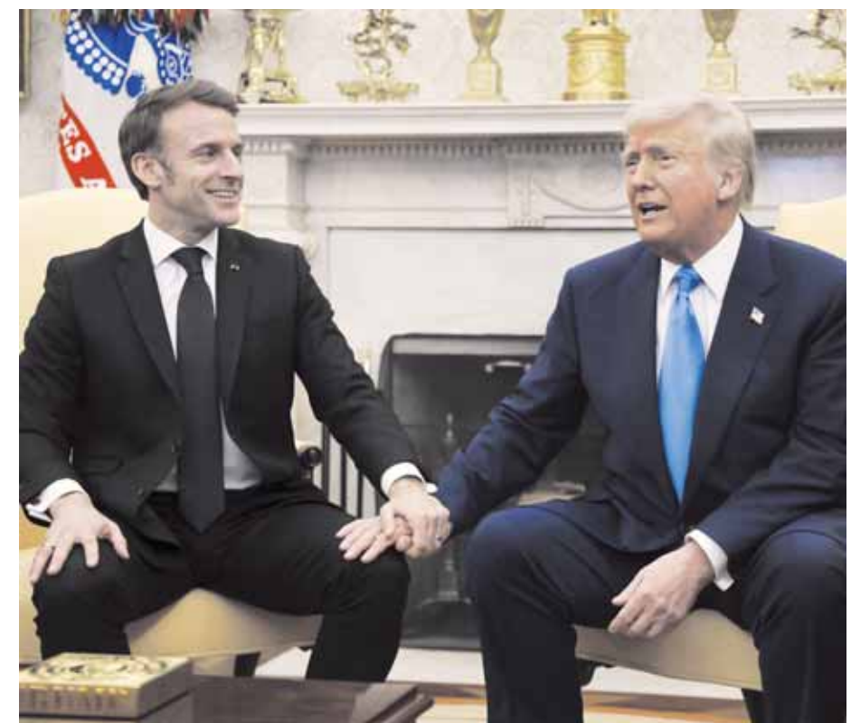
US President Donald Trump speaks during a meeting with France's President Emmanuel Macron in the Oval Office of the White House in Washington, on Monday