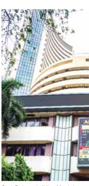
Stock Exchange building, Mumbai

PIONEER NEWS SERVICE ■ MUMBAI Benchmark BSE Sensex recovered 147 points in a range-bound trade on Tuesday, ending its five-day slide on the back of buying in financial and FMCG shares. The 30-share BSE benchmark Sensex climbed 147.71 points or 0.20 per cent to settle at 74,602.12 with 17 of its constituents ending higher and 13 lower. During the day, it rallied 330.67 points or 0.44 per cent to 74,785.08.