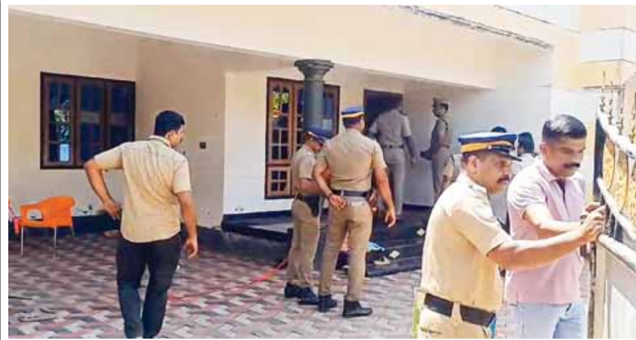
Police investigate the crime scene after a 23-year-old man allegedly killed five people, including four of his close family members in Thiruvananthapuram

contract cannot be read to mean that the MMRDA has a license to act unfairly, arbitrarily or unreasonably in the contractual field without assigning reasons," the court said, asking the MMRDA to take a fresh decision after hearing the company. Sena (UBT) leader and former minister Aadiya Thackeray targeted Deputy Chief Minister Eknath Shinde - who heads the rival Shiv Sena - over the issue. The MMRDA comes under Shinde's Urban Development department. "The mind the regime scams are coming out. We have been raising many since 2022 mid. While India and France get closer diplomatically, the @MMRDAOfficial run by Eknath Shinde's Urban Development department, rubbishes concerns of corruption raised by the French consultant," he said. "I urge @CMOMaharashtra to launch an open, free and fair inquiry into this issue. Find out the source of corruption- which character close to corrupt mantri indulged in this?" Thackeray added.