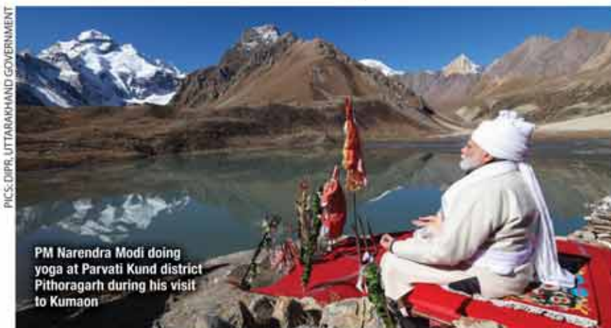
PM Narendra Modi doing yoga at Parvati Kund district Pithoragarh during his visit to Kumaon

The tranquil and spiritual terrain of the Garhwal Himalayas has evolved into a focal point for fitness lovers, thanks to PM Modi's future forward vision