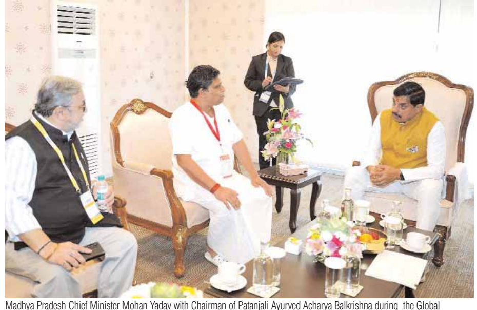
Madhya Pradesh Chief Minister Mohan Yadav with Chairman of Patanjali Ayurved Acharya Balkrishna during the Global Investors Summit, at Indira Gandhi Rashtriya Manav Sangrahalaya in Bhopal on Monday.

positive because our American subsidiary benefits and Hindalco in India does not really export aluminium to the US. So for us, we are neutral to positive," he explained. Besides Hindalco, other Aditya Birla Group companies, including UltraTech Cement and Grasim's Viscose Staple Fibre (VSF) division, are also working on independent projects in Madhya Pradesh, reinforcing the group's commitment to the state's industrial development. The Madhya Pradesh government has welcomed Hindalco's investment, viewing it as a crucial step toward establishing the state as a leading hub for aluminium production and industrial growth. The expansion is expected to generate significant employment opportunities and drive economic progress in the region.