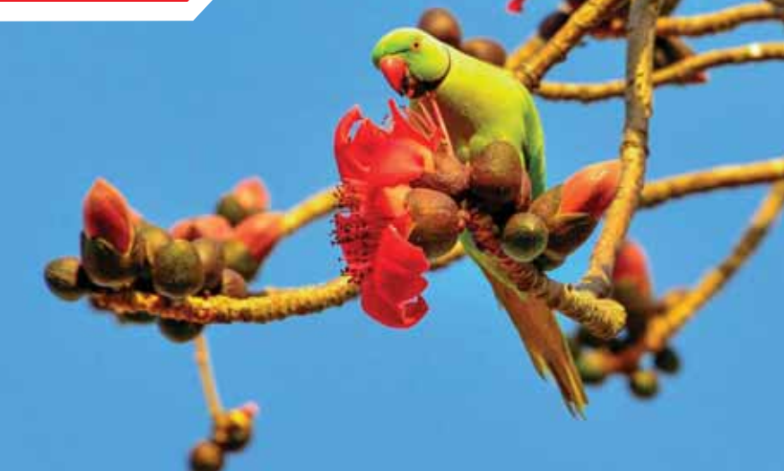
A parrot perches on a 'Palas' flower, in Bastar