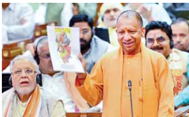
UP CM Yogi Adityanath speaks as Finance Minister Suresh Kumar Khanna looks on during the Budget session of the UP Assembly in Lucknow

PIONEER NEWS SERVICE ■ LUCKNOW Uttar Pradesh Chief Minister Yogi Adityanath slammed the opposition Samajwadi Party on Monday, saying that during its rule in the state, the chief minister did not have the time to review Kumbh arrangements and "a non-Sanatani was made its in charge".