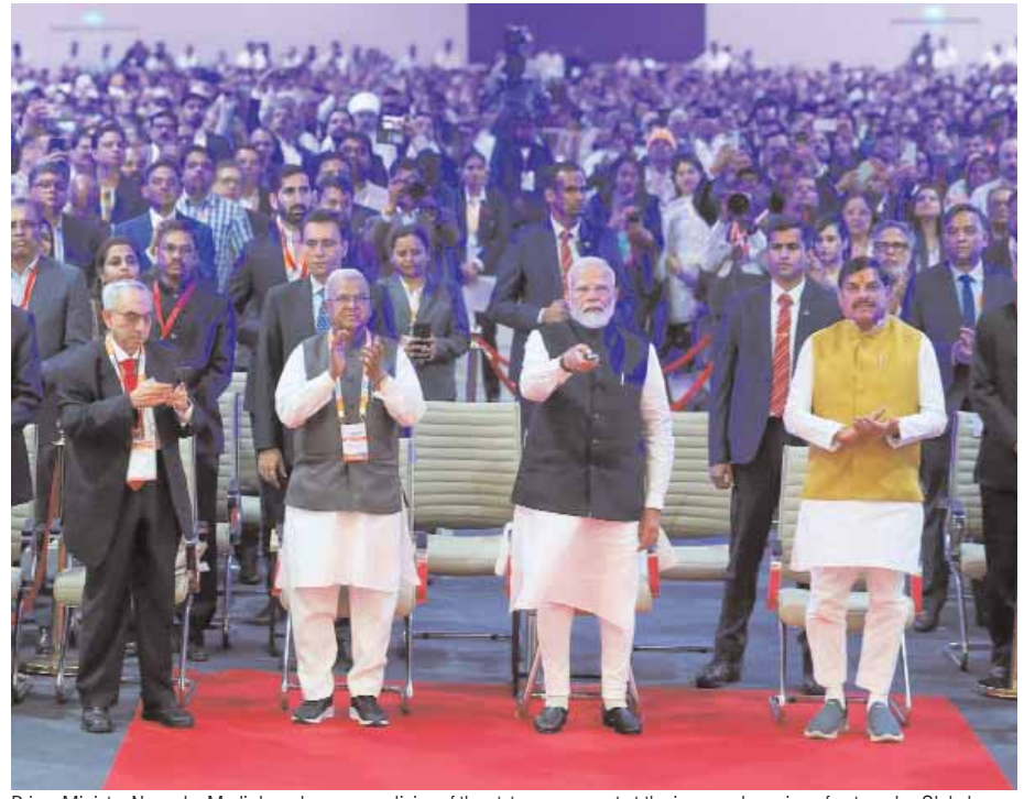
Prime Minister Narendra Modi launches new policies of the state government at the inaugural session of a two-day Global Investors Summit at Indira Gandhi Rashtriya Manav Sangrahalaya in Bhopal on Monday.

Group's Recognized MP as an agricultural powerhouse, Godrej Group Highlighted MP's rapid development as a smart investment destination, Sagar Group & Shakti Pumps Shared positive experiences of operating in the state. Madhya Pradesh: A Land of Infinite Opportunities Yadav concluded by emphasizing Madhya Pradesh's strong economic foundation, citing consistent GSDP growth, upcoming mega projects, and investor-friendly policies. He assured that MP is ready to welcome investors of all scales and provide them with a profitable and stable business environment. With a strong family-like culture, once someone comes to Madhya Pradesh, they feel at home, he said, inviting global investors to be a part of the state's growth story.