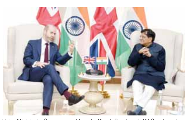
Union Minister for Commerce and Industry Piyush Goyal meets UK Secretary of State for Business and Trade Jonathan Reynolds in New Delhi.

India and the UK on Monday announced the resumption of negotiations for the proposed free trade agreement (FTA), which is expected to double or even triple bilateral trade from the current $20 Billion in the next 10 years.