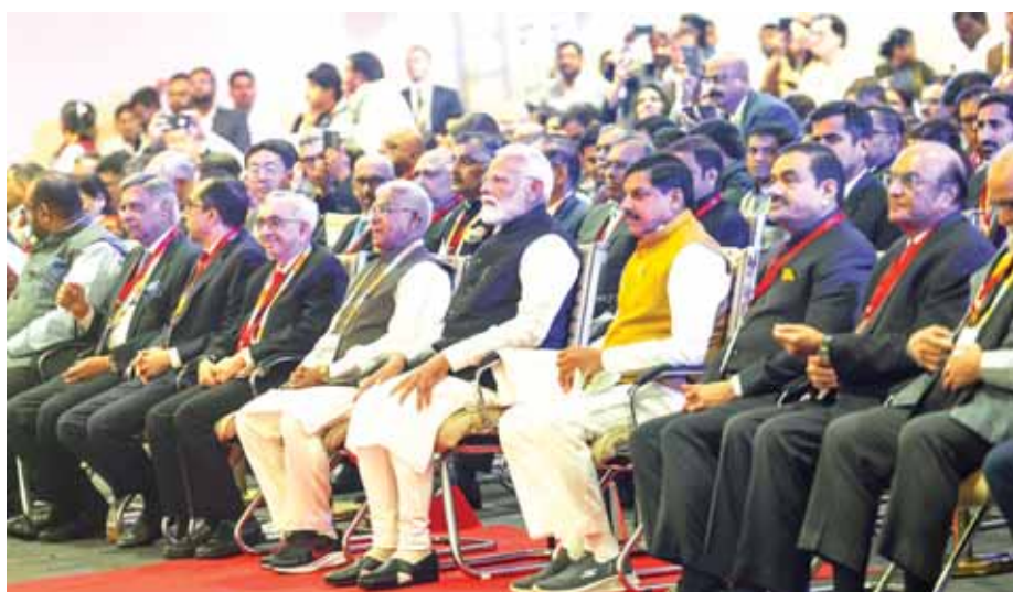
PM Narendra Modi with Madhya Pradesh CM Mohan attends the Global Investors Summit 2025 in Bhopal