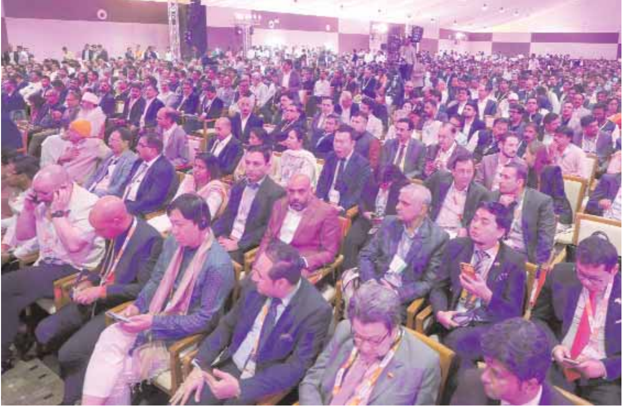
Delegates attend two-day Global Investors Summit at Indira Gandhi Rashtriya Manav Sangrahalaya in Bhopal on Monday.