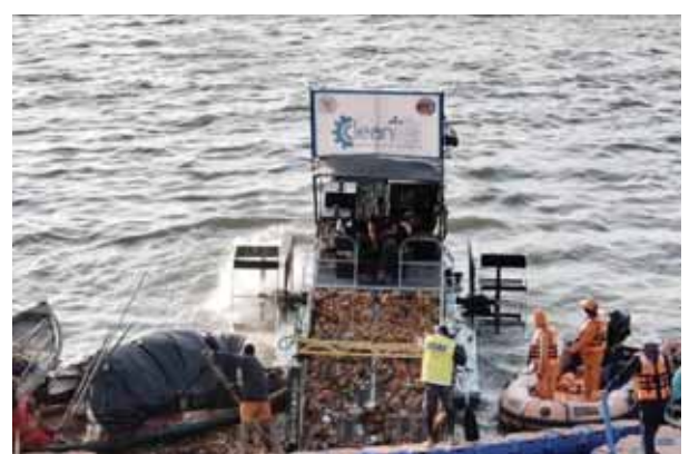
Cleanliness drive at Mahakumbh mela in Prayagraj

With over 55 Crore devotees already taken a dip during two months long congregation of extraordinary proportions at Mahakumbh, the Uttar Pradesh government has taken care of all efforts to ensure the cleanliness of the Sangam in Mahakumbh Nagar. Each day, an average of 10-15 Tonnes of floating waste is collected from the river and sent for recycling, demonstrating a strong commitment to maintaining environmental sustainability during this sacred event. But since this poses a complex array of logistical challenges, especially in managing the immense waste generated by such a gathering, deployment of trash skimmers at Prayagraj by the Urban Development Department as part of Swachh Bharat Mission is being executed by Cleantec Infra, and