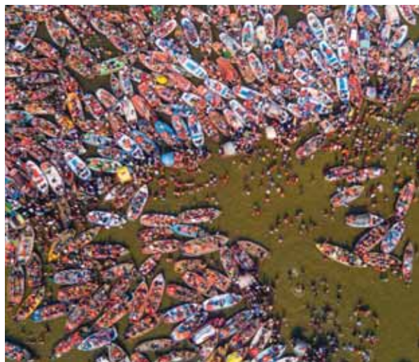
An aerial view of devotees on boats at the Sangam during the ongoing Maha Kumbh Mela, in Prayagraj