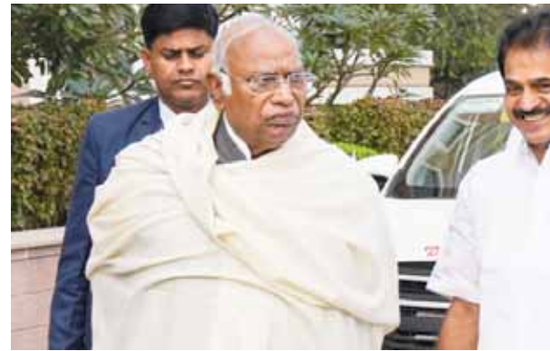
Congress President Mallikarjun Kharge in the Lok Sabha arrives for a meeting of party's general secretaries and state in-charges, in New Delhi

Days after a major organisational rejig in the party, Congress President Mallikarjun Kharge on Wednesday stressed that the top workers will be held accountable for future election results in States under their charge and asking them to be wary of ideologically weak turncoats. Addressing general secretaries and in-charges, including those appointed last week, at a meeting held at the party's new headquarters at Indira Bhawan, Kharge emphasised the importance of promoting those people who are committed to the ideology of the Congress and stand with us like a rock even in adverse circumstances. Kharge also hinted at some more changes in the organisation, saying some changes have already taken place and some more are in the offing. "I want to talk to you about the most important thing of accountability. You all will be held accountable for revamping the organisations in states and for all future election results," he told the office-bearers. The party recently brought in new office bearers in the revamped organisation. Among those who attended the meeting