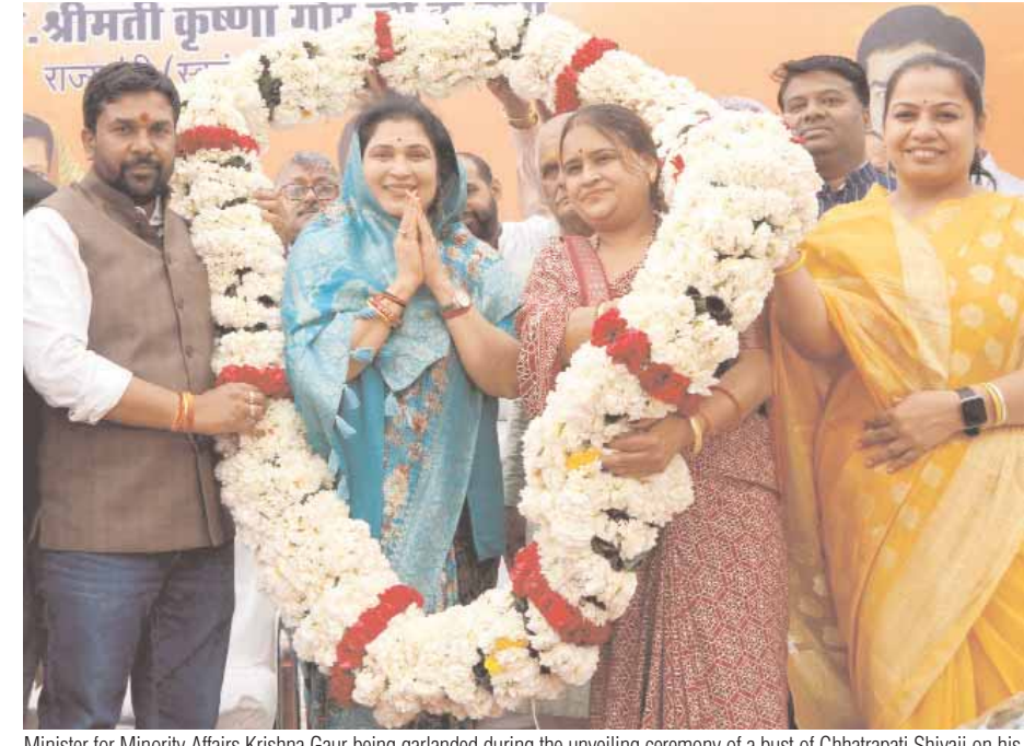
Minister for Minority Affairs Krishna Gaur being garlanded during the unveiling ceremony of a bust of Chhatrapati Shivaji on his birth anniversary at Saket Nagar in Bhopal on Wednesday. Pioneer photo