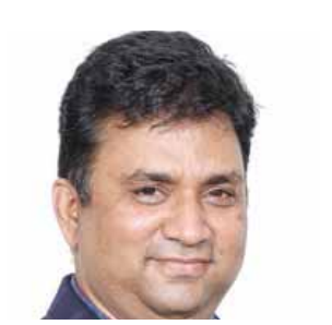
BINOD ANAND ■ NEW DELHI

As India embraces sustainability and innovation, a cooperative economic framework becomes essential to address G-local challenges through responsible Business. This ensures shared growth by fostering collaboration between multinational corporations, small and medium enterprises (SMEs), and government bodies.