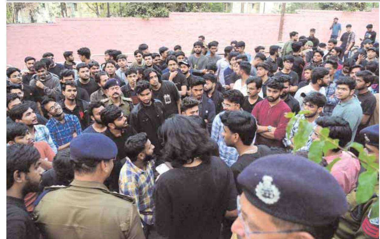
Police restrict engineering students as they march towards CM's residence against the Director of the Institute demanding for his resignation, for allowing police to enter the college campus and hostels thrashing students following a group clash at Maulana Azad National Institute of Technology (MANIT) in Bhopal on Wednesday.

In a continued effort to curb air pollution and maintain cleanliness, the Bhopal Municipal Corporation (BMC) on Wednesday levied spot fines on those found violating environmental norms by bursting firecrackers outside Utsav Marriage Garden on Hoshangabad Road. BMC later said the act not only contributed to air pollution but also littered the service road, prompting immediate intervention by the municipal health department team. As part of its relentless drive to penalize violators, BMC collected Rs 1,07,430 in fines across 819 cases of cleanliness violations. Additionally, Rs 15,100 was collected from 19 cases of Construction and Demolition (C&D) waste violations, reinforcing the civic body's commitment to tackling pollution at multiple levels.