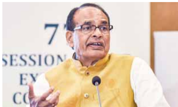
Shivraj Singh Chouhan addresses inaugural Session of 77th Session of Executive Committee of African Asian Rural Development, in New Delhi

India is committed to rural transformation in member nations of the African-Asian Rural Development Organisation (AARDO) and will increase its technical contribution to the forum, Rural Development Minister Shivraj Singh Chouhan said here on Wednesday. He was speaking at the inauguration of the 77th session of the executive committee of the African-Asian Rural Development Organisation (AARDO). "India gives the highest yearly membership contribution to AARDO, which is around USD 1,55,300, and the Indian government has been providing organisation, technical, and financial support to AARDO from time to time," he said. "India will keep playing its role in rural transformation in