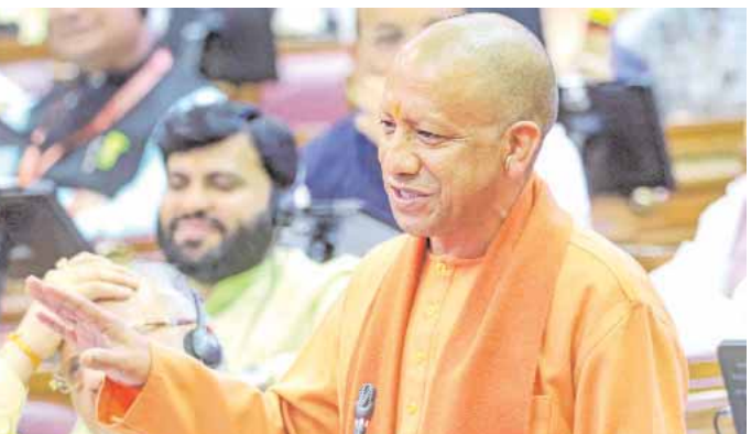
Uttar Pradesh Chief Minister Yogi Adityanath speaks during the Budget session of the state Legislative Assembly, in Lucknow

exceeding Rs 3 Lakh Crore. Sales are reported to have increased due to meticulous branding. It also proves that India's sanatana economy has deep-rooted strength, playing a significant role in the country's overall economic framework," Khandelwal added. This has provided a significant boost to Uttar Pradesh's economy and created new business opportunities. Before the commencement of the Maha Kumbh, initial estimates were projected the arrival of 40 Crore people and business transactions worth around Rs 2 Lakh Crore. According to the Uttar Pradesh government, over 53 Crore