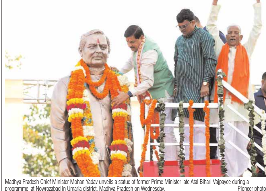
Madhya Pradesh Chief Minister Mohan Yadav unveils a statue of former Prime Minister late Atal Bihari Vajpayee during a programme at Nowrozabad in Umaria district, Madhya Pradesh on Wednesday.

and proper sewage treatment arrangements. Local women will be actively involved in the operation and maintenance of these facilities, ensuring their sustainability. This project will further enhance Orchha's development as a modern tourist destination. The Tourism Board and the country's leading trekking organization 'India Hikes' will identify and develop five new trekking routes. 'India Hikes' has previously developed 'Moghliland Trek' in the buffer area of Pench National Park, in which 288 participants from 17 groups of the country have experienced trekking and camping. Similarly, Narmada Bank-Water Trek has been developed in Alirajpur district, in which 101 participants from 06 groups experienced