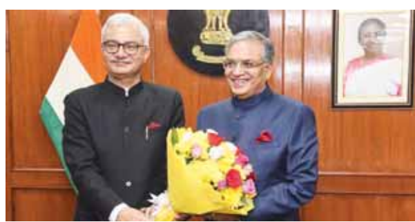
New Chief Election Commissioner Gyanesh Kumar is greeted by Election Commissioner Vivek Joshi

Gyanesh Kumar on Wednesday took over as the 26th Chief Election Commissioner (CEC) while Vivek Joshi assumed charge as an Election Commissioner. An Election Commissioner since March 2024, Kumar was elevated as the CEC on Monday. Gyanesh Kumar replaced Rajiv Kumar, who demitted office on Tuesday, as head of the poll panel. Sukhbir Singh Sandhu is the other election commissioner. Joshi, a former Haryana cadre IAS officer, was appointed as an Election Commissioner on Monday. In his message to voters after assuming charge, Kumar said,