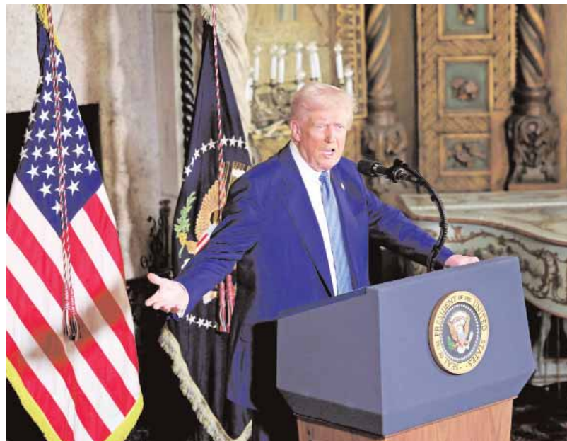
President Donald Trump speaks at Mar-a-Lago in Palm Beach, Fla.