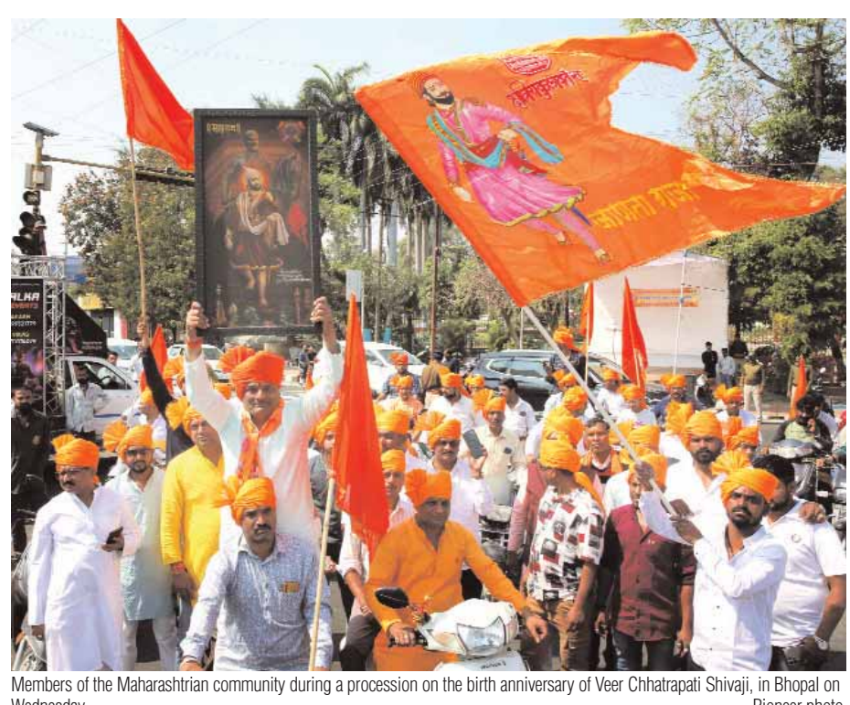
Members of the Maharashtra community during a procession on the birth anniversary of Veer Chhatrapati Shivaji, in Bhopal on Wednesday.

Chief Minister Mohan Yadav said that the National Dairy Development Board will play a key role in further strengthening the Sanchi brand and expanding its presence at the national level. The brand name will remain unchanged, and no management fee will be charged for the operation and administration of milk unions. Additionally, no consultancy fee will be levied for the development of new processing facilities and infrastructure. To enhance efficiency, technical and management experts will be appointed to the milk unions as needed, ensuring smooth operations while safeguarding the interests of the existing staff. A complaint redressal system will also be established to address and resolve grievances of dairy farmers associated with milk cooperative societies.