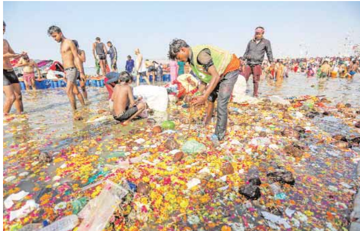
Puja material and other waste being collected at the Sangam for their disposal, during the ongoing Maha Kumbh Mela 2025, in Prayagraj

Amid claims by Central Government pollution body that the present condition of Ganga water in ensuing Maha Kumbh may contain high levels of faecal bacteria, Uttar Pradesh Chief Minister Yogi Adityanath on Wednesday countered by assuring the Sangam water in Prayagraj is safe for bathing and other rituals. A sort of controversy erupted over the claims by Central government pollution body which reported the Ganga water at Triveni Sangam, where lakhs of people are taking a holy dip every day during the ongoing Maha Kumbh, is currently unsafe for bathing. Central Pollution Control Board (CPCB) data informed the National Green Tribunal that Sangam water at Maha Kumbh exceeds the prescribed limit for biological oxygen demand (BOD), a key parameter to determine water quality. BOD refers to the amount of oxygen required by aerobic microorganisms to break down organic material in a water body. A higher BOD level indicates more organic content in the water. River water is considered fit for bathing if the BOD level is less than 3 milligrams per litre. In a report submitted to the NGT the CPCB said the river water quality did not meet bathing standards during monitoring on January 12-13 at most locations in Prayagraj. According to Uttar Pradesh government officials, 10,000 to 11,000 cuces of water is being released into the Ganga to