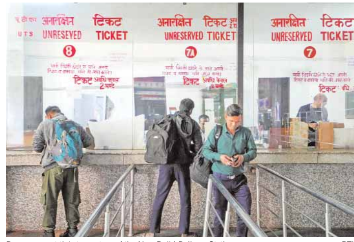
Passengers at ticket counters of the New Delhi Railway Station