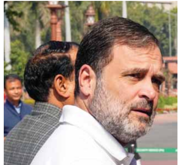
Rahul Gandhi in the Lok Sabha arrives for a meeting of party's general secretaries and state in-charges, in New Delhi