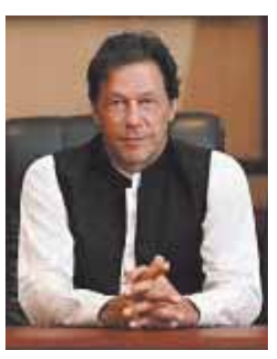
House but no progress was made due to his insistence on the release of all detained workers before his transfer.

process and views Gandapur as the central figure who could make it happen. So far, there is no indication that the other side is willing to engage.