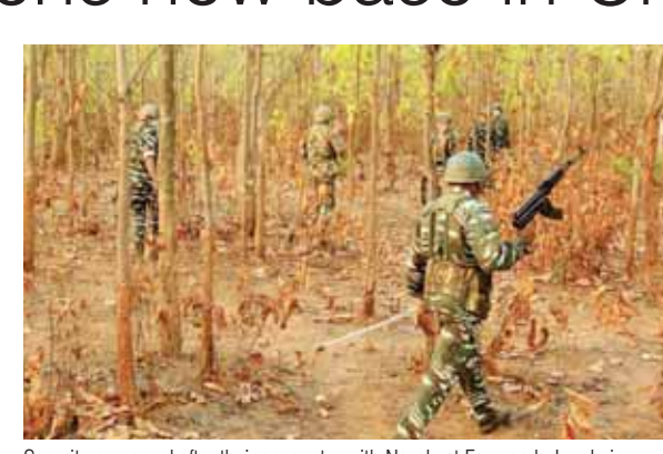
Security personnel after their encounter with Naxals at Farsegarh Jungle in Bijapur, Chhattisgarh

officials said. The remote area where the forward operating base (FOB) has been established is surrounded by hills and houses training camps, weapons and ammunition dump and rations units of the Maoists from the south and west Bastar divisions, the officials said.