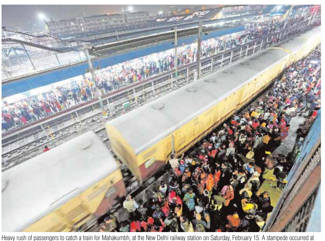
the station killing 18 and injuring many others

authorities' Some blamed mismanagement and a sudden change in platform, while many