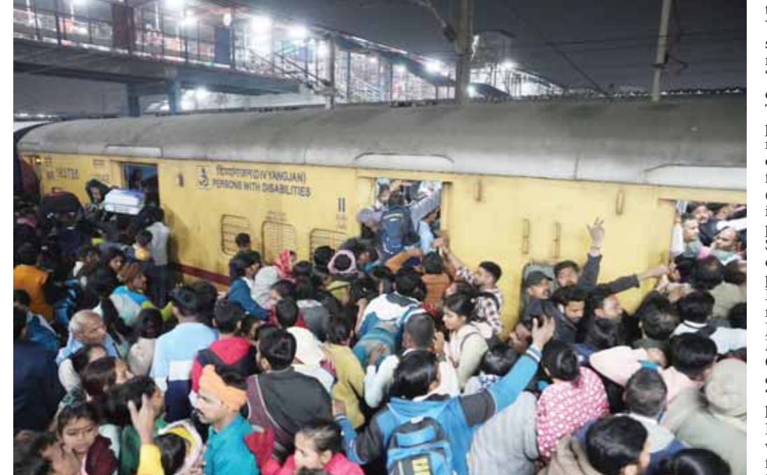
Heavy rush of passengers to catch a train for Mahakumbh, at the New Delhi railway station

"I am extremely anguished by the injured and give a place to the virtuous souls in his feet. Om Shanti," he said in his social media