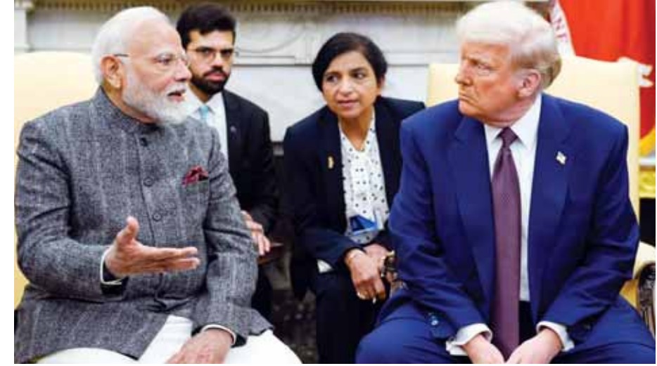
President Donald Trump meets India's Prime Minister Narendra Modi in the White House in Washington

The two sides will also work together on economic corridors and connectivity infrastructure under the India-Middle East-Europe Economic Corridor (IMEC) and I2U2 frameworks. "TRUST initiative on critical