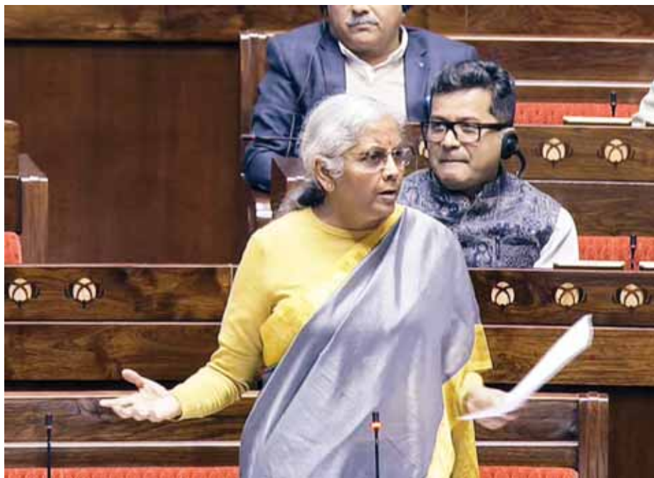
Finance Minister Nirmala Sitharaman speaks in the Rajya Sabha during the Budget session of Parliament New Delhi

On Budget proposals, she said they seek to "accelerate growth, secure inclusive development, and invigorate private sector investments", and there has been no decrease in capital expenditure for the next fiscal year. Sitharaman told the House that the Budget was prepared