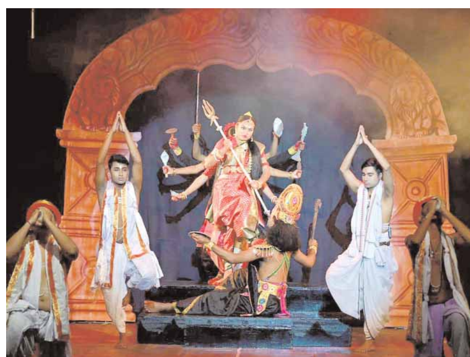
Students from West Bengal perform a play during the 3rd Akhil Bharatiya Roopak Mahotsava, at Ravindra Bhawan in Bhopal on Thursday.