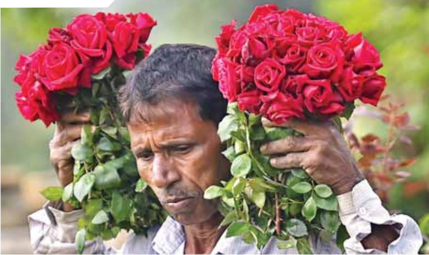
Farmer carries rose flowers during the Valentine's Week, in Agartala