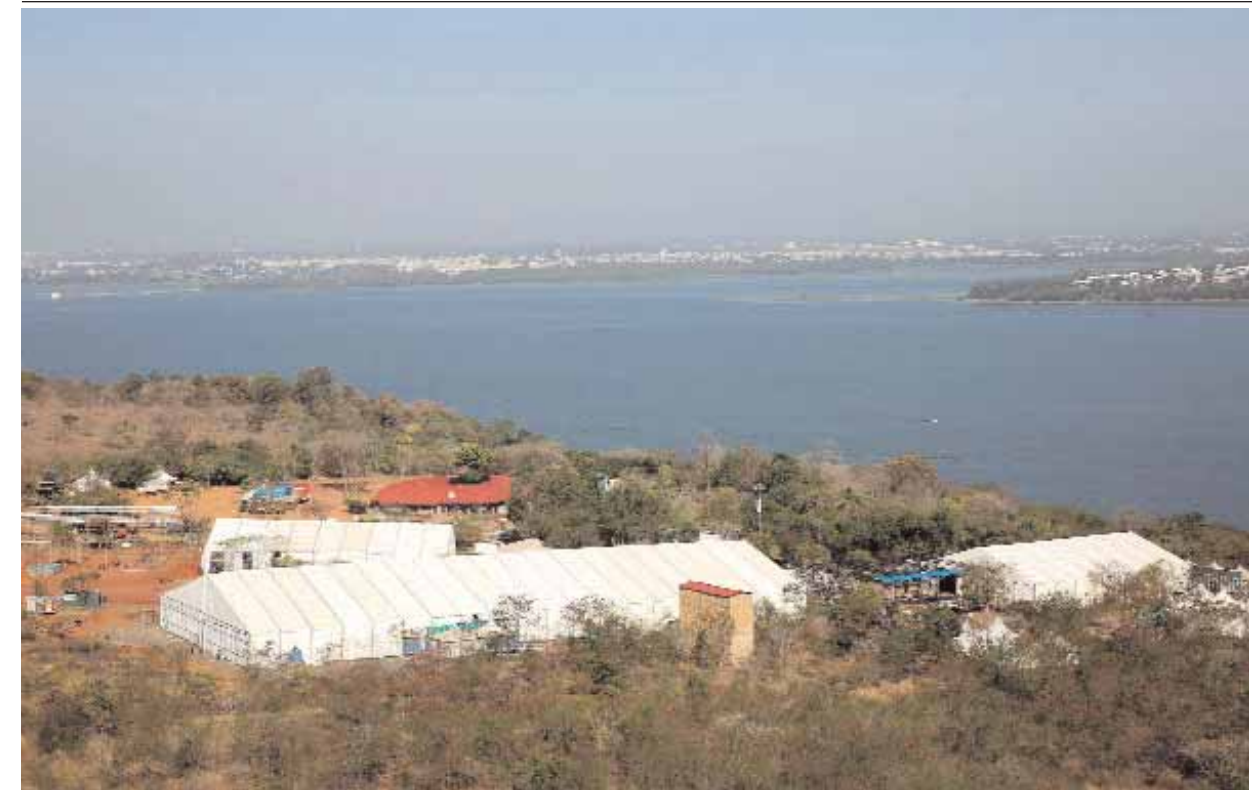
Preparations underway for the Global Investors Summit at Indira Gandhi Rashtriya Manav Sangrahalaya (IGRMS) in Bhopal on Thursday. Prime Minister Narendra Modi will inaugurate the business meet on Feb 24 and Union Home Minister Amit Shah will conclude the meet on February 25.