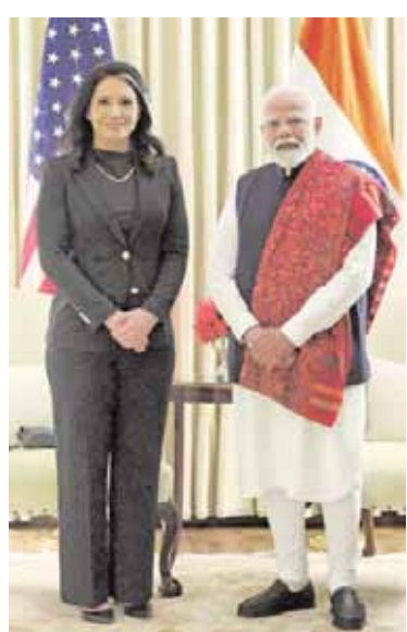
Prime Minister Narendra Modi with USA's Director of National Intelligence, Tulsi Gabbard in Washington DC