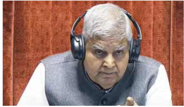
Rajya Sabha Chairman Jagdeep Dhanekar reacts during the Budget session of Parliament, New Delhi

"Taking note of public domain information and inputs available, it is expedient that the Secretary General, Rajya Sabha shares this for information with the Secretary General, Supreme Court of India," he said.