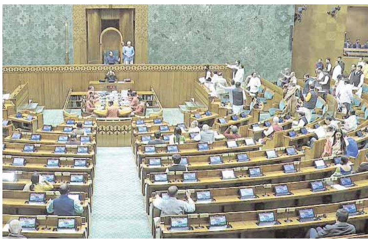
Members protest in the Lok Sabha during the Budget session of Parliament

redacted. "Some of the points which amount to casting aspersion on the committee itself have been removed. The chairman of the committee has powers to do so," he said, asserting, "Everything has been done as per rules," he said. Later redacted portions were also submitted to Rajya Sabha. The report on the Waqf (Amendment) Bill was tabled in Rajya Sabha by BJP member Medha Vishram Kulkarni, a member of the panel. The tabling of the report was followed by uproar by members from the Opposition benches. The clamour continued as Chairman Jagdeep Dhankhar tried to read out a message from President Droupadi Murmu. "Don't show disrespect to the President of India..." Dhankhar said and urged Kharge to ask the Opposition members to take their seats. As the uproar continued, the Upper House was adjourned till 11:20