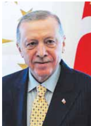
President Erdogan, who is in Pakistan on a two-day visit, made the comments after holding one-on-one and delegation talks with Prime Minister Shehbaz Sharif.

The ties between the two countries nosedived after India abrogated Article 370 of the Constitution, revoking the spe-