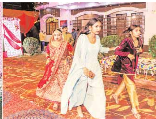
The bride and others are seen on the right image running to save their lives, in Lucknow

confused by the flashing lights and the screaming people, darted around the venue, looking for an