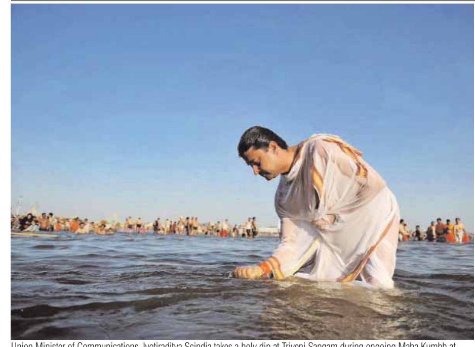
Union Minister of Communications Jyotiraditya Scindia takes a holy dip at Triveni Sangam during ongoing Maha Kumbh at Prayagraj, Uttar Pradesh on Thursday.