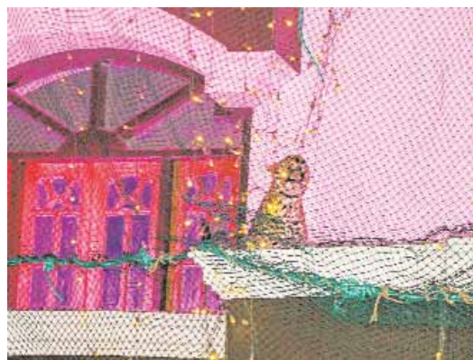
A leopard is seen in the left image after it entered a banquet hall amid an ongoing wedding, while the bride and others are seen on the right image running to save their lives, in Lucknow