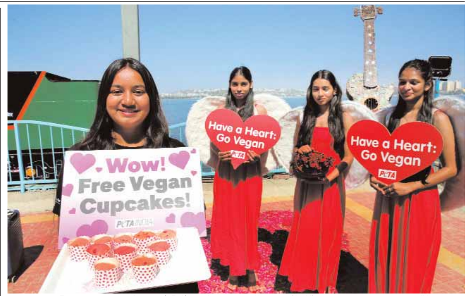
People for the Ethical Treatment of Animals (PETA) and Animals with Humanity (AWH) activists hold sign that reads 'Have a Heart: Go Vegan' during an awareness campaign to show compassion for animals switching to vegan eating, on the eve of Valentine's Day at Boat Club in Bhopal on Thursday.