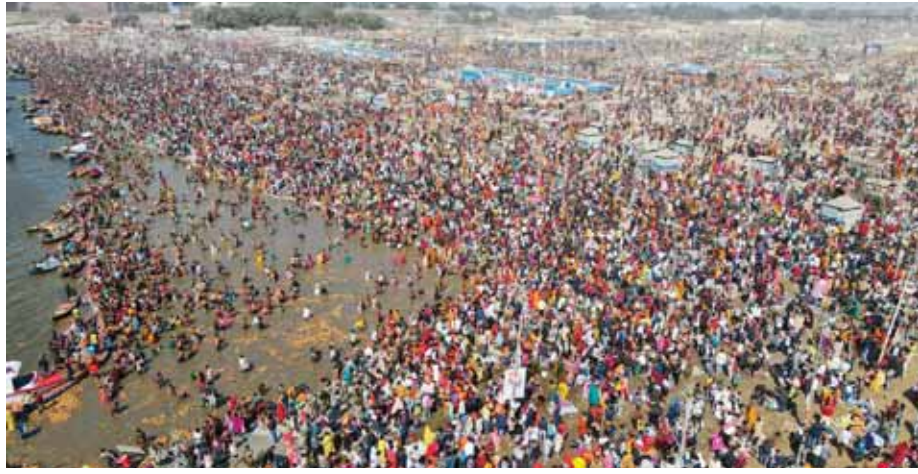
Thousands of devotees gathered to take holy dip at Sangam during ongoing Maha Kumbh Mela 2025, Prayagraj

Chhattisgarh Governor, CM, cabinet take holy dip. On Thursday, a 166-member Chhattisgarh delegation, led by Governor Ramen Deka, CM