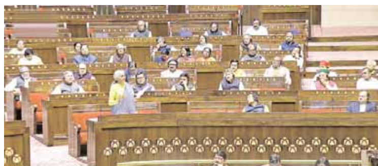
Union Finance Minister Nirmala Sitharaman speaks in the Rajya Sabha during the Budget session of Parliament, in New Delhi

Union Finance Minister Nirmala Sitharaman introduced the Income Tax Bill, 2025, in the Lok Sabha on Thursday and urged Speaker Om Birla to refer it to a select committee of the House. The much-anticipated Bill will replace terminologies such as "assessment year" and "previous year" with the easier-to-understand "tax year" as part of a move to simplify language while removing provisos and explanations. Following introduction, the Bill was referred to the select committee of the Lok Sabha, which is mandated to submit its report by March 10. Responding to the objections raised by some Opposition members at the introduction stage of the bill, the Finance Minister said Manish Tewari