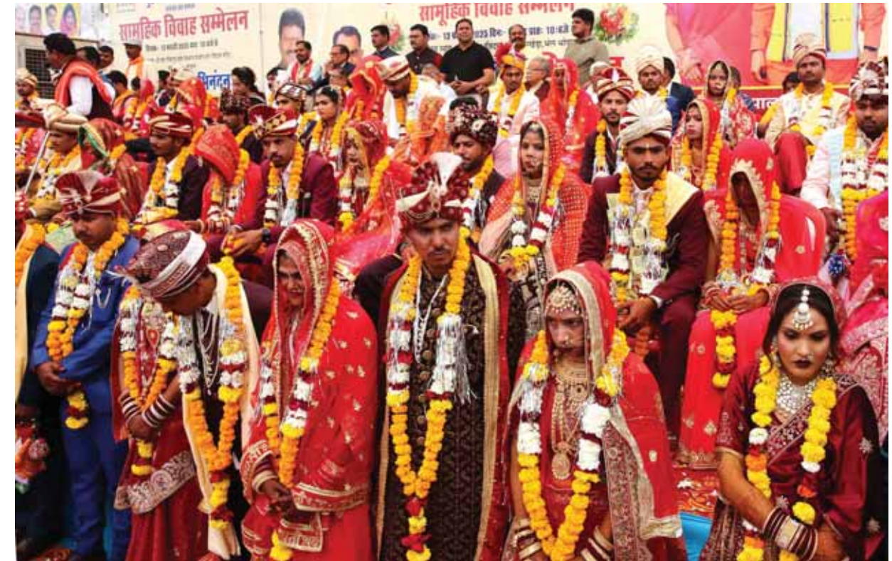
Newly wed couples of Sarv Samaj participate in a mass marriage ceremony organised under Mukhyamantri Kanyadan Yojana on the occasion of Sant Ravidas Jayanti in Bhopal on Wednesday. Around 90 couples tied the nuptial knot at the event.

a Western Disturbance that had reached North India on February 8. This disturbance led to cold winds entering Madhya Pradesh. However, with the system now dissipated and wind direction shifting southward, the state is no longer receiving cold air, causing both day and night temperatures to rise. A renewed drop in temperatures is expected from February 13. Just a week ago, the state experienced cold winds blowing at speeds of 36-40 km/h, but these have since subsided, contributing to the increase in warmth. On Tuesday, jet stream winds at an altitude of 12.6 km were recorded at 231 km/h, though their impact was not felt at ground level. Overall, a slight decline in temperatures is anticipated in the coming days, marking the return of winter-like conditions across the state.