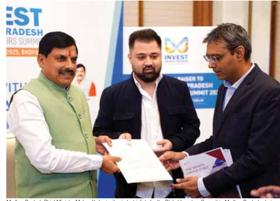
Madhya Pradesh Chief Minister Mohan Yadav invites industrialists for the Global Investors Summit in Madhya Pradesh during a curtain raiser programme in New Delhi on Wednesday.