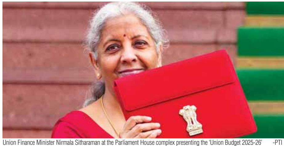
Union Finance Minister Nirmala Sitharaman at the Parliament House complex presenting the 'Union Budget 2025-26'

The simplified Income Tax bill 2025, which brings in the concept of 'tax year' and abolishes the archaic and complicated terms 'previous' and 'assessment years', is likely to be introduced in Parliament on Thursday. The bill comprises 536 sections, 23 chapters and 16 schedules in just 622 pages. It does not bring in any new taxes, but only simplifies the language of the existing Income Tax Act, 1961. The six-decade old legislation has 298 sections and 14 schedules. It had 880 pages when the Act was introduced. The new bill seeks to replace the Income Tax Act, 1961 which has become too voluminous due to the amendments made over the last 60 years. The new law is expected to come into effect from April 1, 2026. The new bill has omitted redundant sections, like those relating to Fringe Benefit Tax. The bill is free from