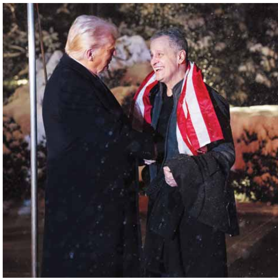
President Donald Trump, greets Marc Fogel at the White House, Tuesday.

Indonesia's state-run arms producer Pindad and Turkiye's FNSS jointly developed a new model of medium tank. In 2023, the two countries inked a plan of action for joint military exercises and defence industry cooperation. In addition to Indonesia, Turkiye has HILSCC cooperation forums with 21 other countries, including Pakistan. Turkiye and Indonesia plan to sign agreements on trade, investment, education and technology during Erdogan's visit. Erdogan will head on to Pakistan on Wednesday, where he and Prime Minister Shehbaz Sharif will address the Pakistan-Turkiye Business and Investment Forum and attend another HILSCC meeting.