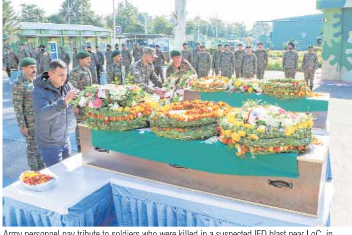
Army personnel pay tribute to soldiers who were killed in a suspected IED blast near LoC, in Jammu's Akhnoor.