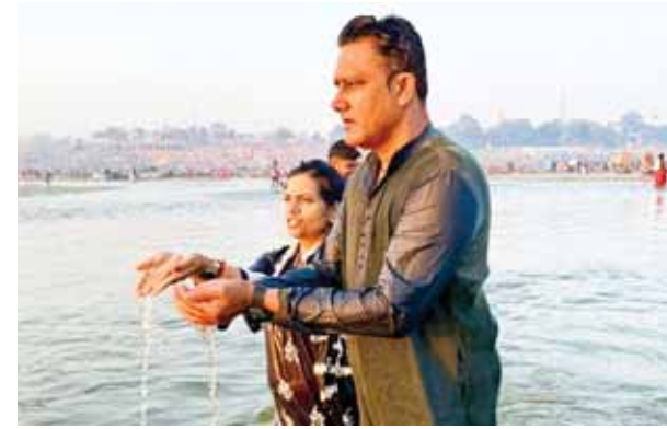
Former Indian cricket captain Anil Kumble prays after taking holy dip at the Sangam on Maghi Purnima, during the ongoing Maha Kumbh Mela 2025