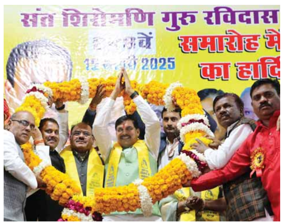
Madhya Pradesh Chief Minister Mohan Yadav being garlanded by the members of Ahirwar Community during the 648th birth anniversary celebration of Sant Ravidas, at Hindi Bhavan in Bhopal on Wednesday.