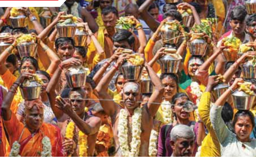
Devotees perform rituals during the Thaipusam festival at Vadapalani Murugan temple, in Chennai