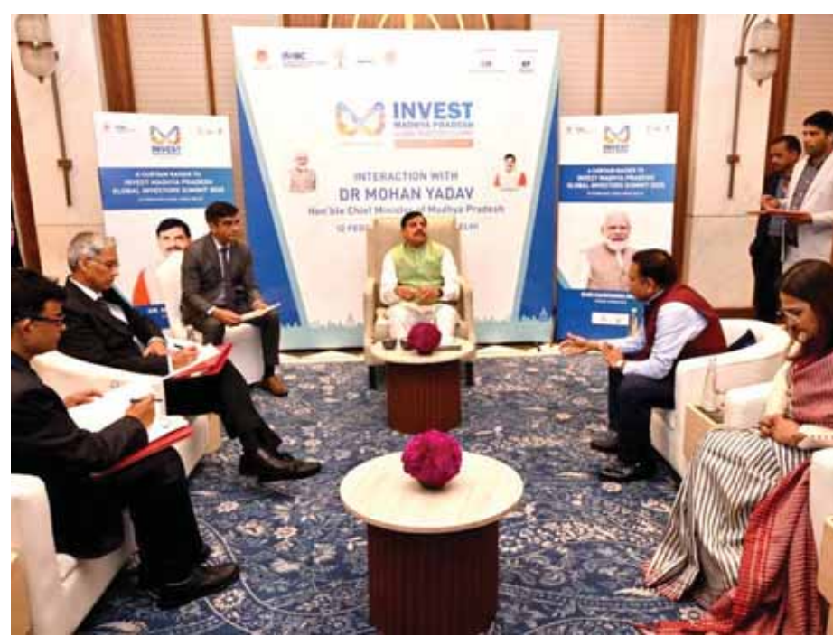
Madhya Pradesh Chief Minister Mohan Yadav during one-to-one discussion with industrialists to invite them for Global Investors Summit in Madhya Pradesh during a curtain raiser programme in New Delhi on Wednesday.

Global Investors Summit 2025 A Global Investors Summit will be held in Bhopal on February 24-25, 2025, to showcase Madhya Pradesh's efforts on the global stage. < The summit will be inaugurated by Prime Minister Narendra Modi, with leading industrialists, investors, and policymakers from both domestic and international markets expected to participate in this grand event. It will highlight the vast trade and investment opportunities available in Madhya Pradesh, helping propel the state's economic progress to new heights. Under the visionary leadership and positive policies of Chief Minister Mohan Yadav, Madhya Pradesh is not only strengthening its own economy but also playing a vital role in achieving Prime Minister Shri Modi's vision of a Vikas Bharat by 2047.