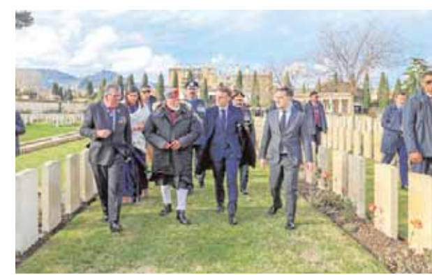
Prime Minister Narendra Modi and French President Emmanuel Macron at the Mazargues Cemetery to pay their respects to the fallen heroes, in Marseille.