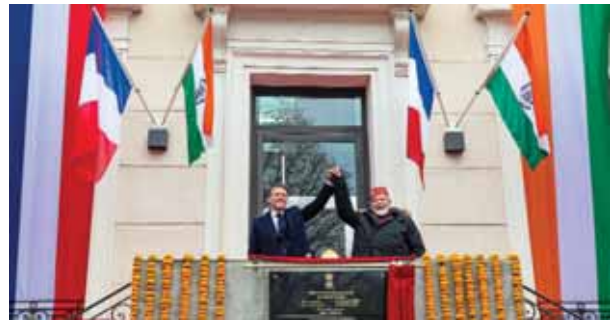
Prime Minister Narendra Modi and French President Emmanuel Macron during the inauguration of the Indian Consulate, in Marseille, France

The two leaders also acknowledged the strong civil nuclear ties between India and France and efforts in cooperation on the peaceful uses of nuclear energy,