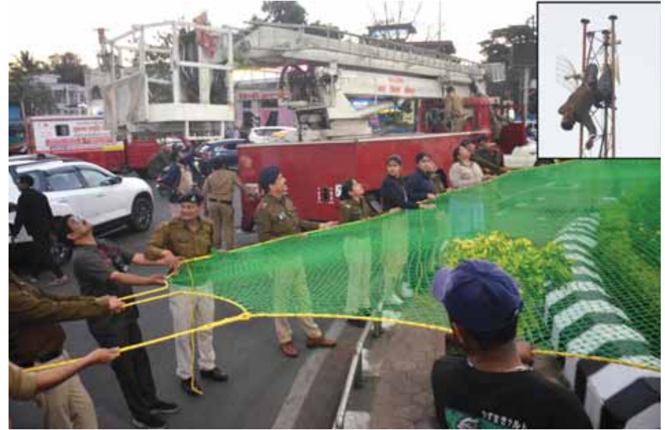
Rescue operation underway after a drunken street vendor climbed a tower (seen inset) in an attempt to commit suicide at Polytechnic square in Bhopal on Tuesday.