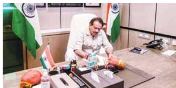
Minister of state for Panchayati Raj S P Singh Baghel

Minister of State for Panchayati Raj S P Singh Baghel will release the comprehensive Devolution Index Report on panchayats in the country on Thursday. It will provide insights into the progress of decentralisation across states and Union Territories, the ministry said on Tuesday. The Panchayati Raj Ministry in a statement issued here said the report titled "Status of Devolution to Panchayats in States - An Indicative Evidence Based Ranking 2024", will be released by the Minister on February 13. The ministry said it marks a milestone in India's journey towards empowering Panchayati Raj Institutions (PRIs) and realizing the vision of "Local Self Government" of the 73rd