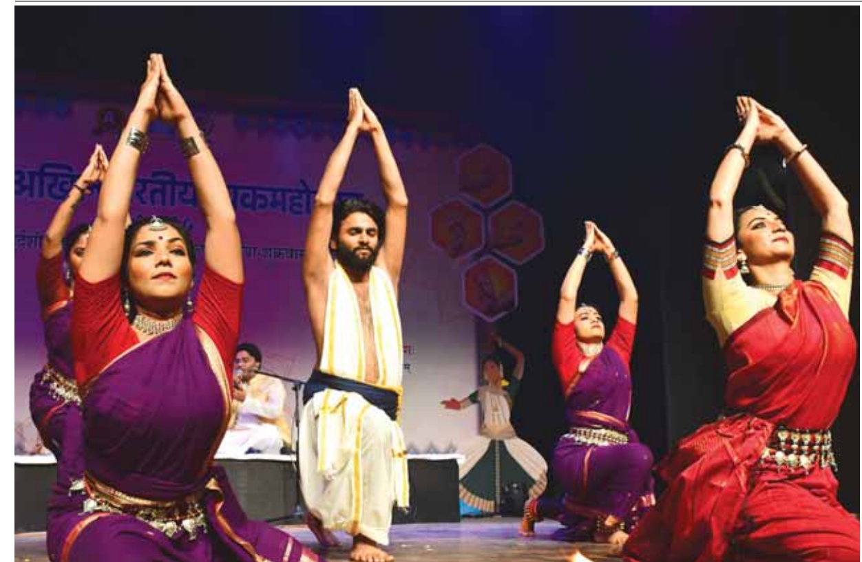
Artists present a cultural programme during 3rd Akhil Bharatiya Roopak Mahotsava, at Ravindra Bhawan in Bhopal on Tuesday.

experience of Bhopal's scenic tourist destinations. Visitors will explore the city's stunning lakes, the nature-rich Van Vihar National Park, and the Tribal Museum, which showcases the vibrant indigenous traditions of Madhya Pradesh. In addition, guests will be taken on tours of major tourist destinations around Bhopal. To highlight Madhya Pradesh's industrial progress, special visits to key industrial hubs such as Mandideep and Pithampur have been arranged. These tours will provide insights into the state's industrial capabilities and the vast investment opportunities available. Culinary experience blending tradition and global flavours. Guests attending the Global Investors Summit 2025 will get to savour the rich culinary heritage of Madhya Pradesh.