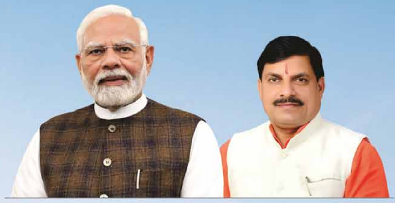
Narendra Modi Prime Minister

Trust and Investors First are the values that define Madhya Pradesh