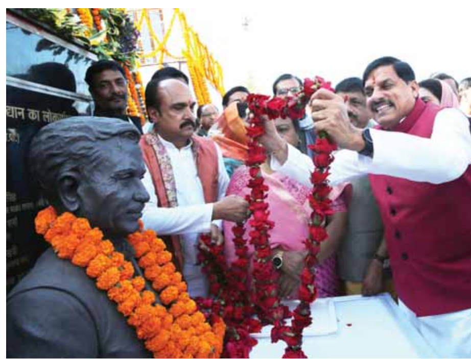
Madhya Pradesh Chief Minister Mohan Yadav pays tributes to Pt Deendayal Upadhyaya on his death anniversary at Lalghati square in Bhopal on Tuesday.