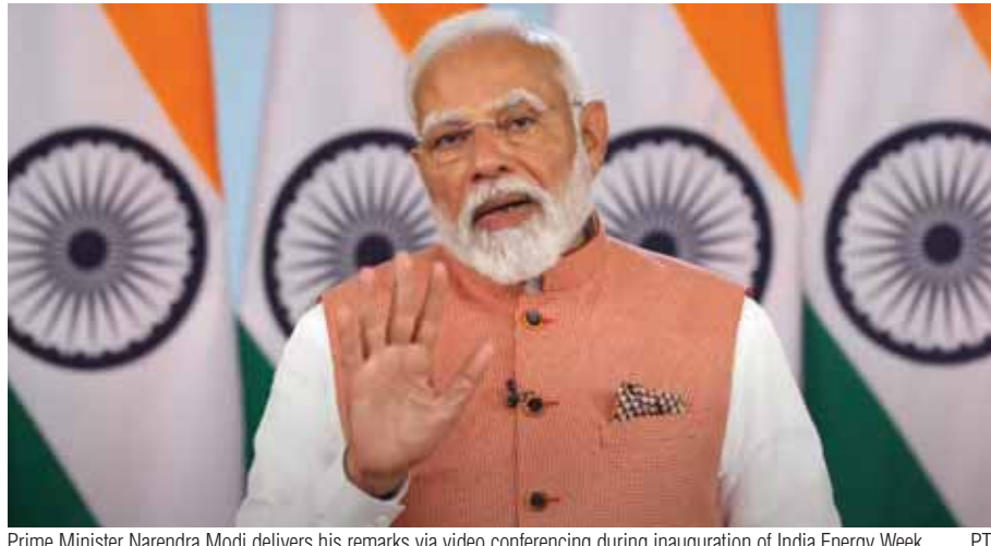
Prime Minister Narendra Modi delivers his remarks via video conferencing during inauguration of India Energy Week

important part of India's energy ambitions," Modi told investors. He further said, "All experts are saying that 21st century is India's century. Bharat is not only driving it is own growth but driving global growth." India's energy ambitions, he said, are based on five pillars. "We have resources, which we are harnessing. We are encouraging our brilliant minds to innovate. Thirdly, we have economic strength and political stability," he said. Also, he said, India has strategic geography, which makes energy trade easier and more attractive. Besides, India is committed towards global sustainability and this is aiding new possibilities in the country's energy sector, the prime minister said. For Viksit Bharat, the next two decades are very crucial, he said, adding that in the next five years we will cross many