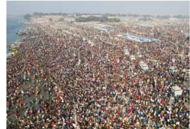
Devotees perform rituals at Sangam after taking a holy dip on the eve of 'Maghi Purnima' bath festival during ongoing Maha Kumbh Mela, in Prayagraj

"India stands ready to work with all nations in crafting solutions that are innovative, equitable and sustainable. Together, we can build a future where security and prosperity go hand in hand, ensuring peace and stability for generations to come," he added.