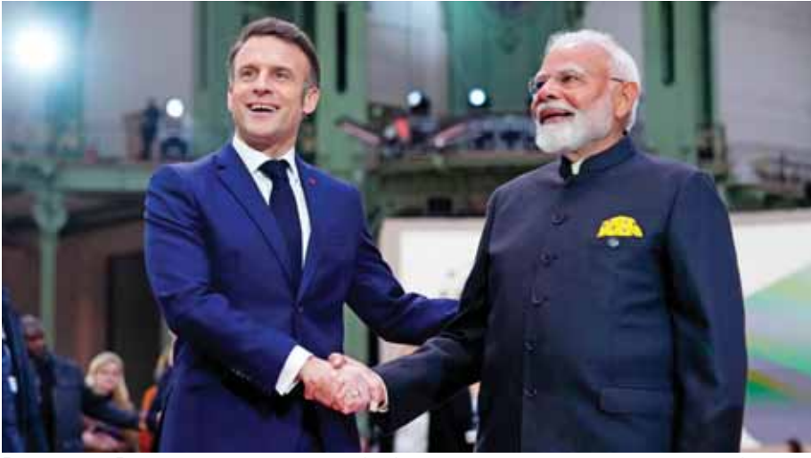
French President Emmanuel Macron shakes hands with India's Prime Minister Narendra Modi as they arrive to the Artificial Intelligence Action Summit at the Grand Palais in Paris, France

PTI ■ PARIS Prime Minister Narendra Modi on Tuesday made a strong case for collective efforts to establish a global framework for artificial intelligence (AI) based on open source which enhances trust, transparency and is free from biases. Co-chairing the AI Action Summit along with French President Emmanuel Macron here, Modi said that AI is changing the polity, economy, security and society, and is writing the code for humanity in this century. Modi also offered to host the next AI Action Summit in India, supporting the decision taken at the first summit hosted by France to set up the 'AI Foundation' and the 'Council for Sustainable AI'. "There is a need for collective global efforts to establish governance and standards that uphold our shared values, address risks and build trust," Modi said, adding that governance is not just about managing risks and rivalries but is also about promoting innovations and deploying them for global good. "We must democratise technology and create people-centric applications. We must address concerns related to cyber security, disinformation and deep fakes," the Prime Minister said. Stressing on the need to develop quality data sets free from biases, the Prime Minister said there is a need to develop open-source AI ecosystems that enhance trust and transparency. He said the technology should be rooted in the local ecosystem for it to be effective and useful. Modi started his address with