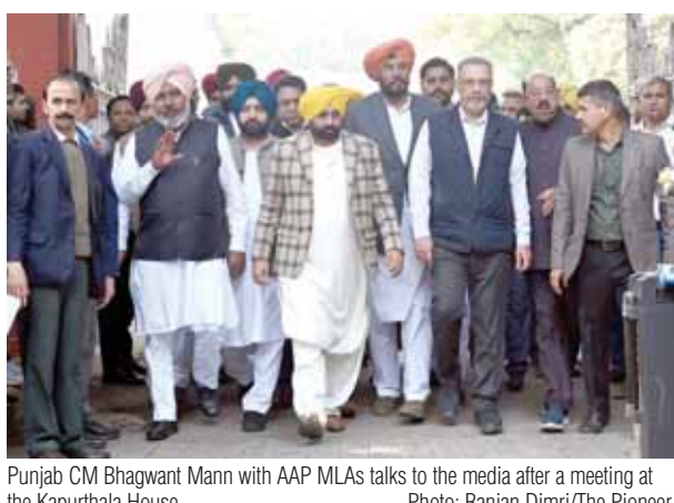
Punjab CM Bhagwant Mann with AAP MLAs talks to the media after a meeting at the Kapurthala House

RAJESH KUMAR ■ NEW DELHI Amidst reports of exodus of MLAs, Aam Aadmi Party (AAP) convener Arvind Kejriwal met Punjab chief minister Bhagwant Mann and 91 state MLAs in Delhi on Tuesday and dismissed speculation of internal discord within the party stating that "all is well" in the party. After the meeting, which lasted for about an hour, Mann and other leaders outright rejected the possibility of Kejriwal becoming the Chief Minister of Punjab and about 35 MLAs in Punjab breaking away and joining the Congress. "Our MLAs arrived here for a meeting with party national convener Arvind Kejriwal, who expressed his gratitude for their efforts in campaigning during the Delhi Assembly elections," the chief minister said. He said the party accepts the verdict of the people in the Delhi Assembly elections while praising the AAPs' 'Delhi model' of governance. The meeting sent out a strong signal about there being no threat to the party's government in Punjab amid claims by the rival Congress about a brewing discontent