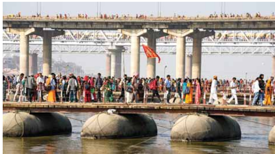
Rush of devotees on pontoon bridge on the eve of 'Magh Purnima' during the ongoing Mahakumbh Mela, in Prayagraj

Stressing the importance of seamless traffic and crowd management, he instructed authorities to fully utilise parking facilities capable of accom-