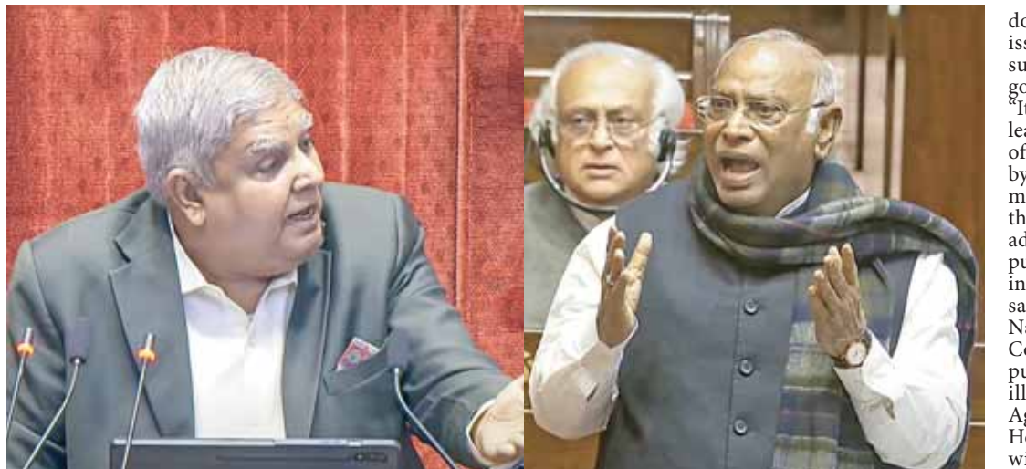
Leader of Opposition Mallikarjun Kharge speaks in the Rajya Sabha as Chairman Jagdeep Dhankhar looks on during Budget session of Parliament, in New Delhi, Tuesday

categorical, the Constitution signed by the founding fathers of the Constitution, carrying 22 miniatures, is the only authentic one and it can include amendments by the Parliament. If there is any change effected by judiciary or any institution, it is not acceptable to this House. "I will appeal to the Leader of the House to ensure that in the country only the authentic version of the Indian Constitution be promulgated. Any violation of this should be taken quite seriously by the government and severe action taken," the Chairman said in the House. Kharge was first given the floor to speak on the issue, who alleged that the BJP was unnecessarily raising the issue to create a controversy. "They are unnecessarily raising the issue and want to create a controversy on Ambedkar's Constitution. They never raised this issue when Ambedkar, Patel, others were alive...Now they are bringing new