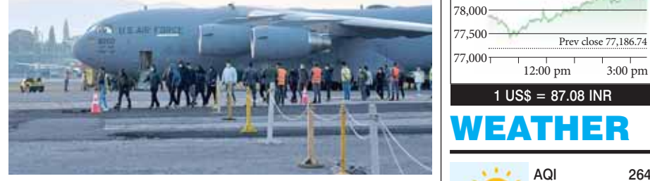
A C-17 aircraft carrying 205 Indian nationals departed from San Antonio, Texas around 3 am IST, sources said. The plane, headed to Punjab's Amritsar, is likely to stop at Ramstein, Germany, for refuelling, they said, adding each one was verified before being sent back.

PIONEER NEWS SERVICE ■ NEW DELHI Amidst reports that a US military aircraft is bringing 205 illegal Indian migrants back to country, most likely Amritsar, US said on Tuesday it is rigorously tightening immigration laws. Its embassy also said, "These actions send a clear message: illegal migration is not worth the risk." Asked about the deportation flight bringing back a group of illegal migrants to India, a US embassy spokesperson here did not provide details, but asserted that Washington is removing illegal migrants. "I can't share any details on those inquires, but I can share, on the record, the United States is vigorously enforcing its border, tightening immigration laws, and removing illegal migrants," the official said. "These actions send a clear message: illegal migration is not worth the risk," he added. Incidentally, this action comes days ahead of Prime Minister Narendra Modi's likely visit to the US next week.