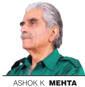
ASHOK K MEHTA

In Narendra Modi's cabinet, Defence Minister Rajnath Singh enjoys the optics of seniority, but not necessarily the authority that should come with it