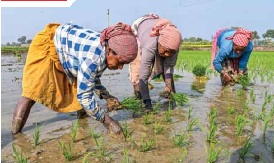
Labourers plant paddy saplings in a field, in Nadia