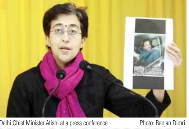
Delhi Chief Minister Atishi at a press conference.

STAFF REPORTER ■ NEW DELHI A day before Delhi Assembly polls, police on Tuesday registered three FIRs regarding Model Code of Conduct (MCC) violations in Kalkaji -- one against Chief Minister Atishi, another against other AAP members, and a third against two BJP leaders. The AAP leader has been named in a disobedience case registered at Govindpuri police station under Section 223 of Bharatiya Nyaya Samhita. Meanwhile, the stage is set for the high-stakes Assembly elections in Delhi, with over 1.56 crore voters eligible to cast their ballots from 7 am onwards on Wednesday. Voting will take place across 13,766 polling stations in all the 70 Assembly constituencies to decide the fates of 699 candidates in a contest that