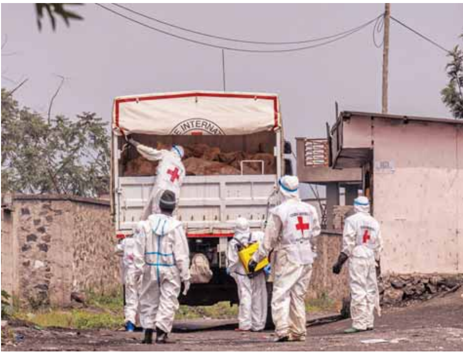
Red Cross personnel load bodies of victims of the fighting between Congolese government forces and M23 rebels in a truck in Goma, Democratic Republic of Congo, Monday as the U.N. health agency said 900 died in the fight.

stoppage of people from making the journey to the United States and has worked with regional countries to boost immigration enforcement on their borders as well as to accept deportees from the United States. One idea being floated is to negotiate a so-called "safe third country" agreement with El Salvador that would allow for non-Salvadorean migrants in the US to be deported to El Salvador.