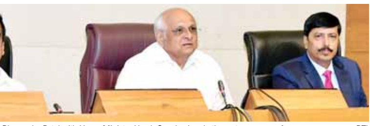
Gujarat Chief Minister Bhupendra Patel with Home Minister Harsh Sanghavi and others at a press conference.