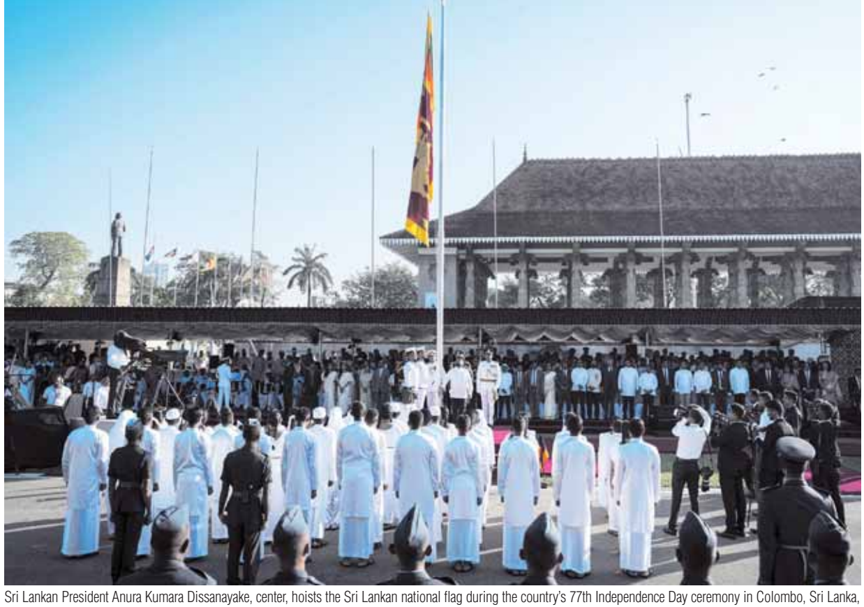
Sri Lankan President Anura Kumara Disanayake, center, hoists the Sri Lankan national flag during the country's 77th Independence Day ceremony in Colombo, Sri Lanka, Tuesday.

PTI ■ COLOMBO President Anura Kumara Disanayake on Tuesday said that Sri Lanka must work in unison to achieve economic freedom rather than yield to vulnerabilities within the global economic system.