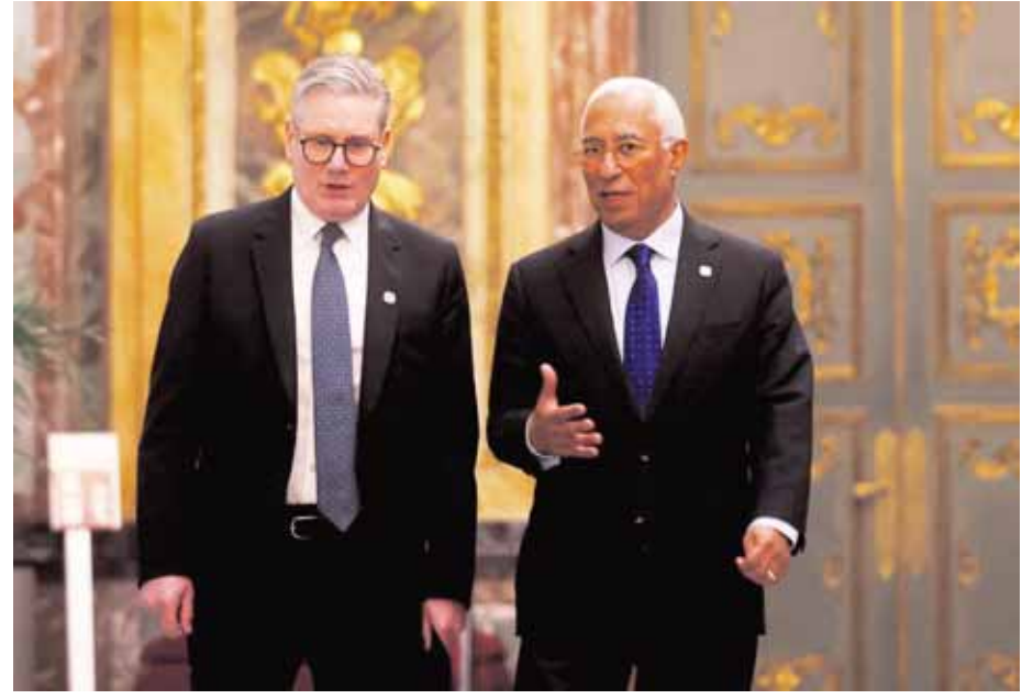
Britain's Prime Minister Keir Starmer, left, speaks with European Council President Antonio Costa as he arrives for an EU summit at the Egmont Palace in Brussels, Monday.

on the fact "that everybody has to respect the sovereignty of all national states in the world, and that Greenland is today a part of the Kingdom of Denmark. It's part of our territory and it's not for sale." European Council President Antonio Costa, noting that the EU has stood beside Ukraine in defense of its borders, said of Greenland: "Of course, we will stand also for these principles, all the more so if the territorial integrity of a member state of the European Union is questioned." Frederiksen acknowledged US concerns about security in the Arctic Region, where Russia and China have been increasingly active. "I totally agree with the Americans that the High North, that the Arctic region is becoming more and more important when we are talking about defense and security and deterrence," Frederiksen said.