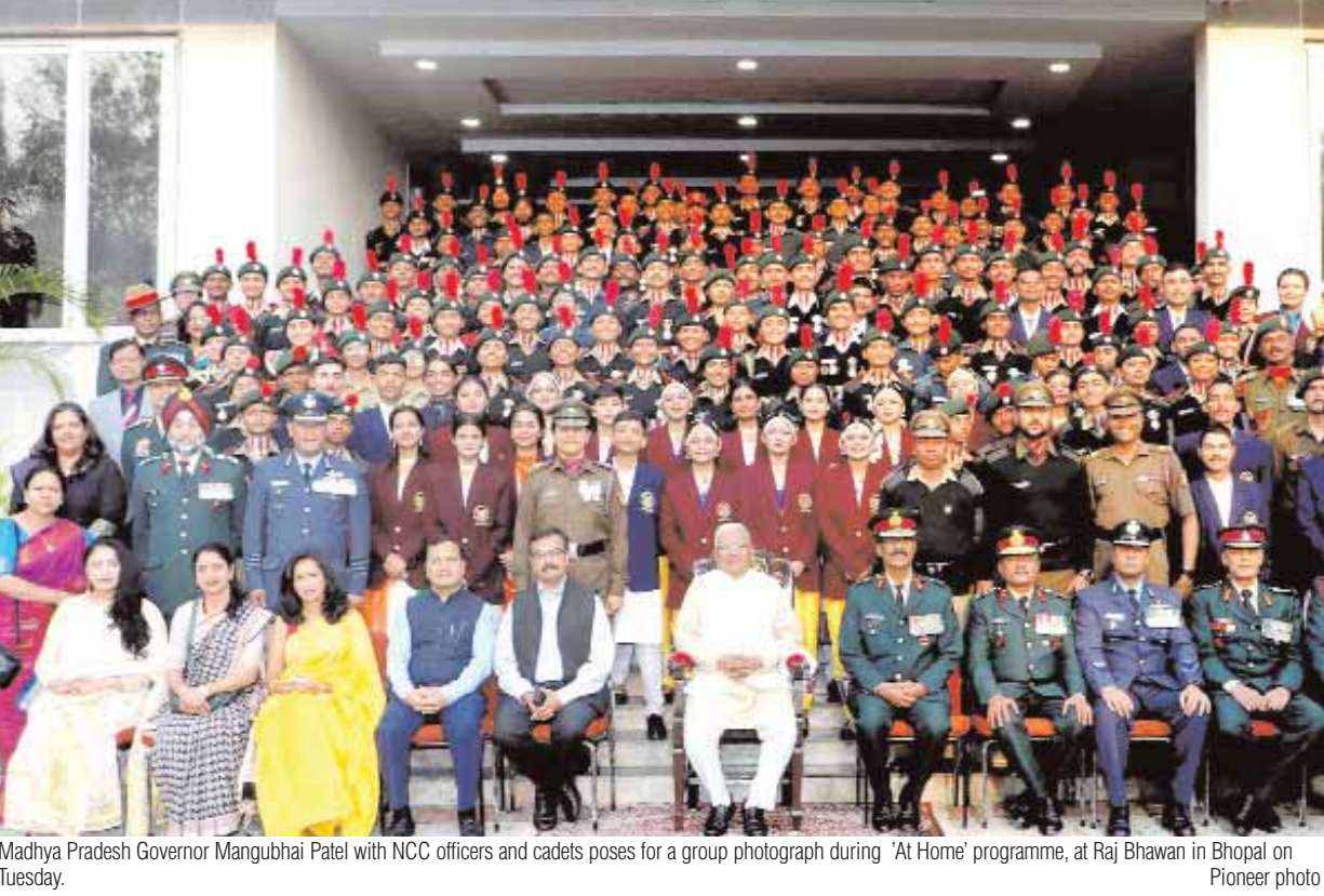
Madhya Pradesh Governor Mangubhai Patel with NCC officers and cadets poses for a group photograph during 'At Home' programme, at Raj Bhawan in Bhopal on Tuesday.

Maidan, where fountains will be reactivated, and new lighting features will be installed. Similarly, Kamla Park and Qudisia Park are receiving upgrades, including new benches and functioning fountains. Notable landmarks are also undergoing improvements. The statues of Pandit Deendayal Upadhyay and Dr Shyama Prasad Mukherjee at Lalghati are being accorded a facelift. The area around the bridge at Lalghati is also being enhanced with landscaping and new plantings, while a series of vibrant wall paintings are set to beautify the area. The Boat Club area is also being transformed. The waterfall site will receive new lighting and artwork, creating a more appealing visual experience for visitors. A variety of civil works are being completed across the Boat Club area, with painted murals and sculptures being added to provide an artistic touch.