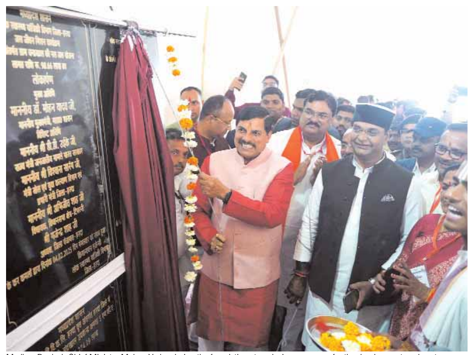
Madhya Pradesh Chief Minister Mohan Yadav during the foundation stone laying ceremony for the development works at Chipaner in Harda district Madhya Pradesh on Tuesday.

Supari worth Rs 12 cr seized. Bhopal: In a significant operation on Tuesday, a Central Goods and Services Tax (CGST) team raided an unregistered warehouse on Berasia Road, uncovering a massive stash of betel nuts (supari) worth an estimated Rs 12 crore. The seizure, which weighs in at a staggering 310 tonnes, was concealed inside 4,500 sacks. The raid was carried out based on confidential information, with CGST officials confirming that initial investigations point to the betel nuts being stored without proper documentation or registration. The warehouse, which was found to be operating without any official records, raises concerns regarding the legality and source of the betel nuts.