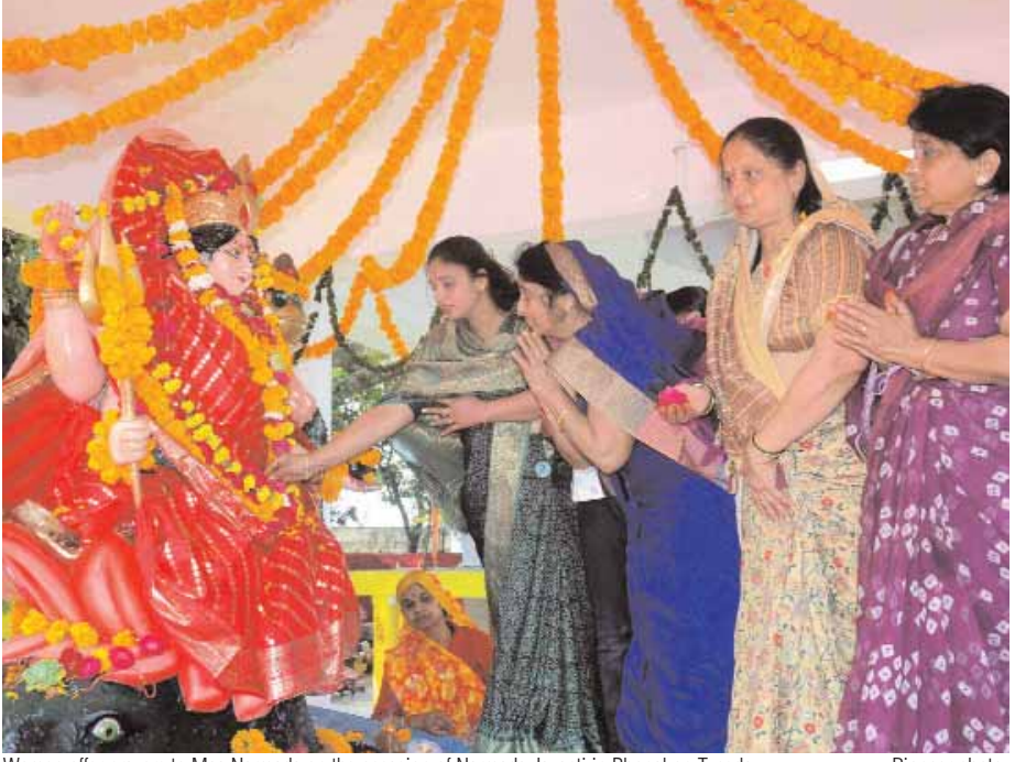
Women offer prayers to Maa Narmada on the occasion of Narmada Jayanti in Bhopal on Tuesday.