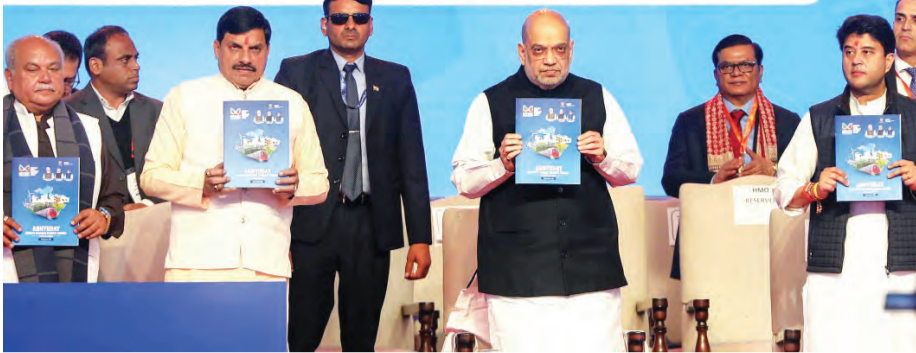
Union Home Minister Amit Shah, Union Minister of Communications Jyotiraditya Scindia, Madhya Pradesh Chief Minister Mohan Yadav and State Assembly Speaker Narendra Singh Tomar during the 'Abhyudaya Madhya Pradesh Growth Summit' organised on the occasion of the 101st birth anniversary of former prime minister Atal Bihar Vajpayee in Gwalior on Thursday

संवर 2025 | स्थान: मेला ग्राउंड, ग्वालियर