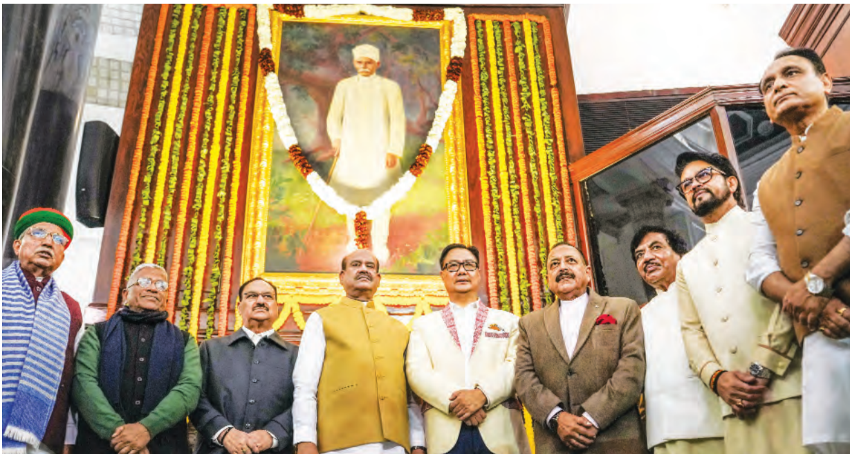
Lok Sabha Speaker Om Birla, Rajya Sabha Deputy Chairman Harivansh Narayan Singh, Union Ministers JP Nadda, Kiren Rijiju, Ministers of State Arjun Ram Meghwal, Jitendra Singh, BJP MP Anurag Thakur and others during a ceremony to paying tribute to Pandit Madan Mohan Malaviya on his birth anniversary, at Samvidhan Sadan in New Delhi on Thursday

Projecting claims without proper authorisation or consent from students further compounded the misleading nature of the advertisements. "In highly competitive examinations such as the UPSC Civil Services Examination, where lakhs of aspirants invest substantial time, effort and financial resources, such incomplete and selective disclosures mislead students and parents by creating false expectations regarding outcomes and the effectiveness of coaching services," the authority Stated. So far, the CCPA has issued 57 notices to various coaching institutes for misleading advertisements and unfair trade practices. Penalties totalling ₹1.09 crore have been imposed on 28 institutes, along with directions to discontinue such misleading claims. The Authority emphasised that all coaching institutes must strictly ensure truthful and transparent disclosure of information in their advertisements, enabling students to make fair and informed academic decisions.