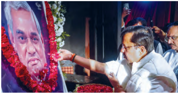
BJP National Working President Nitin Nabin paying tribute to former PM Atal Bihari Vajpayee during a party meeting in New Delhi

"Vajpayee's life, dedicated to public service and the all-round development of the country, is an inspiration to all of us. His vision of good governance and development is being fulfilled by our illustrious prime minister, Narendra Modi, who successfully implemented