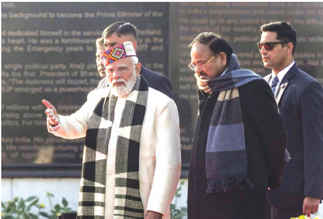
Prime Minister Narendra Modi and former Vice President M Venkaiah Naidu during a ceremony to pay tribute to former prime minister Atal Bihari Vajpayee on his 101st birth anniversary at 'Sadaiv Atal' in New Delhi on Thursday

selection and sports infrastructure often took place in sports. "Today, those practices have come to an end. Even children from the poorest families can now rise to the highest levels purely through hard work and talent," he said. PM Modi also referred to the allocation of more than ₹3000 crore for the country's sports budget, which was less than ₹1200 crore before 2014. He said that through a special scheme, athletes are being provided monthly financial assistance ranging from ₹25,000 to ₹50,000 each. "Today, I want to tell every athlete of the country that you are not just playing for your own victory, you are playing for the country, you are playing for the honour and dignity of the tricolour," he said. The prime minister also requested all parents to encourage their children to take part in sports and give them opportunities to participate in sporting activities. Sports is not just a part of learning, it is also important for a healthy body