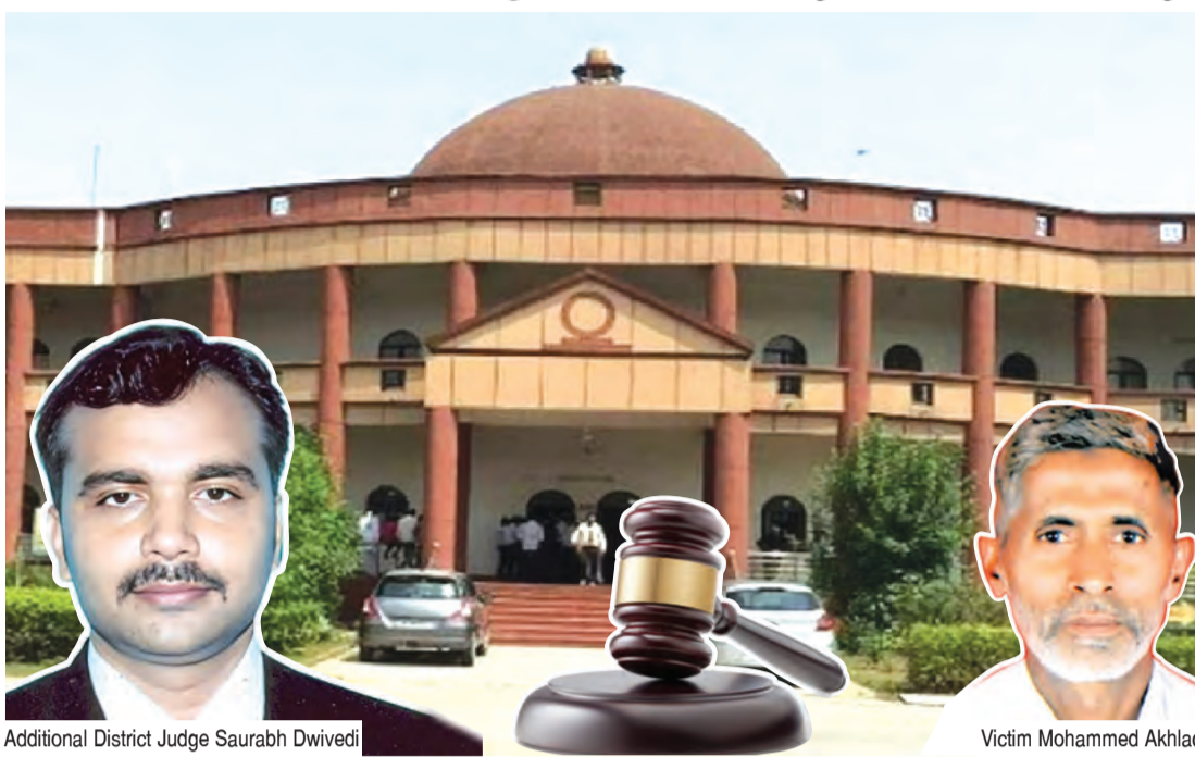
Additional District Judge Saurabh Dwivedi

Welcoming the trial court decision to dismiss the Prosecution's