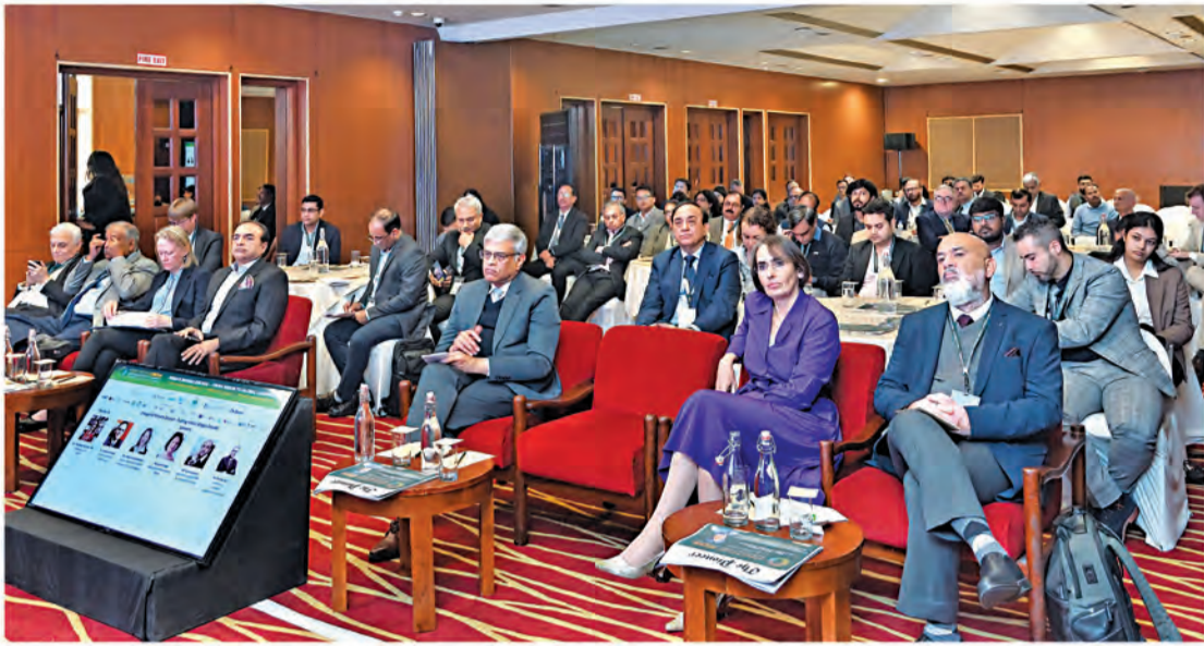
Engaged delegates listen intently to insightful discussions at the Policy and Leadership Track sessions during the World Biogas Association's India Congress 2025, as industry leaders and policymakers shared perspectives on shaping India's biogas future