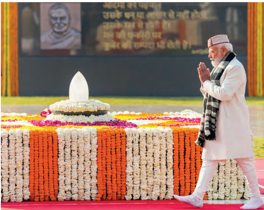
Prime Minister Narendra Modi paying tribute to former PM Atal Bihari Vajpayee on his 101st birth anniversary at Sadaiv Atal in New Delhi on Thursday

Addressing a public gathering after the inauguration, Modi said, "The BJP is proud that our Government had the opportunity to tear down the wall of Article 370," adding that the legacy of good governance created by the BJP-led NDA Government was now being taken to new heights at both the Centre and State levels. "We must