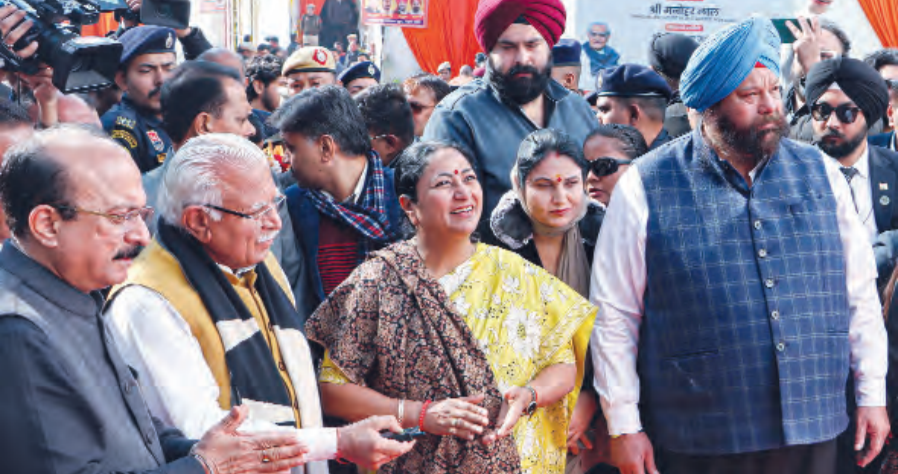
Union Minister of Housing and Urban Affairs Manohar Lal, Delhi CM Rekha Gupta and minister Ashish Sood during the inauguration of an 'Atal Canteen' to commemorate the birth anniversary of former prime minister Atal Bihari Vajpayee in New Delhi on Thursday