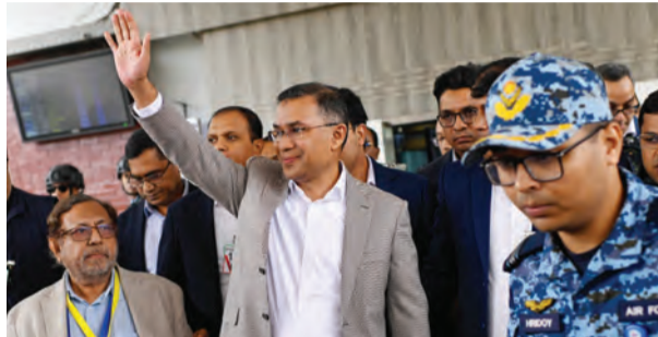
BNP acting chairman, Tarique Rahman, waving to supporters at Hazrat Shahjalal International Airport in Dhaka on Thursday