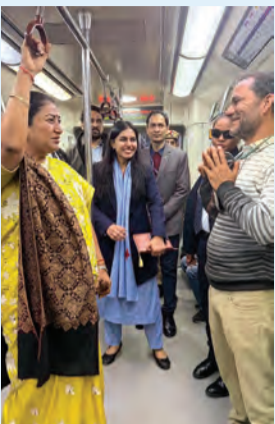
CM Rekha Gupta interacts with people during a metro ride in New Delhi

New Delhi: Chief Minister Rekha Gupta travelled by Metro to convey the message of environmental protection. She travelled from Delhi Gate Metro Station to Lajpat Nagar Metro Station. During the journey, she interacted with fellow commuters, listened attentively to their experiences and sought feedback on Government schemes. By encouraging greater use of public transport, especially the Delhi Metro, the Chief Minister conveyed the message that increased reliance on public transport can significantly help reduce air pollution in Delhi.