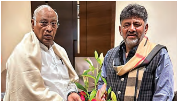
Karnataka Deputy Chief Minister DK Shivakumar meets AICC President Mallikarjun Kharge at his residence in Bengaluru

The power tussle within the ruling party has intensified amid speculations about a change in chief minister in the State, after the Congress