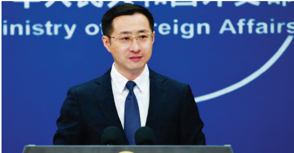
Chinese Defence Ministry spokesman Zhang Xiaogang

China on Thursday denounced a Pentagon report, which accused Beijing of leveraging reduced border tensions with India to undermine US-India ties while deepening defence ties with Pakistan as an attempt to sow discord with false narrative. The Pentagon’s report distorts China’s defence policy, sows discord between China and other countries, and aims at finding a pretext for the US to maintain its military supremacy,” Foreign Ministry spokesperson Lin Jian told a media briefing here when asked about the US Department of War report submitted to the American Congress. China firmly opposes the report, Lin said. Separately, Chinese Defence Ministry spokesman Zhang Xiaogang denounced the Pentagon report, which also highlighted the cooperation between China and Pakistan in sectors such as defence and space, with plans to set up a military base. The US releases such reports year after year, grossly interfering in China’s internal affairs, Zhang told a separate media briefing. The US report maliciously misinterpreted China’s national defence policy, made unfounded speculations about China’s military development, slandering and smearing the normal