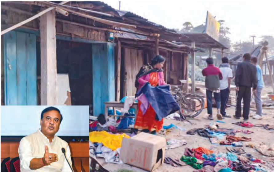
People at a vandalised area following violent protests demanding eviction of encroachers from tribal belts at Kheroni in Karbi Anglong district, Assam, (Inset) Assam CM Himanta Biswa Sarma

In fact, all the evictions the Assam Government has carried out so far in different forests were done only after fighting cases in the high court and the Supreme Court, and the administration proceeded only after the courts said yes to its move, he added.