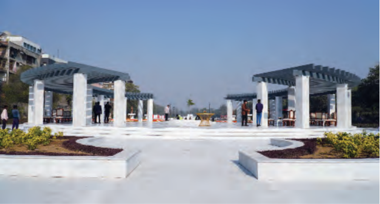
(Left) Newly-inaugurated Atal Bihari Vajpayee Sadbhavana Udyan and (Right) LG VK Saxena with CM Rekha Gupta during the renaming of 'Sadbhavana Udyan' as 'Atal Bihari Vajpayee Sadbhavana Udyan' on the 101st birth anniversary of former prime minister Atal Bihari Vajpayee in New Delhi on Thursday