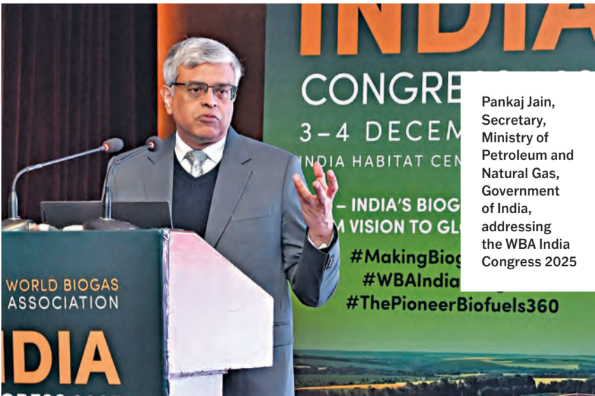
Pankaj Jain, Secretary, Ministry of Petroleum and Natural Gas, Government of India, addressing the WBA India Congress 2025