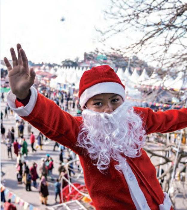
A child dressed as Santa Claus posing for a picture during the Christmas celebrations in Shimla