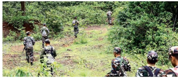
Security forces have destroyed a weapons manufacturing facility operated by Maoists in Chhattisgarh's Sukma district and seized eight rifles and a large cache of materials used in making firearms and explosives, police said on Monday.