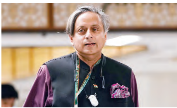
Congress Shashi Tharoor

He welcomed the revival of Nalanda University as a symbol of India's civilisational legacy.