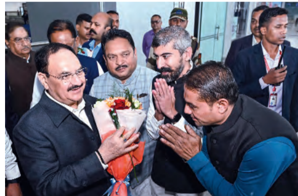
BJP National President and Union Minister JP Nadda being welcomed by BJP leaders at Swami Vivekananda Airport in Raipur, Chhattisgarh

On May 25, 2013, Maoists attacked a convoy of Congress leaders during the party's 'Pariwartin Rally' ahead of the assembly elections in the Jhiram valley in Bastar district, killing 32 people, including then State Congress chief Nand Kumar Patel, former leader of opposition Mahendra Karma, and former union minister Vidyacharan Shukla. Nadda said a decisive action was taken against Maoism under the double-engine Government in the Centre and the state, under CM Sai. He claimed that Naxalism has now been confined to a