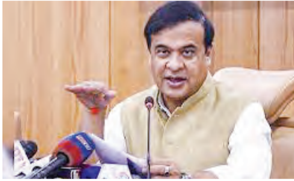
Chief Minister Himanta Biswa Sarma

"We have to be vigilant and must keep a sharp eye on the