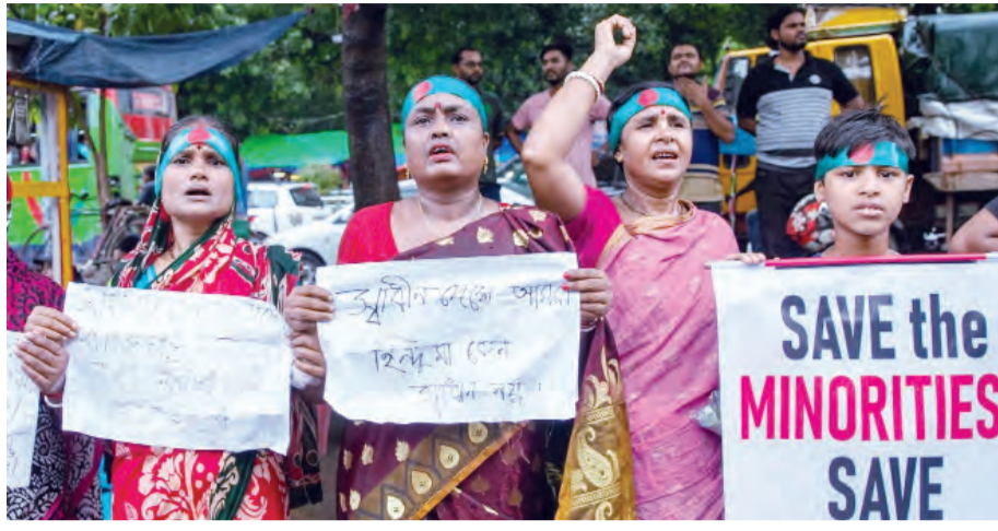
Women protest against attacks on the Hindu minority