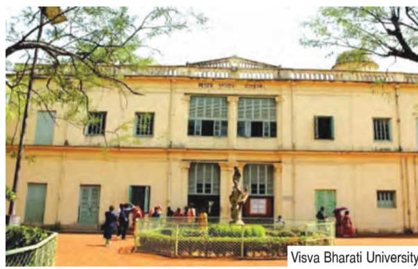
Visva Bharati University

The court had earlier sought a report detailing arrangements for the control