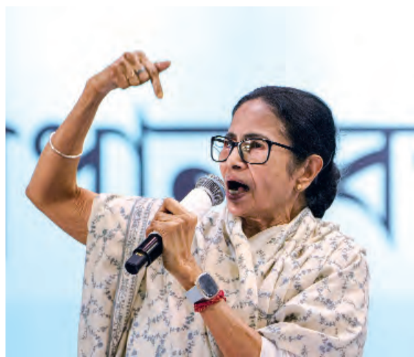
West Bengal Chief Minister and TMC supremo Mamata Banerjee addressing the party's booth level agents (BLAs) during a meeting in Kolkata

The ECI has appointed central government employees as micro-observers during the hearing process when the ECI officials would hear out the voters whose