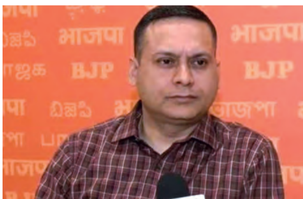
It is evident that she has not read the VB-G RAM G Act, because her arguments rest on mischaracterisations, selective memory, and outright falsehoods