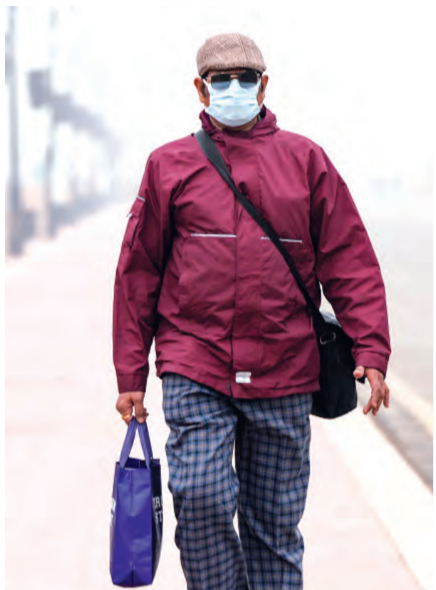
A man walks wearing a mask on a smoggy and winter day at Kartavya Path in New Delhi on Monday

Among NCR districts, Gurugram contributed 8.6 per cent, Jhajjar 8.5 per cent,