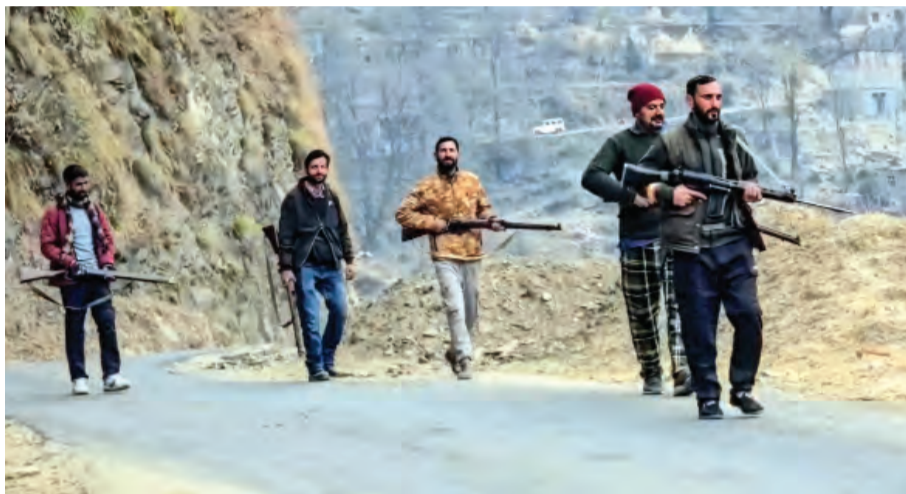
Village Defence Guards (VDGs) keep vigil during a joint security drill in a hilly area as police and other forces continue search operations and anti-militancy measures across the State in Doda, Jammu and Kashmir

operations have been supervised at the highest level by the senior army and police officials of the Jammu and Kashmir police.