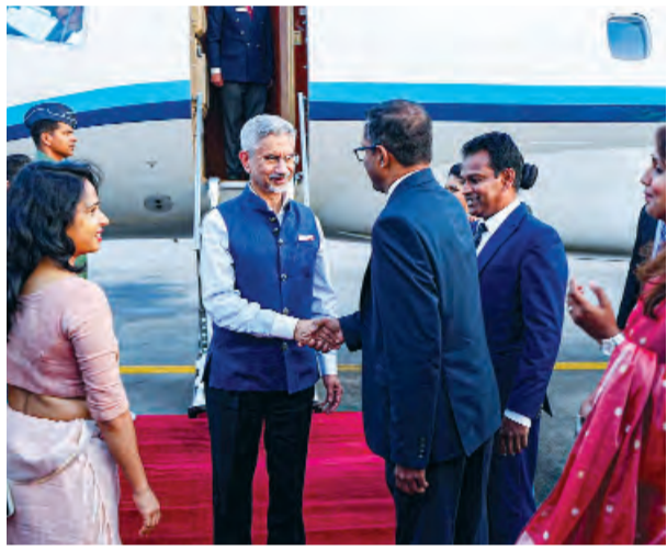
External Affairs Minister S Jaishankar being welcomed by Sri Lankan Minister Ruwan Ranasinghe in Colombo, Sri Lanka