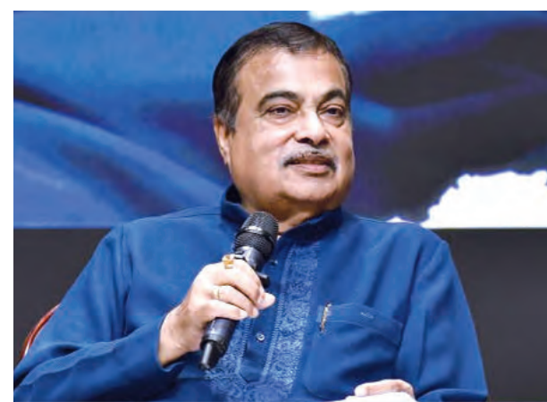
The progress of the country, resources, and technologies are important, but what is more important is the futuristic technology and knowledge. The future of any country is based on what type of futuristic technology it possesses

"The manufacturing sector contributes around 22 to 24 per cent to the GDP, while agriculture and allied activities together account for only about 12 per cent. Unless