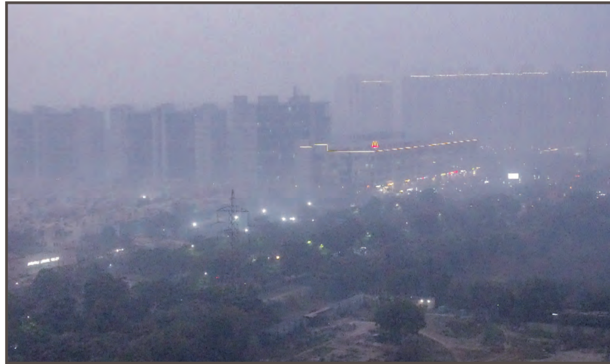
A layer of smog engulfing Delhi-NCR, during a cold winter evening on Monday

The city saw brief relief for two consecutive days when