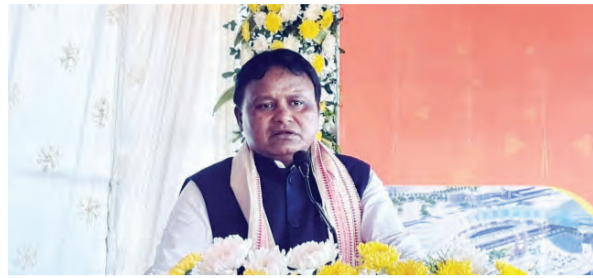
Odisha Chief Minister Mohan Charan Majhi on Monday claimed that the State has entered a "golden era" of industrialisation, citing strong response from investors at the recently concluded investor summit in Hyderabad.