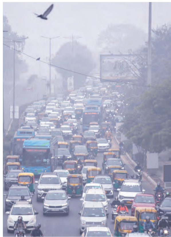
Vehicles plying on a road as a layer of smog shrouds the area on a winter day in New Delhi on Monday

The committee will assess emissions and health impacts, suggest clean mobility strategies, review EV readiness, and recommend regulatory measures.