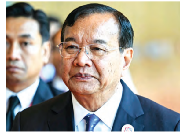
Thailand's Foreign Minister Sihasak Phuangketkeow

While Cambodia has publicly said it is ready for an unconditional ceasefire, Bangkok never received any direct proposal and Thailand believed such statements were aimed at increasing international pressure rather than resolving the issue, Sihasak said following the meeting that was arranged