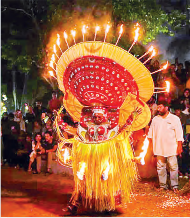
An artist performing Bhagavathy Theyyam as part of the Indian Cultural Congress event in Kochi on Monday