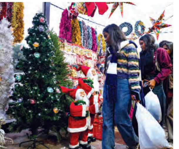
Shoppers browsing through a stall selling Christmas trees, decorations and festive figurines ahead of Christmas at INA market in New Delhi

"There has been about a 40 per cent reduction in footfall. Winter clothes that used to sell out in a few days