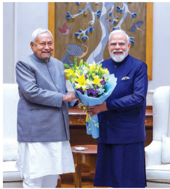
Prime Minister Narendra Modi with Bihar Chief Minister Nitish Kumar during a meeting in New Delhi

Earlier, the chief minister, along with his deputy Choudhary and Union Minister Singh, met Shah at his residence. "Met Chief Minister of Bihar Shri