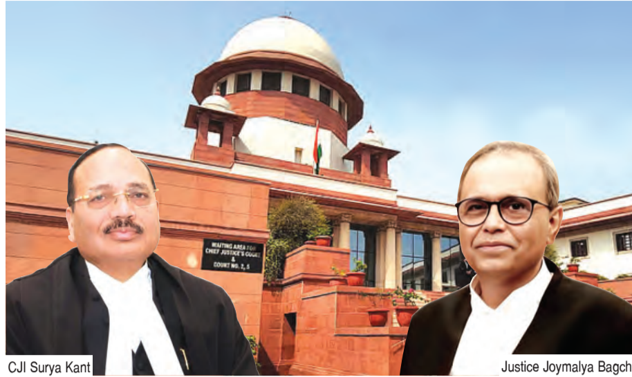
CJI Surya Kant

The Supreme Court said vacant land, other than residential houses, shall be taken