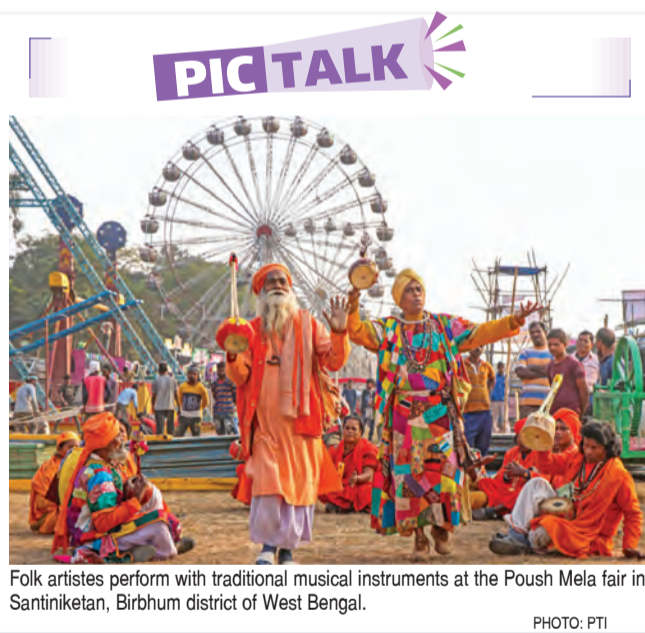
Folk artists perform with traditional musical instruments at the Poush Mela fair in Santiniketan, Birbhum district of West Bengal.

The flowers laid at Bondi Beach, the vigils held worldwide, and the tears of grieving families all serve as painful reminders that, in the face of such evil, the world's response must match the magnitude of the threat. Anything less dishonours those who have already paid the price.