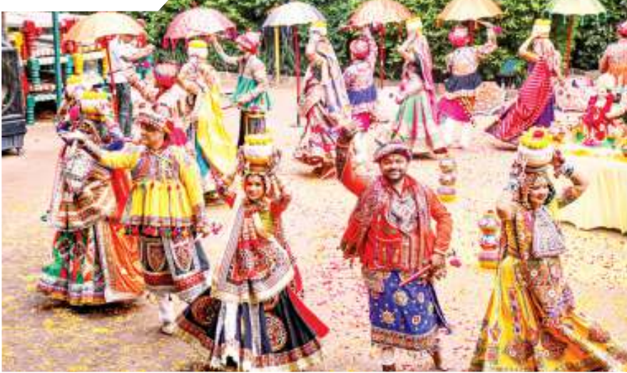
Performers dressed in traditional attire rehearse for Garba, ahead of Navratri festival, in Ahmedabad