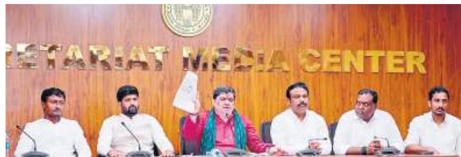
Minister Ponnam Prabhakar speaking to the media in Hyderabad on Friday

While speaking to the media on Friday at Secretariat Media Centre, the Minister said that the State government prepared a plan with Rs 5,500 crore to cleanse the Musi River. He said that the people of Hyderabad were observing the conspiracies of the opposition parties. The