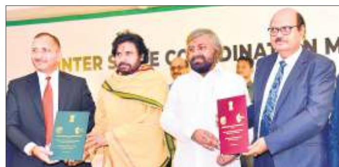
AP Deputy Chief Minister K Pawan Kalyan, Karnataka Forest Minister Eshwar B Handre and officials of both states show the MoU on the protection of forest reserves, in Vijayawada on Friday.