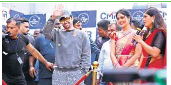
Ustaad Ram Pothineni brings the house down in Nizamabad! His stylish entry steals the show at the CMR shopping mall.