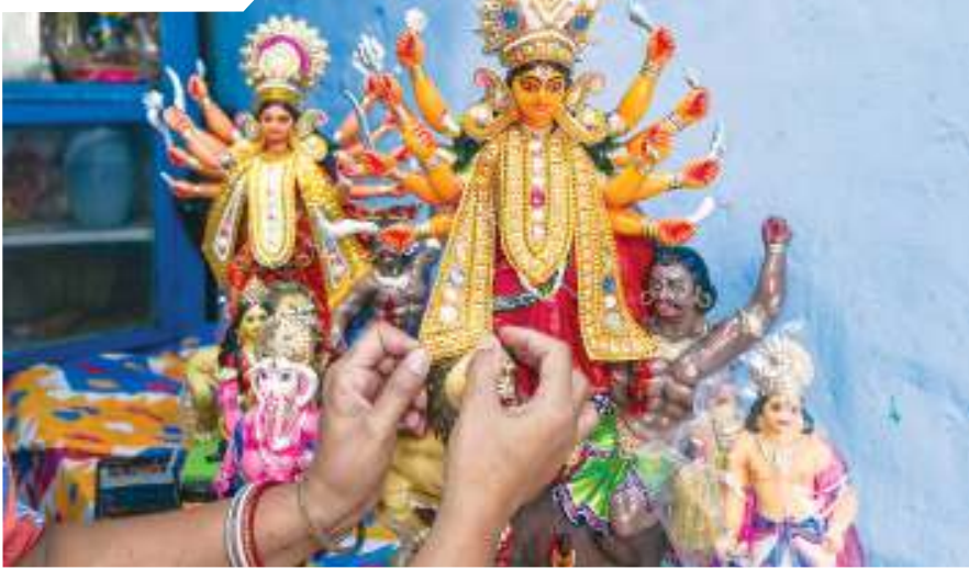
An artist gives finishing touches to a clay idol of Goddess at artisans' village Kumartuli, in Kolkata