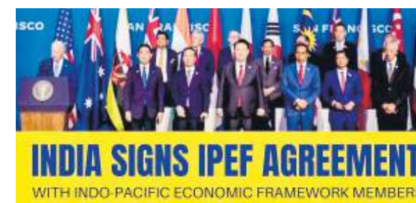
INDIA SIGNS IPEF AGREEMENT WITH INDO-PACIFIC ECONOMIC FRAMEWORK MEMBERS

"India signed and exchanged the first-of-its-kind agreements focused on Clean Economy, Fair Economy, and the IPEF Overarching arrangement under IPEF for prosperity, on September 21 at Delaware, USA, in the presence of Prime Minister Narendra Modi who is on 3-day visit to the US for