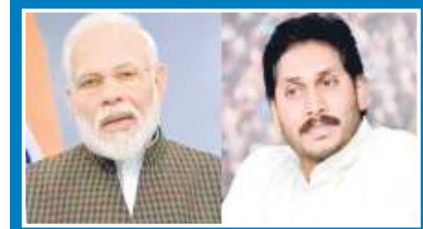
Jagan emphasised the rigorous procurement processes and quality checks established at TTD to ensure that only the highest quality ingredients are used in the preparation of prasadam. He detailed the stringent e-tendering process, NABL-accredited laboratory tests, and multi-tier inspections conducted prior to the use of any materials, noting that such measures were in place even during the TDP regime.

Jagan emphasised the rigorous procurement processes and quality checks established at TTD to ensure that only the highest quality ingredients are used in the preparation of prasadam.