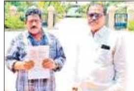
Naidu, who aims to develop temples across the State.