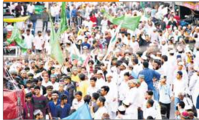
Muslims take out a huge rally to mark Milad-un-Nabi in Vijayawada on Monday.