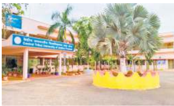
Central Tribal University is currently functioning on the old AU campus of Vizianagaram

The construction of Central Tribal University of Andhra Pradesh (CTUAP) in Marrivalasa - Chinamedapalli villages, Vizianagaram district, is gaining momentum. Despite initial pressures to shift the location to Relli village, the Andhra Pradesh government's decision to proceed with the original site has been widely welcomed. "The decision to continue construction at Marrivalasa was the most practical move, given the complexity of securing fresh approvals for Relli village," said a government official involved in the project.