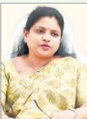
MEPMA, DWCR and Swachhata organisations.

The Collector said that the 'Swachhata Hi Seva' service programmes are being organised under the slogan 'Swabhav Swachhata-Sanskar Swachhata' in the district. As part of the Swachhata Hi Seva programmes, the opening ceremony would be held on September 17 and many programmes would be organized from September 18 to October 1. As part of 'Swachhatahi Bhagidari', planting of a sapling in the name of mother, awareness programmes on local sanitation programs will be organized under the auspices of