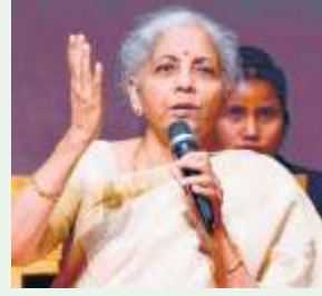
will be organised simultaneously at nearly 75 locations throughout the country, the finance ministry

The finance minister will also launch an online platform for subscribing to NPS Vatsalya, release a scheme brochure, and distribute Permanent Retirement Account Number (PRAN) cards to minor subscribers. As part of the launch here, NPS Vatsalya events