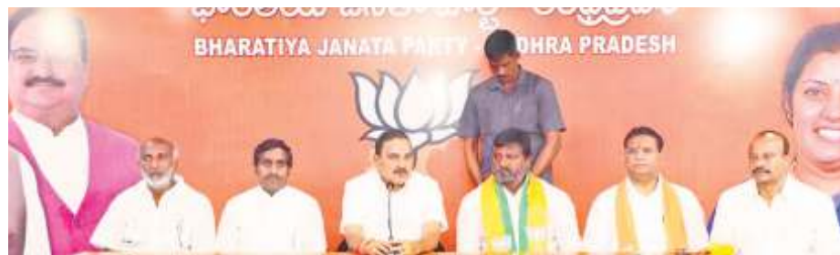
Union Minister Bhopathiraju Srinivasa Varma participating in the Varadhi programme held at the BJP State office in Vijayawada on Monday.

In addition to addressing the flood-related concerns, Varma also mentioned his intention to