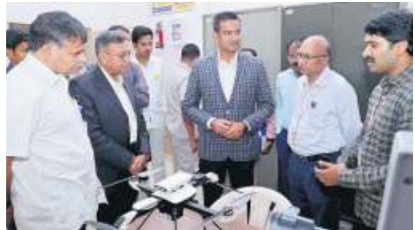
Minister Kondapalli Srinivas inspecting a drone during an exhibition organised on the occasion of Engineers' Day at VR Siddhartha Engineering College at Kanuru on Monday.