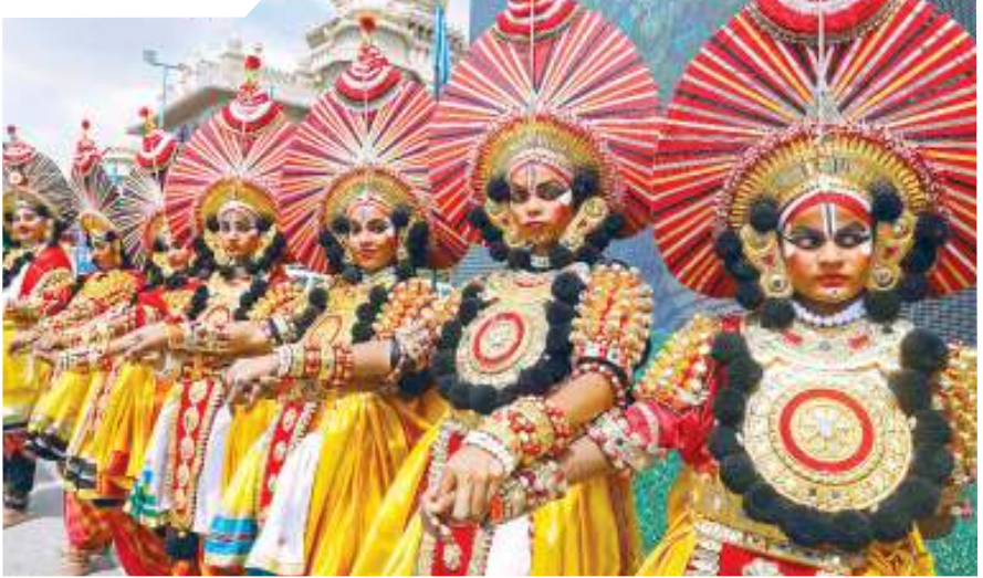
Folk artists take part in a human chain organised as part of 'International Democracy Day' celebrations, in Bengaluru