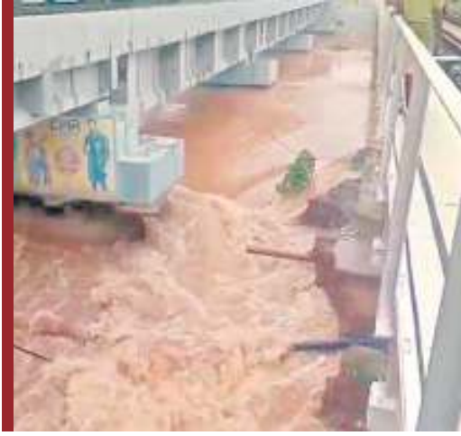
Over 36,000 cusecs of floodwater have entered the 'Budameru', but there is no proper channel for it to flow into the Enikepadu UT. As a result, the flood has submerged areas including Ajith Singh Nagar, Payakapuram, Rajiv Nagar, KV Kandrika, Prakash Nagar, Devi Nagar, and other localities within the Vijayawada Municipal Corporation limits, as well as Ambapuram, Jakkampudi, Rayanapadu, Kothuru Tadepalli, and other villages in the Vijayawada Rural Mandal.

Corporation limits, as well as Ambapuram, Jakkampudi, Rayanapadu, Kothuru Tadepalli, and other villages in the Vijayawada Rural Mandal.