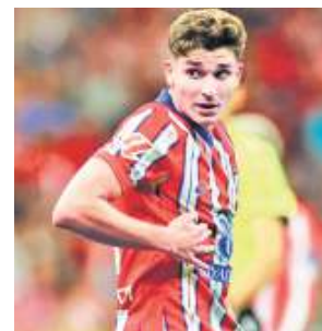
letting his contract expire at Paris Saint-Germain. Still, Madrid had to pay Mbappé a signing bonus variously reported as between USD 110 million and USD 165 million.

Kylian Mbappé joined Real Madrid without a transfer fee being paid because the France star was a free agent after