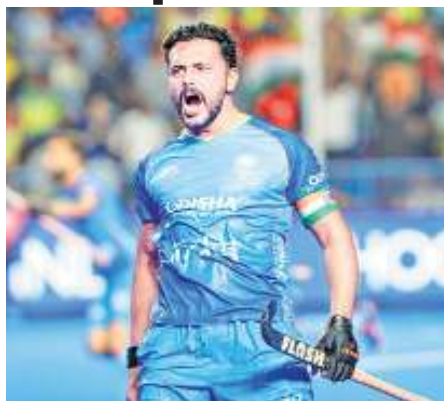
September 14. The top four teams will advance to the semifinals slated for September 16, with final scheduled for September 17.

After a one-day break, India will take on Malaysia on September 11, followed by Korea on September 12 and arch-rivals Pakistan on