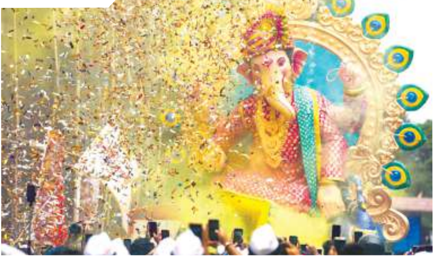
Devotees carry an idol of Lord Ganesh ahead of the Ganesh Chaturthi festival, in Mumbai