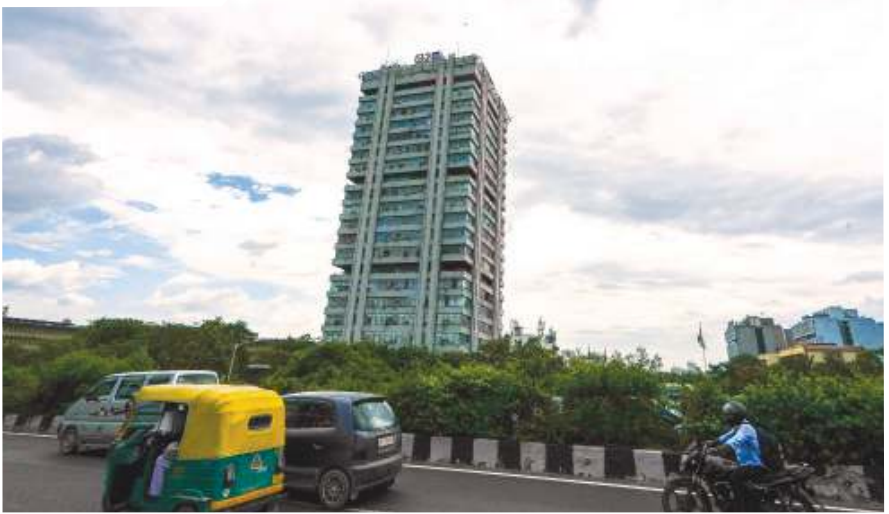
Clouds hover over the Delhi as vehicles pass by the Vikas Minar, in New Delhi