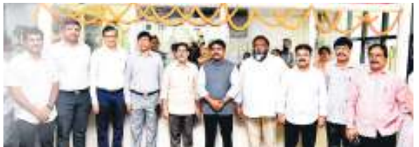
transparent environment for the people of Visakhapatnam," he said.

The Greater Visakhapatnam Municipal Corporation (GVMC) has officially launched its new Public Grievance Redressal System (PGRS). The system aims to provide residents with a more efficient and transparent channel to voice their concerns and suggestions. Speaking at the inauguration ceremony,