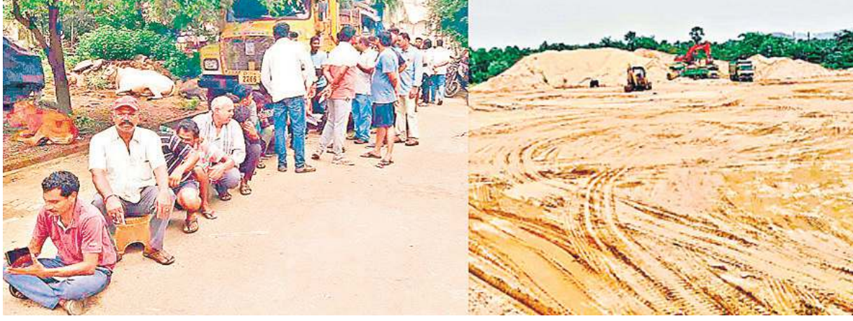
Queue line for sand coupons at Pinamadaka Secretariat as sand supplies diminish at Aganampudi Depot

The distribution network from Aganampudi is being exploited by transport operators. They are charging exorbitant fees under the guise of managing all logistical arrangements. Sand coupons are being issued at the Pinamadaka Secretariat near Aganampudi, but issues with incorrect details