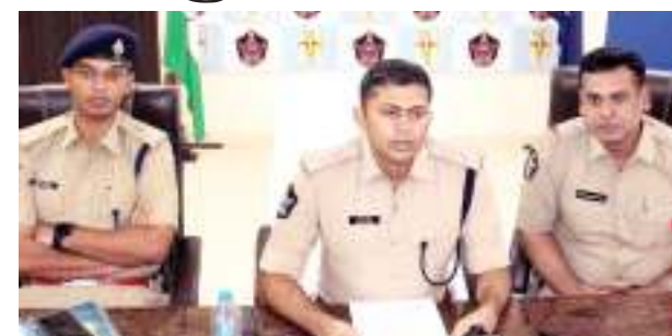
ment of static check-posts, dynamic vehicle checks, and the strategic deployment of advanced technologies such as drones and sniffer dogs.