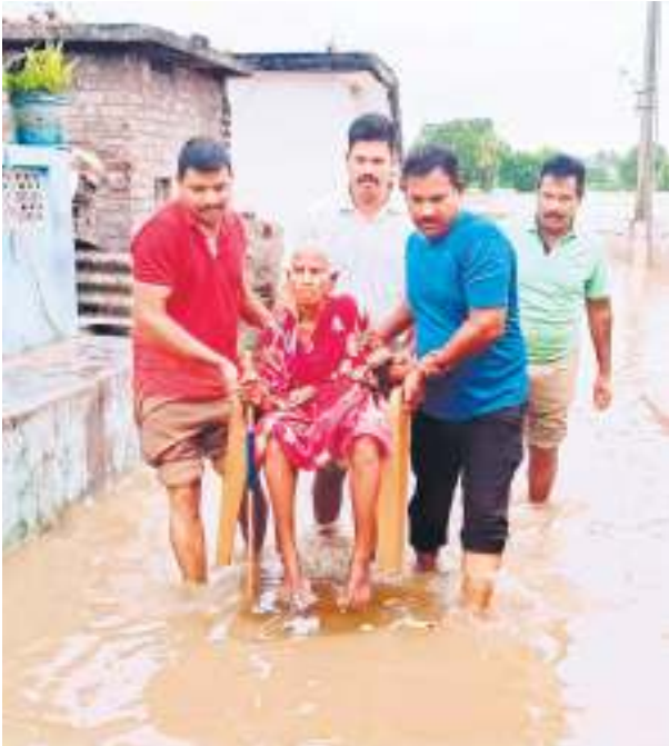
Kothagudem and Battiprolu mandals are being shifted to the relief camps.

The SP said that the vulnerable areas are being monitored using drones. The NDRD, SDRF and police personnel are extending services in the flood affected villages including Chilumuru Lanka, Eepuru Lanka, Chintala Lanka, Pesarlanka, Avulu Vari Palem, Gajula Lanka, Tokalavaripalem, Thurakapalem, Tippalakatta, Kishkinda Palem, Tadikalapudi, Juvvalapalem, Srirangapuram in Kolluru mandal in the district. The victims of Chinthamotu, Pedalanka, Pesarlanka, Oleru and Pallipalem villages in