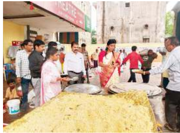
bles were sent for the flood victims. Moreover, the Rajahmundry municipal corporation also arranges 50,000 biscuit packets, 20,000 food packets and 20,000 water bottles.

Talking to the media the Collector said that 26,000 food packets, 20,000 candles, 20,000 matchboxes, 25,000 biscuit packets, and 2 lakh water bot-