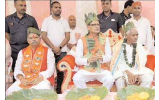
Union Agriculture Minister Shivraj Singh Chouhan alongwith others during a programme at a tribal village in Natarhat on Friday.

Chouhan is on a two-day visit to Jharkhand stayed in the tribal areas of Natarhat till late last night. During this time, he interacted with the tribal society on various topics. Union Minister Shivraj met the people of Baiga tribe as well as Korba primitive tribe, Birhor primitive tribe, Kisan tribe and Cheek Baraik tribal society. During this, Shivraj Singh Chouhan was traditionally welcomed by the tribal society in Natarhat. During this, the Union Minister was seen painted in tribal colors, played drums and also danced. Shivraj also danced to the tune of tradi-