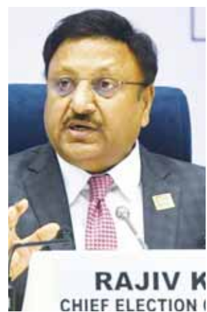
Chief Election Commissioner Rajiv Kumar expressed his displeasure over the state administration's non-compliance, stating that the delay undermined efforts to ensure a free and fair electoral process. The EC has made it clear that further inaction would not be tolerated. The term of the current Maharashtra Assembly ends on November 26 and the polls are likely to be held before that. The EC is currently in the state to review its preparedness for the polls.

PIONEER NEWS SERVICE ■ NEW DELHI Sending out a stern Smessage, the Election Commission on Friday sought an explanation from the Maharashtra chief secretary and the state's police chief for failing to fully implement its orders on the transfer of officials ahead of the upcoming assembly polls. In a strongly-worded letter, the poll body said despite a directive issued on July 31 to relocate officials who had served in their home districts or current posting for over three years, the state administration had not completed the process. According to the Election Commission's (EC) mandate, the compliance report was due by August 31. While the additional director general of police submitted a partial report, the chief secretary is yet to provide a full response. Sources noted that more than 100 inspector-level officers in Mumbai and revenue officials, many holding key positions in the state, had not been transferred as required.