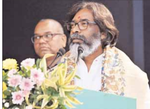
Chief Minister Hemant Soren addresses during the appointment letter distribution ceremony at Shaurya Auditorium, JAP-1, Doranda, in Ranchi on Friday.

review meeting of the departments, it came to know that a large number of posts are vacant in various departments. When we got information about this, it came to know that the appointment rules have not been made yet for various cadres of various departments. In such a situation, our government started the