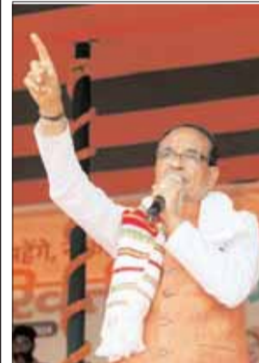
Union Agriculture Minister Shivraj Singh Chouhan addresses a gathering during Parivartan Sabha at Mahuadar in Latehar in Natarhat on Friday.

Union Agriculture Minister Shivraj Singh Chouhan says BJP will release manifesto for State soon