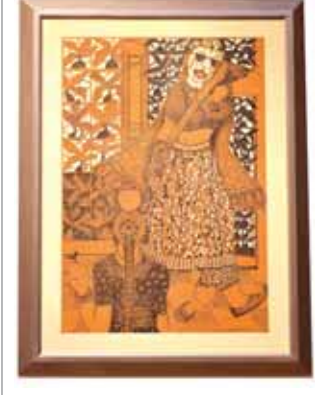
Golden Ducks , both of which explored this abrupt transformation in a humorous