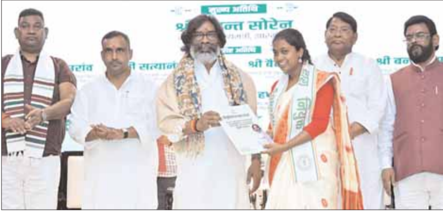
Chief Minister Hemant Soren hands over an appointment letter to a candidate during the appointment letter distribution ceremony at Shaurya Auditorium, JAP-1, Doranda, in Ranchi on Friday.

The CM was addressing the appointment letter distribution ceremony organised here on Friday. "All of you are joining as an integral part of the government. Do not