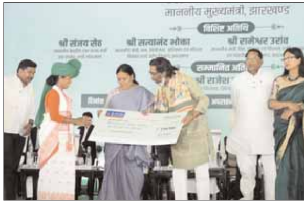
Chief Minister Hemant Soren distributes assets among beneficiaries during Jharkhand Agriculture Loan Waiver Scheme programme in Ranchi on Thursday.

aged a lot, the brunt of which they have to bear for a long time. Our government is continuously working to help the farmers come out of these adverse circumstances. In this episode, our government took a historic decision to waive the loan of