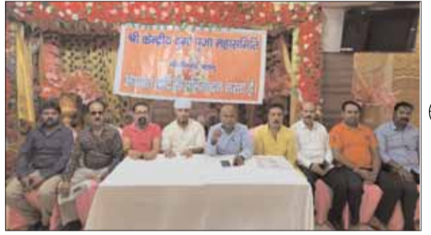
Sri Kendriya Durga Puja Maha Samiti holding press briefing in Daltonganj