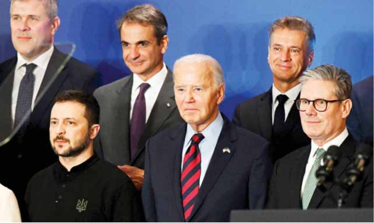
U.S. President Joe Biden, center, with Ukraine's President Volodymyr Zelensky, left, Britain's Prime Minister Keir Starmer, right, and other world leaders pose for a family picture of the launching of a Joint Declaration of Support for Ukrainian Recovery and Reconstruction, Wednesday in New York.

AP ■ WASHINGTON Ukrainian President Volodymyr Zelensky is visiting Washington on Thursday as U.S. support for his country's fight against Russia faces a partisan reckoning in this year's presidential election.