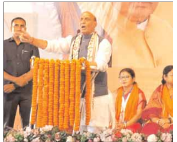
Union Defence Minister Rajnath Singh addresses a gathering during Parivartan sabha at Dhanbad on Thursday.

On the Parivartan Yatra, he said that the Parivartan of the BJP is going to write a new history. On November 15, it will be 24 years since Jharkhand became a state. This is a golden opportunity. I have come to appeal to you people. Write a new his-