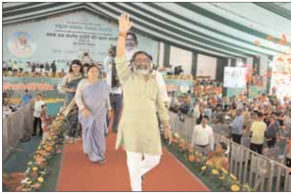
Chief Minister Hemant Soren waves to people during Jharkhand Agriculture Loan Waiver Scheme programme in Ranchi on Thursday.

The CM said that 80 per cent of the population of Jharkhand lives in rural areas. The farmers and labourers here depend on agriculture for their liveli-