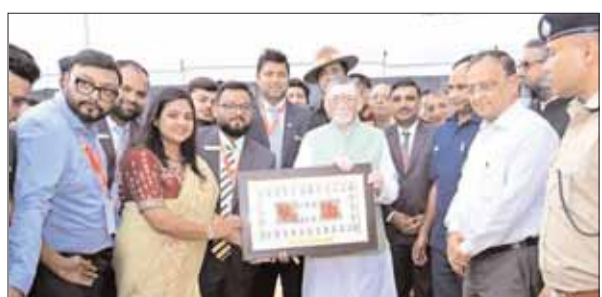
Governor Santosh Gangwar being felicitated during the inauguration of JCI Expo 2024 in Ranchi on Thursday.