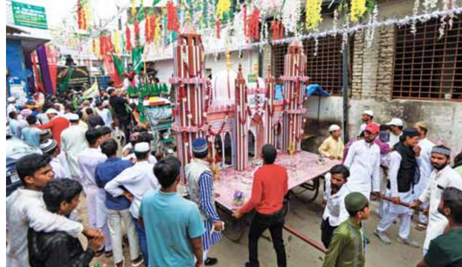
Muslims take part in an Eid-e-Milad-un-Nabi procession in Prayagraj, Monday, September 16, 2024 PTI