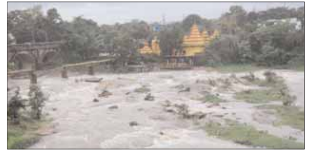
Flooded water over Swarnrekha river due to heavy rains in Ranchi on Monday.

Due to continuous rains in Jharkhand for the last three days, the water level of dams and rivers has increased significantly. The water level in Gelsud Dam is just five inches below the danger mark. If heavy rain continues, the gates of the dam can also be opened. The water level of Patratu Dam has also increased.