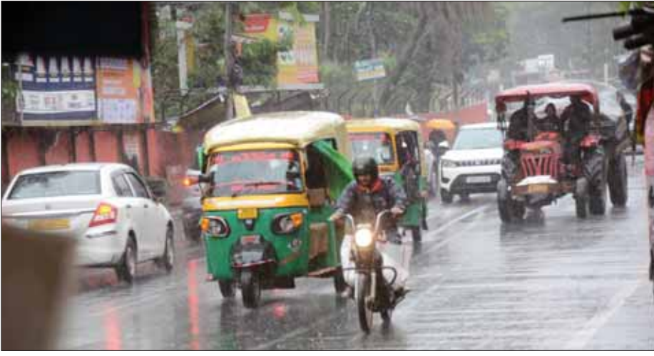
People during heavy rains in Ranchi on Monday.

For September 17, an orange alert stating heavy to very heavy rain has been issued for the north western parts of the State while some places may also witness heavy showers. An alert for gusty winds with a speed of 40- 50 km per hour and ranging to 60 km per hour has also been