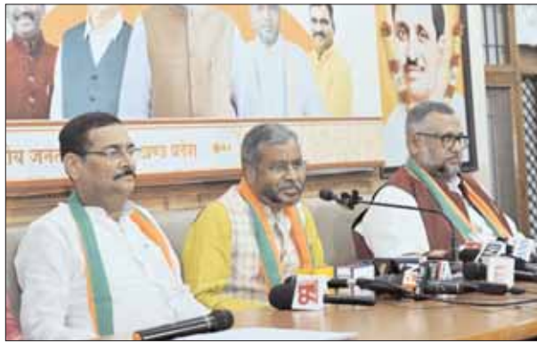
BJP State President Babul Marandi alongwith State General Secretary and Headquarters in-charge MP Dr Pradeep Verma and former MP Deepak Prakash during a press conference in Ranchi on Monday.

The journey of Hazaribagh division will start from