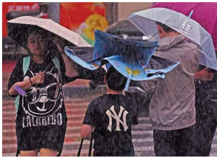
In this photo released by Xinhua News Agency, people brace for rain on a street as Typhoon Bebinca made landfall in Shanghai, China, Monday.

Long-time Jewish Chronicle columnist Jonathan Freedland resigned in protest on Sunday, saying "the latest scandal brings great disgrace on the paper" and that it has "departed from the traditions that built its reputation as the world's oldest Jewish newspaper". "Too often, the JC (Jewish Chronicle) reads like a partisan, ideological instrument, its judgements political rather than journalistic," Freedland wrote on the social media platform X.