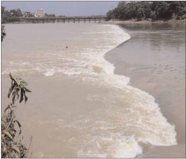
said. A mobile public address system has been deployed to alert residents of the increasing water levels and the potential for flooding. Local MLA and state