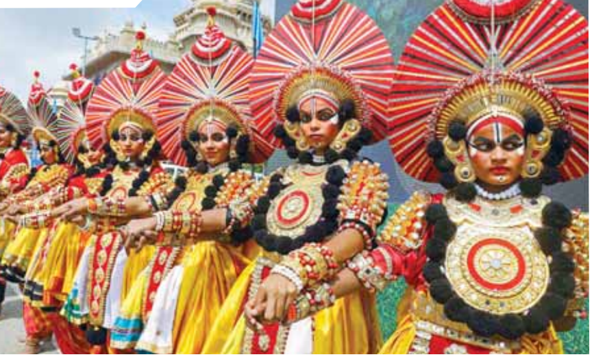
Folk artists take part in a human chain organised as part of 'International Democracy Day' celebrations, in Bengaluru.