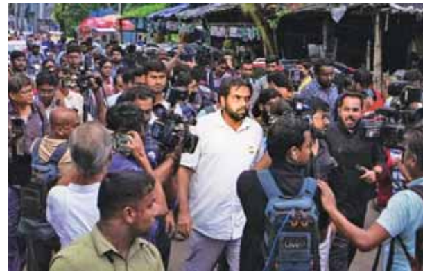
A delegation of junior doctors moves to board a bus from their dharna site near Swasthya Bhawan for a meeting with West Bengal Chief Minister Mamata Banerjee at her Kalighat residence, in Kolkata, West Bengal, Monday