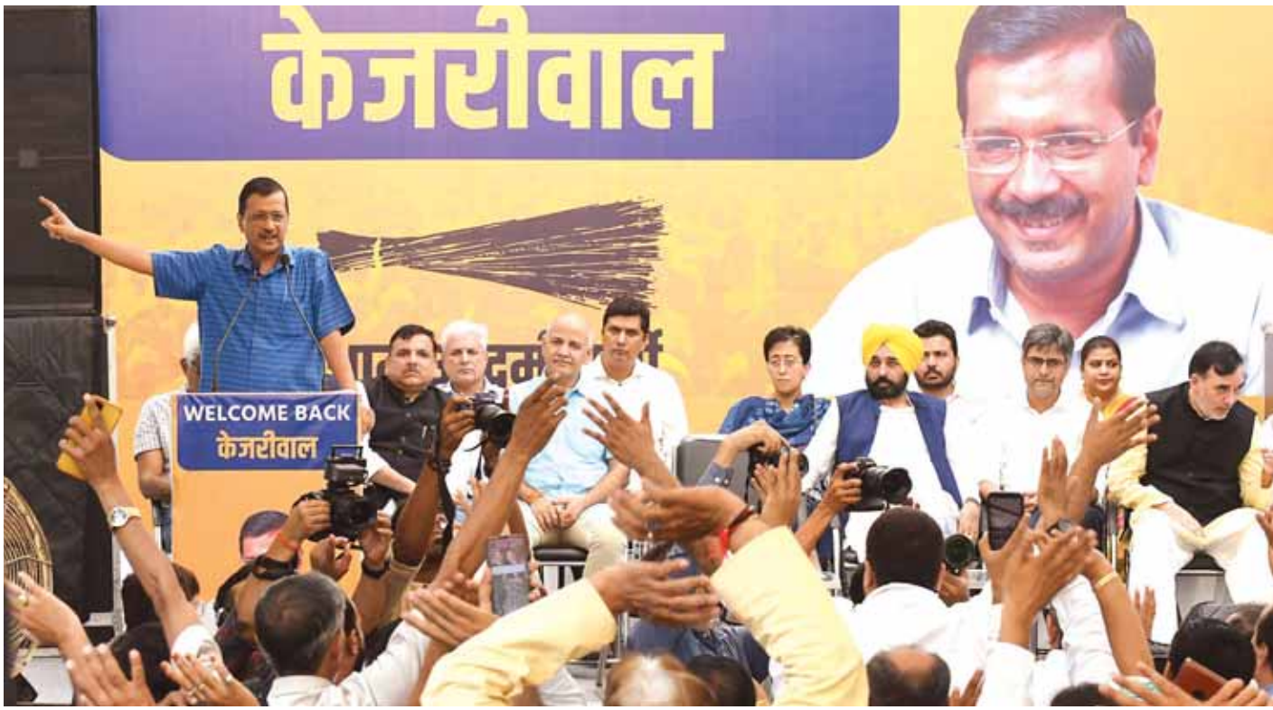
Delhi Chief Minister Arvind Kejriwal with other AAP leaders wave during a party workers' meeting, in New Delhi on Sunday

Insiders say his resignation caught many by surprise, but the decision may not be as unexpected as it