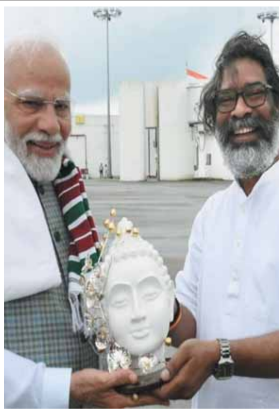
Chief Minister Hemant Soren greets Prime Minister Narendra Modi at Birsamunda International Airport Ranchi on later one day visit to State. PM Modi on Sunday laid the foundation of development projects and also falg off Vande Bharat Express from Jamshedpur.

The Party General Secretary said that there was only one BJP leader in the front seats on the stage and that was Shivraj Singh Chauhan. He said that the local MPs present on the stage were also ghosts. "The one who was managing the stage is also a ghost. There was a gathering of ghosts on PM Modi's stage. Even while sleeping, PM Modi is seeing the ghost of defeat everywhere. Along with Haryana, he is also seeing the ghost of defeat in Maharashtra. There are 9 MPs there still he is scared," he added.