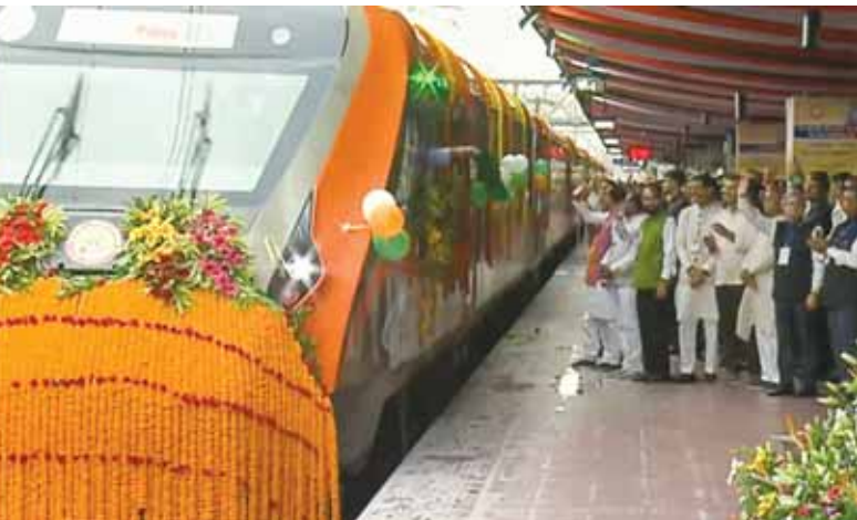
Prime Minister Narendra Modi flags-off Tatanagar-Patna Vande Bharat train in Jamshedpur, through Video conferencing, Sunday