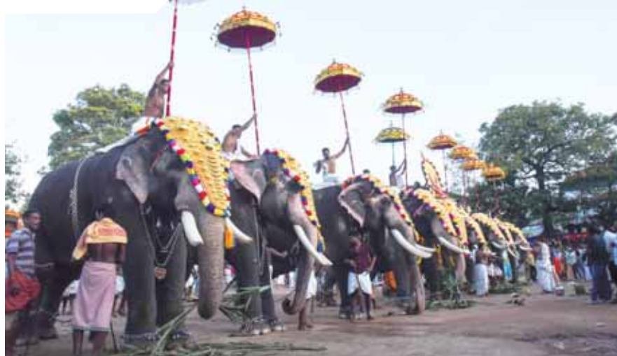
Caparisoned elephants participate in the 'pooram' festival as part of the Onam celebration, in Kochi