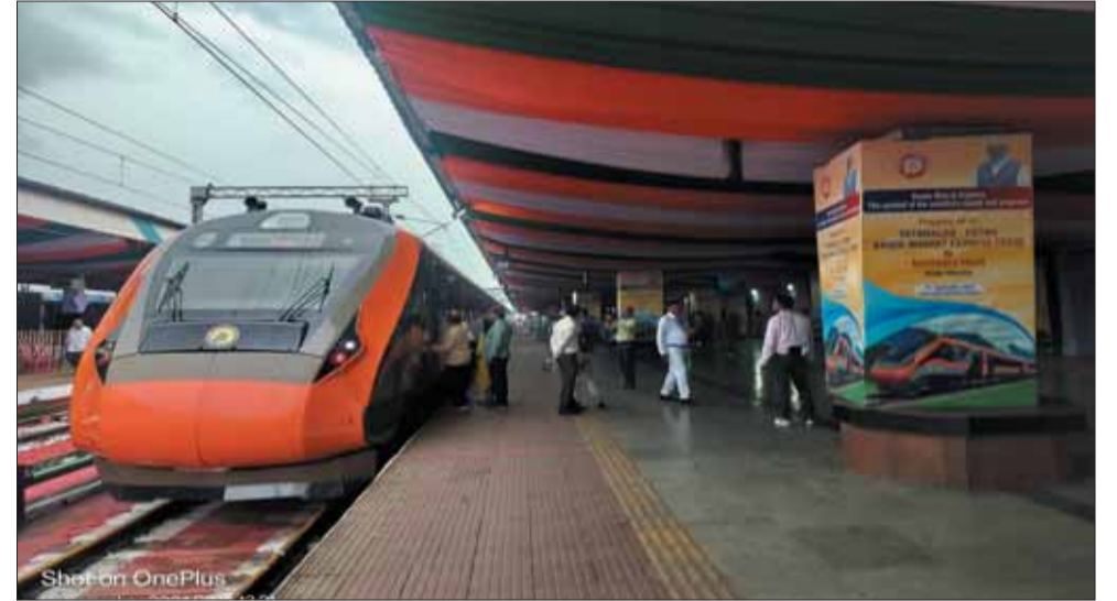
Flagging off ceremony of Vande Bharat train at Tatanagar railway station on Sunday.

Deoghar, further promoting religious tourism. Additionally, the industrial development of Tatanagar is expected to create new employment opportunities for the local youth. Modi also mentioned the Madhupur Bypass line, which aims to reduce travel time on the Howrah-Delhi mainline, and the Hazaribagh Town Coaching Depot, which will facilitate the maintenance of railway coaches. The Kurkura-Kanarwan line doubling project will strengthen rail connectivity to Jharkhand's steel industries, fostering economic growth in the region. 50 railway stations in the state being revitalized Modi highlighted the substantial increase in railway investments in Jharkhand, with over