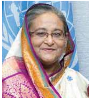
Awami League government, The Daily Star newspaper reported. With this, the tally of cases against Hasina has reached 155, including 136 for murder, seven for crimes against humanity and genocide, three for abduction, eight for attempted murder and one for