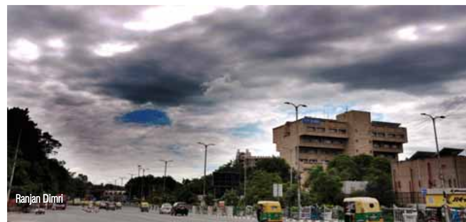
Central India received 1068.5 mm as against normal of 906.8 mm rainfall, which is 18 per cent more so far. South Peninsula received 759.8 mm

Gangetic West Bengal. The India Meteorological Department (IMD) data showed India, this monsoon has received 857.5 mm rainfall as against the normal of 795.9 mm so far. Notably, Arunachal Pradesh, Nagaland, Punjab and Chandigarh are among the rain deficit States and two weeks left for departure of monsoon this year. Data showed East and North-East sub division has received 1047 mm rainfall as against the normal of 1233.9 mm, a deficit of 15 per cent so far; North-West India including Jammu and Kashmir, Ladakh, has received rainfall of 590.9 mm as against the normal of 552.5 mm, around 7 per cent more this season.