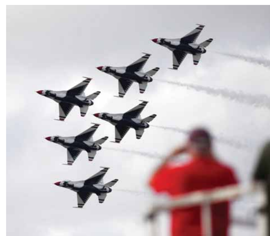
The United States Air Force Air Demonstration Squadron, the Thunderbirds, fly in formation at the Sound of Speed Airshow in St. Joseph, Mo., on Saturday.

In July, four migrants died while attempting the crossing on an inflatable boat that capsized and punctured. Five others, including a child, died in another attempt in April. Five dead were recovered from the sea or found washed up along a beach after a migrant boat ran into difficulties in the dark and winter-cold of January.