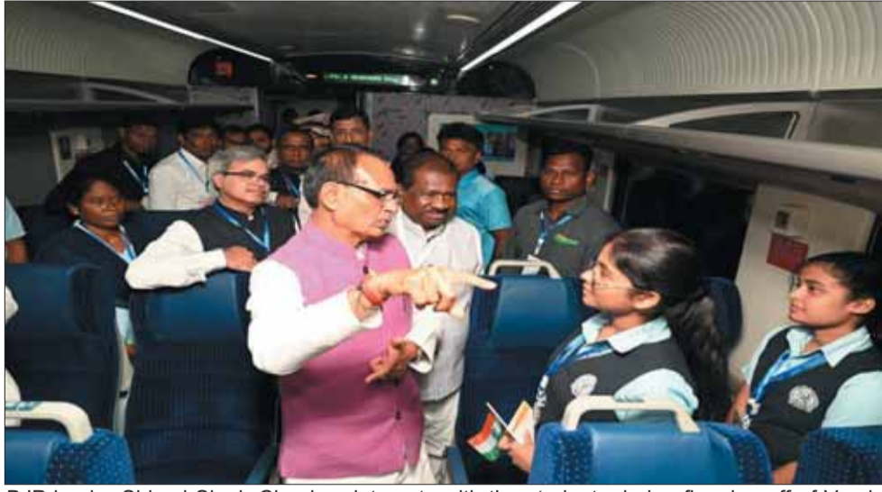
BJP leader Shivraj Singh Chauhan interacts with the students during flagging off of Vande Bharat train from Tatanagar railway station on Sunday

Giving a much-needed fillip to the railway infrastructure of Jharkhand, Prime Minister Narendra Modi laid the foundation stone and inaugurated several crucial railway projects worth over Rs 660 crore in Tatanagar, on Sunday in a function held in Ranchi through video conferencing. As part of his visit, he also flagged-off six new Vande Bharat trains, strengthening connectivity across the region and enhancing the rail network in Eastern India. Furthermore, the Prime Minister distributed sanction letters to 32,000 beneficiaries under the Pradhan Mantri Awas Yojana-Gramin (PMAY-G) and released the first installment of ₹32 crore for housing development. During his address, the Prime Minister paid his respects to Baba Baidyanath, Baba Basukinath, and Lord Birsa Munda, acknowledging the significance of the Karma Parv festival celebrated in Jharkhand. He praised the state for its potential to become one of the most prosperous in the country, highlighting the government's commitment to ensuring Jharkhand's development through various initiatives. He noted: "Today, Jharkhand is witnessing a new dawn with the introduction of six Vande Bharat trains, crucial development projects, and the assurance of pucca houses for thousands of