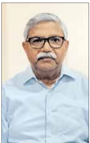
BY BANSHIDHAR RUKHAIYAR

The well calibrated aggressive foreign policy of the present government, which is equally well executed by the mercurial foreign minister S Jaishankar is haunting China. It is definitely on the backfoot and its frustration was vented in an article by an anonymous writer in the Global Times, the official mouthpiece of the Chinese Communist Party, accusing Jaishankar of being afraid as and when relations start to improve between the two nations so as to please America. The article immediately caught the attention of the world, but it was removed suddenly not only from the Global Times but also from the social media platforms in China.