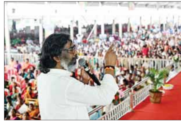
Chief Minister Hemant Soren addresses a gathering during the "Aapki Yojana- Aapki Sarkar- Aapke Dwar" program at Rajendra Stadium, Urja Nagar under Mahagama block of Godda district on Wednesday.

Soren said that the government is committed to empowering half the population. In this regard, Jharkhand Chief Minister Mainiya Samman Yojana is