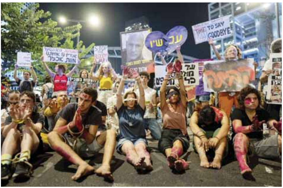
Blindfolded and bound protesters take part in a protest against Israeli Prime Minister Benjamin Netanyahu's government and call for the release of hostages held in the Gaza Strip by the Hamas militant group in Tel Aviv, Israel, Tuesday. AP/PTI

Hanoi (AP): A flash flood swept away an entire hamlet in northern Vietnam, killing 30 people and leaving dozens missing as deaths from a typhoon and its aftermath climbed to 155 on Wednesday. Vietnamese state broadcaster VTV said the torrent of water gushing down from a mountain in Lao Cai province Tuesday buried Lang Nu hamlet with 35 families in mud and debris. Only about a dozen are known so far to have survived. Rescuers have recovered 30 bodies and are continuing the search for about 65 others. The death toll from Typhoon Yagi and its aftermath has climbed to 155. Another 141 people are missing and hundreds were injured, VTV said. Floods and landslides have caused most of the deaths, many of which have come in the northwestern Lao Cai province, bordering China, where Lang Nu is located. Lao Cai province is also home to the popular trekking destination of Sapa.