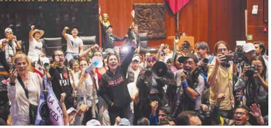
Protesters break into a Senate session in which lawmakers were debating the government's proposed judicial reform, which would make judges stand for election, in Mexico City, Tuesday.

to pass the proposal. The legislation sailed through the lower chamber, where Morena and its allies hold a supermajority, last week. The Senate posed the biggest obstacle and required defections from opposition parties. One appeared to come Tuesday from the opposition National Action Party (PAN) after a lawmaker who had previously spoken out against the overhaul took leave for medical reasons and his father, a former governor, suggested he would vote for the proposal. The Senate voted twice on the bill, both times 86-41, with the second coming around 4 am.