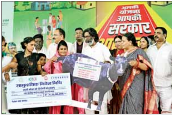
Chief Minister Hemant Soren distributing assets among the beneficiaries in the "Aapki Yojana- Aapki Sarkar- Aapke Dwar" program at Rajendra Stadium, Urja Nagar under Mahagama block of Godda district on Wednesday.

ment is working to provide help and relief to every section. Farmers' loans up to Rs 2 lakh have been waived off. People are being given 200 units of electricity free of