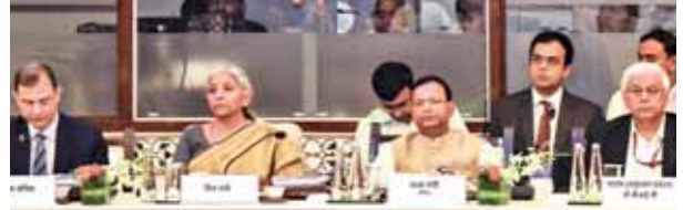
Union Finance Minister Nirmala Sitharaman with MoS Pankaj Chaudhary and others during the 54th meeting of the GST Council, in New Delhi

Union Finance Minister Nirmala Sitharaman on Monday said the GST Council has decided to reduce the rates on some cancer drugs to five percent from 12 percent. The Council also reduced the rate on namkeen to 12 per cent from 18 per cent, she said, adding that the Council will take a call on reduction in rate on health insurance at the next meeting in November. Sitharaman, who chaired the 54th meeting of the GST