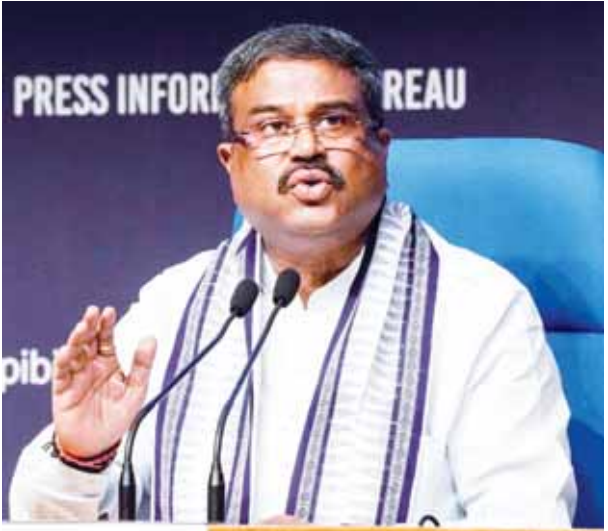
PIONEER NEWS SERVICE NEW DELHI

Education Minister Dharmendra Pradhan on Monday accused Tamil Nadu Chief Minister M K Stalin of trying to pit States against each other to make a point about non-implementation of the new National Education Policy (NEP). Pradhan made the comments in response to Stalin's statement alleging that the