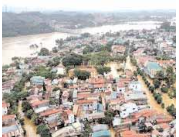
path.In Phu Tho province, rescue operations were continuing after a steel bridge over the engorged Red River collapsed Monday morning. Reports said 10 cars and trucks along with two motorbikes fell into the river. Three people were pulled out of the river and taken to the hospital, but 13 others were missing. Pham Trung Son, 50, told

A passenger bus carrying 20 people was swept into a flooded stream by a landslide in mountainous Cao Bang province Monday morning. Rescuers were deployed but landslides blocked their