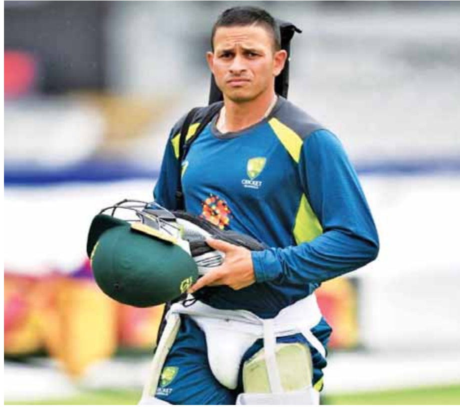
The rivalry has always been huge," said Khawaja who has 5451 runs from 71 Tests after making debut in 2011.

We were world number one, world number two teams really over the last two years. We were there at the last World Test Championship together.