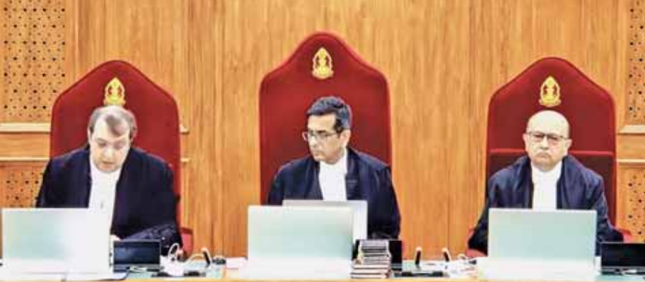
A bench comprising Chief Justice of India (CJI) D.Y. Chandrachud, Justice J.B. Pardiwala and Justice Manoj Misra during the second day of hearing on a suo moto case related to the alleged sexual assault and murder of a postgraduate trainee doctor in Kolkata, at the Supreme Court in New Delhi, Monday, September 9, 2024

Protest cannot be at the cost of duty," the Supreme Court observed on Monday as it directed the West Bengal doctors protesting over the rape and killing of a postgraduate medic at the State-run RG Kar Medical College and Hospital in Kolkata to return to work immediately.