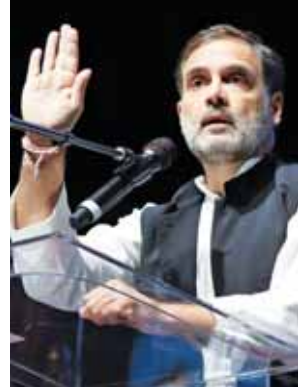
LoP in Lok Sabha and Congress MP Rahul Gandhi addresses the Indian Diaspora, at Dallas in Texas, USA

BJP on Monday launched a scathing attack on Congress leader Rahul Gandhi over his latest remarks in the United States, calling him a "black spot" in Indian democracy. The party accused Rahul Gandhi of trying to weaken Indian democracy with his remarks whenever he is abroad, in accordance with a Memorandum of Understanding (MoU) reportedly signed between the Congress and the Chinese Communist Party during the UPA rule. BJP claimed that Congress had signed a "party-to-party MoU with China" during its rule. "The series of efforts that Rahul Gandhi has been making to weaken Indian democracy is the outcome of that MoU. If I am wrong, I dare Rahul Gandhi and (Congress president) Mallikarjun Kharge to make the MoU public," the party stated in its first reactions to the Rahul's recent visit abroad. "Everybody knows that Rahul Gandhi is an immature and part-time leader. But People have put a huge responsibility on his shoulders since he became the leader of opposition (in the Lok Sabha). But I feel sad to say that Rahul Gandhi is a black spot in Indian democracy. He does not even know what to talk about when he visits a foreign country," said Gaurav Bhatia, BJP's national spokesperson, at a Press conference at the BJP