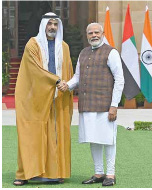
Prime Minister Narendra Modi meets Abu Dhabi's Crown Prince Sheikh Khaled bin Mohamed bin Zayed Al Nahyan at the Hyderabad House, in New Delhi, Monday