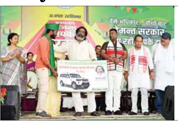
Chief Minister Hemant Soren inaugurating and laying the foundation stone of various development schemes of Giridih and Dhanbad districts and distributing assets among the beneficiaries in the "Aapki Yojana- Aapki Sarkar- Aapke Dwar" program at Kailudih ground of Kundalwadah Panchayat under Gandey block of Giridih district, on Monday.

Soren said that his government has tried to give some benefit to the employees of many different government departments including Anganwadi Sahayika, Sevika, Cook, Policeman, Assistant Policeman, Para Teacher, Jal Sahayika by solving their problems. The Chief Minister said that many such decisions and works in the interest of the state have been done by the state government which have happened for the first time in the country. Today other states are imitating the work