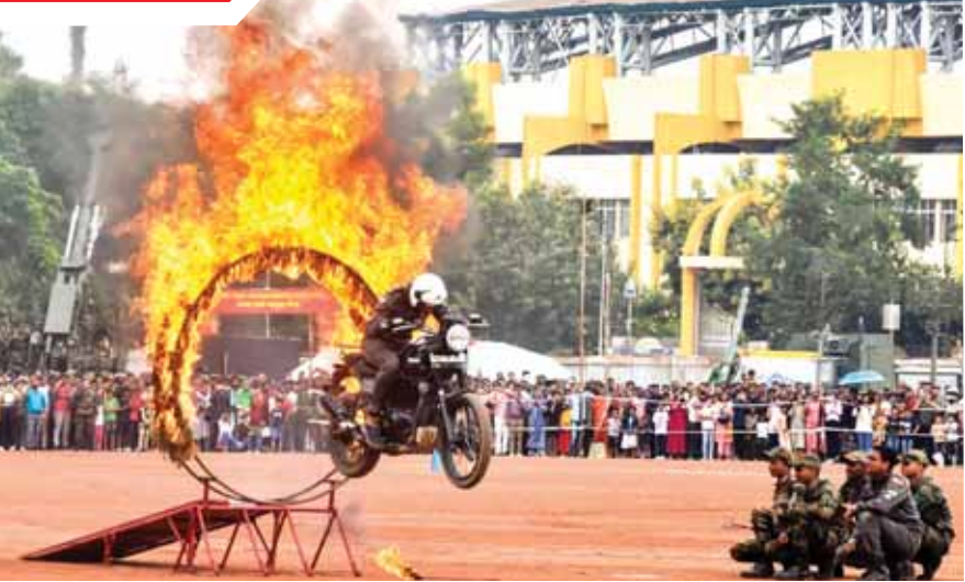
Army jawans perform stunts during the closing ceremony of 'Know Your Army' programme in Ranchi