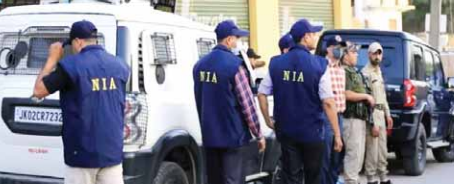
PIONEER NEWS SERVICE NEW DELHI

The National Investigation Agency (NIA) on Monday charge sheeted four accused in the high-profile Bengaluru's Rameshwaram Cafe blast case.