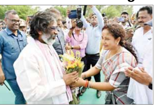
Chief Minister Hemant Soren being welcomed by Gandey MLA Kalpana Murmu Soren during his arrival for inaugurating and laying the foundation stone of various development schemes of Giridih and Dhanbad during the "Aapki Yojana- Aapki Sarkar- Aapke Dwar" program at Kailudih ground of Kundalwadah Panchayat under Gandey block of Giridih district, on Monday. PNS

On the occasion, the CM said that the previous government deprived most of the eligible people here from the pension scheme. Earlier, only a few selected elderly people, disabled people and widowed mothers and sisters of the village were able to get pension amount, but now your government has made such a law that now all the elderly people in the village are getting pension. Today, all the eligible people including every disabled person and widowed mothers and sisters