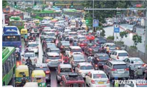
lot easier than giving Central Delhi a traffic heart attack whenever any foreign or domestic dignitary wants to pay their respects to Gandhi."

bin Mohamed bin Zayed Al Nahyan visited Raj Ghat, the memorial dedicated to Mahatma Gandhi, and laid a wreath there. He also became the third generation of the ruling family of the United Arab Emirates (UAE) to plant a sapling at the site. The security arrangements in view of the visit irked commuters who expressed their anguish over the traffic situation in the city. An X user expressed his anguish over the traffic jam in the city and said, "Just build a Helipad at Rajghat; will be a