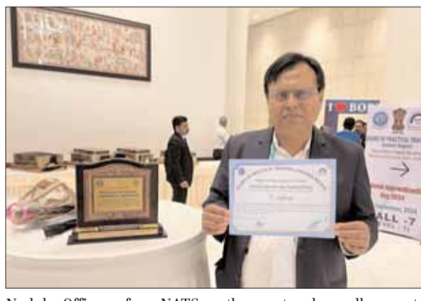
Nodal Officer for NATS, served as the Coordinator of