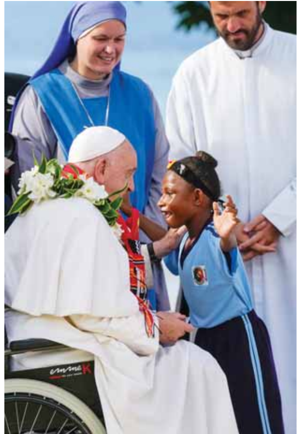
Pope Francis is hugged by a blind pupil of the Holy Trinity Humanistic School in Baro, near Vanimo, Papua New Guinea, on Sunday

Doing so, he said, would help to "drive out fear, superstition and magic from people's hearts, to put an end to destructive behaviours such as violence, infidelity, exploitation, alcohol and drug abuse, evils which imprison and take away the happiness of so many of our brothers and sisters". It was a reference to the tribal violence over land and other disputes that have long characterised the country's culture