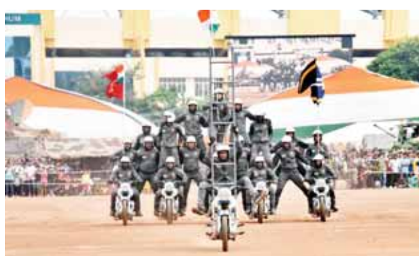
Army jawans perform stunt on the closing ceremony of 'Know Your Armed Force' at Morhabadi Ground in Ranchi on Sunday.

An emergency meeting of the Central Executive of Jharkhand Administrative Service Association was held through online meeting on Saturday. The officers of the State Administrative Service are hurt by the declaration regarding equivalence of the posts of non-state civil service to the post of Deputy Collector under the Indian Administrative Service (Appointment by Selection) Regulations 1997 passed by the State Cabinet on 6th September 2024. There is a lot of anger among the officers of the association due to this decision of the state government. Along with this, despite the instructions of the Chief Minister, the Jharkhand Administrative Service has not been restructured by the Personnel Department yet by giving it the status of premier service. The association strongly opposes the restructuring of the service on the model of Bihar. On the one hand, the state government is talking about upgrading the Jharkhand Administrative Service by giving it the status of premier service and on the other hand, the government is making the posts of non-state civil equivalent to the post of Deputy Collector.