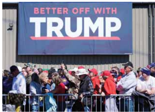
Supporters attend a campaign event for Republican presidential nominee former President Donald Trump at Central Wisconsin Airport, Saturday, in Mosinee.

With just days to go before his first — and likely only — debate against Vice President Kamala Harris, former President Donald Trump posted a warning on his social media site threatening to jail those "involved in unscrupulous behaviour" this election, which he said would be under intense scrutiny. "WHEN I WIN, those people that CHEATED will be prosecuted to the fullest extent of the Law, which will include long term prison sentences so that this Depravity of Justice does not happen again," Trump wrote, again sowing doubt about the integrity of the election, even though cheating is incredibly rare. "Please beware," he went on, "that this legal exposure extends to Lawyers, Political Operatives, Donors, Illegal Voters, & Corrupt Election Officials. Those involved in unscrupulous behaviour will be