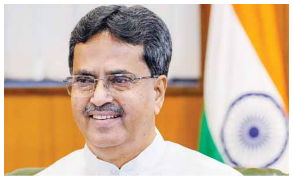
PTI ■ AGARTALA

In a bid to check fatal road accidents caused by drunken driving, Tripura Chief Minister Manik Saha on Sunday directed law enforcement agencies to prepare a comprehensive report on liquor shops operating within 100 metres of national highways following which his government would take steps to relocate the outlets. In December 2017, the Supreme Court banned the sale of liquor within 500 meters of the outer edge of national and state highways and the limit was reduced to