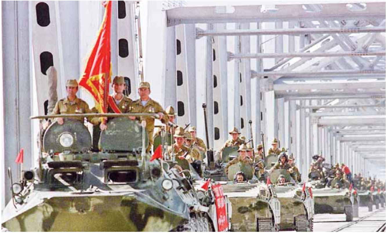
28, 1979, under Karmal's regime, worsened Afghanistan's turmoil, leading to widespread devastation and secretive reporting of casualties, revealing internal KGB struggles. Karmal's leadership, heavily reliant on Soviet military support, ultimately proved ineffective in stabilising Afghanistan. The continuous conflict led to the rise of the Mujahideen, supported by the US and Pakistan, further destabilising the country. Karmal was replaced by Mohammad Najibullah in 1986, who continued to rule until 1992 when the Mujahideen took control of Kabul, marking the beginning of the first phase of Taliban rule. Karmal's life ended in 1996 in Moscow, and his tenure is remembered as a period of profound strife and political manipulation in Afghan history. This power struggle continues to harm Afghanistan. Mahmud Tarzi (1865-1933) noted that 'the progress of a nation depends on its ability to move beyond ignorance and embrace knowledge and reform'. He observed that while Europe advanced through education and modernization, the Muslim world remained entrenched in outdated traditions. Tarzi emphasized that intellectuals should guide their societies from darkness to modernity. This transition from enlightenment to darkness accentuates a deeper issue rooted in Afghanistan's turbulent political history. The events following the 1973 coup, which brought the foreign intelligence agencies of the KGB, CIA, and ISI into Afghanistan's political sphere, illustrate how external powers have long manipulated the country's fate, contributing to its ongoing strife. The overthrow of Mohammad Zahir Shah in 1973 marked the beginning of a period of significant destabilisation in Afghanistan. Zahir Shah, who had a nuanced understanding of Afghanistan's needs and implemented substantial social reforms, was succeeded by Mohammad Daoud Khan. Despite Daoud Khan's attempts to seek American assistance, the refusal of support set the stage for Soviet intervention, exacerbating the country's instability. Zahir Shah's return to Afghanistan after the collapse of the Taliban in 2001 symbolised a nostalgic yearning for stability and unity. However, his exclusion from significant political decisions by Hamid Karzai highlights the challenges of integrating historical figures into contemporary politics without disrupting the prevailing power dynamics. The failure of both the Soviet Union's intervention and the subsequent U.S. involvement in Afghanistan underscores a profound lesson about the limitations of foreign military power in achieving lasting political stability. The Soviet Union's reliance on sheer military might and neglect of social and political trust is mirrored by the U.S. and its allies' inability to implement meaningful reforms. The eventual resurgence of the Taliban and the disgraceful withdrawal of foreign forces, leaving behind modern weapons, epitomises the failure to address Afghanistan's underlying issues. This pattern of short-term military solutions and inadequate attention to genuine structural reforms has led to repeated cycles of conflict and instability, reflecting a broader failure to understand and address the complex socio-political realities of Afghanistan. External influences, notably from China and powerful Arab states, crucially affected Afghan politics during the Soviet-Afghan War. Amid the China-Soviet ideological rift, Mujahideen groups led by