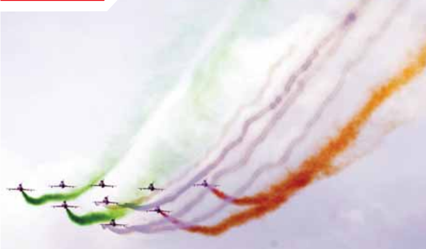
Indian Air Force aerobatics team Surya Kiran performs at exercise 'Tarang Shakti,' in Jodhpur