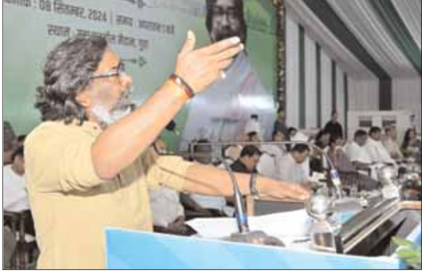
Chief Minister Hemant Soren addresses gathering during inauguration of various development programmes under Mukhya Mantri Samman Yojna at Nowamundi in Chaibasa on Sunday.

The Chief Minister said this is a day for the whole of Jharkhand including Kolhan, which we have never forgotten and will never forget. Our brave martyrs will always remain an ideal for the coming generation. These brave martyrs have always been our guide. In such a situation, by following their ideals, we are giving a new direction to