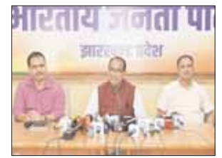
Union Minister cum Jharkhand Assembly election in-charge Shivraj Singh Chauhan along with others during a press conference at the party office in Ranchi on Sunday.

But now that the elections have come, announcements are being made one after the other. Recruitments, recruitment of constables, but they did not even see in which season they are doing the recruitment. They knew that the recruitments will not be completed, this recruitment is for giving employment to the youth, this recruitment is not for giving employment to the youth, this is a drama of recruitment for votes, even the physical test will not be completed and that is why they are making people run 10-10 kilometers in such a weather which has proved to