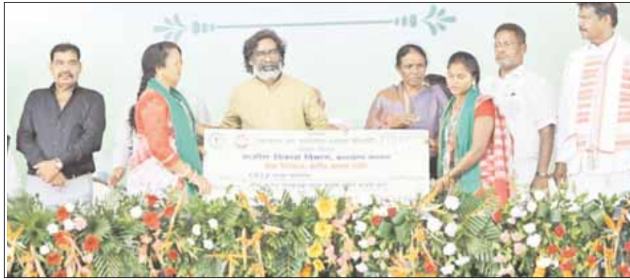
Chief Minister Hemant Soren distributes assets among beneficiaries during inauguration of various development programmes under Mukhya Mantri Samman Yojna at Nowamundi in Chaibasa on Sunday.

The Chief Minister said that when the blood running in the veins of the tribal natives overflows, they put all their strength for their rights and entitlements. The more the blood of the tribals falls on the ground, the more tribal heroes are born. Tribals do not disintegrate due to strug-