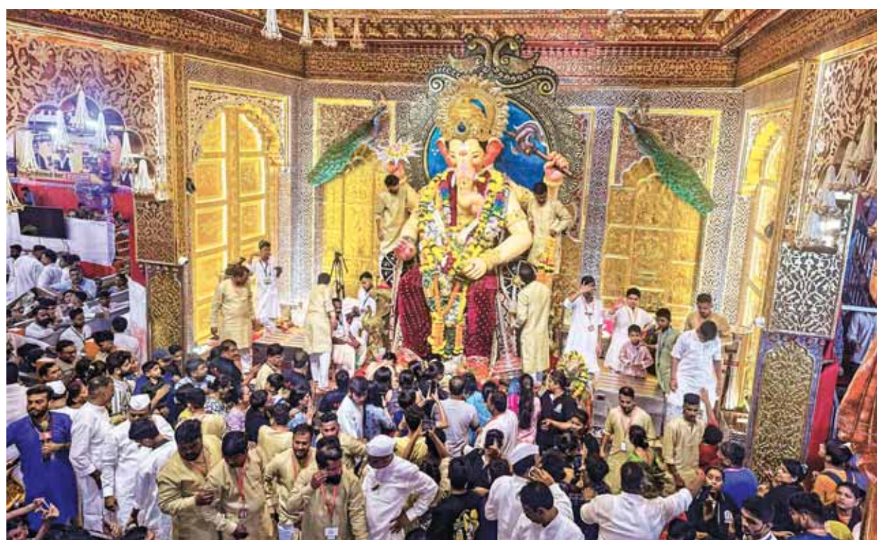
Mumbai: Devotees offer prayers to Lord Ganesha at the Lalbaugcha Raja on Ganesh Chaturthi festival, in Mumbai, Saturday