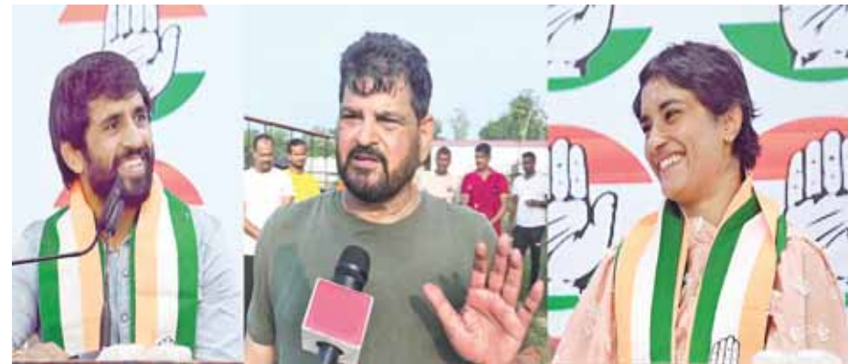
(Left to right) Bajrang Punia, Brij Bhushan and Vinesh Phogat