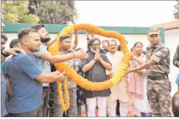
Assistant police personnel from various districts felicitate Chief Minister Hemant Soren at his official residence in Ranchi on Saturday.

The Assistant Police Personnel told the Chief Minister that under his leadership, everyone is getting