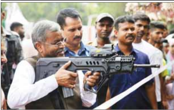
State BJP President and former Chief Minister Babulal Marandi trying his hands on an assault rifle during ongoing 'Know Your Army' programme at Morhabadi Ground in Ranchi on Saturday.

Finally, through a film made by the Narcotics Control Bureau, children were also made aware about the ill effects of drugs and its dangers in society.