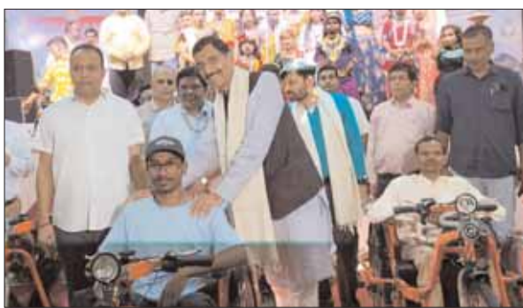
MoS Sanjay Seth distributes motorized tricycles among various handicapped beneficiaries during Divya Kala Mela' at Harmu Ground in Ranchi on Saturday. PNS

About 1,000 people from various sections including public representatives, State administration, various NGOs, primary and secondary teachers, students of universities, representatives of musical gharanas, rehabili-