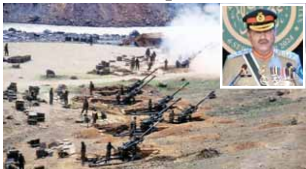
Pakistan Army Chief General Asim Munir admits Pak army's role in Kargil war, says several Pak soldiers died in the 1999 Kargil War against India

Pakistan for the first time has admitted its soldiers fought in the Kargil war in 1999. This assertion came from none other than Pakistan Army Chief General Asim Munir. Islamabad, till now, denied any role in the conflict and maintained 'mujahideens' (freedom fighters) waged the war. India had all along reiterated that Pakistan army soldiers were actively involved in the war.