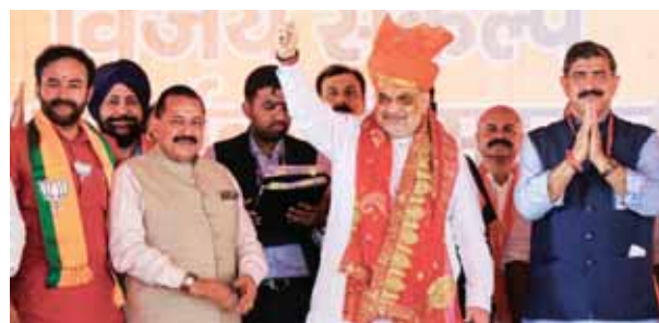
Union Home Minister Amit Shah during a party worker meet ahead of Jammu and Kashmir Assembly elections, in Jammu, Saturday, Sept. 7, 2024. MoS Jitendra Singh was also seen

Addressing the 'Karyakarta Sammelan', a day after releasing the party's Sankalp Patra (Manifesto) here in Jammu Shah motivated the booth-level party workers to launch a door-to-door campaign to ensure the formation of the BJP government. "We just don't have to defeat them, we have to seize their deposits." "I am reading the writing on the wall that NC and Congress