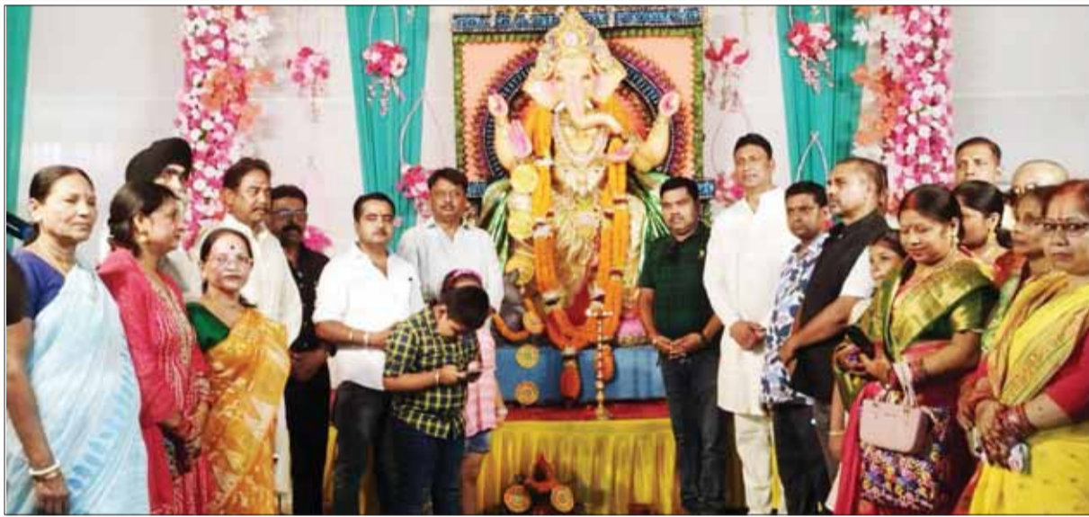
Devotees offering prayers at a community Puja pandal on the occasion of Ganesh Chaturthi festival in Ranchi on Saturday.